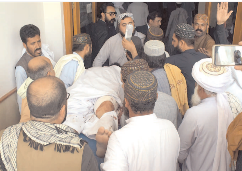
QUETTA: People shifting an injured person to hospital after blast in Mastung area.

The Assistant Special Prosecutor then requested that the arguments on the three bails be heard together. The judge said that two bails and one pre-arrest petitions would be heard separately. He asked the prosecutor if Asad has no role in the case, why he was nominated in the case. "Why is Asad Umar's bail application being opposed? Give a solid reason. There will be no compromise on the bail application," the judge said.