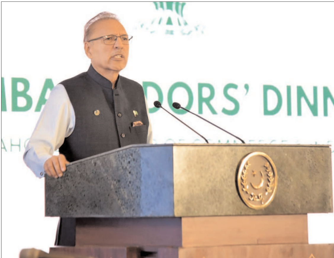
ISLAMABAD: President Dr. Arif Alvi addressing the Annual Ambassadors' Dinner, organized by Lahore Chamber of Commerce and Industry, at Aiwan-e-Sadr.