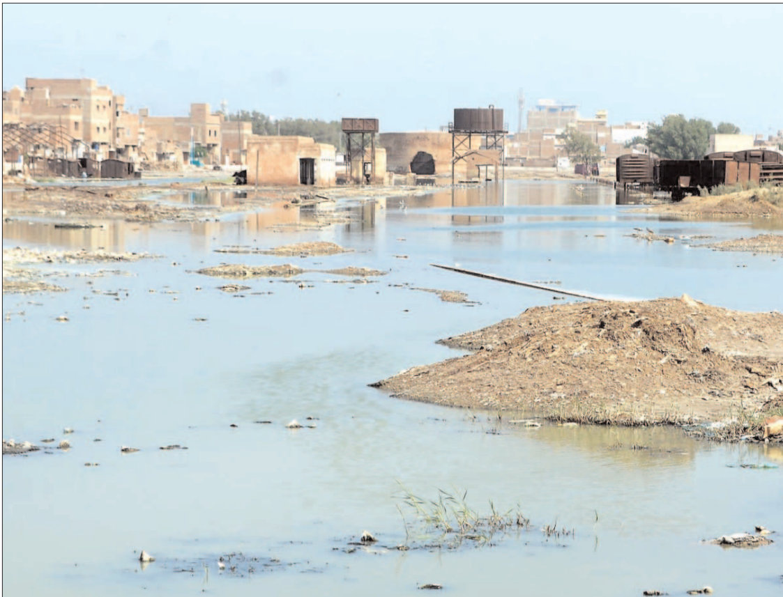
HYDERABAD: A view of sewerage water accumulated on road outside Railway workshop.

MUZAFFARABAD (INP): The Pakistan Red Crescent Society (PRCS), AJK Chapter under its Climate Advocacy & Coordination for Resilient Actions (CACRA) project and with the generous support of the German Red Cross concluded a comprehensive two-day training workshop aimed at enhancing the understanding of climate change, climate-smart disaster risk management (DRM), and small grant proposal development. The training was held here at a local hotel and was attended by fifteen volunteers of the Pakistan Red Crescent Society from five districts of Azad Jammu & Kashmir (Neelum, Jhelum, Valley, Rawalakot, Haveli and Mirpur. The training program was part of the PRCS AJK Chapter's ongoing efforts to strengthen the capacity of local communities to adapt to the challenges posed by climate change and to build resilience against natural disasters.