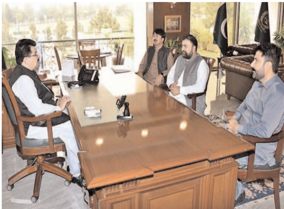
ISLAMABAD: Interim Interior Minister, Sarfraz Bugti called on Chairman Senate, Muhammad Sadiq Sanjrani at Parliament House.

In response, Chairman Senate lauded the efforts of Senator Bugti in addressing the critical issues related to law and order. He expressed his utmost confidence in the abilities of the Caretaker Interior Minister to effectively manage and oversee the security situation in the country.