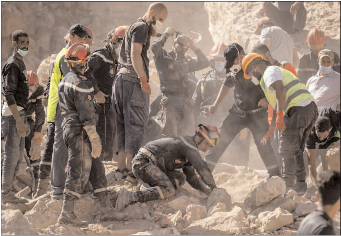
MOROCCO: Rescue searching through the rubble of an earthquake-damaged house in Imi N'Tala village near Amizmiz.