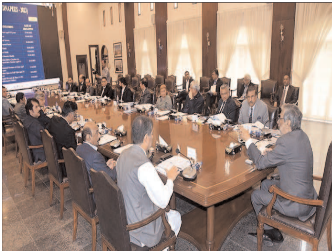
KARACHI: Sindh Caretaker Chief Minister Justice (Retd) Maqbool Baqar presides over a cabinet meeting at CM House.

The seminar was attended by a diverse group of individuals, including academics, retired Armed Forces officers, policymakers, researchers, and media professionals; and concluded with an interactive Q&A session.