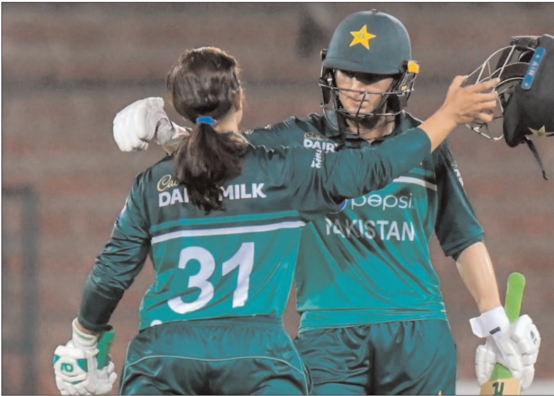
KARACHI: Sidra Ameen and Bismah Maroof added 110 for the second wicket, South Africa vs Pakistan Women, 3rd Women's ODI.

LOS ANGELES (AFP): Anastasia Potapova stunned top-seeded Tunisian Ons Jabeur 6-4, 7-6 (7/4) to reach the quarter-finals of the WTA San Diego Open on Wednesday. Potapova, ranked 27th in the world, said patience was the key against the world number seven, who reached her third Grand Slam final at Wimbledon this year. "Ons is very tough to play," said Potapova, who had edged Alicia Parks in three sets in the first round as Jabeur enjoyed a first-round bye. "She is truly one of the best in the world and with her style it's very uncomfortable. I'm really happy and proud to get this win." Jabeur was coming off a fourth-round showing at the US Open, where she battled illness in the opening rounds. Potapova notched her sixth career victory over a top-10 player and lined up a quarter-final meeting with 2020 Australian Open champion Sofia Kenin, a 1-6, 6-4, 6-2 winner over fellow American Katie Volynets. Potapova converted six of her 11 break chances, breaking the Tunisian at love to seal the opening set. Jabeur served for the second set at 6-5 but was broken. Potapova racing to a 4-0 lead in the tiebreaker before Jabeur bore down to knot it at 4-4. Jabeur's ninth double fault of the match gave Potapova a double match point, and Jabeur fired wide with a forehand to end it. Second-seeded Caroline Garcia of France was due to open her campaign later Wednesday in a challenging second-round meeting with Sloane Stephens.