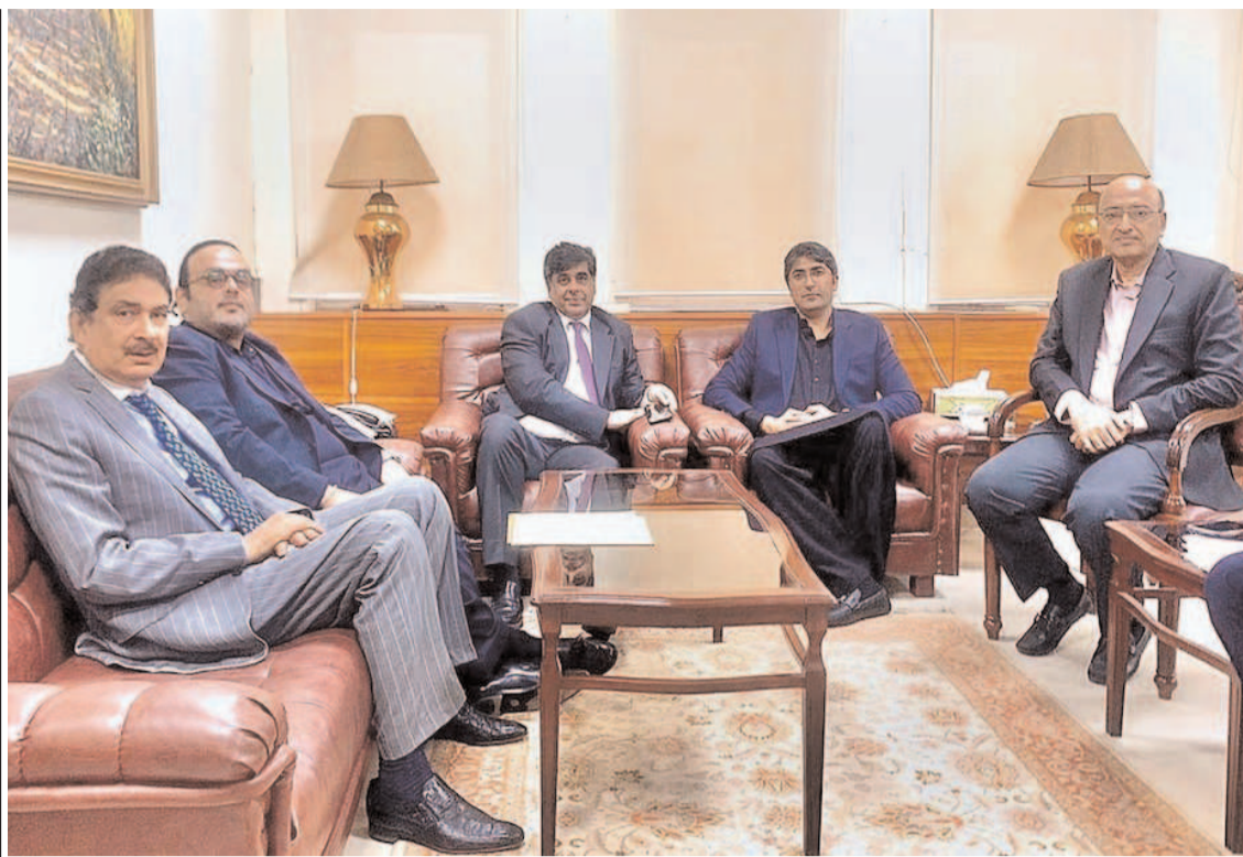
ISLAMABAD: A delegation of prominent businessmen from Lahore and Karachi meeting with Caretaker Federal Minister for Commerce Dr. Gohar Ijaz.