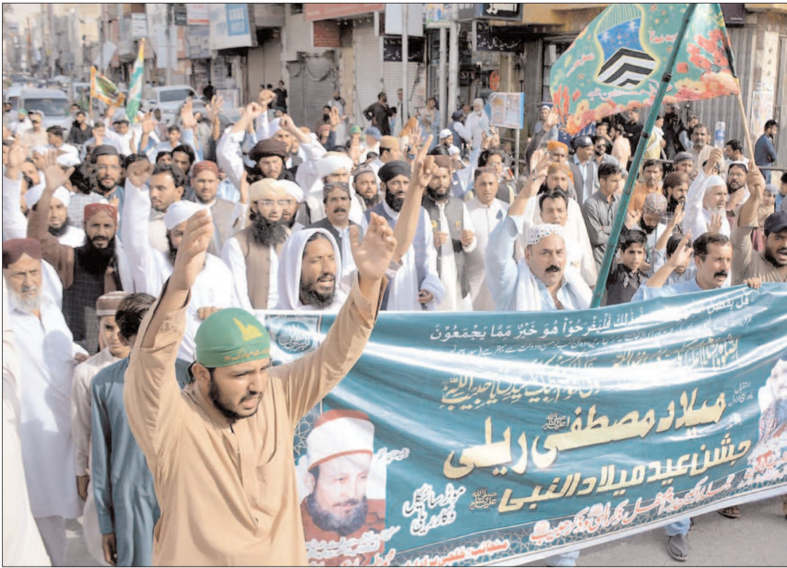
QUETTA: People holding a rally in connection with Jashne Eid Milad-un-Nabi.