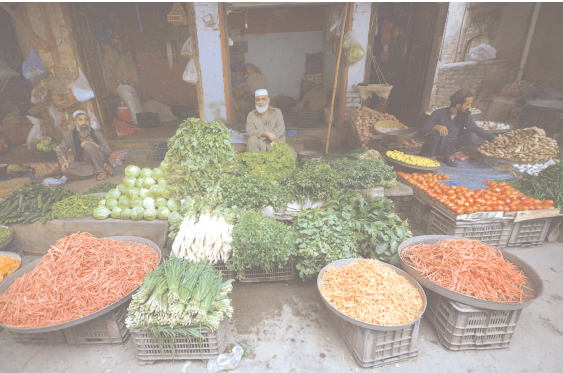
PESHAWAR: A vendor waiting for cutomers while selling vegetabels in Pipal Mandi.

for those with other calorie needs. As with all meal plans, this is meant to be a framework for a nutritious eating routine. If there's a swap you'd prefer, or you grab dinner with a friend one evening, don't fret. The idea is to start cooking more meals at home and eating regular meals and snacks with plenty of protein, fiber, fruits and vegetables. Perfection is not required to reap the benefits of this eating plan. Foods to Focus On Vegetables Fruit, such as berries, pears, apples and more Whole grains (brown rice, quinoa, freekeh, whole-wheat, bulgur, oats and more) Lean protein Eggs Fermented dairy (yogurt, kefir) Fish Healthy fats (like olive oil and avocados) Nuts and seeds, including natural nut butters (with no added sugar) How to Meal-Prep Your Week of Meals Make Chopped Salad with Chickpeas, Olives & Feta to have for lunch on days 2 through 5.