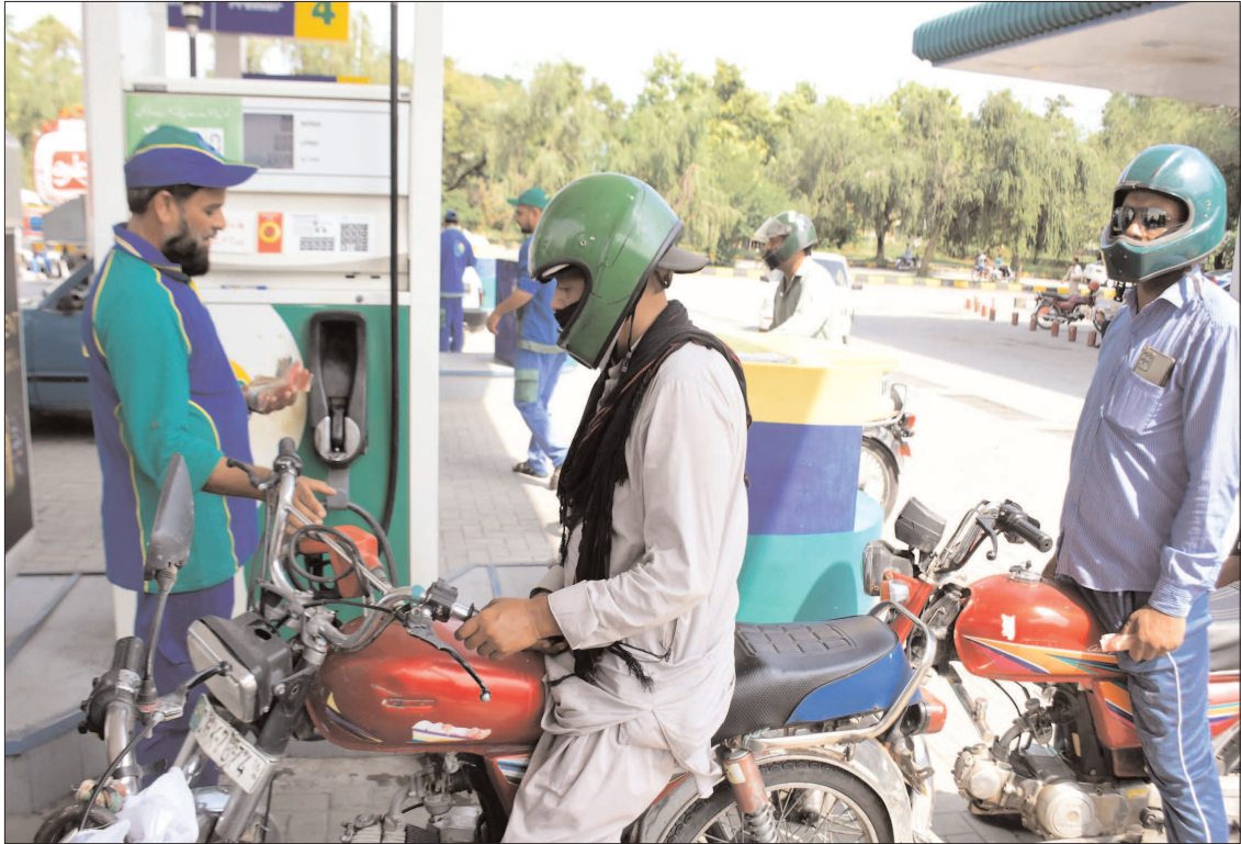
ISLAMABAD: Motorists filling the tanks as the fuel prices are on its peak comparing to the 76th years of the history of country.