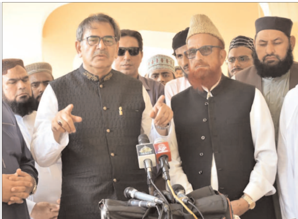
KARACHI: Caretaker Federal Minister for Religious Affairs and Interfaith Harmony Aneeq Ahmed talking to media persons after meeting with the Mufti Muneeb ur Rehman and Ulama at Jamia-e-Naimia.

Chief Secretary, Senior Member Board of Revenue, Chairman Planning and Development (P&D), secretaries forest, finance, communication and works, P&D, Director General Wildlife and other officials attended the meeting.