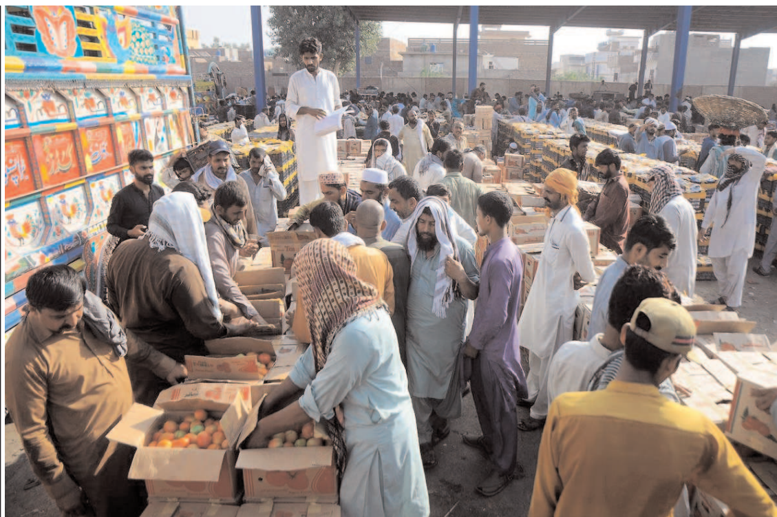
MULTAN: Vendors displaying tomatoes boxes during an auction while shopkeepers participate in bidding at vegetable market.

primary deficit, with latter recording a primary deficit of Rs1.1 trillion. The budget deficit in last quarter of FY2023 surged to nearly 112 percent of the cumulative figures from July 2022 to March 2023. Pakistan's budget deficit for the initial nine months amounted to approximately Rs3 trillion, but in Q4 FY23 alone, it registered a substantial increase of Rs3.4 trillion. It's worth noting that in the latest budget documents released in June 2023, revised estimate for primary deficit in FY23 was Rs421 billion. However, according to the Ministry of Finance's recent update, there was a primary balance overrun of Rs690 billion, marking an increase of Rs269 billion, which is 64 percent higher than the revised estimates for FY2023 shared earlier in June of the same year. Contrastingly, according to the budget document from the previous year, a surplus of Rs153 billion was projected. This highlights the inadequacies in financial planning at ministerial level. PBF President Multan further told many countries are implementing privatisation policies for SOEs, Pakistan remains in debate over the issue without officially announcing any plans for disinvesting in such entities; he added.