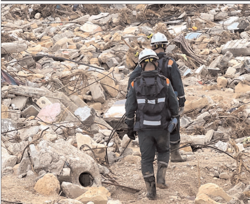
TRIPOLI: Rescue workers busy in relief work after powerful earthquake in Derna city of Libya.