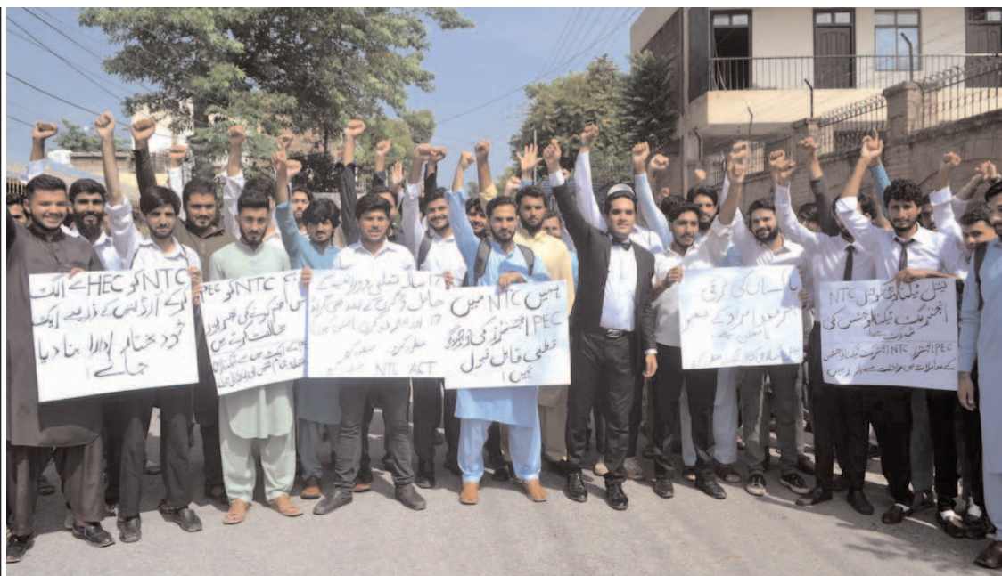
PESHAWAR: Members of Association Engineering & Technology chanting slogans during a protest in favour of their demands.

According to Police the raid was conducted on a tip-off in the Nothiya area and recovered 82 pistols, 57 twelve-bore rifles and thousands of cartridges of various bores.