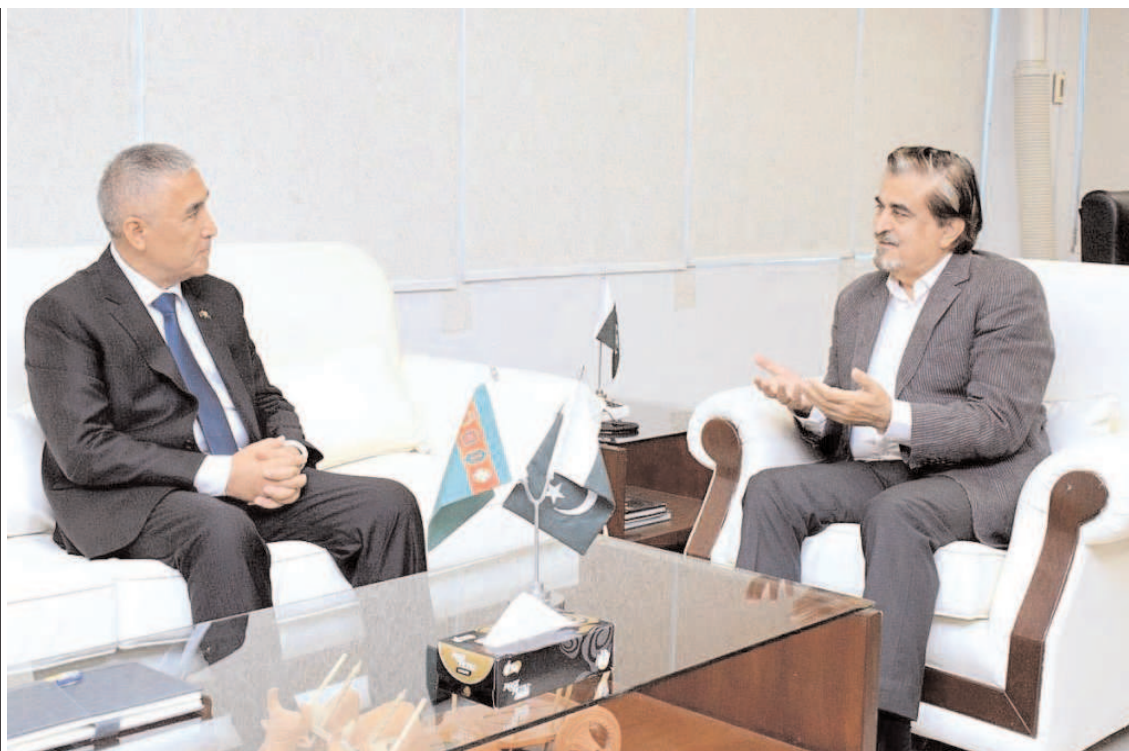
ISLAMABAD: Ambassador of Turkmenistan H.E. Atadjan Movlamov called on Interim Federal Minister for National Heritage and Culture Jamal Shah.

Islamabad Capital City Police officer (ICCPPO) Dr. Akbar Nasir Khan directed all senior officials for effective crackdown against the accused involved in criminal activities and to ensure the safety of lives and property of citizens on priority basis.