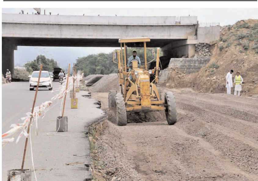
ISLAMABAD: Heavy machinery being used for construction work of Margalla Road during development work in Federal Capital.

The conference aims to bring together renowned religious scholars, both national and international, to bridge intellectual gaps and promote understanding among scholars.