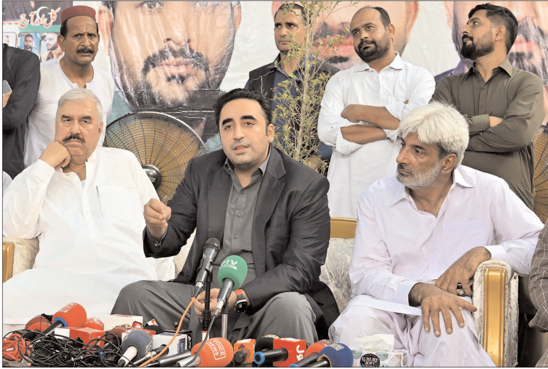
OKARA: Chairman Peoples Party Pakistan Bilawal Bhutto Zardari talking to media persons after visiting the party workers house.

hoarding, and electricity theft," he noted."Investments through the Special Investment Facilitation Council will stabilize the economy and let the government to pass on relief to the masses," the minister remarked. He said the caretaker government would hand over the economy to the next government in an improved shape.The minister said the people had the right to decide whom they elect as their representative."Let us restore the nation's trust and lead the country towards political and economic stability," he remarked. "The government, people, and armed forces are fully capable to defend Pakistan," he added.