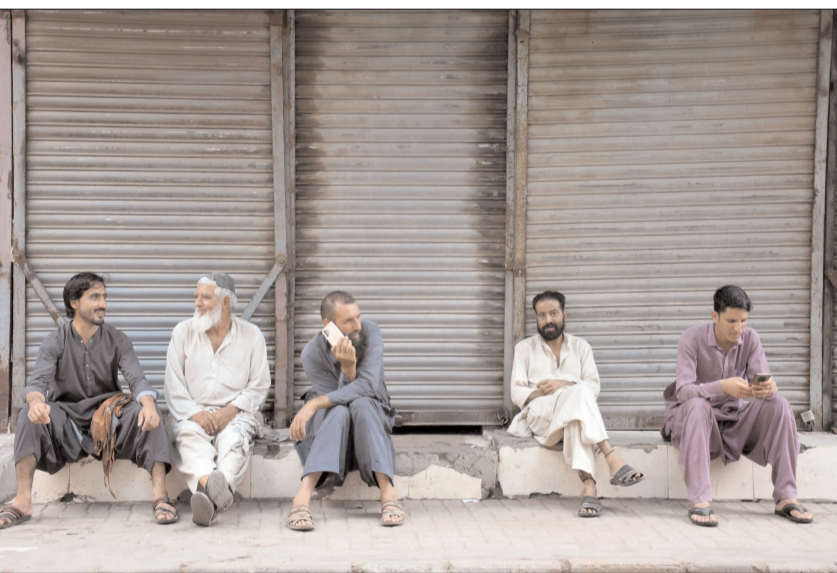
KARACHI: A view of closed shops during traders shutter down strike against the inflated electricity bills.

Climate change has fuelled searing temperatures across the globe already this year, with July being the hottest month ever recorded on Earth. Scientists have long warned that climate change produces heatwaves that are hotter, longer and more frequent.