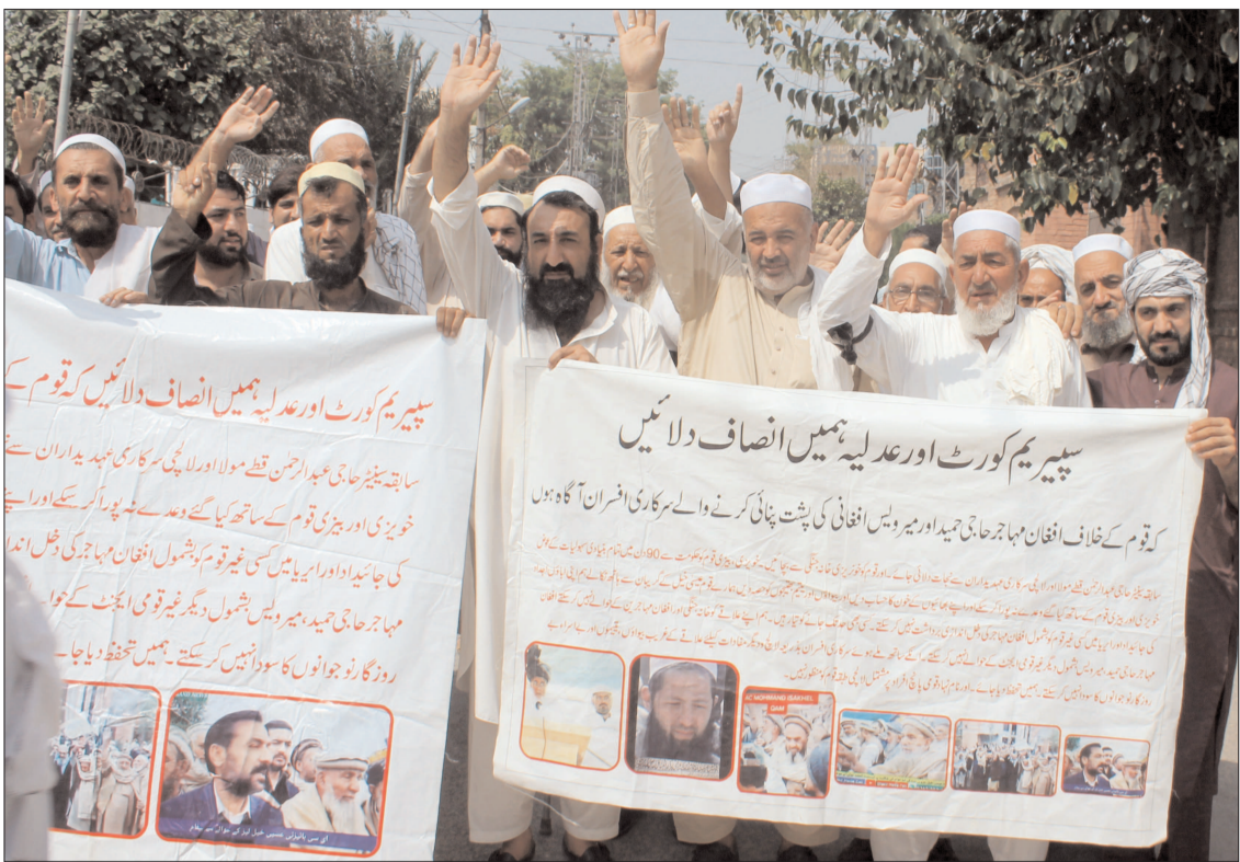
PESHAWAR: Elders of Jarhobi Dara Essa Khel holding a protest for acceptance of their demands.