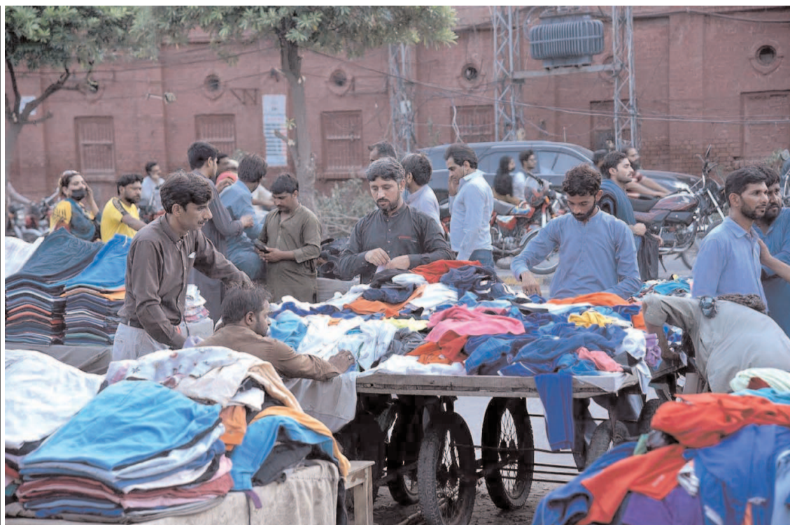
LAHORE: People looking to buy second hand clothes from a cart on the roadside.

The cargo throughput of 141,584 tonnes, comprising 84,508 tonnes of imports Cargo and 57,076 tonnes of export cargo, including containerized cargo carried in 2,293 Containers (690 TEUs Imports and 1,603 TEUs export) was handled at the Port during the last 24 hours. There are seven ships at Outer Anchorage of Port Qasim, out of them a bulk carrier Mari Blue and container ship SSL Mumbai carrying Coal and Containers are expected to take berths at Bulk Terminal and Container Terminal respectively on today Friday, while three more container ships, Anbien Bay, Maersk Phuket and CMA CGM Figaro are due to arrive at Port Qasim on Saturday & another containers ship, MSC Denise is due to arrive on Sunday.