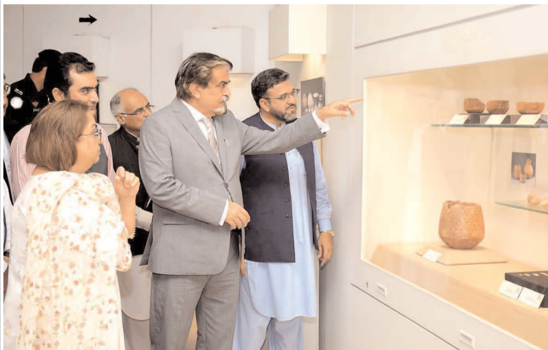
ISLAMABAD: Federal Minister for National Heritage and Culture Jamal Shah taking round of Islamabad Museum during inaugural ceremony of week-long cultural activities.

Following these directions, the Sumbal police team used technical and human resources and succeeded in apprehending two wanted members of a criminal gang involved in numerous attempted murder, snatching and bike theft activities in various areas of the twin city. The accused were identified as Zubair Khan and Sahil Khan. Police team also recovered weapons with ammunition used in crime from their possession.