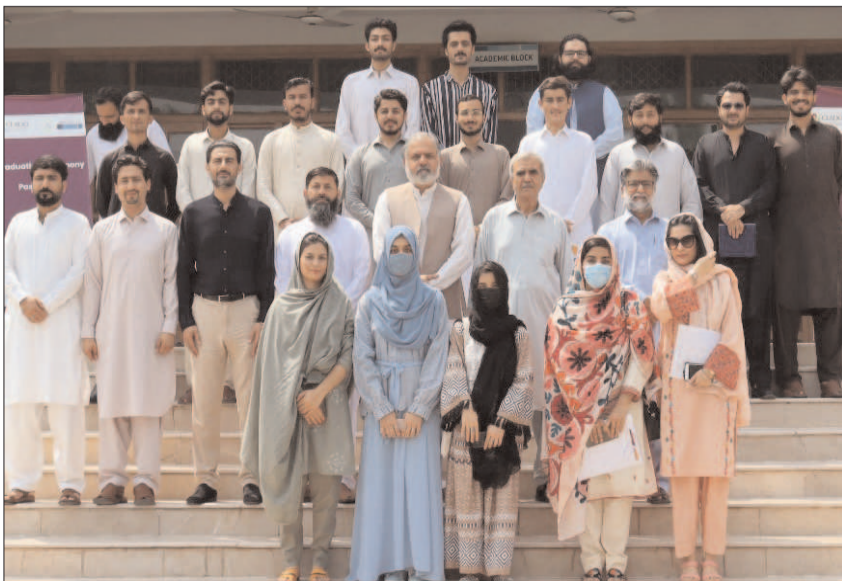
PESHAWAR: Participants of Pashto course in a group photo after course.