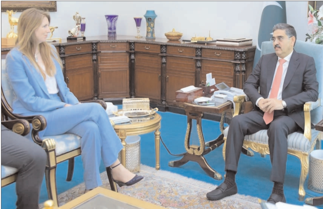
ISLAMABAD: British High Commissioner Ms. Jane Marriott called on Caretaker Prime Minister Anwaar-ul-Haq Kakar.

Vol. XXXIX No. 224 Regd. No. 241 SAFAR 14 1445 -- SATURDAY, SEPTEMBER 02 2023 PESHAWAR EDITION 12 PAGES PRICE. 30