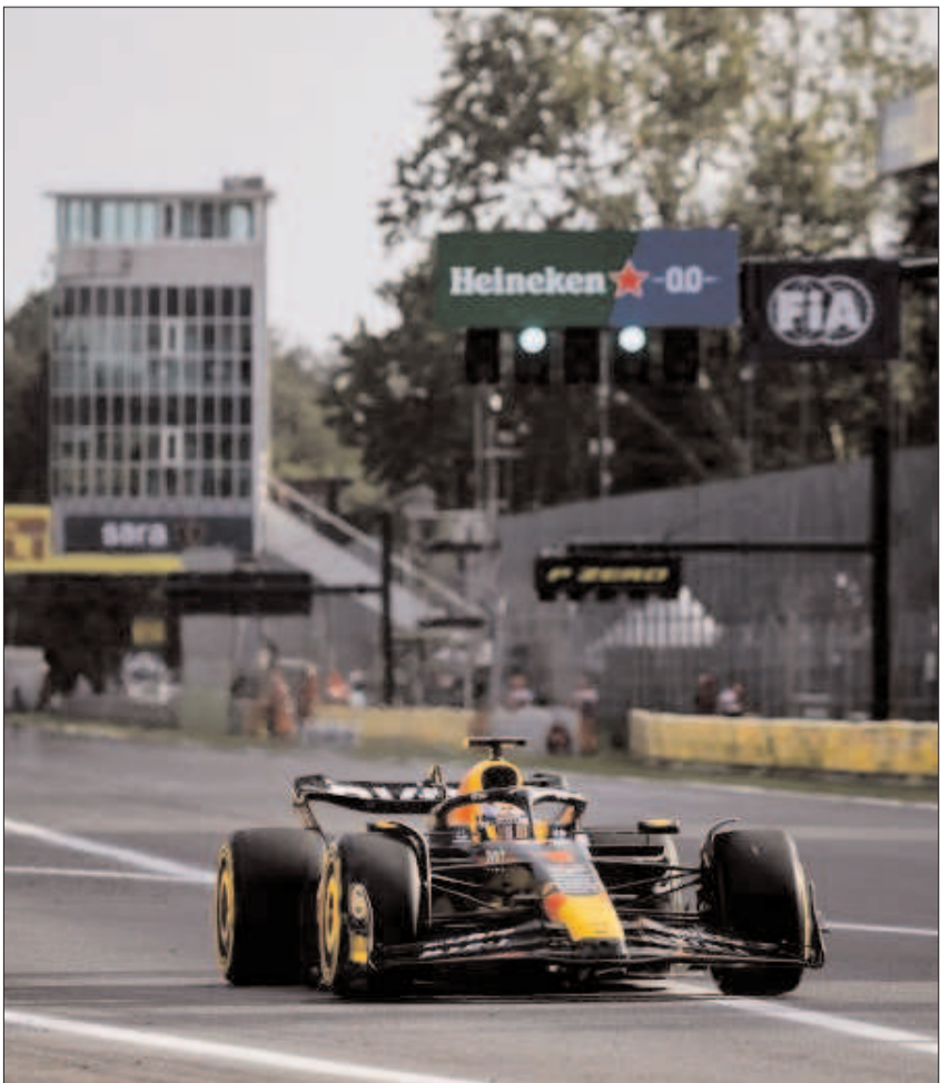
MONZA: Max Verstappen (Red Bull Racing) during the 2nd free practice session on the Monza circuit in the run-up to the Italian Grand Prix.

Lineup Fakhar Zaman, Imam-ul-Haq, Babar Azam (c), Mohammad Rizwan, Salman Agha, Iftikhar Ahmed, Shadab Khan (vc), Mohammad Nawaz, Shaheen Shah Afridi, Haris Rauf, Naseem Shah.