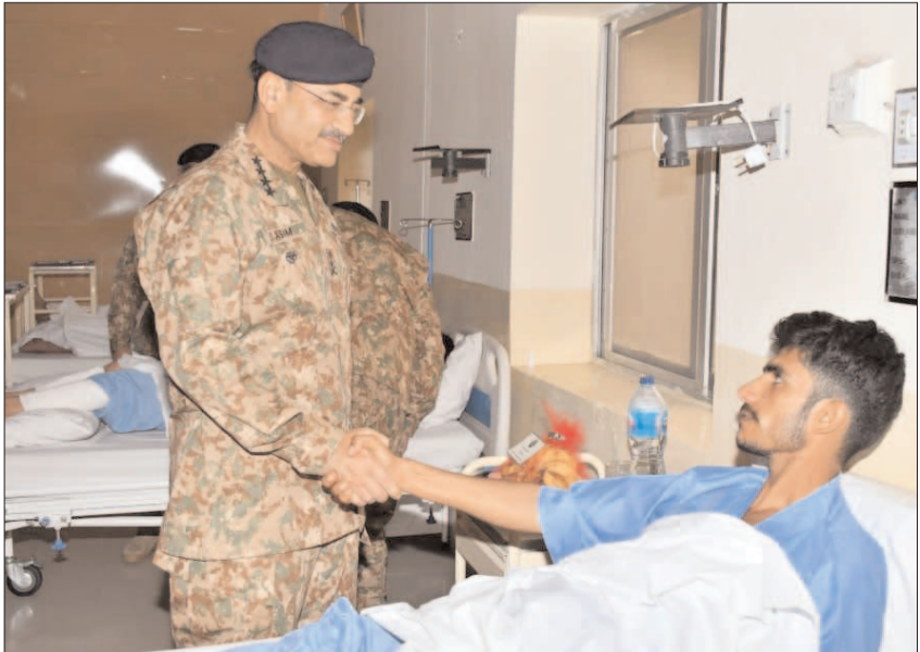
BANNU: Chief of Army Staff, General Syed Asim Munir inquiring about the health and well-being of the injured soldiers at CMH.

The minister, in a post on X, formerly Twitter, said Sartaj-ul-Shua'ra Shah Latif - a people's poet and pious person - was born on the soil of Sindh, whose message of "promoting love, humanity and struggle" was for all the world nations.