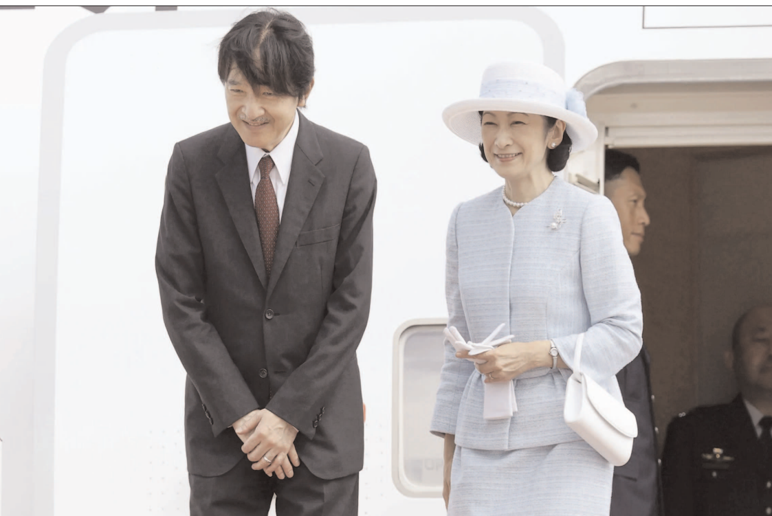
TOKYO: Japanese Crown Prince Akishino and Crown Princess Kiko prepares to leave Haneda airport. Akishino, the younger brother of Emperor Naruhito, is on his way to Vietnam to mark the 50th anniversary of diplomatic relations between the two countries.