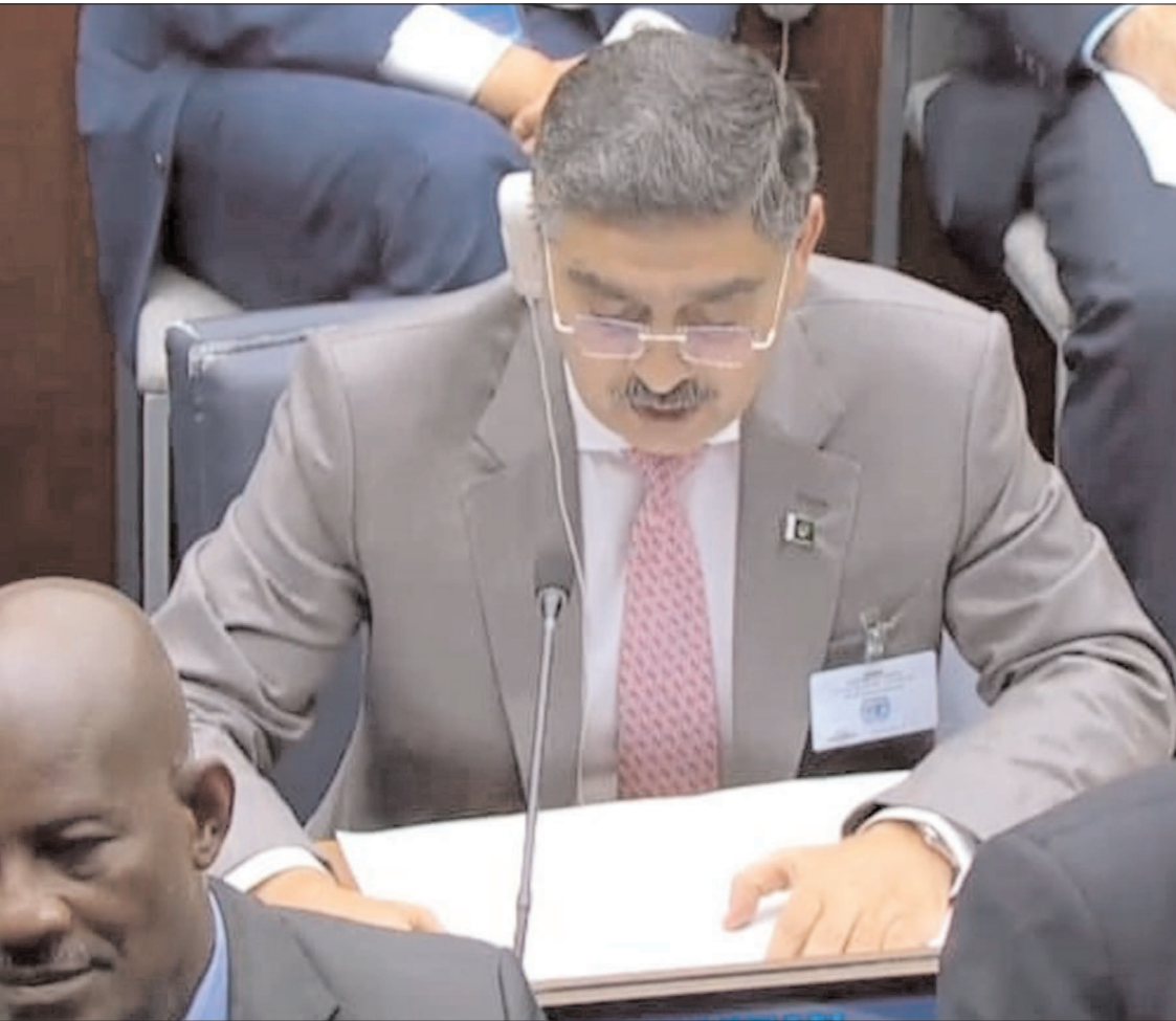
NEW YORK: Caretaker Prime Minister Anwaar-ul-Haq Kakar addressing the 'Climate Ambition Summit 2023' held on the sidelines of 78th session of UN General Assembly.

Citing Quranic verses, the prime minister told the world leaders that Islam promoted responsibility to protect the environment and utilise natural resources efficiently and undertake an equitable approach to nature. Urging the global community to come up with climate actions and support to the developing countries, the prime minister said, "This will be a litmus test of solidarity and perhaps for the survival of our species on our injured planet."