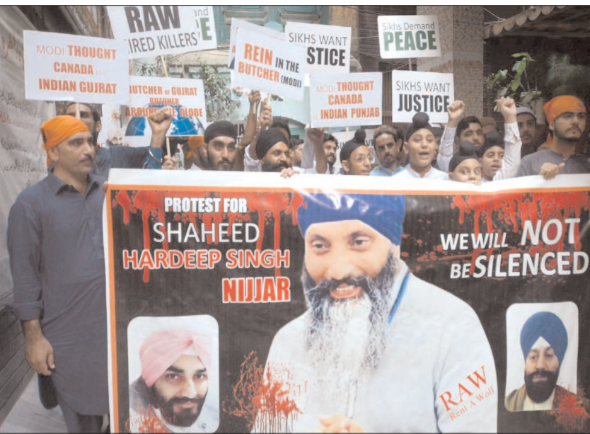
PESHAWAR: Sikh community members holding a protest rally in favour of Hardeep Singh, who was killed by Indian Agency RAW in Canada.