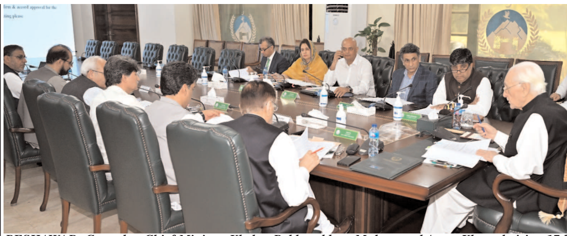
PESHAWAR: Caretaker Chief Minister Khyber Pakhtunkhwa Muhammad Azam Khan chairing 17th Board meeting of Hydrel Development Fund.

payment of pension arrears and added that it would reduce pension burden on varsities and also help providing financial help to employees after retirement. Later KP governor met with delegation of various areas including Mathra, Abbottabad, Ghalanai and business community. Governor listened to their problems and assured his cooperation and conveying their concerns to relative quarters.