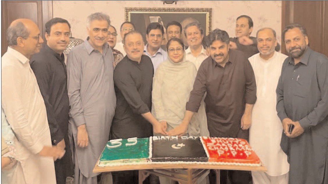
KARACHI: PPP leaders cutting the cake during 35th birthday of Chairman Bilawal Bhutto Zardari.