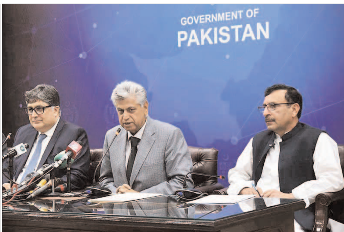
ISLAMABAD: Caretaker Federal Minister for Information and Broadcasting Murtaza Solangi and caretaker Federal Minister for Privatisation, Fawad Hasan Fawad addressing a press conference.

The Chief of Capital Police also highlighted the