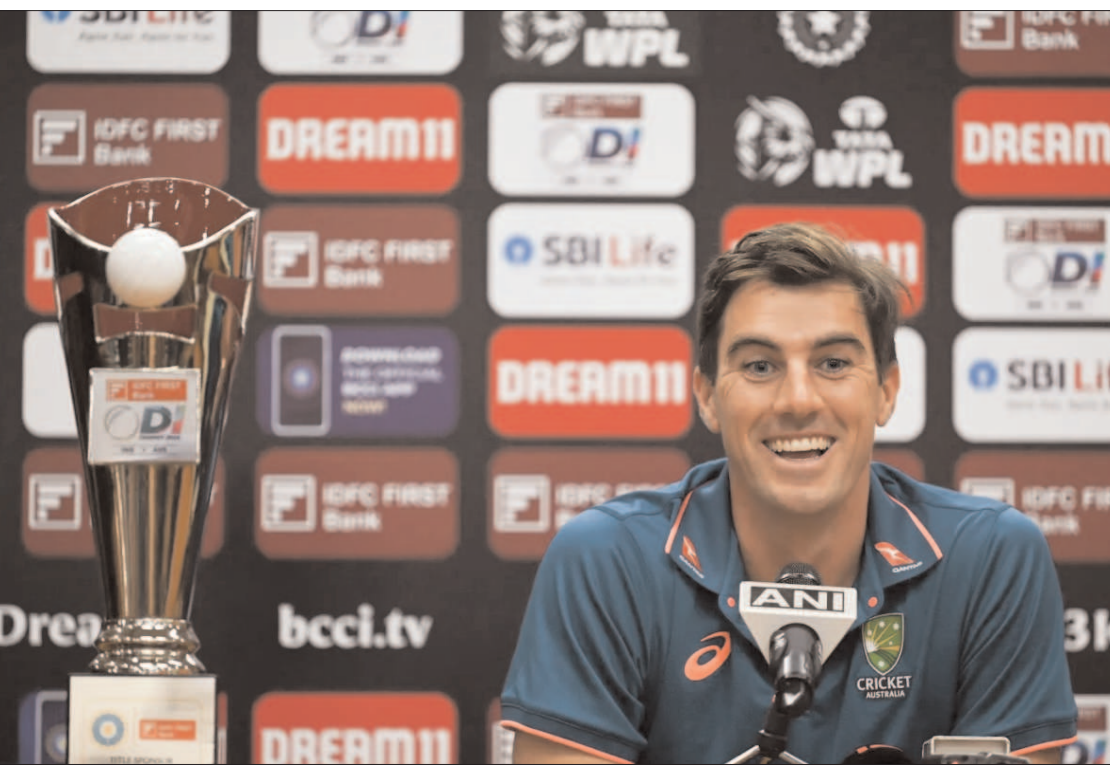
MOHALI: Pat Cummins is all smiles addressing the media in Mohali.

HANGZHOU (Agencies): India and Pakistan have advanced to the Asian Games semi-finals in Hangzhou after their respective quarter-finals were abandoned because of rain. India's rain-hit quarter-final against Malaysia was reduced to 15-overs-a-side in which they amassed 173 for 2 riding largely on a 39-ball 67 from Shafali Verma and an unbeaten 29-ball 47 by Jemimah Rodrigues. Rain arrived just two balls into Malaysia's steep chase forcing the game to be called off. The second quarter-final