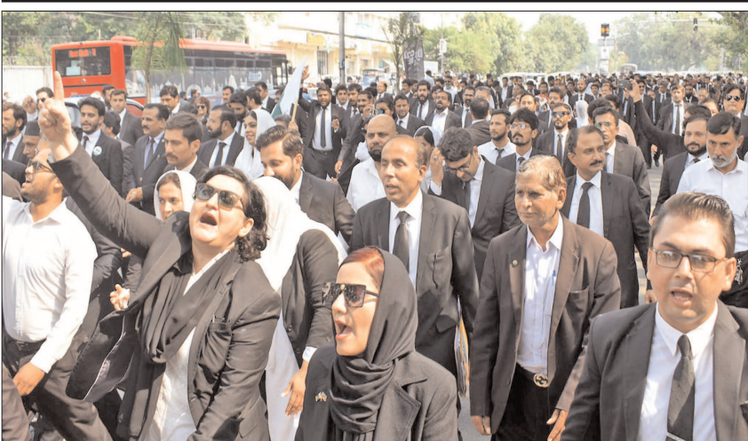
LAHORE: Lawyers holding a protest rally against inflation and implementation of rule of law in country.

The campaign will be launched in three phases across the country, say sources, adding that the first phase will be launched from September 25, second from October 2 and final phase will be kicked-off from October 9 to 13. The five-day campaign called Outbreak Response (OBR) will be held in Balochistan and Khyber Pakhtunkhwa districts.