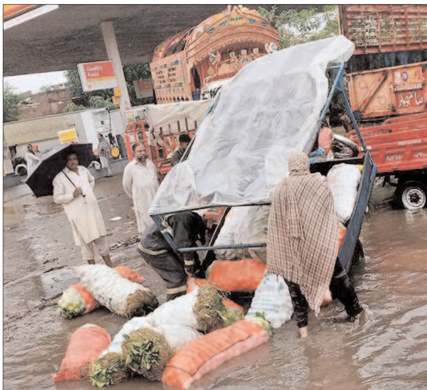
LAHORE: A loader rickshaw Turn Turtle due to overloaded during passing through the accumulated water near sabzi mandi in Lahore.