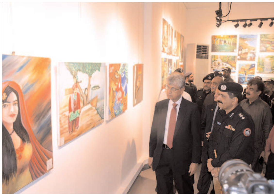
KARACHI: Caretaker Federal Minister for Information and Broadcasting Murtaza Solangi visiting Arts Council of Pakistan.

Former Prime Minister Nawaz Sharif maintained that Pakistan had been pushed to the brink of disaster through a plot that placed amateurs in power, underscoring the importance of adhering to the law in addressing the culprits behind the conspiracy.