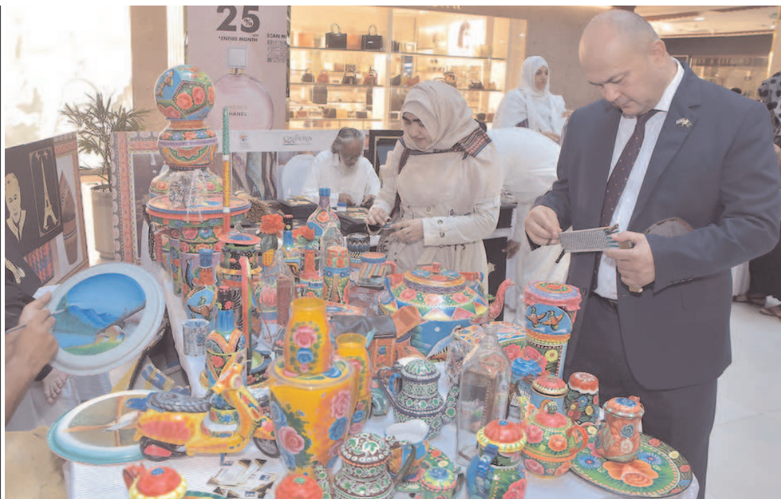
ISLAMABAD: Visitors taking interest in traditional hand made items during Handicrafts Expo organized by Handicrafts Association of Pakistan in collaboration with ICCI and Centurus Mall.