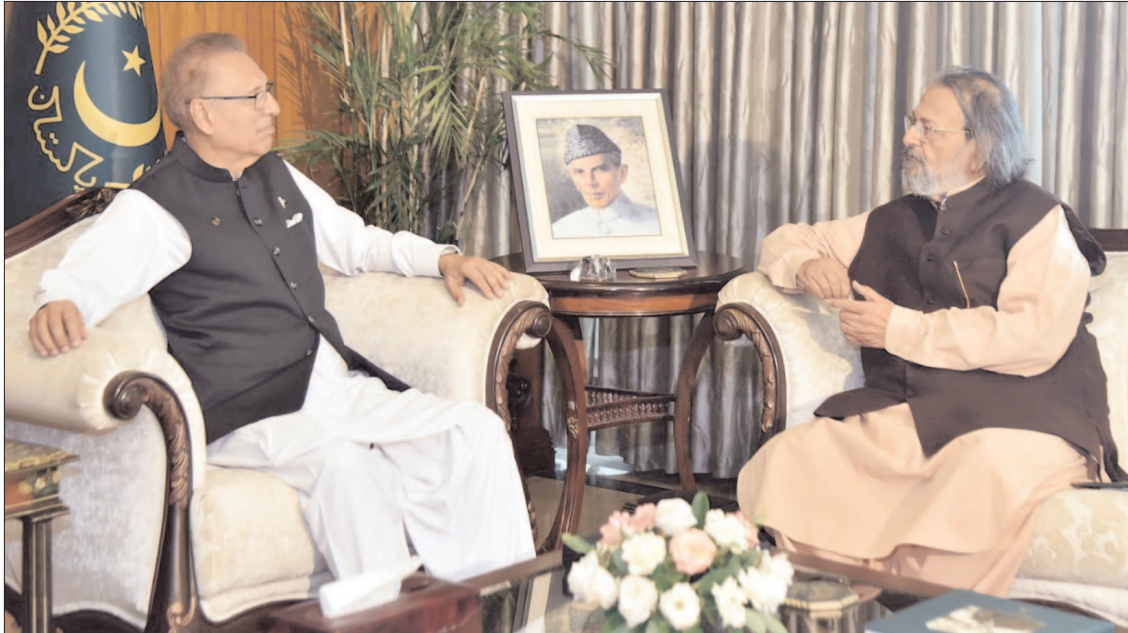
ISLAMABAD: Caretaker Minister for Federal Education and Professional Training, Madad Ali Sindhi, called on President Dr. Arif Alvi, at Aiwan-e-Sadr.