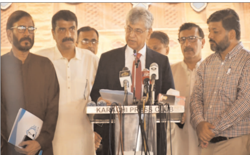
KARACHI: Caretaker Federal Minister for Information and Broadcasting Murtaza Solangi addressing a press conference at Press Club.

Representative of the Ministry of Energy during the hearing submitted that the proposed quarterly adjustment may be recovered from consumers in a period of six months in order to minimise the impact on consumers. The ministry said that the impact would be around Rs3.55 per unit instead of Rs6.20 per unit if passed on to consumers over a period of six months instead of three months.