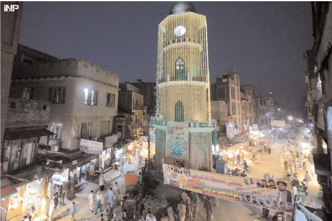
PESHAWAR: A beautiful illuminated view of lighting Ganta Gar building.