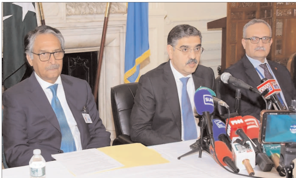
NEW YORK: Caretaker Prime Minister Anwaar-ul-Haq addressing a press conference.

The Canadian argument is definitely supported by the majority of the first world countries but at the same time this incident has raised many eye brows around the world about embassies or individuals working in embassies being hand in gloves with local gangsters and mafias. When asked about Israel and Saudi Arabia, Karine once again emphasized President Biden’s argument that with out Palestine, talks with Israel and Saudi relations will not bare any fruits.