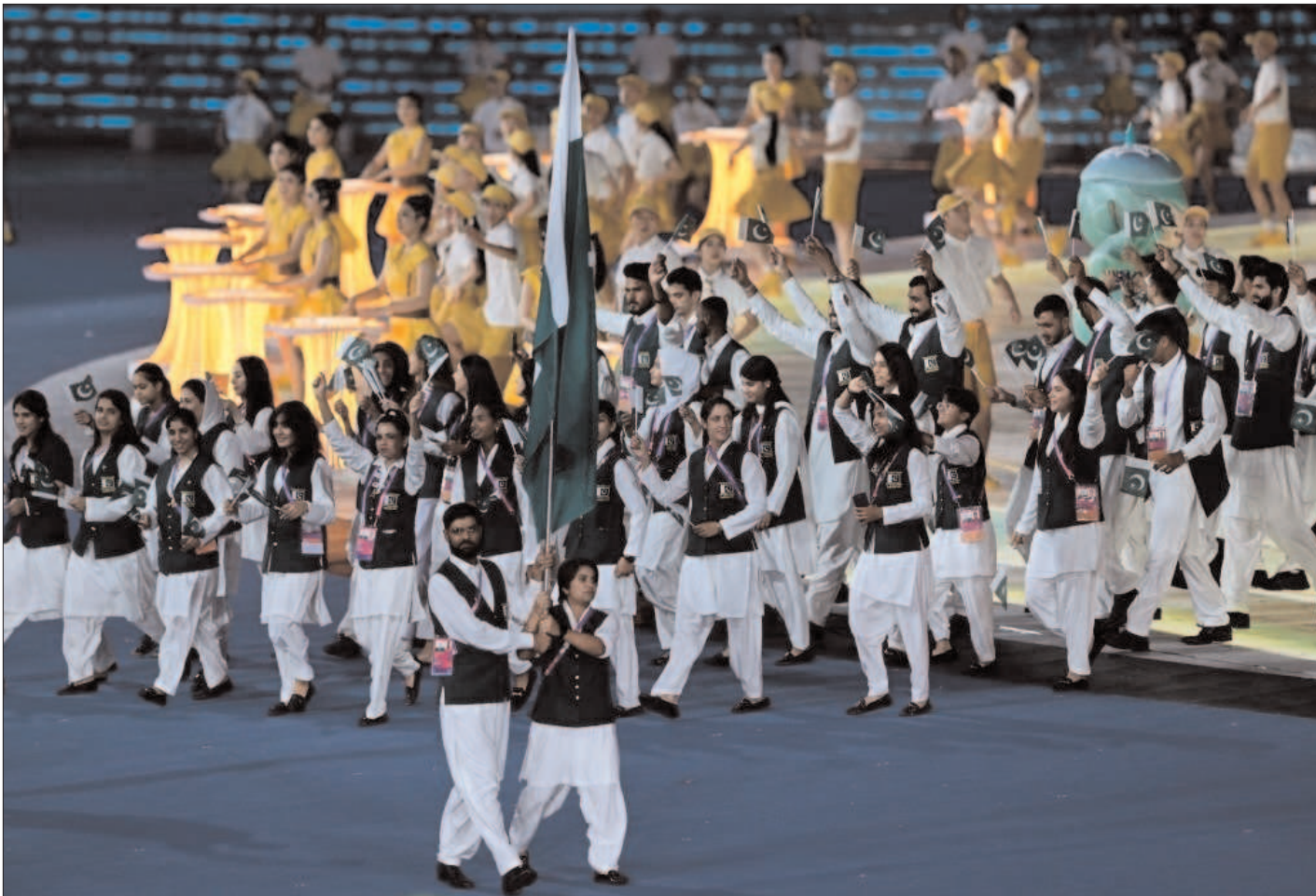
HANGZHOU: Members of Pakistan's delegation take part in the athletes parade during the opening ceremony of the 2022 Asian Games at the Hangzhou Olympic Sports Centre Stadium.

LONDON (Reuters): Swiss maestro Roger Federer said he had missed everything about tennis following his retirement last year and vowed to not be a stranger to the tour despite his off-court commitments and the challenge of parenting two sets of twins. Speaking after the first day at the Laver Cup in Vancouver on Friday, the 20-time Grand Slam champion described his life as "intense" and "beautiful" following his farewell match in last year's edition of the team event in London but said he was delighted to be back in front of fans. "In a way, I miss everything about the game, the exciting moments spent on court, break points saved, winning match points, holding up trophies, walking past the fans, taking selfies," Federer said. "It's been beautiful to be home more, spending time with my