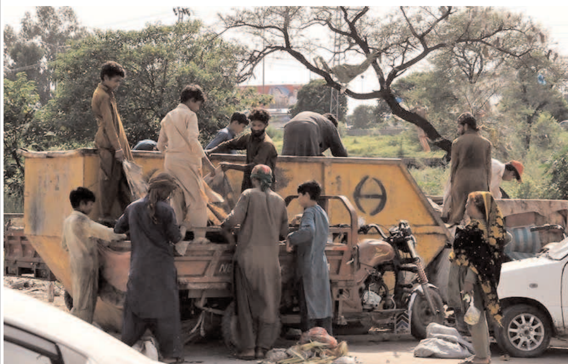
ISLAMABAD: Gypsy people searching valuables from garbage near Khanna pul in the Federal Capital.

He said the DG RDA has directed the MP&TE Directorate to take strict actions against illegal / unauthorized housing schemes, their development, construction of booking and site offices and encroachments without any fear or favour.