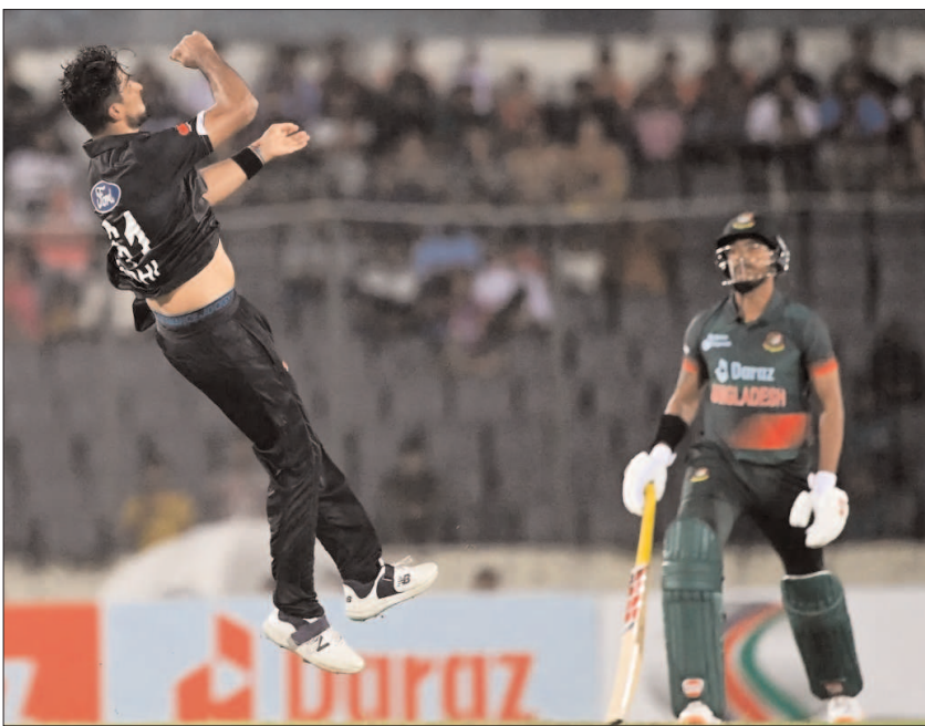
MIRPUR: Ish Sodhi is jubilant after dismissing Soumya Sarkar in a caught and bowled.