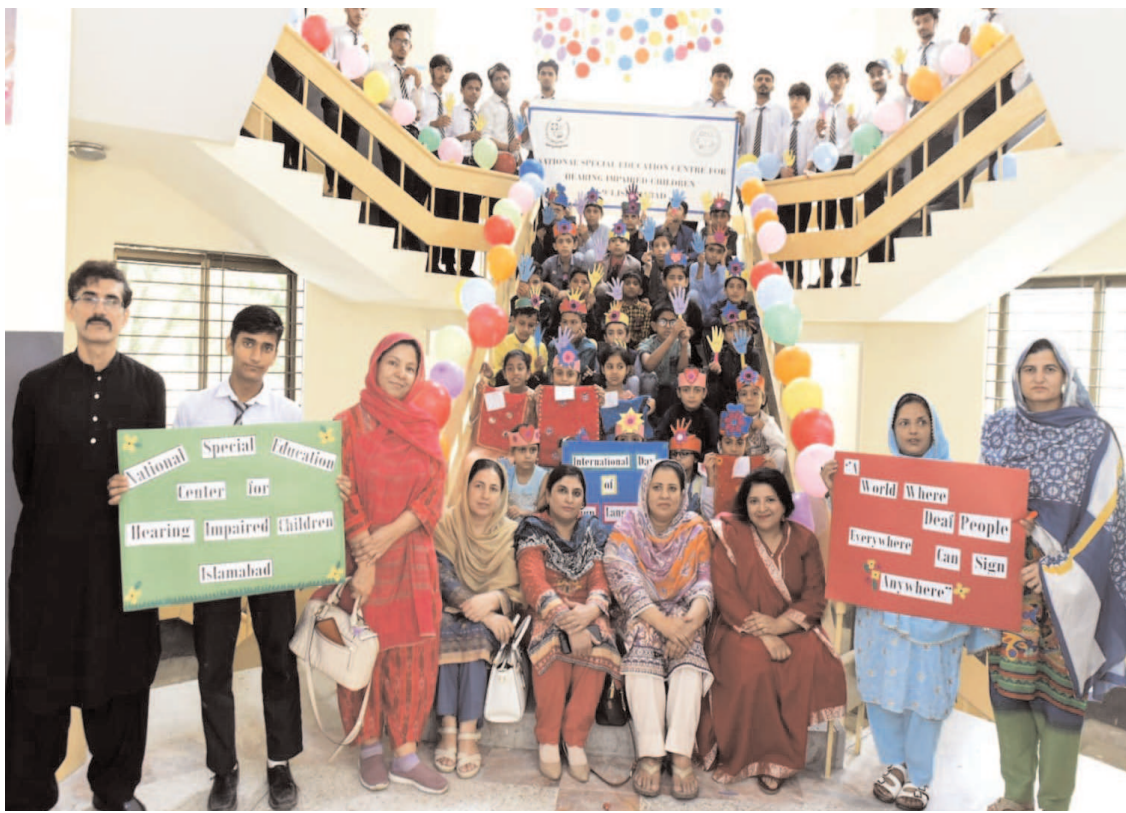
ISLAMABAD: Special Kids pose for group photo in a ceremony held at National Special Education Centre H/9 in connection with International Day of Sign Languages on Saturday.