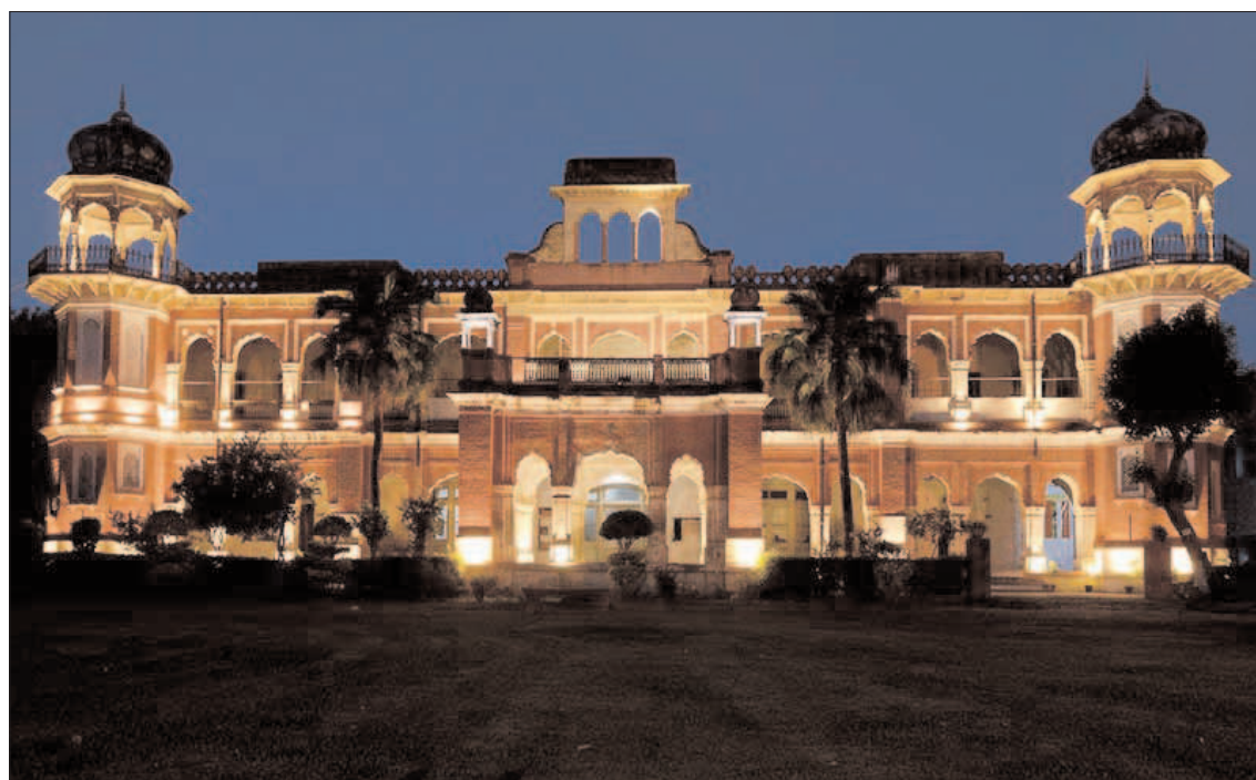
LAHORE: An illuminated view of Justice Sir Shadi Lal building Chief Justice Lahore High Court (1920-34) near Jain Mandir.

Unregistered employees and tenants could be involved in serious incidents like theft and robbery by impersonating as a common citizen and Islamabad Capital Police is trying to provide a safe environment to the citizens of the federal capital by using all its resources.