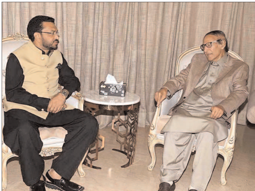
LAHORE: Mr. Khalil George, Federal Minister for Human Rights meets with Ch Shujaat Hussain at his residence in Gulberg.

He said the Saudi government had been thinking about the option of including Karachi and Lahore in the Road-to-Makkah project. The Saudi Haj and Umrah Minister informed the Pakistani delegation that the Road-to-Makkah project was gradually being expanded. He said that he had recently visited Pakistan to finalise Haj arrangements beforehand.