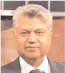
Murtaza Solangi Caretaker Minister of Information & Broadcasting

I deeply appreciate the remarkable initiative of the All Pakistan Newspaper Society to celebrate 25 September as the National Newspaper Readership day.