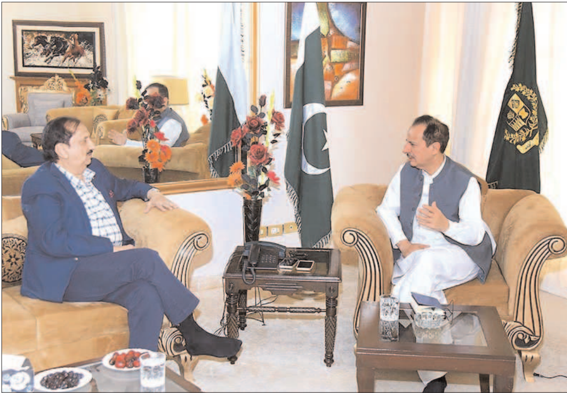
ISLAMABAD: Federal caretaker Health Minister Dr. Nadeem Jan and Provincial caretaker Primary and Secondary Healthcare Minister Dr. Jamal Nasir meeting today.

RAWALPINDI (APP) : As many as 23,938 persons have been screened for Hepatitis B and C so far during the second phase of the Local Hepatitis Elimination and Prevention (LHEAP) drive started on July 10. According to the District Health Authority spokesman, the LHEAP was underway in four Union Councils (UCs)-10,11,14 and 15 of the city while 117 people diagnosed with HBV