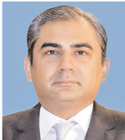
Mohsin Naqvi Caretaker Chief Minister of Punjab

On behalf of the Ministry of Information & Broadcasting, I appreciate the efforts of the APNS for observing the National Newspaper Readership Day in acquainting the nation with the significance of newspaper reading. There is no gainsaying that the newspapers are a source of reliable and authentic information in an era of massive proliferation of fake news and it is encouraging to see that the newspapers have upheld their authenticity, credibility, and reliability, despite the advent of digital media. Moreover, the newspapers also helped in effectively putting Pakistan's stance across the globe. Lastly, I reiterate the Government's resolve to promote freedom of expression and urge the print media fraternity to join hands with the Government to develop an educated and enlightened nation.