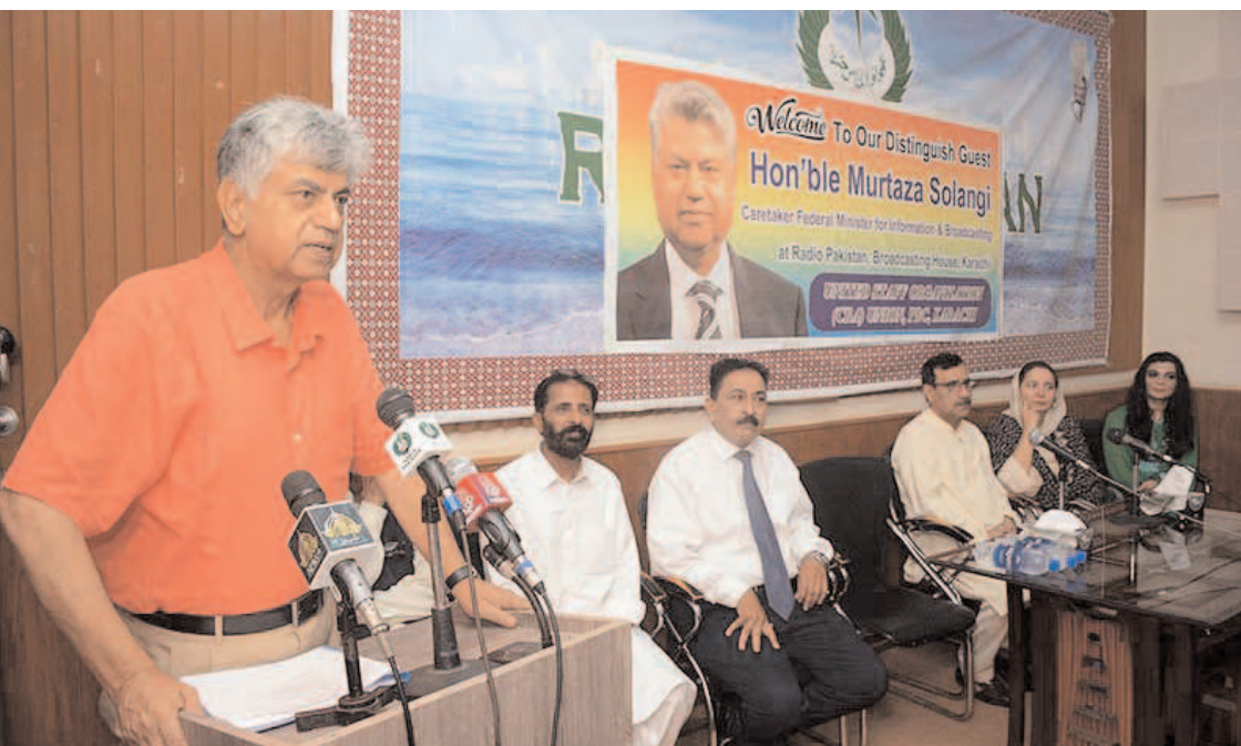
KARACHI: Caretaker Minister for Information and Broadcasting Murtaza Solangi addressing a ceremony held in his honor at Radio Pakistan Broadcasting House.

The Minister formally inaugurated the Centralized Gateway Portal, a unique financial initiative that simultaneously onboard investors and customers in the securities market, the NBFC sector, and the insurance industry.