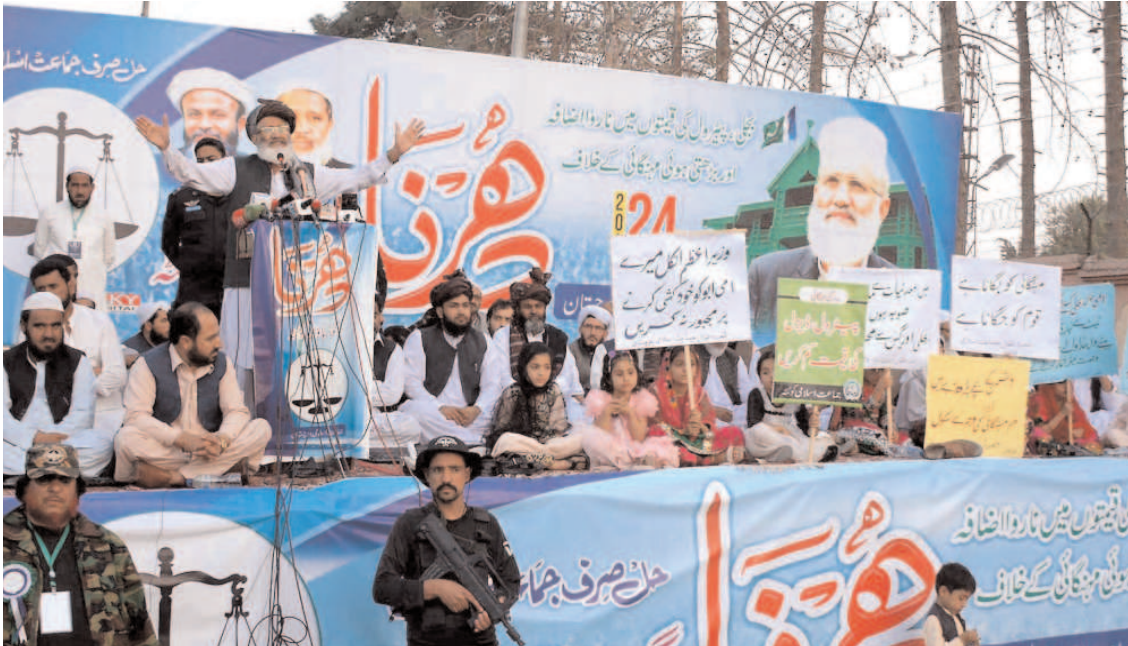
QUETTA: Ameer Jamaat-e-Islami Siraj-ul-Haq addressing a protest gathering in front of Governor House against increase in electricity and petrol prices.