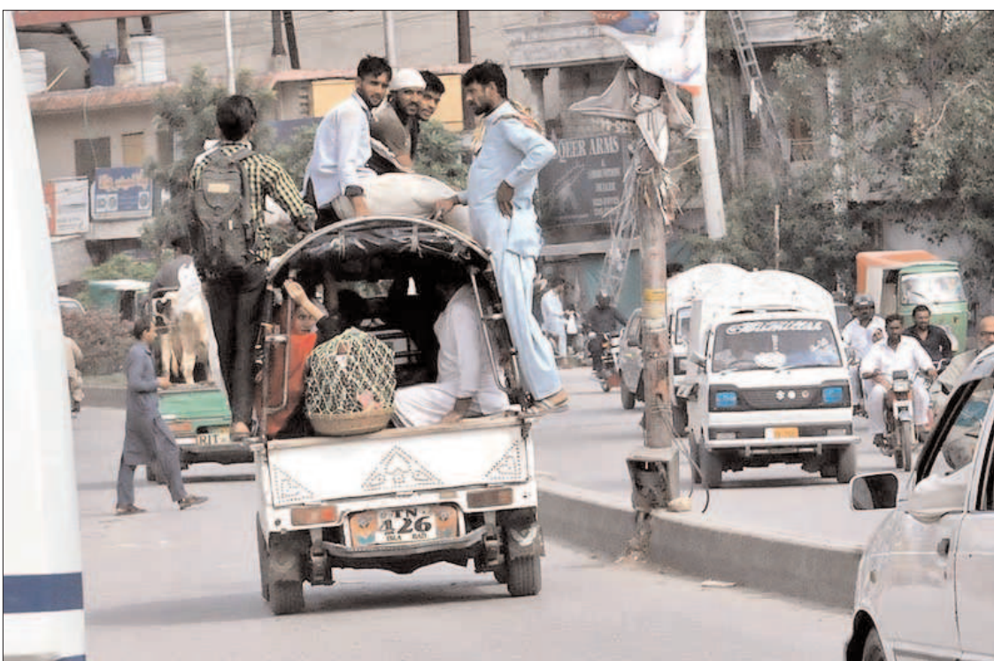
ISLAMABAD: People sitting and hanging on the roof top of Pick up van in a dangerous way may cause any mishap and need attention of concerned authorities.