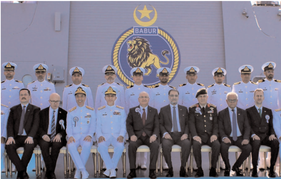
Istanbul: Minister of National Defence Türkiye, Defence Minister of Pakistan Lt. Gen. (Retd) Anwar Ali Hyder and Chief of Naval Staff Admiral Muhammad Amjad Khan Niazi with commissioning crew onboard newly commissioned PNS BABUR.