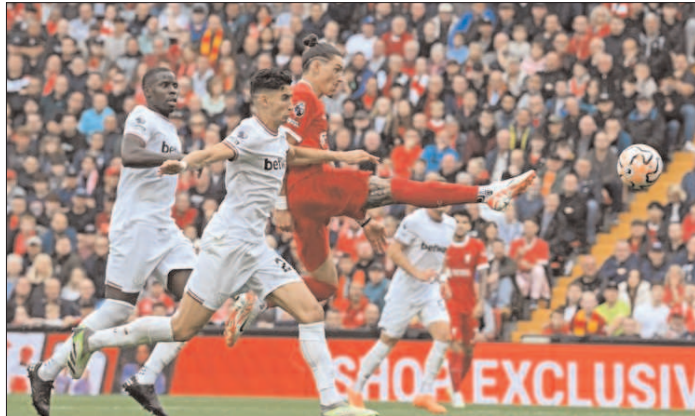
Darwin Nunez's goal was his fourth of the season for Liverpool.

bad to worse when he was harshly penalised for handball and Saka stroked home the resulting penalty to restore Arsenal's lead.