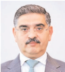
Anwaar-ul-Haq Kakar Caretaker Prime Minister

I extend my heartfelt congratulations to the All-Pakistan Newspapers Society (APNS) for their commitment to celebrating National Newspaper Readership Day. I am confident that this initiative will significantly contribute to nurturing the habit of reading among our people, empowering them with the knowledge and insight to make informed decisions for a better future.