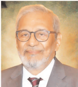
Justice (Retd.) Maqbool Baqar Caretaker Chief Minister Sindh

Newspapers are the most authentic source of accurate information, therefore newspapers were, are and will remain an important part of every society. The importance of newspapers for raising public awareness is unquestionable. Newspapers have played an unforgettable role in every society for the promotion of free democratic values. In Pakistan movement, newspapers played an important role in raising awareness of the importance of a separate homeland among the people. In developed societies, newspapers are still being printed and sold with full gusto. The habit of newspaper reading, has diminished in the digital age, but it cannot be eradicated by any means. Newspapers provide easy and affordable access to accurate and authentic information. Despite electronic and digital media, newspapers are still a great source of information for readers. By studying newspapers one gets awareness of various economic and social issues. The reader's access to the language and vocabulary is also widened by reading newspapers.