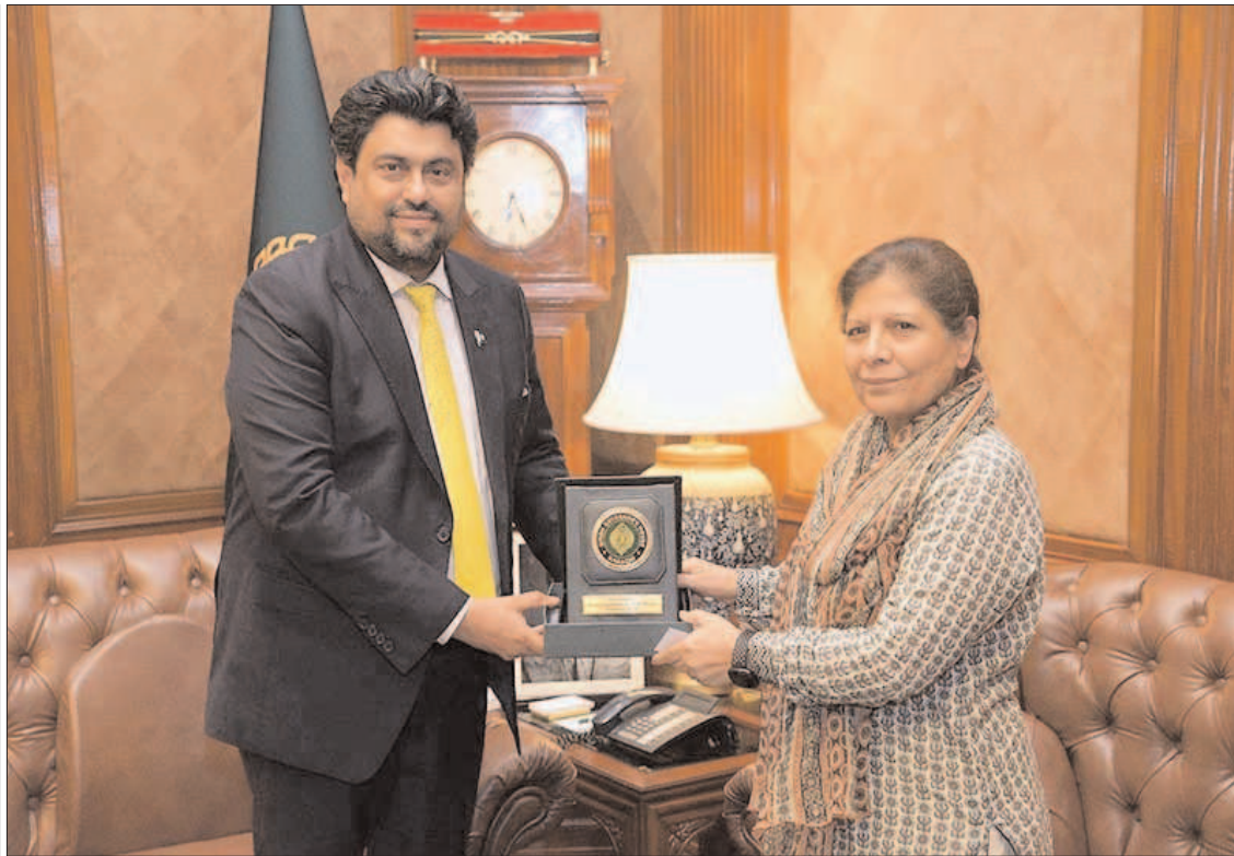
KARACHI: Sindh Governor Kamran Khan Tessori presenting shield to the caretaker Federal Minister for Finance and Economic Affairs Shamshad Akhtar at Governor House.

The MD APP along with the BC APP Karachi also visited news, video news, IT, photo service, admin and accounts sections on the occasion, where he was briefed about the operations of the respective sections.