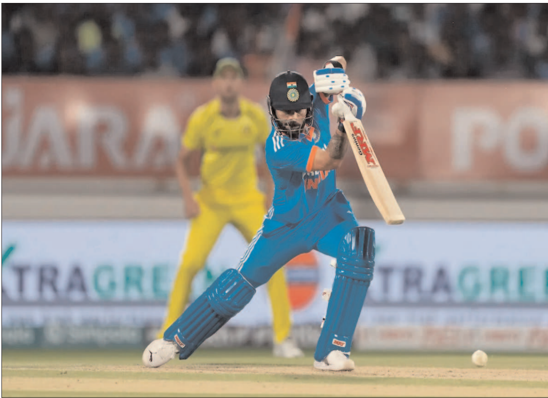
RAJKOT: Virat Kohli brings out the cover drive.

Indian pace spearhead Jasprit Bumrah took three wickets while left-arm wrist spinner Kuldeep Yadav took two. India had only 13 players to pick for their XI with some rested and a virus in the camp that made Ishan Kishan miss out.