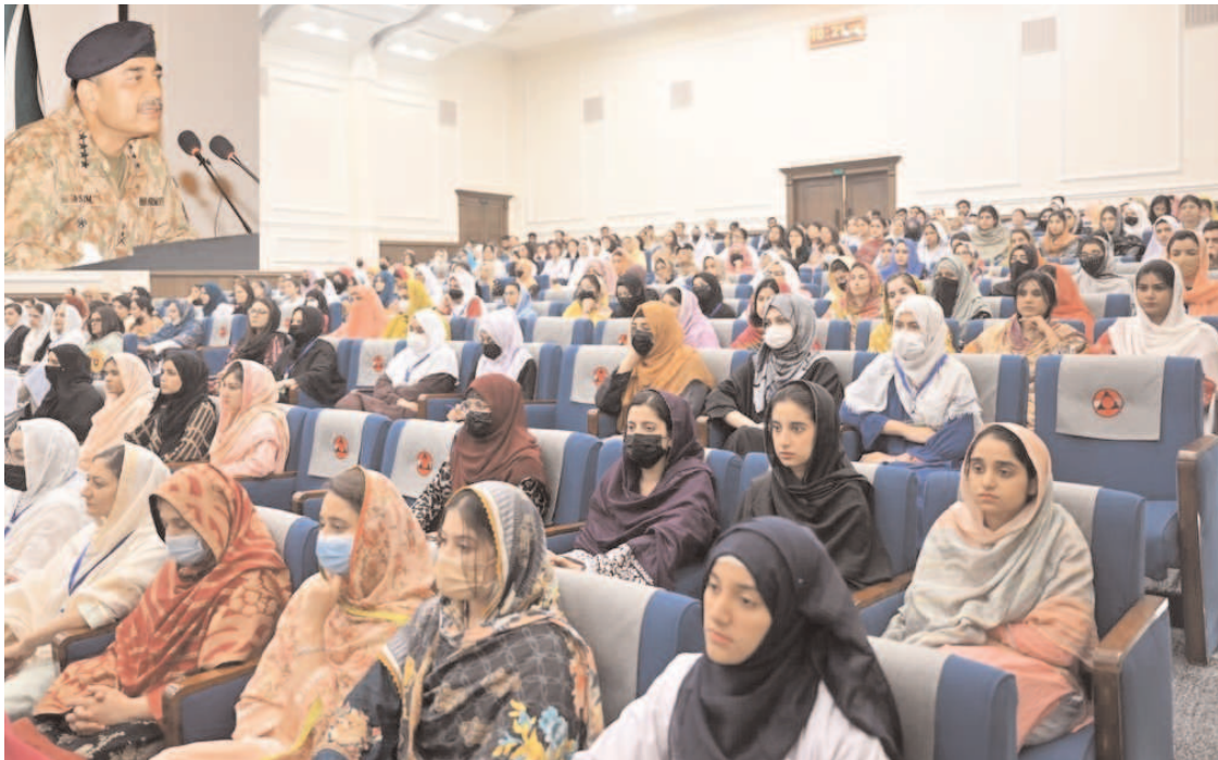
PESHAWAR: Chief of Army Staff General Syed Asim Munir addressing women during an interactive session 'CPK Women Symposium – 2023'.

She directed demolition staff to have a grand operation be conducted against encroachment and more than 30 illegal constructions were demolished, notices were also issued to many shopkeepers.