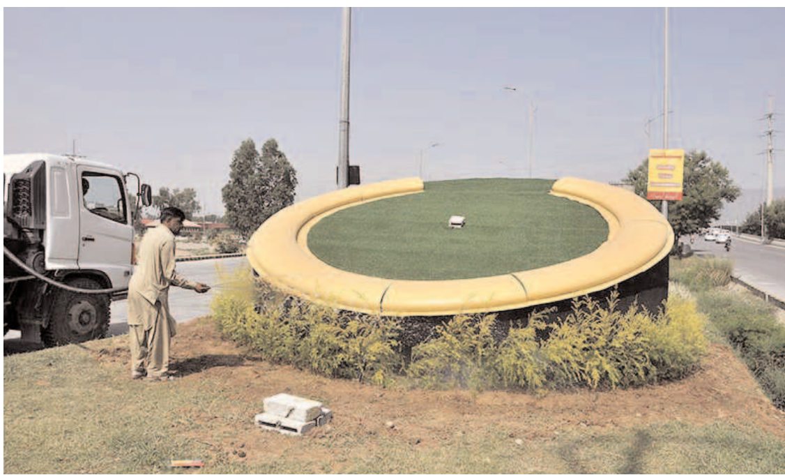
ISLAMABAD: CDA worker busy in watering plants on greenbelt near H-9 flyover.

It's worth noting that federal authorities have been actively conducting operations against unauthorized encroachments, illegal constructions, and building by-law violations in Islamabad for several months as part of their ongoing efforts to ensure compliance with regulations and enhance the city's urban landscape.