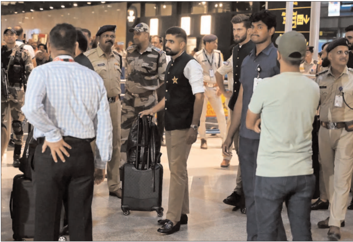
HYDERABAD: Shaheen Afridi and Babar Azam arrive in Hyderabad ahead of the ODI World Cup.