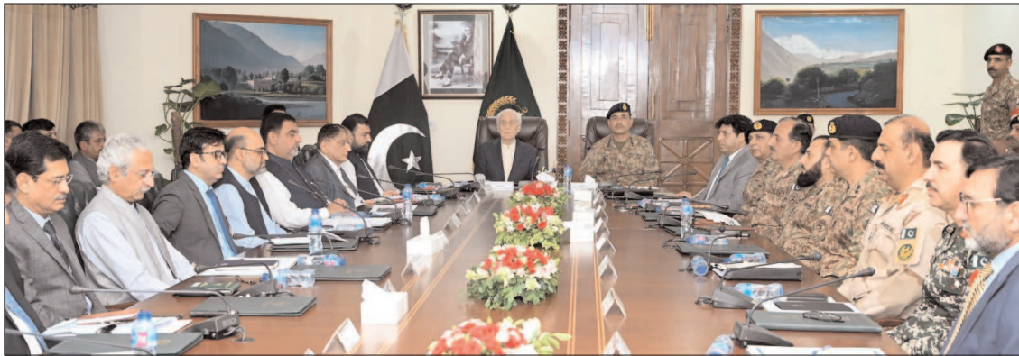
PESHAWAR: General Syed Asim Munir, Chief of Army Staff along with Caretaker Chief Minister KP, Muhammad Azam Khan chairing the meeting of Provincial Apex Committee.

session with the respectable women of Khyber Pakhtunkhwa during 'KPK Women Symposium - 2023'. While addressing the participants of the women symposium, COAS said that, women have played a positive and an important role in the progress of country throughout the history of Pakistan. COAS highlighted that women's role in Pakistan's progress and development is quintessential and most important. COAS remarked that women of KPK have continued to face multifaceted challenges due to prolonged fight against terrorism, however, they have proven their resilience, commitment and bravery at the face of all odds. COAS encouraged the women to take part in the progress and development of KPK and Newly Merged Districts.