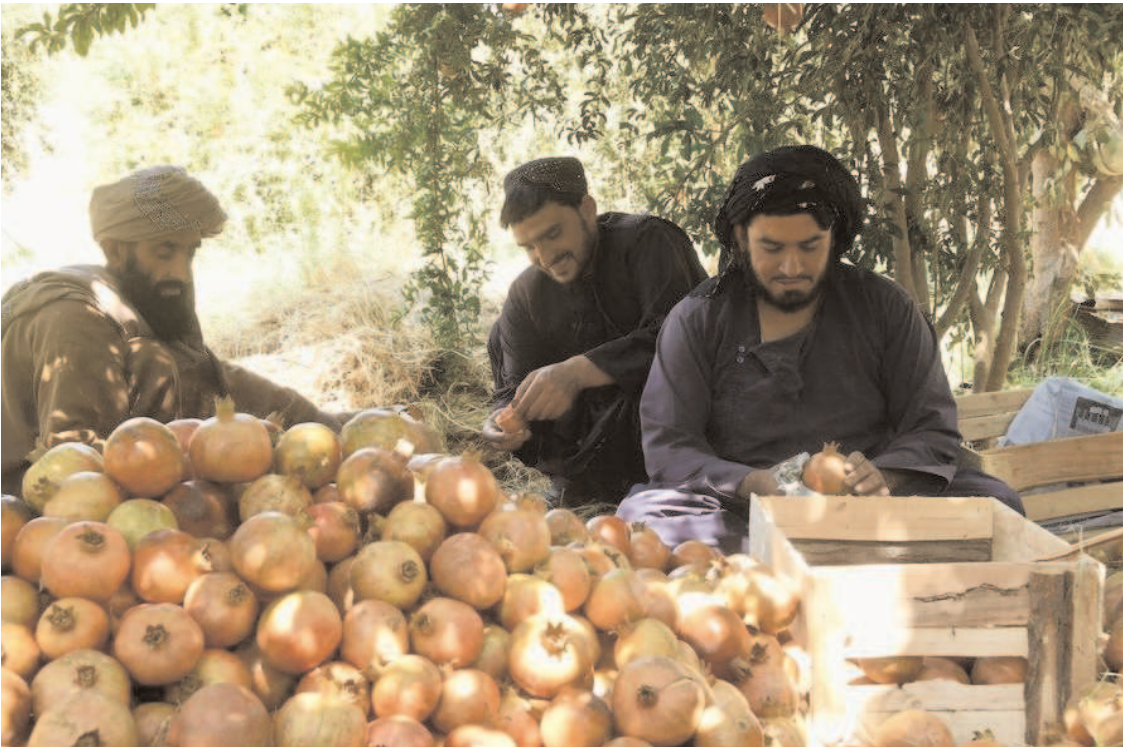
KANDAHAR: Afghan farmers pack fresh pomegranates at an orchard.