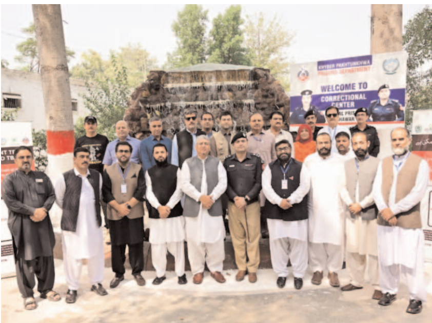
PESHAWAR: A group photo after TB screening camp held at Peshawar Jail organized by NCHD, Health Department and Dopasi Foundation Foundation.

The directives to all private schools in the province have been issued in light of the judgment of Peshawar High Court (PHC) Peshawar for implementation of the cabinet wherein action plan for introduction of Pashto/regional languages as compulsory subject was approved in all schools, operating in the public and private sector in the province of Khyber Pakhtunkhwa.