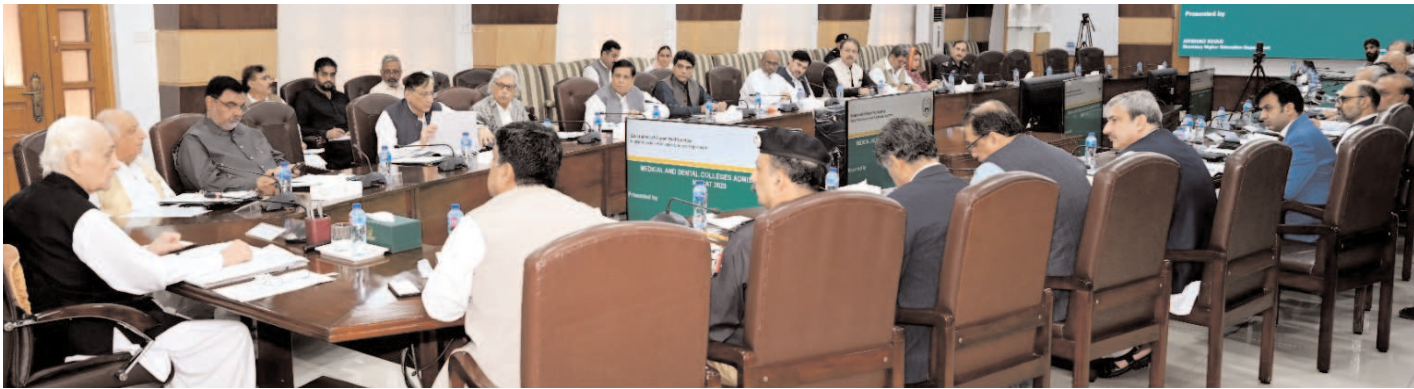
PESHAWAR: Chief Minister Khyber Pakhtunkhwa Muhammad Azam Khan chairing a special meeting of provincial cabinet.