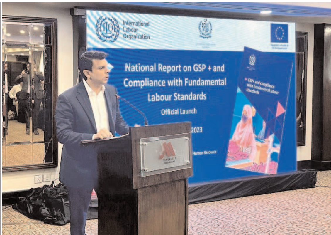
ISLAMABAD: SAPM on OP&HRD Jawad Sohrab Malik speaking at launching ceremony of National Report on the General Scheme of Preferences Plus.