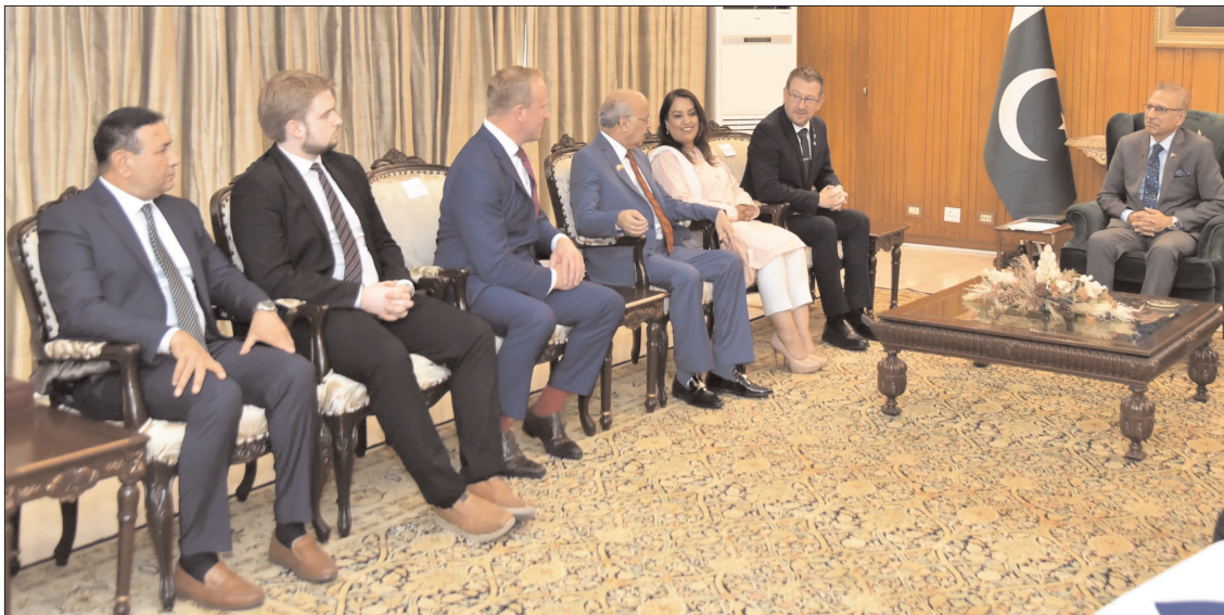
ISLAMABAD: President Dr Arif Alvi in a meeting with a delegation of the members of the British Parliament and the representatives of the Pakistani and Kashmiri diaspora in the UK, at Aiwan-e-Sadr.