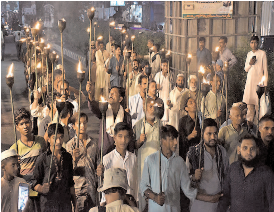
LAHORE: People participating in religion procession in connection with Eid Milad-un-Nabi (PBUH) celebrations.