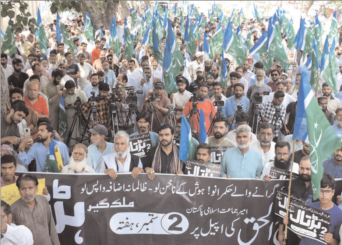
LAHORE: Workers of Jamat-e-Islami holding a protest at Mall road against the surge in electricity and fuel prices and unbearable inflation across the country.

According to the spokesperson, the CTD raided a house in Basima – a town and tehsil headquarter in Washuk district on tipoff. The terrorists opened fire on law enforcers, triggering a gun battle that lasted for some time, he said. As a result, five of these terrorists were eliminated while three others managed to escape the scene.