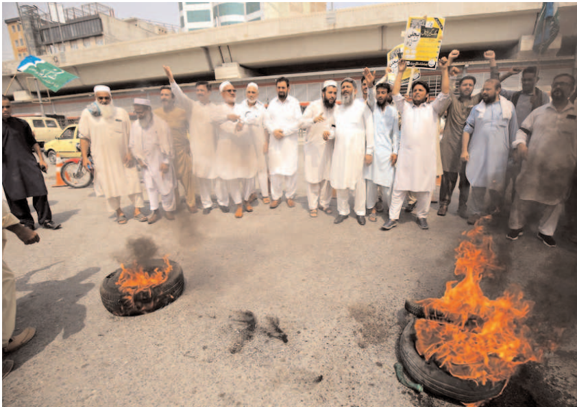
PESHAWAR: Activists of Jamaat-e-Islami burning tyres during a protest against electricity bills.

The Governor Khyber Pakhtunkhwa, Haji Ghulam Ali also directed to further improve education standard of these schools according to their historic importance.