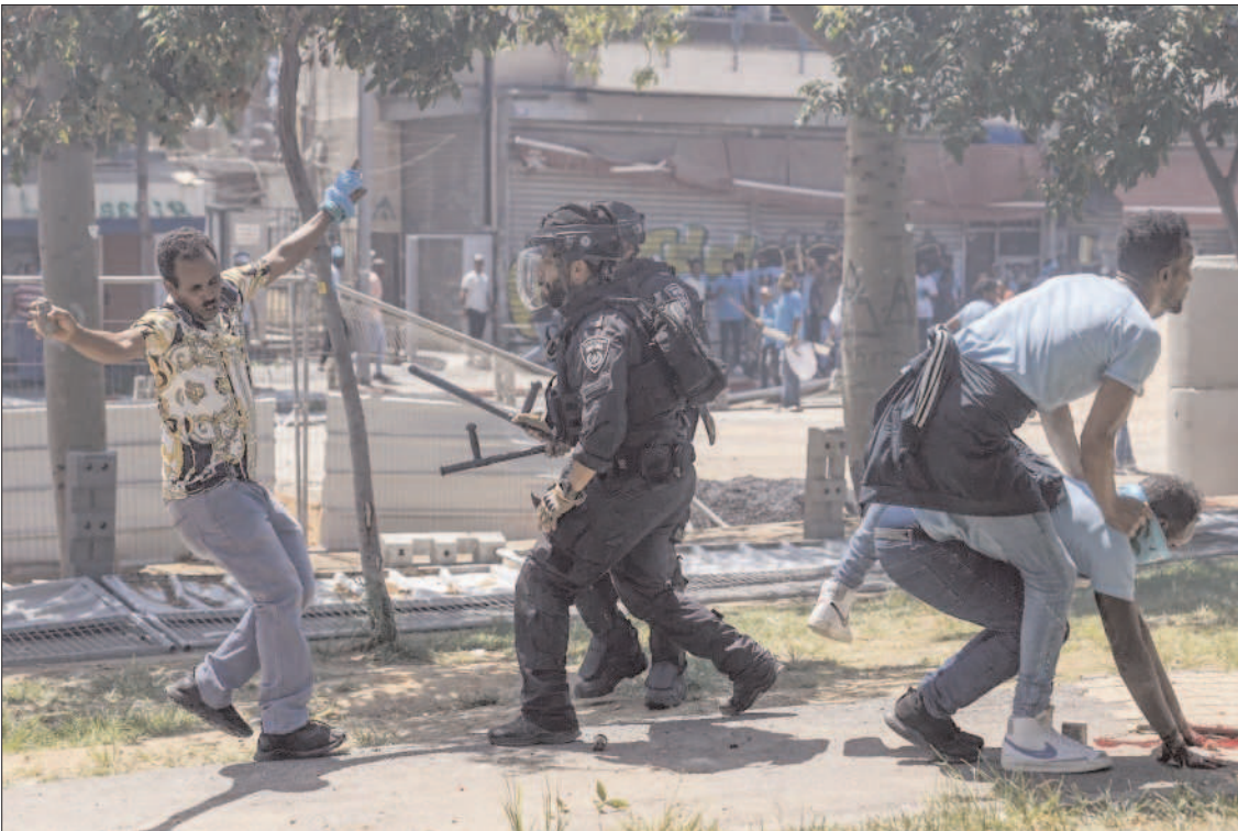
TEL AVIV: Eritrean protesters clash with Israeli riot police. Hundreds of Eritrean asylum seekers smashed shop windows and police cars in Israel, clashing with police during a protest against an event to 30 years of independence, organized by the government of Eritrea.

To believe otherwise, he said on Monday, was to live in a "world gone mad". Quite evidently, though, many people do prefer the conspiracy theory, which is why, just when things should be getting better - they are getting worse.