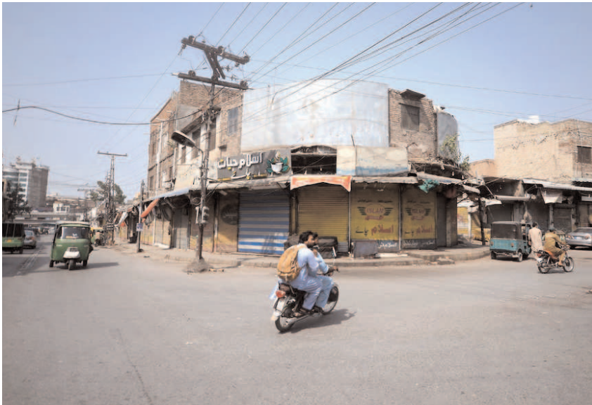
PESHAWAR: A view of closed market due to strike by traders.

The workshop also held a group discussion about formation of the group of CSOs (Civil Society Organizations) to gather diverse inputs and insights for designing a stakeholder engagement agenda and way forward agenda.