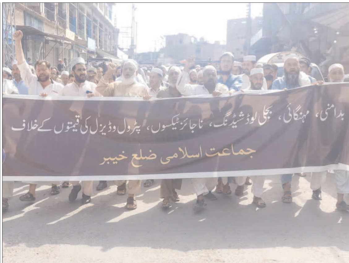
LANDI KOTAL: Political workers, traders and local people holding a rally against price hike of essential commodities in country.