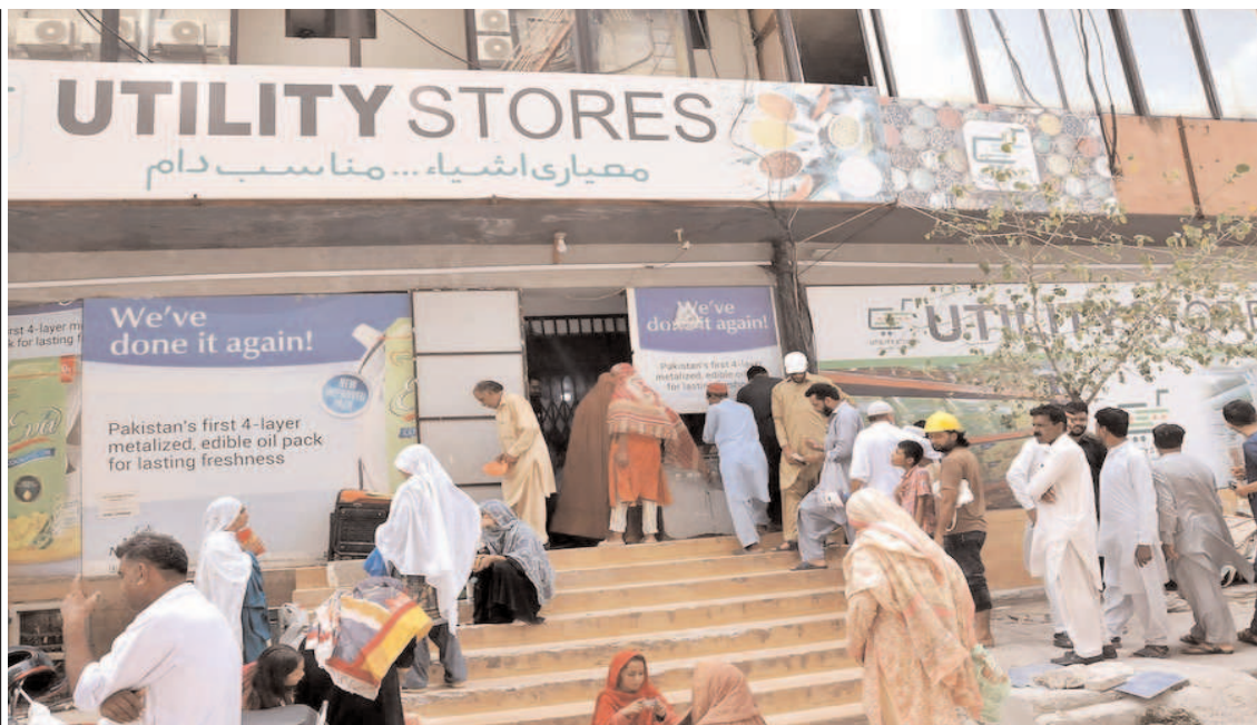
ISLAMABAD: A large number people in a long queue in front of Utility store to purchase groceries on subsidized rate.

He said protest and strike were the constitutional right of the people and they would not succumb to any browbeating of the government.