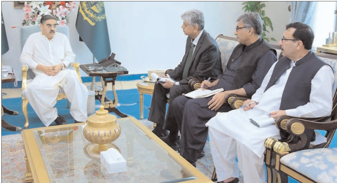
ISLAMABAD: Caretaker Minister for Information and Broadcasting Murtaza Solangi called on Caretaker Prime Minister Anwaar-ul-Haq Kakar.

The company representatives stated that the health card has been shut down five times in the past seven months. They said that for the ongoing year, the government owes Rs26billion out of which not even a single penny has been paid till date.