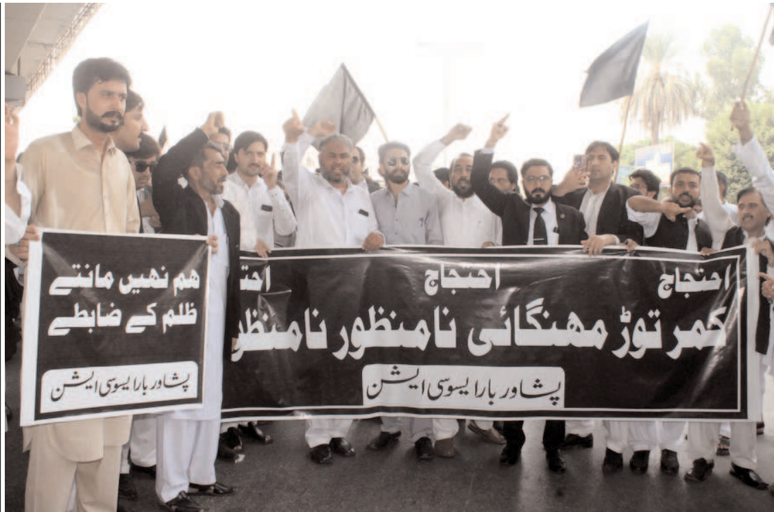
PESHAWAR: Lawyers of Peshawar Bar Association protesting against against inflated electricity bills.