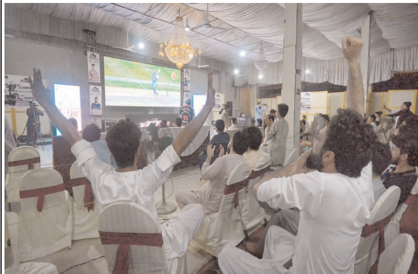
PESHAWAR: People watching Pakistan vs India cricket match on big screen at Dalazak Road.

The delegation assured hospital administration regarding assistance and provision of finance while claimed that the issued should be upheld with provincial government.