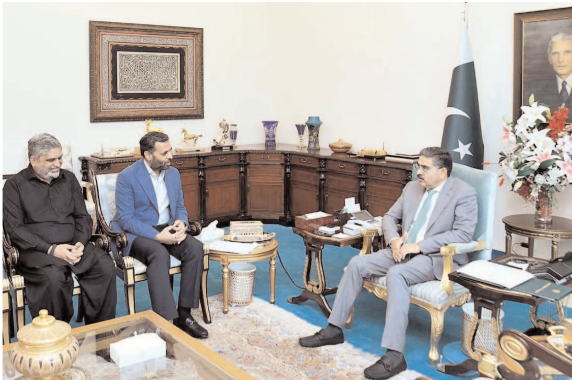
ISLAMABAD: MQM leaders Mustafa Kamal and Anis Qaimkhani called on Caretaker Prime Minister Anwaar-ul-Haq Kakar.

ISLAMABAD (APP): Pakistan Meteorological Department (PMD) has forecast mainly hot and humid weather for most plain areas of the country. However, rain-wind/thunderstorm is expected at isolated places in upper Khyber Pakhtunkhwa, Potohar region, Islamabad, northeast Punjab, Kashmir and Gilgit-Baltistan. As per the synoptic situation, continental air was prevailing over most parts of the country while a shallow westerly wave was present over the upper parts of the country. During the last 24 hours, hot and humid weather prevailed over most parts of the country. However, rain recorded in Khyber Pakhtunkhwa: Malam Jabba 04mm, Gilgit-Baltistan: Skardu 04, Hunza and Bagrote 01mm. The highest temperatures recorded during the last 24 hours were Dalbandin 42 C, Bhakkar, Dera Ismail Khan, Dadu and Nokkundi 41 C.