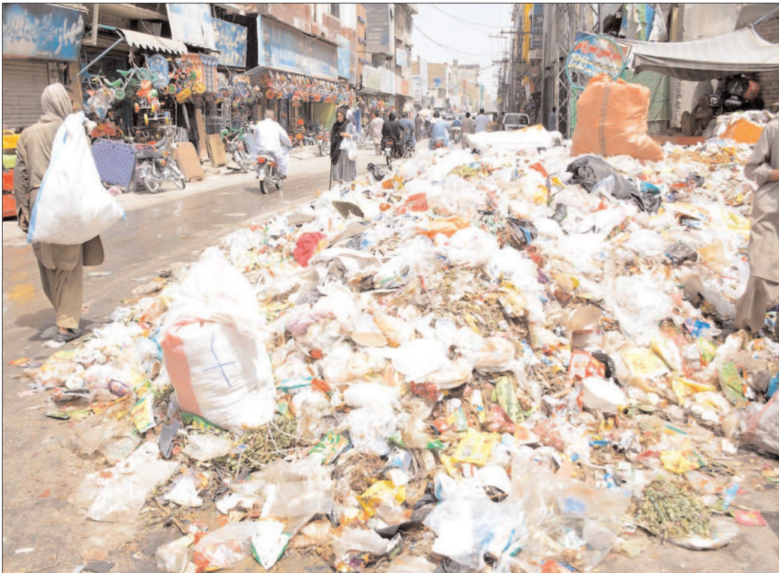
QUETTA: A view of a dump of garbage on Art School Road due to strike of Metropolitan Corporation employees creating problems for locals.