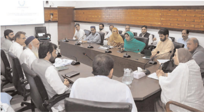
PESHAWAR: Minister Irshad Qaiser presiding over a meeting of performance of Social Welfare, Special Education & Women Empowerment Department.

Furthermore, it was decided that Peshawar's monitoring team would conduct ongoing inspections of schools. Postings and transfers would only take place after the specified tenure had been completed, with principals playing a vital role in enhancing educational standards.