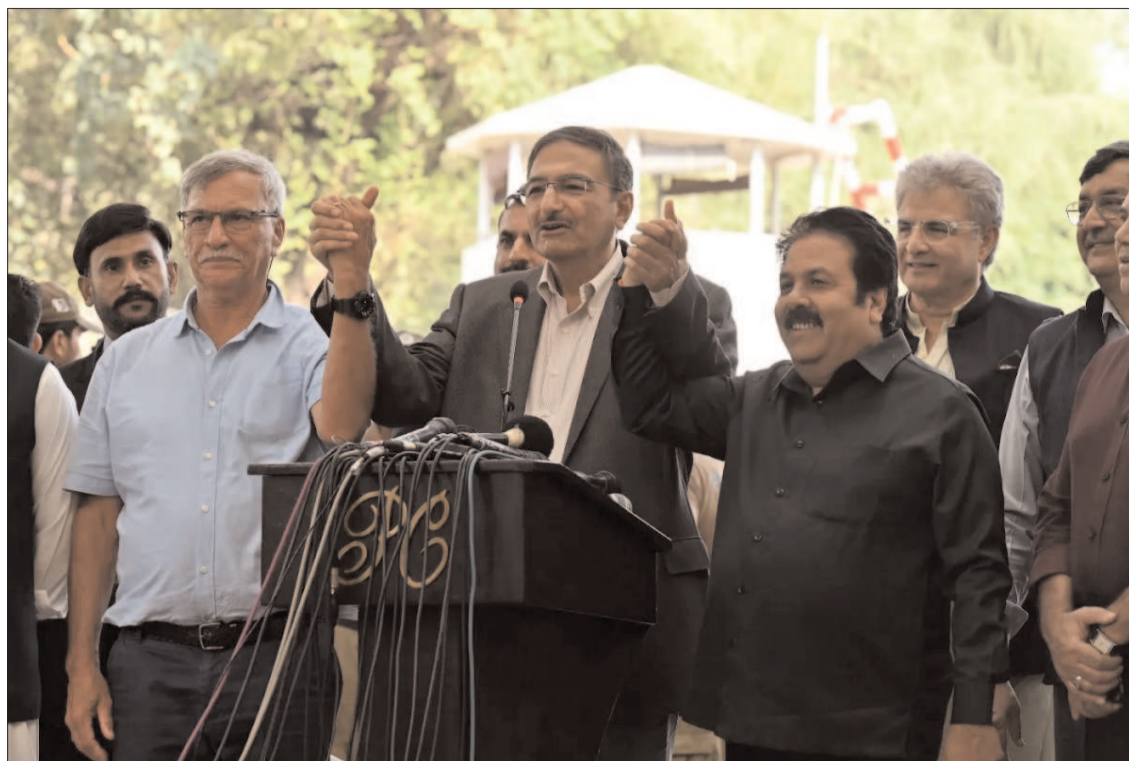
LAHORE : PCB chairman Zaka Ashraf with BCCI president Roger Binny and vice president Rajeev Shukla in Lahore.

Gavaskar claimed that India would have struggled to cross the 200-run mark if the Pakistani pacers had dismissed either Pandya or Kishan earlier in the innings. When Afridi returned to dismiss Pandya for 87 off 90 balls, the Kishan-starrer side had already scored 239 runs in 43 overs. "I mean India will be saying a big thank you because that's what allowed the partnership to flourish because otherwise, if one of the pacers had taken just that one wicket between Ishan Kishan and Hardik Pandya, then maybe India would have struggled to reach even 175, 200," Gavaskar added.