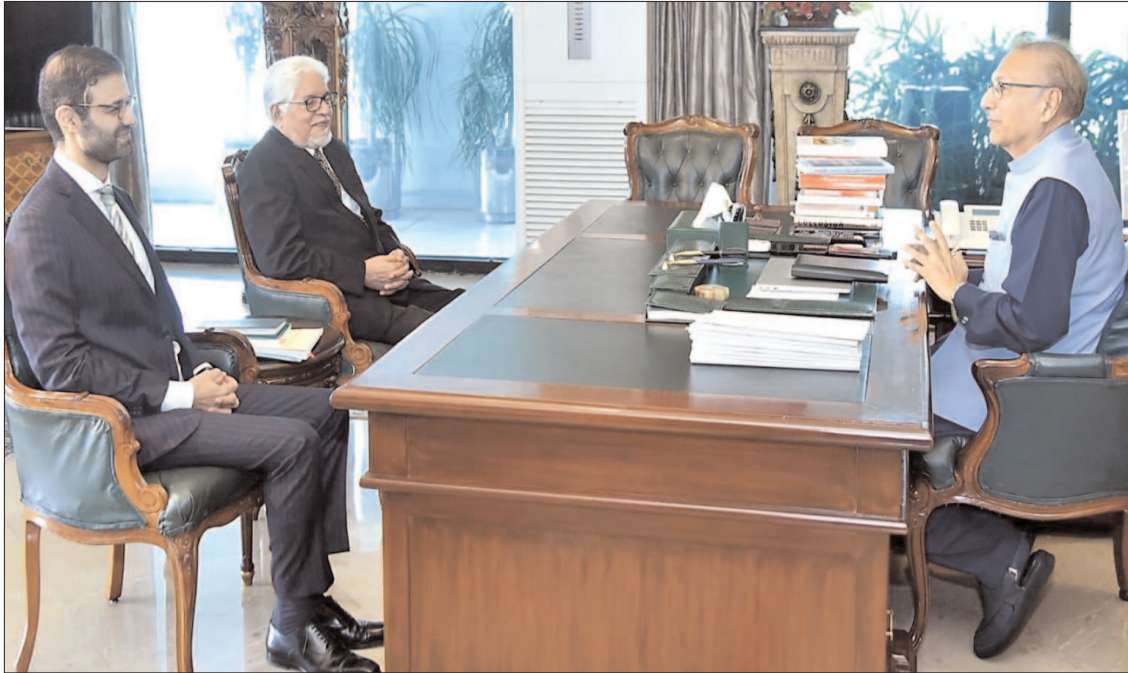
ISLAMABAD: Caretaker Minister for Law and Justice Ahmad Irfan Aslam called on President Dr. Arif Alvi, at Aiwan-e-Sadr.