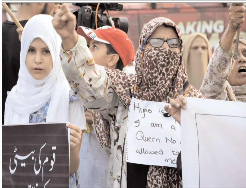
ISLAMABAD: Women activists of Jamat-e-Islami taking part in a pro-Hijab rally on the eve of 'International Hijab Day'.

But on Monday, the US president seemed to dismiss the issue. "The only thing that comes with age is a bit of wisdom. I've been doing this longer than anybody, and I guess what, I'm going to continue to do it with your help," Biden said.