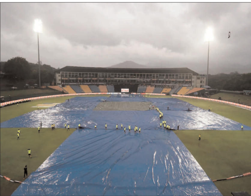
PALLEKELE: A familiar sight for cricket-watchers in Pallekele, Nepal vs India, Asia Cup

According to reports, the Asian Cricket Council (ACC) is considering moving games in the Super Four round of the ongoing Asia Cup away from Colombo as wet weather looms over the Sri Lankan capital. However, no formal decision has been taken in this regard.