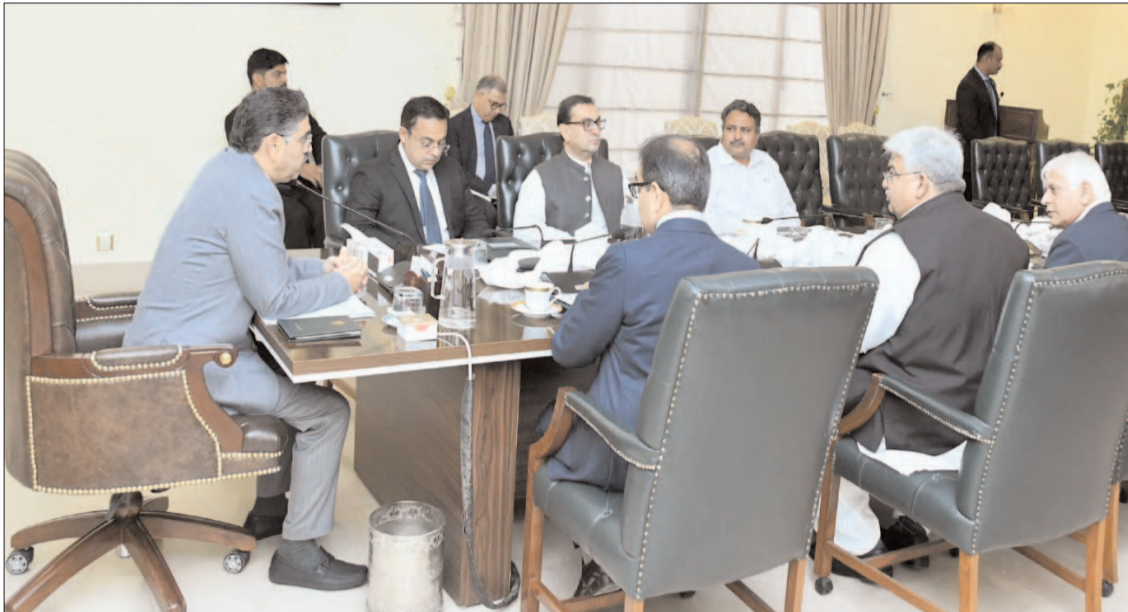
ISLAMABAD: Caretaker Prime Minister Anwaar-ul-Haq Kakar chairing a meeting regarding power sector.