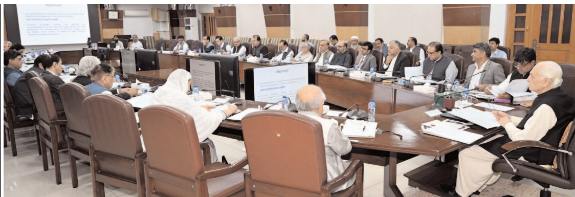
PESHAWAR: Caretaker Chief Minister Khyber Pakhtunkhwa Muhammad Azam Khan chairing 10th meeting of Provincial Caretaker Cabinet.

The writ argued to direct the respondents to ensure the free, fair and transparent elections in the province of Khyber Pakhtunkhwa in pursuance of the guidelines as well as Section 230 of the Election Act 2017, no institution, Department and authority has the power to announce/execute anykind of Developmental Schemes in the province of Khyber Pakhtunkhwa and the already Developmental Works invited Tender notices is against the law, rules and code of conducts issued by the Election Commission of Pakistan and also the violation of the Article 4, 5, 25, 27, 35, 37 & 38 of the Constitution of Islamic Republic of Pakistan, 1973.