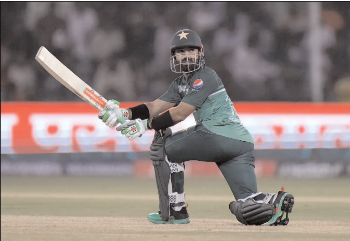
LAHORE: Mohammad Rizwan ensured Pakistan didn't wobble after losing Babar Azam.

The pair added 100 runs for the fifth wicket and both slammed their respective half-centuries. Shakib was dismissed for 53(57) by Faheem Ashraf, while Mushfiquir was caught-behind against Haris for 64(87).