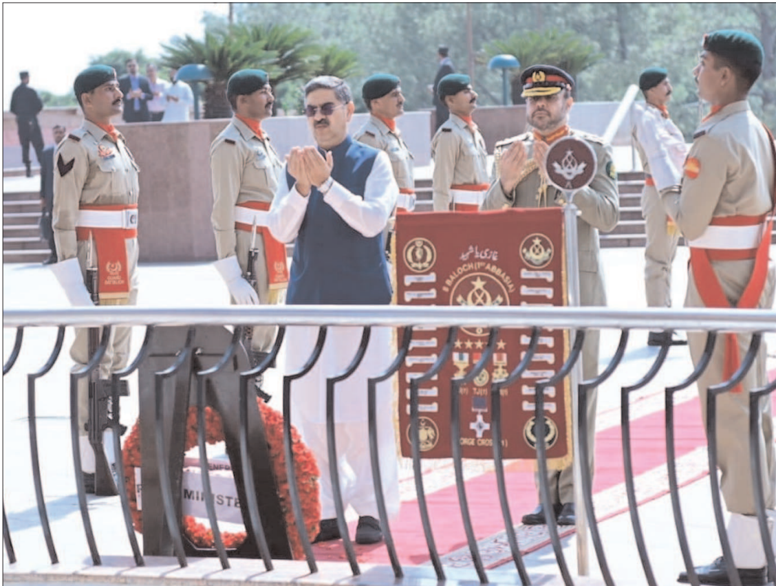
ISLAMABAD: Caretaker Prime Minister Anwaar-ul-Haq Kakar laying floral wreath and offering dua at Pakistan Monument.