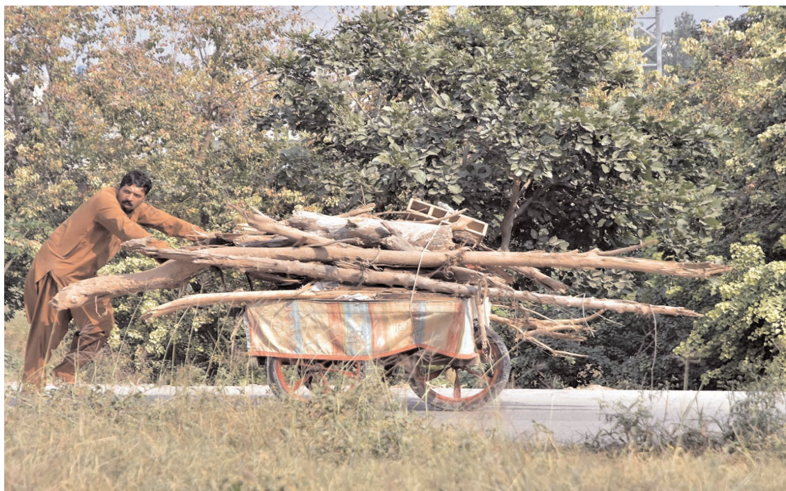
ISLAMABAD: A man carrying wood on hand cart to be used as fuel for cooking purposes at Chak Shahzad neighbourhood in the Federal Capital.

He said utilizing the cutting-edge technology of Chinese corporations, the Coal Gasification plant in Thar can help bolster the energy supply to industry.