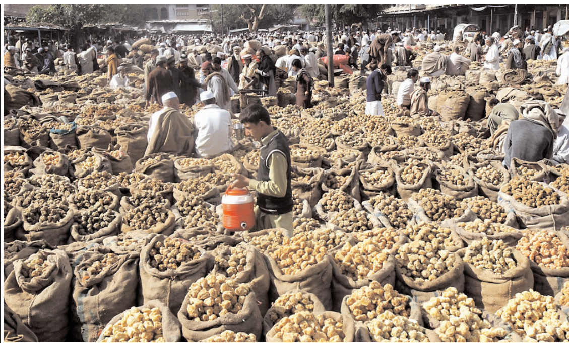
PESHAWAR: People buying Jaggery (Gurr) at Gurr Market.