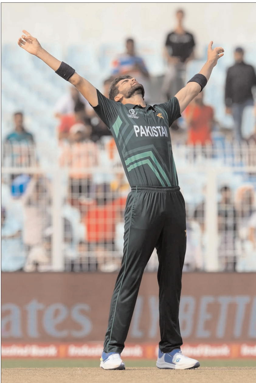
KOLKATA: Shaheen Shah Afridi is ecstatic after reaching 100 wickets in ODIs.