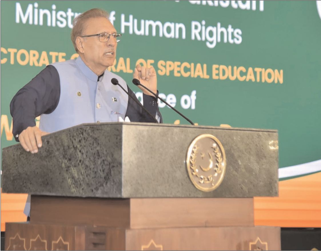
ISLAMABAD: President Dr. Arif Alvi addressing an event in connection with White Cane Safety Day, at Aiwan-e-Sadr.

Palestinian authorities say Israel's "total siege" of Gaza since that rampage has killed more than 8,300 people, thousands of them children, and left a dire need for fuel, food and clean water. Blinken said about 400 US citizens and family members — about 1000 people — are stuck in Gaza and would like to get out. He said the department was working on the issue but had not yet found a way to help them leave.