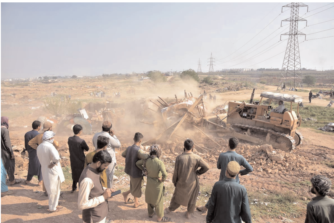
ISLAMABAD: CDA administration demolish a makeshift settlement using heavy machinery on the last day of the deadline fixed by government for illegal immigrants to leave the country in the outskirts of Islamabad.