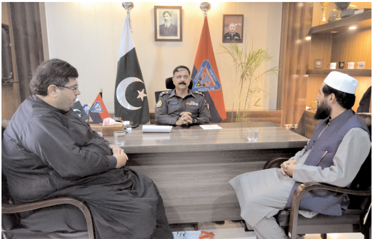
PESHAWAR: Businessmen of Namak Mandi Bazaar meeting with SP Traffic.