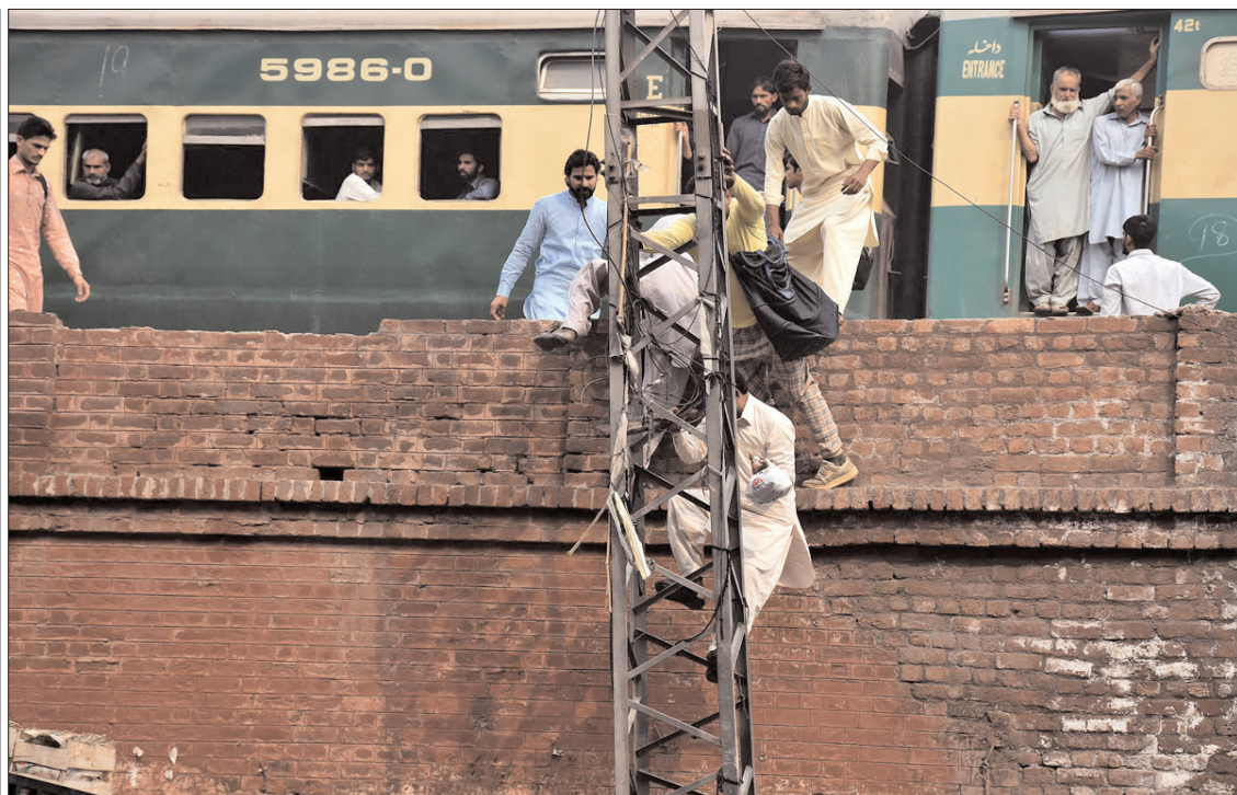
LAHORE: Passengers alighting from electricity pole which is most dangerous mode to come out from railway track, after leaving slow moving train only few yards away railway station from the site at Do Moria Bridge, may cause any mishap and needs attention of the concern authorities.

exercise would convey an unequivocal message to the duty evaders to forthwith halt their illicit practices. He also reiterated to continually fight the issue till its logical conclusion. It was further resolved that in the next phase of the drive, criminal proceedings would be initiated against such culprits.