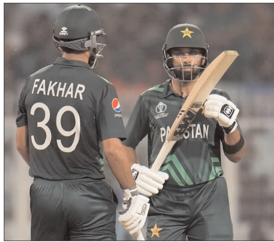
Fakhar and Abdullah put up a strong stand.

Mahmudullah and Liton Das led the recovery but the former was bowled by a beauty from Shaheen soon after reaching his half-century and wickets continued to fall at regular intervals before Mohammad Wasim took three in seven reverse-swinging balls to wrap up