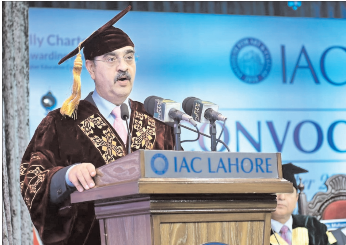
LAHORE: Caretaker Prime Minister Anwaar-ul-Haq addressing the first convocation of the Institute for Art and Culture.

US envoy to Pakistan Donald Blome also met Pakistani Foreign Minister Jalil Abbas Jilani on Tuesday, the ambassador's office said, and discussed, among other issues, the "safe and efficient processing of Afghan citizens eligible for relocation or resettlement in the United States." "The [US] Ambassador highlighted the two countries' mutual interest in ensuring the safety and security of refugees and asylum seekers, and the importance of putting in place appropriate screening mechanisms so that individuals with legitimate claims of credible fear are not placed in harm's way."