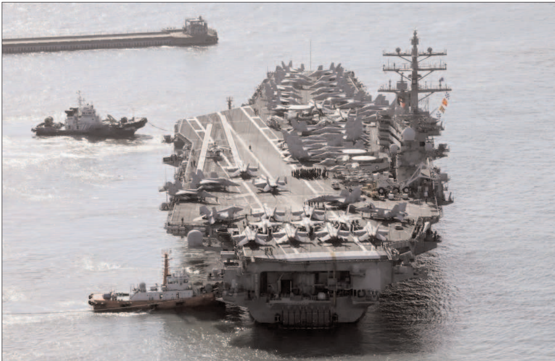
SEOUL: US nuclear-powered aircraft carrier USS Ronald Reagan is escorted as it arrives in Busan, South Korea.