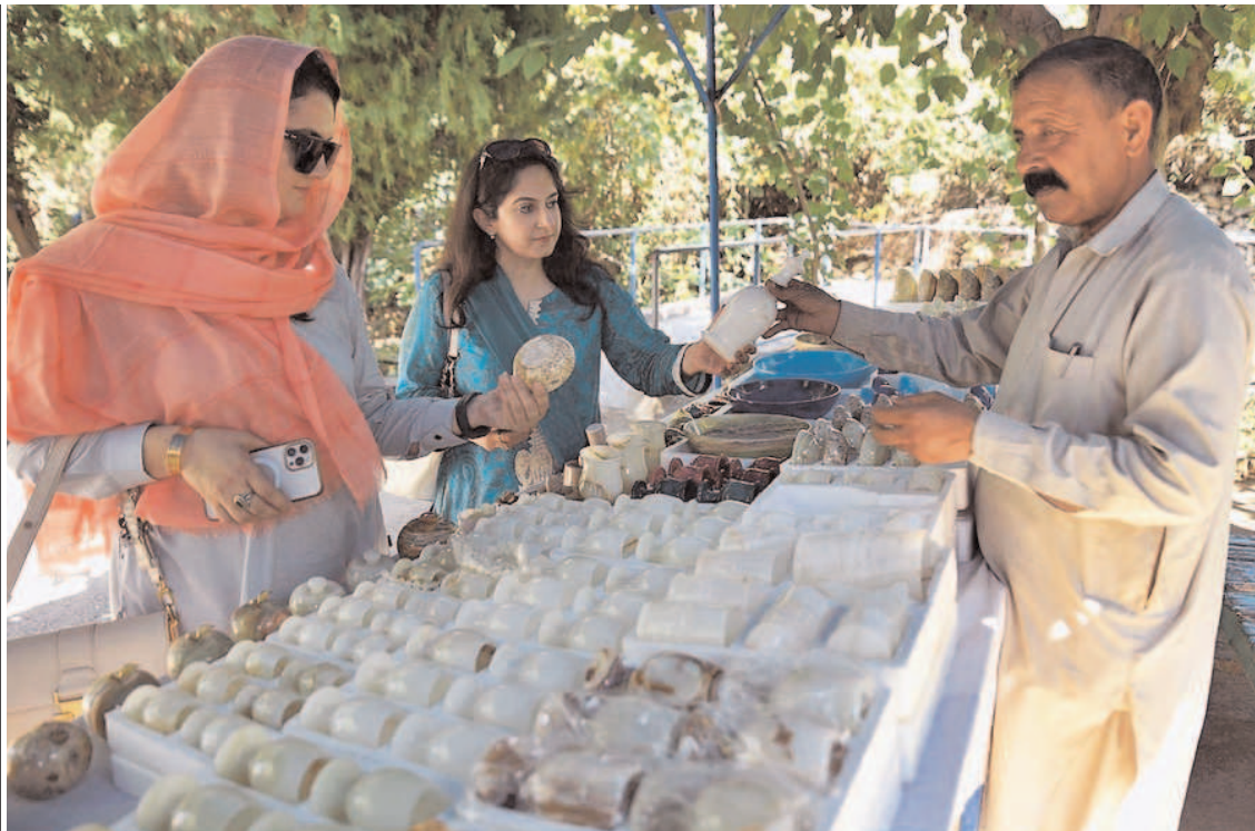
PESHAWAR: Women customers selecting and purchasing stone decoration items from a roadside vendor on GT Road.

The chamber president agreed with proposals of the FCAA delegation and assured to take initiatives in light of these recommendations to resolve all issues on priority basis.