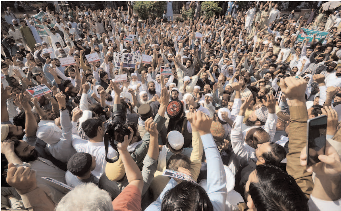
PESHAWAR: Supporters of a religious group chanting slogans against Israeli airstrikes on Gaza during a demonstration to show solidarity with Palestinian people.

accused will be arrested very soon. The Governor directed to take steps to improve the law and order situation in the entire province including Peshawar and said that the SHOs of all the concerned Police Stations to take measures in accordance with the law to prevent vagrancy, street crimes and other crimes in their respective areas so as to ensure the prevention of such unpleasant incidents. Expressing grief over the killing of the young student, the Governor also expressed his sympathy with the bereaved family.