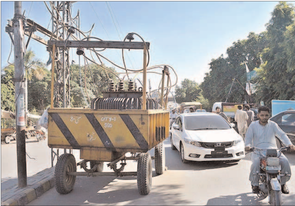
SARGODHA: A view of trolley with electric transformer place on road in front of Company Bagh creating hurdle in smooth flow of traffic and needs the attention of authorities concerned.