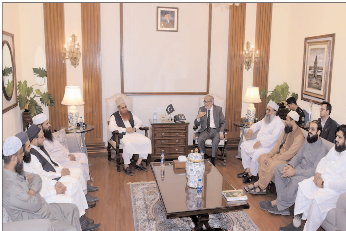
KARACHI: Caretaker Sindh Chief Minister Justice Maqbool Baqar meets with a delegation of Jamat Ahl-e-Hadees led by its Ameer Mufti Mohammad Yousif Kasori at CM House.

On the 35th day of anti-power theft operation, the LESCO charged 2,012 detection units worth Rs 994,852 to a connection in Hanjarwal area of Lahore; 15,060 detection units of Rs 545,300 to another connection in the area of Hujra Shah Moqem; 6,000 detection units worth Rs 421,000 to a power pilferer in Ichhra area on Ferozpur Road; and 7,800 detection units of Rs 400,000 to power thief in Factory Area.