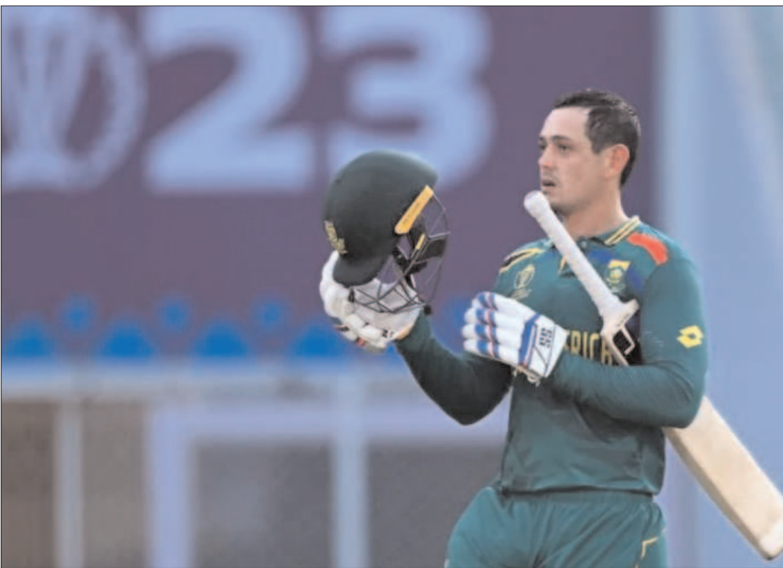
LUCKNOW: Quinton de Kock kicked off the 2023 World Cup with back-to-back tons.