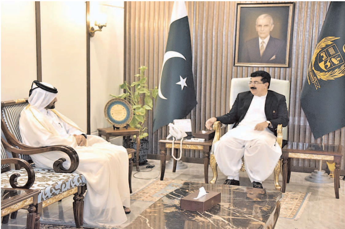
ISLAMABAD: Chairman Senate, Muhammad Sadiq Sanjrani exchanging views with Chargé D'AFFAIRS at the embassy of the state of Qatar, Mr. Issa Bin Muhammad Al-Dasam Al-Kubaisi, at Parliament House.

ISLAMABAD (APP): Indus River System Authority (IRSA) on Thursday released 112,100 cusecs water from various rim stations with inflow of 77,500 cusecs. According to the data released by IRSA, water level in River Indus at Tarbela Dam was 1529.45 feet and was 131.45 feet higher than its dead level of 1,398 feet. Water inflow and outflow in the dam was recorded as 40,300 cusecs and 45,000 cusecs respectively. The water level in River Jhelum at Mangla Dam was 1216.30 feet, which was 166.30 feet higher than its dead level of 1,050 feet.