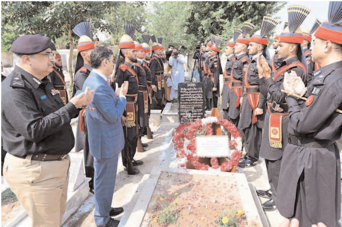
PESHAWAR: Caretaker Prime Minister Anwaar-ul-Haq Kakar offering fateha and lays floral wreath at grave of former commandant of FC Shaheed Sifwat Ghayur.

It was learnt that the accused were involved in providing illegally activated SIMs to Afghan citizens for a price of Rs 3000.