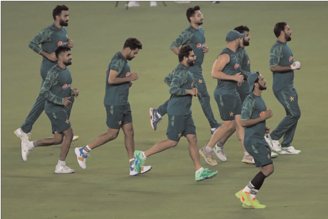
AHMEDABAD: Pakistan's cricketers attend a practice session ahead of their ICC Cricket World Cup match against India in Ahmedabad, India.

On the other hand, the Men in Green had their second practice session today at the Narendra Modi Stadium.