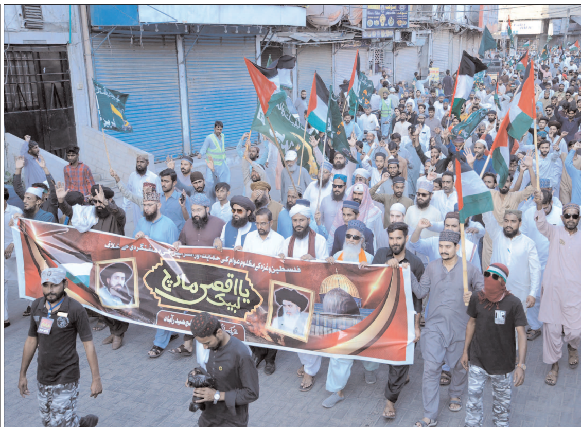
HYDERABAD: People holding a rally to show solidarity with the oppressed Muslims of Palestine.