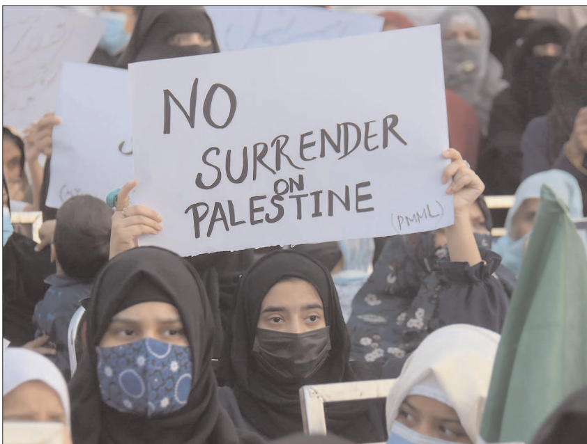
ISLAMABAD: People holding placards during a protest against Israel attack on Gaza.