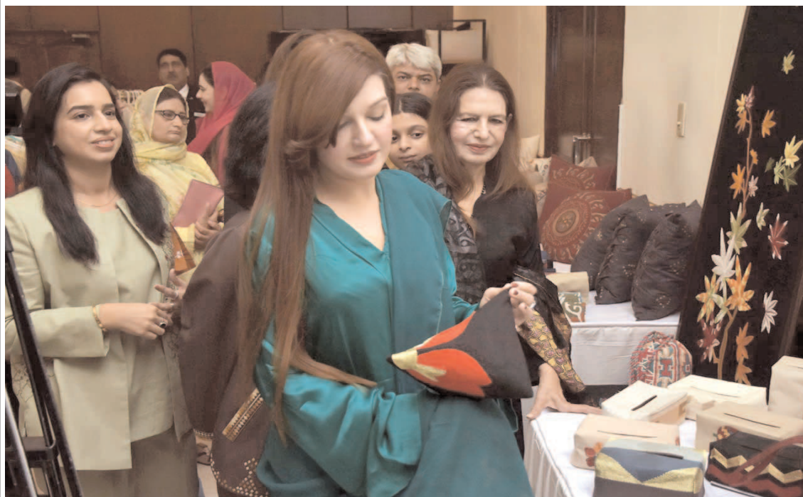
ISLAMABAD: Special Advisor to the Prime Minister Mushaal Hussein Mullick visiting stalls during exhibition and a celebration of handicrafts by 600 plus Afghan women refugee artisans from all over Pakistan, hosted by the Indus Heritage Trust, supporting Afghan women for sustainable livelihoods.

Moreover, the system has proven instrumental in the detection of unregistered and non-custom paid vehicles, leading to stringent legal measures against such violations. With a vision for expanded utility and effectiveness, plans are underway to integrate this system with other provinces, ensuring that unauthorized individuals or elements find no easy access to critical areas within the city. This proactive approach exemplifies the Islamabad Capital Police's unwavering commitment to upholding the highest standards of security and safety for all its residents.