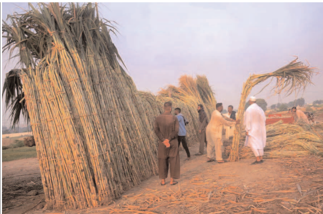
LAHORE: Farmers busy making bundles of sugarcane to deliver market in their farm field.

For Pakistan's part, the country is on-track to address the longstanding structural weaknesses, and with the support from its multilateral and bilateral partners, it would be able to achieve sustainable and inclusive economic growth over the medium term.