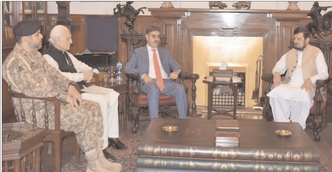
PESHAWAR: Governor Khyber Pakhtunkhwa Haji Ghulam Ali and Caretaker Chief Minister Muhammad Azam Khan called on Caretaker Prime Minister Anwaar-ul-Haq Kakar.

The Chief Minister said that it was the top most priority of the caretaker provincial government to ensure uninterrupted healthcare facilities to the public, and added that despite financial crunches, the provincial government would make no compromise on the provision of treatment facilities to the masses; and health sector would be given top priority in the allocation of available financial resources. He further directed to work out a feasible plan for the financial sustainability of MTIs in the long run.