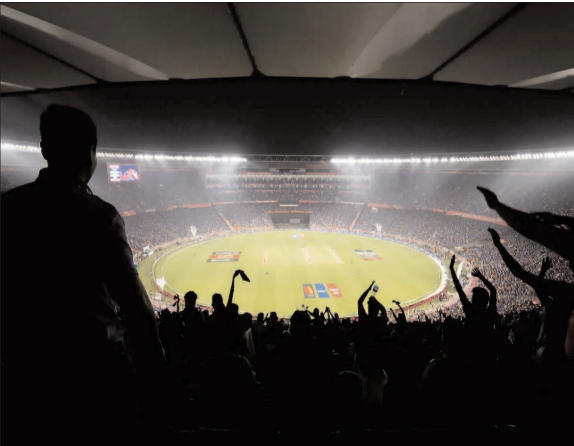
AHMEDABAD: The Narendra Modi stadium was heavily populated during the game, Pakistan vs India, men's World Cup 2023.

BUENOS AIRES (A g e n c i e s) : Argentina's women compiled a T20 International record score of 427 as they thrashed an inexperienced Chile side in Buenos Aires on Friday. The total - the highest in women's and men's T20Is - eclipsed the 318-1 made by Bahrain's women against Saudi Arabia in March 2022. Lucia Taylor hit 169 off 84 balls for Argentina as she made the highest individual score in women's T20Is. Chile, who fielded seven debutants, were bowled out for 63 in reply. The 364-run margin of defeat in the match played at the Maurice Runnacles Oval in the St Albans Club, was the heaviest in both women's and men's cricket. Taylor, whose previous top score in T20Is was 29, hit 27 fours as she shared a first-wicket stand of 350 with Albertina Galan (145 not out) - also a record for any partnership in both men's and women's T20Is.