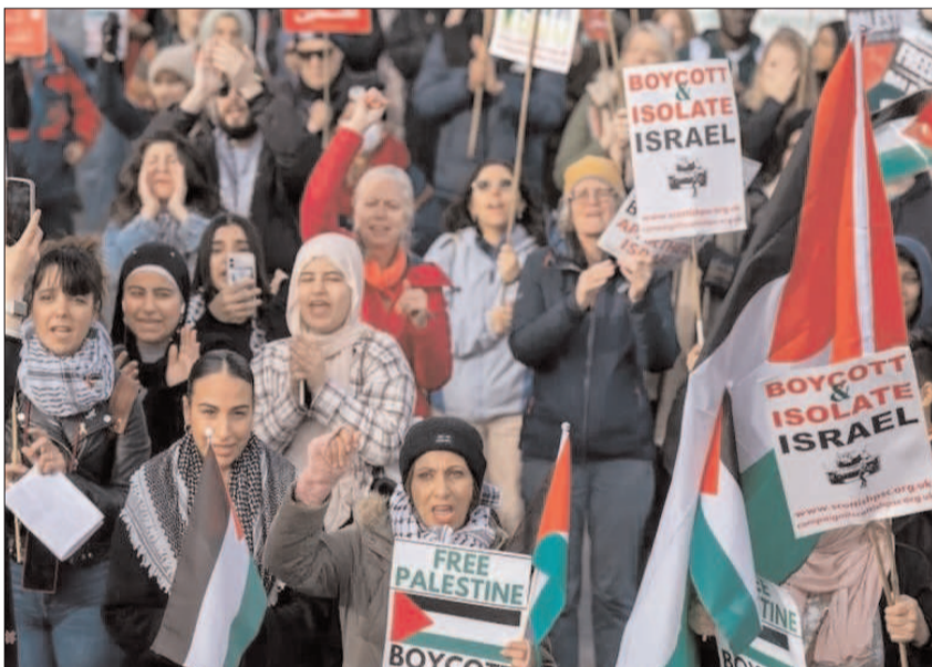
LONDON: People holding placards during a protest demonstration in Edinburgh against the Israeli attacks on Gaza.

Biden emphasised the humanitarian crisis as a top priority, stating that US teams are working with Israel, Egypt, Jordan, other Arab governments, and the UN in the region. "The overwhelming majority of Palestinians had nothing to do with Hamas and Hamas' appalling attacks," he said. "And they're suffering as a result as well." UN spokesperson Stephane Dujarric said it was impossible for Gazans to heed Israel's order to move south without "devastating humanitarian consequences", prompting a rebuke from Israel that the UN should condemn Hamas and support Israel's right to self-defence, Reuters reported. "The noose around the civilian population in Gaza is tightening. How are 1.1 million people supposed to move across a densely populated war zone in less than 24 hours?" UN aid chief Martin Griffiths wrote on social media.