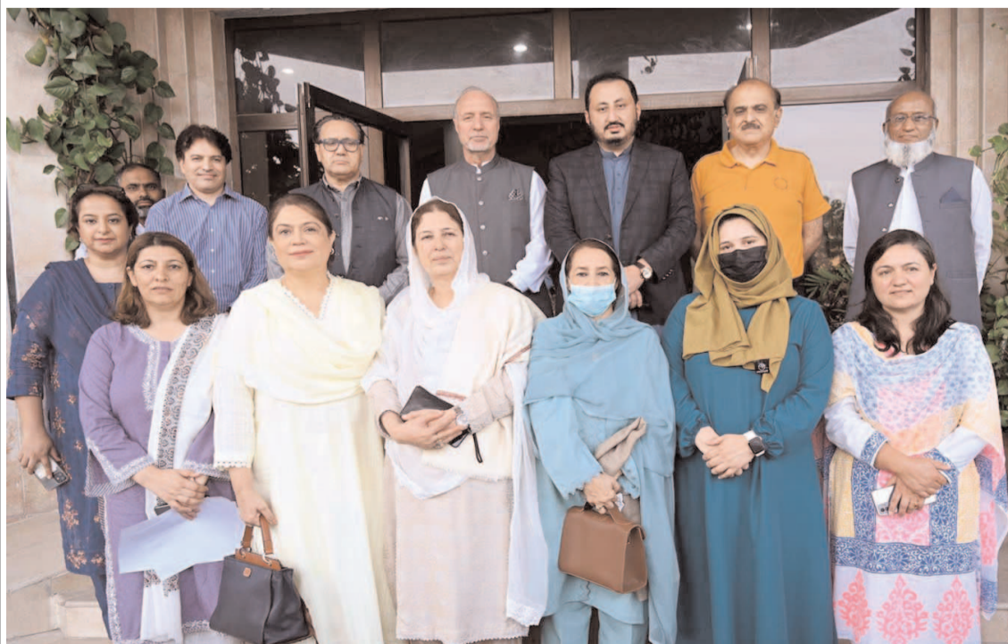
ISLAMABAD: Country Representative of UN for Rights of women in Pakistan in a group photograph with ministers and chief secretary of GB after a meeting regarding GB Commission on Status of Women at GB House.

It is worth mentioning here that the combination of Halwa Puri, Channay, and Achar provides a perfect balance of sweet and savory flavors. The Halwa, made from semolina, ghee, and sugar, adds a touch of sweetness, while the Channay, seasoned with spices, offers a satisfying savory element. Achar, with its tangy and spicy kick, ties everything together.