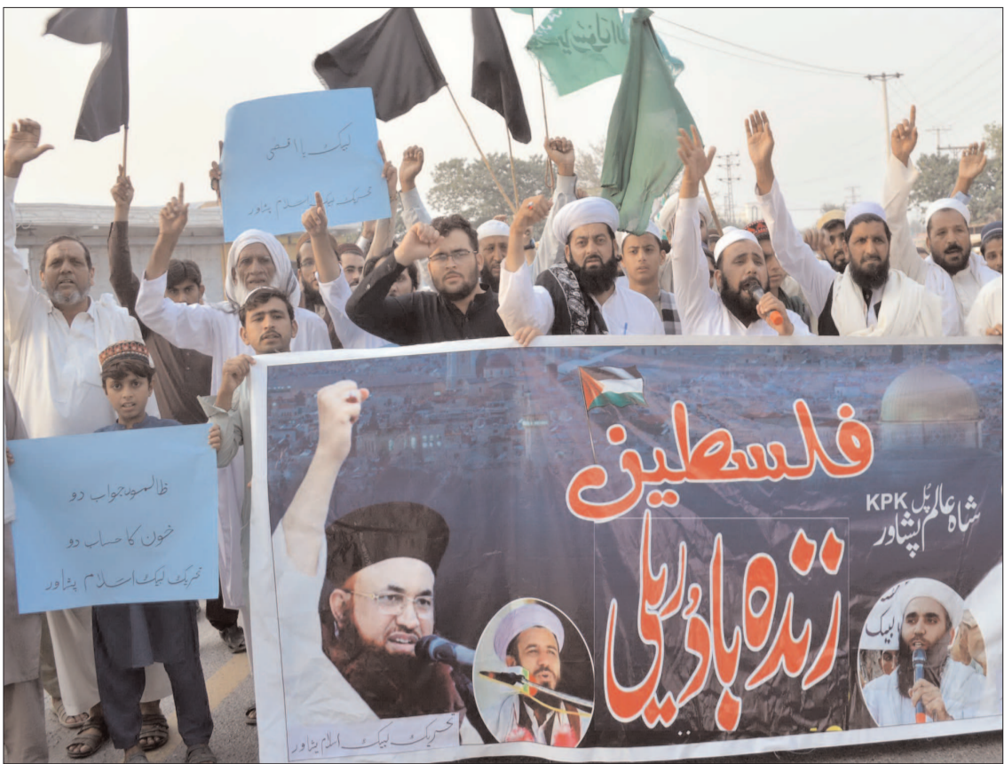
PESHAWAR: Activists of Tehreek-e-Labail holding a rally to show solidarity with Palestinians.