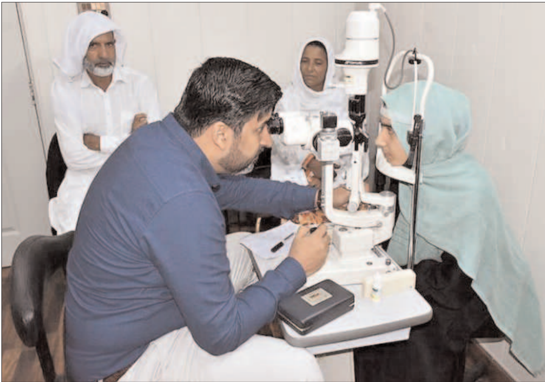
SIALKOT: A doctor examining an eye patient during free medical camp.