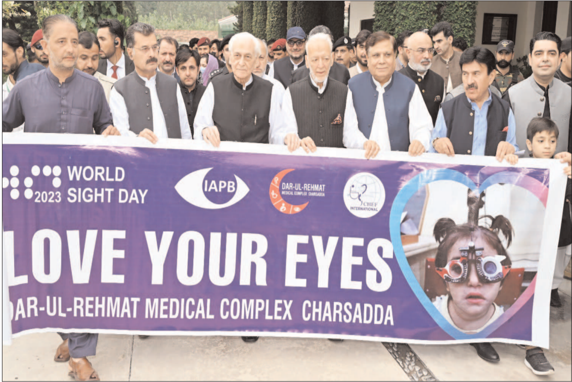
CHARSADDA: KP Caretaker Chief Minister Muhammad Azam Khan leading an awareness walk on World Sight Day.