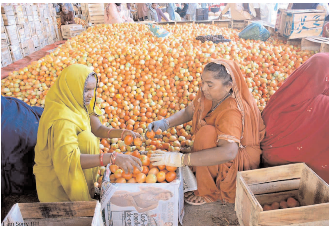
HYDERABAD: Women workers busy in packing tomatoes in wooden boxes at vegetables market.