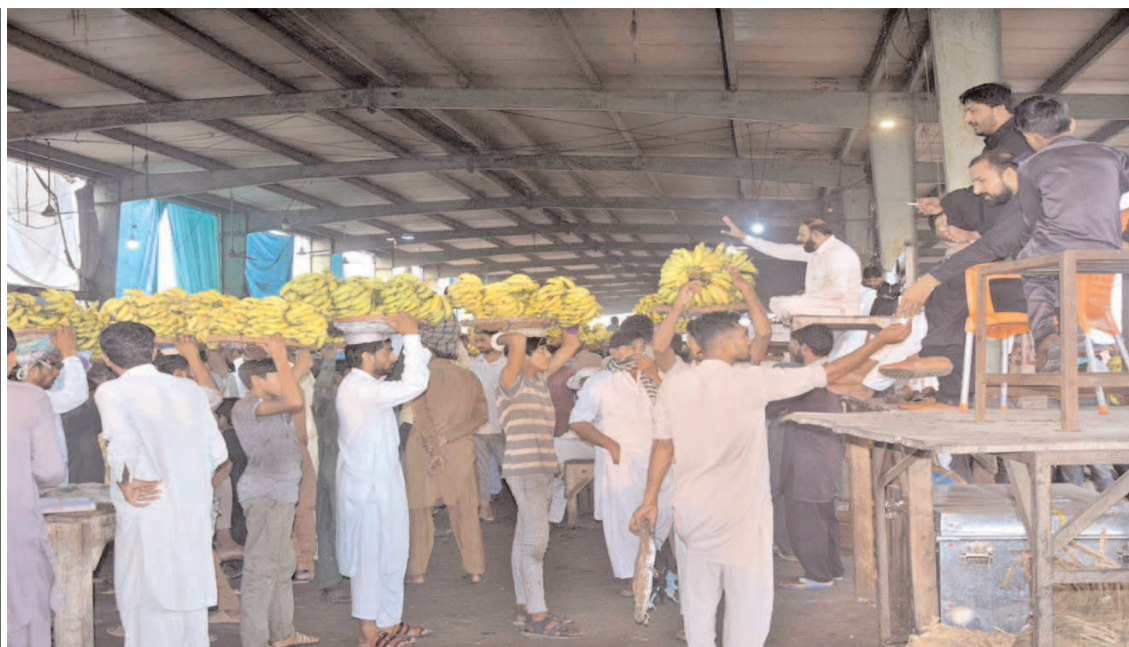
LAHORE: Traders displaying bananas during the auction as shopkeepers participate in the bidding at the Fruit Market.

This MoU solidifies the Foundation's continued support for this digital infrastructure project, following the success of the Raast - Pakistan Instant Payment System. The National Financial Inclusion Council, chaired by the Finance Minister, will oversee the implementation of the Digital Pakistan Stack, marking a significant step toward fostering inclusive economic growth and development in Pakistan.