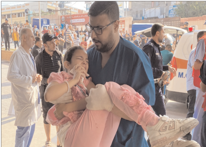
GAZA: A Palestinian child wounded in Israeli air raids is brought to a hospital in Khan Younis.

While the Security Council members reacted with caution to the resolution, some expressed openness to the humanitarian concerns it highlighted. British Ambassador Barbara Woodward stressed the need for thorough consultations, considering the gravity of the situation. Chinese Ambassador Zhang Jun emphasized the emerging consensus on humanitarian concerns, advocating for efforts to cease the fire and de-escalate the tension.