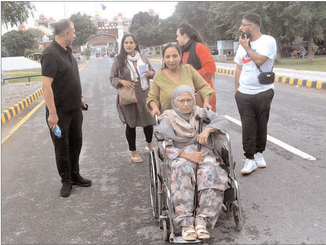
LAHORE: Sikh Yatrees are being welcomed on their arrival at JCP Wagah Border.

The involvement of these elements includes spreading propaganda and creating various issues, including leaking of medical entrance test papers. It should be noted that the Sindh government has handed over the matter to the Federal Investigation Agency (FIA) after conducting thorough investigations into the leakage of test papers for medical colleges. The investigation is currently underway, and soon the roles of those involved in this matter will be exposed.