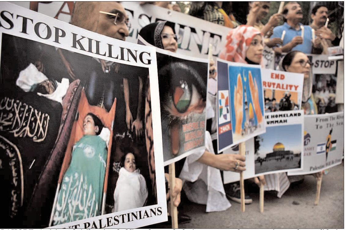
LAHORE: Activists of civil society holding play cards during a protest demonstration to show solidarity with the people of Palestine and take part in an anti-Israel demonstration outside the Press club.

"Furthermore, PSQCA is entrusted with regulating 166 food and non-food products and handles all aspects of quality infrastructure, including standardization, legal metrology standards, and conformity assessment at the national level. In line with the government's policy to promote ease of doing business, PSQCA is creating a conducive environment and offering facilitation to the industry," he added. He promised a more stringent campaign against illegal, unlicensed, and substandard food and non-food products, emphasizing a zero-tolerance policy. Furthermore, he stated that only PSQCA registered products would be permitted in the market, and illicit items would be removed from the shelves and confiscated.