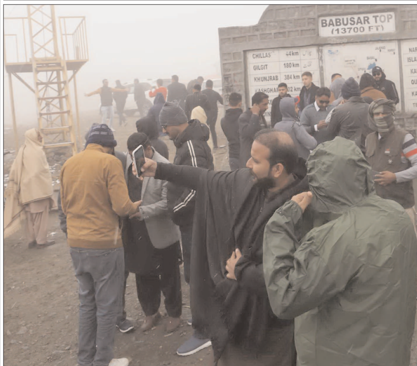
GILGIT: Tourists enjoying pleasant weather during visit to Babusar top.

According to the organizers selection had been made on age and elderly bridegrooms were given priority.