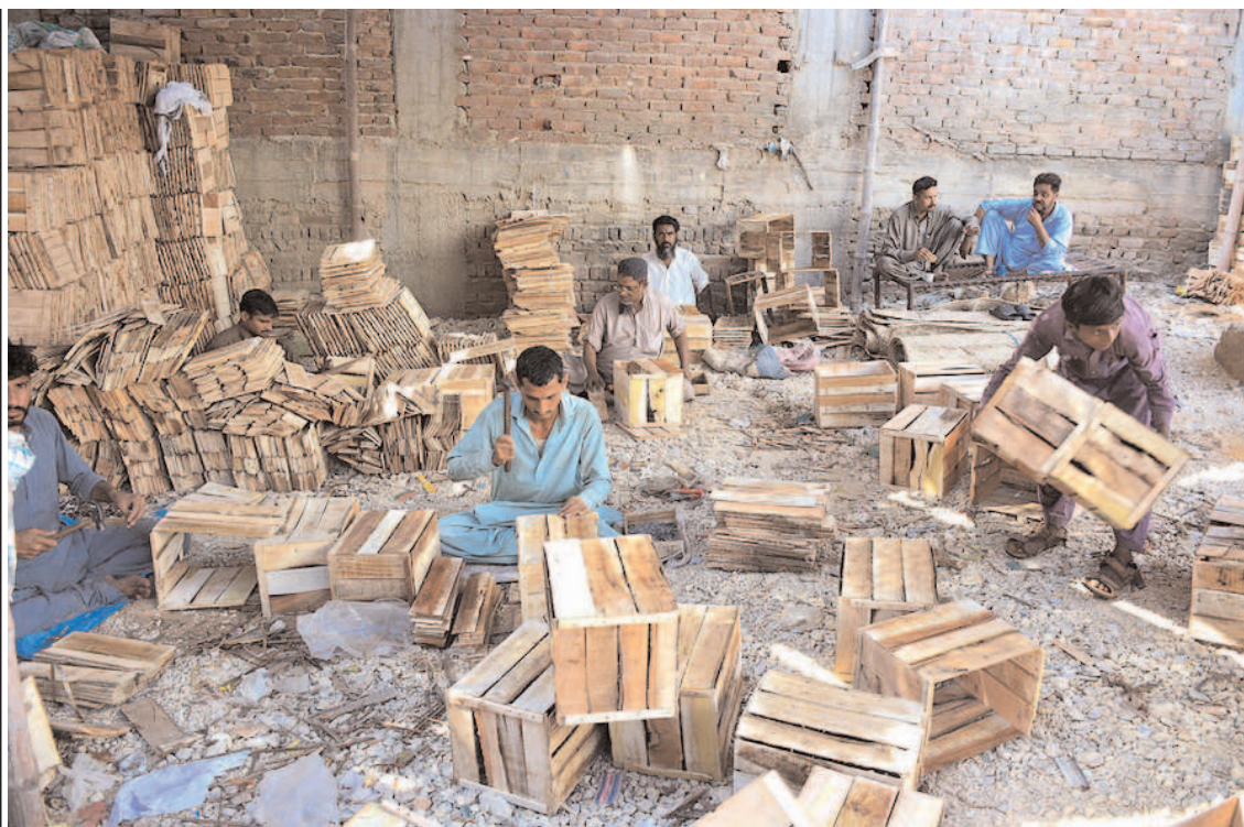
HYFERABAD: Workers busy in preparing wooden boxes at their workplace.