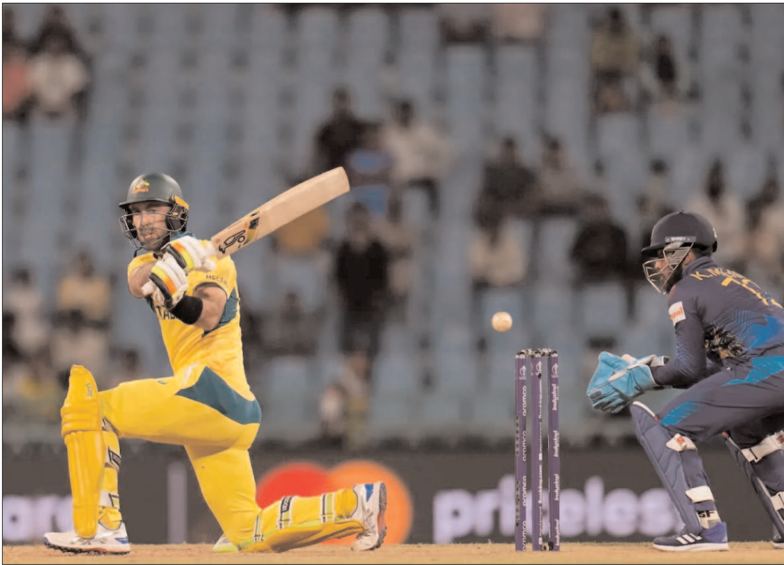
LUCKNOW: Glenn Maxwell took no time to take the attack to Sri Lanka.

TOKYO (AFP): Number three seed Alexander Zverev said he "played horrible" after crashing out in the first round of the Japan Open on Monday, losing to world number 60 Jordan Thompson. Germany's Zverev, ranked ninth in the world, lost 6-3, 6-4 in Tokyo, one week after falling at the first hurdle at the Shanghai Masters. Zverev, who won the Chengdu Open in China last month, said there was "nothing that I did well" after having his serve broken three times by Thompson.