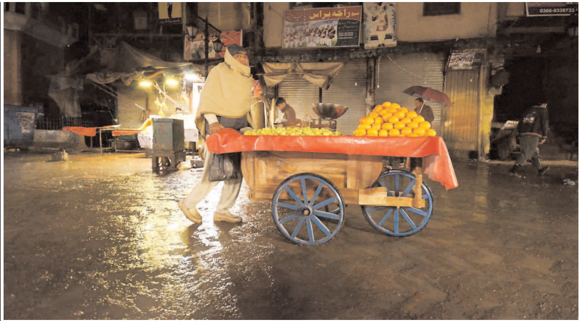
PESHAWAR: A vendor on way during rain in Provincial Capital.

If the provincial government cannot provide employment to the people, it should not make the employed people unemployed, they said and adding the officials of the Muslim Endowment department humiliated the businessmen under the guise of this black law and adopted a coercive way, then all the businessmen of the province and all the businessmen of Peshawar Cantt should join hands with the affected businessmen in all kinds of protests and other decisions against this cruel decision.