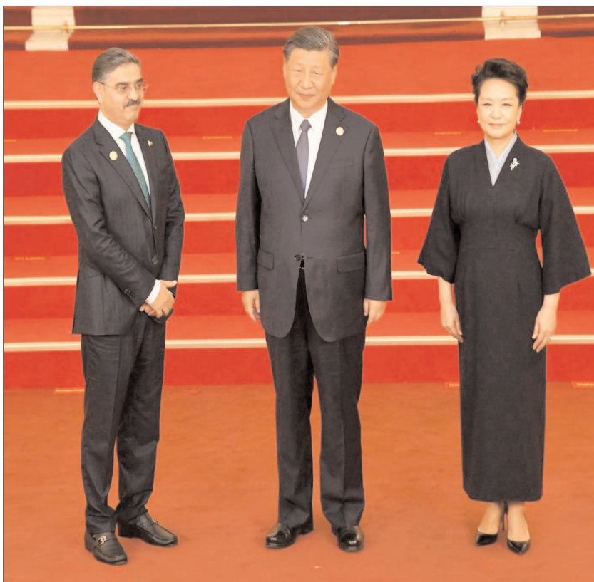
BEIJING: Chinese President Xi Jinping and First Lady, Madame Peng Liyuan welcomed Caretaker Prime Minister Anwaar-ul-Haq Kakar upon his arrival at Great Hall of the People.

The participants vowed to fully support the strategic initiatives planned by the Government of Pakistan for the revival of the economy by providing all possible support for the overall wellbeing of the people of Pakistan. Forum also took holistic review of the ongoing actions being taken against illegal economic activities. COAS emphasised "Pakistan Army will continue to provide all out support to the government and LEAs in taking strict lawful actions against illegal economic activities across the country. Actions against hoarding and smuggling mafias and cartels in different domains will be further strengthened in coming days to rid the country from negative impact of such ill practices". Forum resolved to fully support the Federal Government's decision to repatriate and deport all illegal foreigners from 1st November 2023 onwards. COAS directed all concerned to support and facilitate smooth, respectable and safe repatriation / deportation of all illegal foreigners.