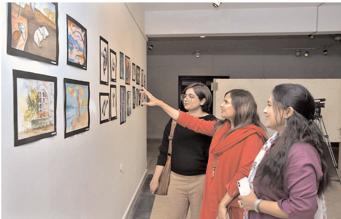
ISLAMABAD: Students of National College of Arts viewing the displayed artwork during an exhibition in the college.

Residents of Islamabad are encouraged to take advantage of this opportunity to get their vehicles registered, transferred, and have their token tax paid, as well as to avail of other services offered by the Facilitation Center Doorstep ICT Vehicle.