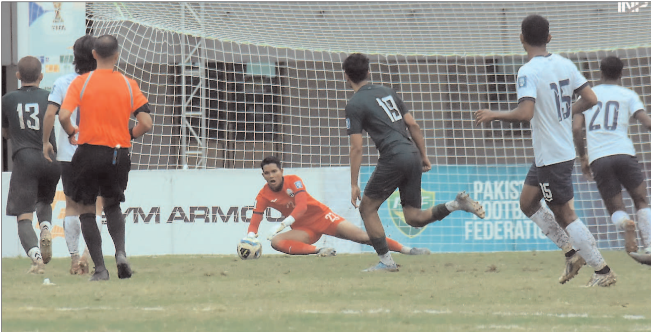
ISLAMABAD: A view of the football match between Pakistan and Cambodia of the FIFA World Cup 2026 qualifying match.

ISLAMABAD (Monitoring Desk): The Pakistan men's football team beat Cambodia 1-0 on Tuesday to win their first ever FIFA World Cup qualifier at the Jinnah Stadium in Islamabad,