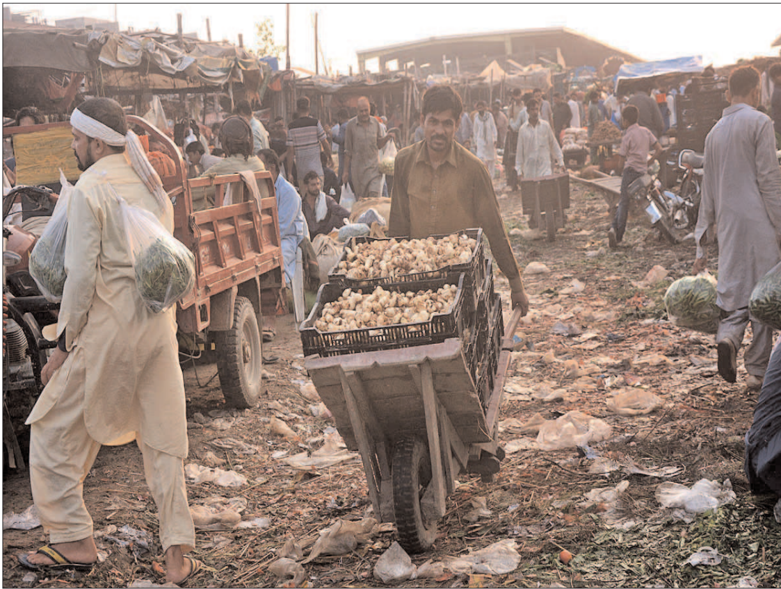
LAHORE: Labourers carrying vegetables on hand cart and deliver to Vegetable Market in the city.

The Chief Secretary also asked the deputy commissioners to notify the new slashed rates of food items and transport fares after consulting all the stakeholders. He said that the administrative officers have to work in a dynamic manner to control profiteering and hoarding. He mentioned that the Special Branch and Urban Unit would continue performing duties of monitoring price control.