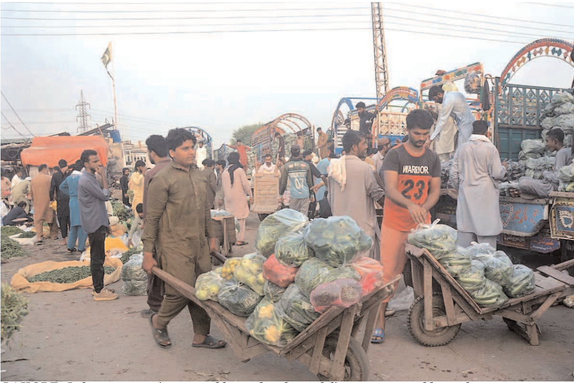
LAHORE: Labourers carrying vegetables on hand cart deliver to at vegetable market.