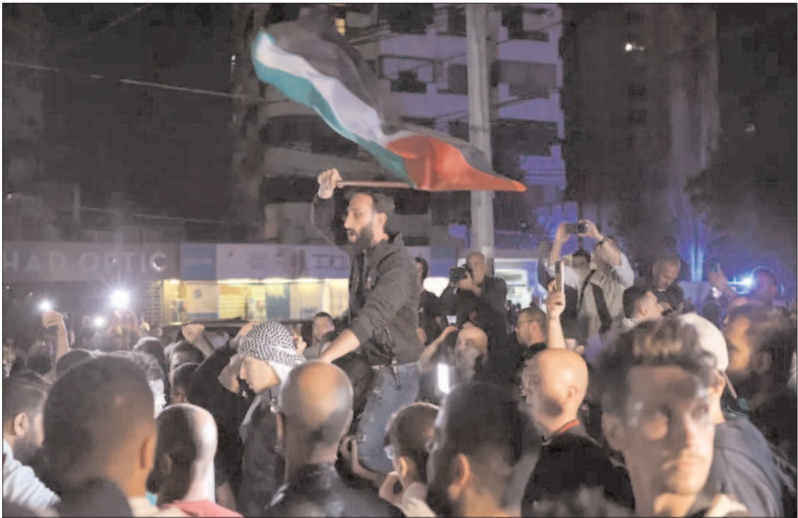
BEIRUT: Protesters waving Palestinian national flags and shout slogans in solidarity with the people of Gaza outside the US Embassy in Awkar, Lebanon.