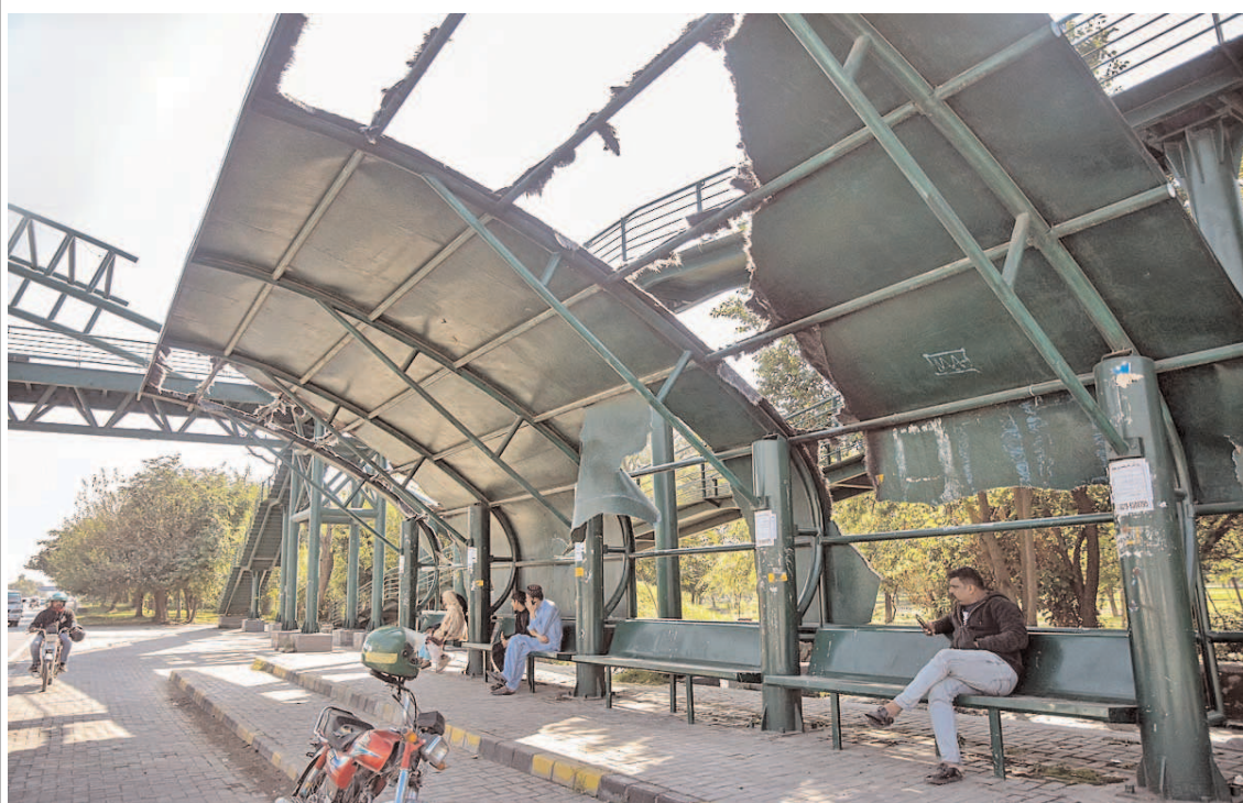
ISLAMABAD: A view of damaged bus stop shed at Islamabad Expressway needs the attention of concerned authorities.

He said a total of 51 Sweet Homes were situated throughout the country, with 11 in Islamabad and Azad Kashmir Region, 9 in Lahore, 5 in Multan, 3 in Gilgit-Baltistan, 11 in Sindh, 8 in KPK, and four in Balochistan. In these facilities, orphaned and homeless children are provided with a wide range of complementary services, including standard accommodation, meals, education, uniforms, books, medical care, skill development programs, laundry services, religious education, and counseling.