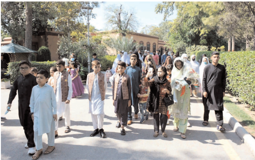
PESHAWAR: Thalassemia affected children and their parents visiting Governor's House.

been announced for special children in universities and steps would be taken for the facilitation of children suffering from thalassemia and other blood related disorders. He also underscored the need to establish separate playgrounds and recreational facilities of thalassemia affected children. The Governor appreciated efforts of Hamza Foundation to help out these children and also assured his cooperation to resolve problems faced by the foundation.