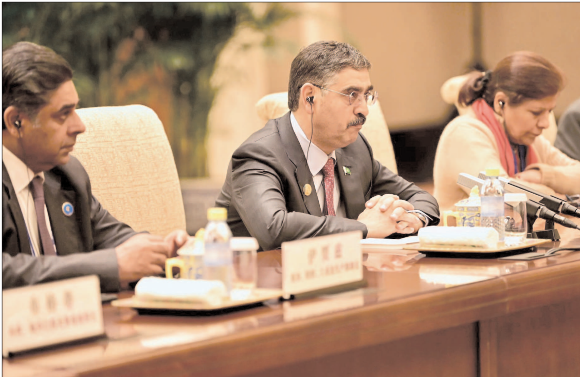
BEIJING: Caretaker Prime Minister Anwaar-ul-Haq Kakar and Chinese Premier Li Qiang met on the sidelines of 3rd Belt and Road Forum in China.