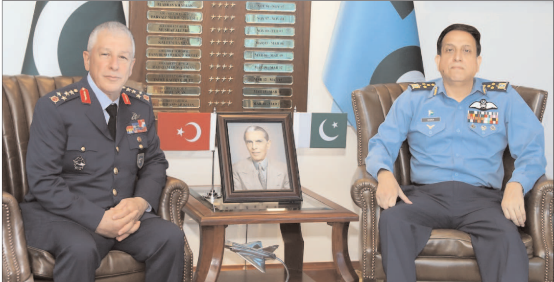
ISLAMABAD: General Ziya Cemal Kadiolu, Commander Turkish Air Force, called on Air Chief Marshal Zaheer Ahmed Baber Sidhu, Chief of the Air Staff, Pakistan Air Force.