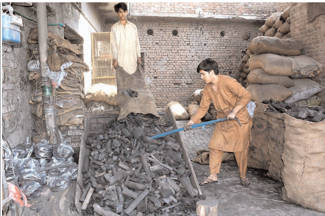
FAISALABAD: Vendors displaying coal to attract customers at their workplace as demand increased during winter season.

The price of 10 grams of 24 karat gold also increased