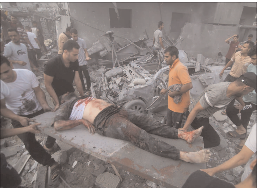
GAZA: People shifting an injured person to hospital after airstrikes of Israeli forces.

tional community is tantamount to help the killer. Discrimination between Muslim and Non-Muslim by the international community will lead world toward disaster, she said adding rubbles in Gaza are exposing the timidity of the international community. She urged the Muslim countries to play their moral, religious and legal role to bridle the Israel atrocities.