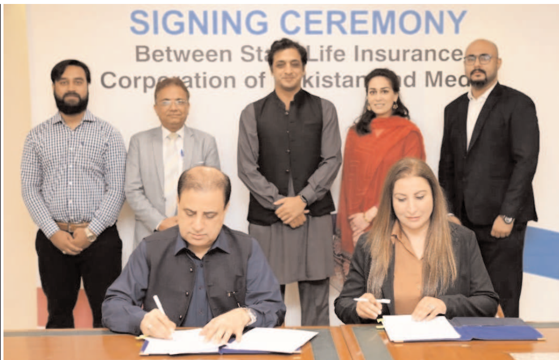
KARACHI: Representatives of State Life and MedIQ Smart Healthcare signing MOU during a ceremony.

The growing debt stock carries significant fiscal costs and exposes the country to debt vulnerabilities, as highlighted in the Pakistan Development Update report by the World Bank. He also emphasised that persistent fiscal deficits and debt repayments have resulted in consistently high annual gross financing needs, averaging 27% of GDP over the past decade. This level is notably higher than the emerging market threshold of 15%.