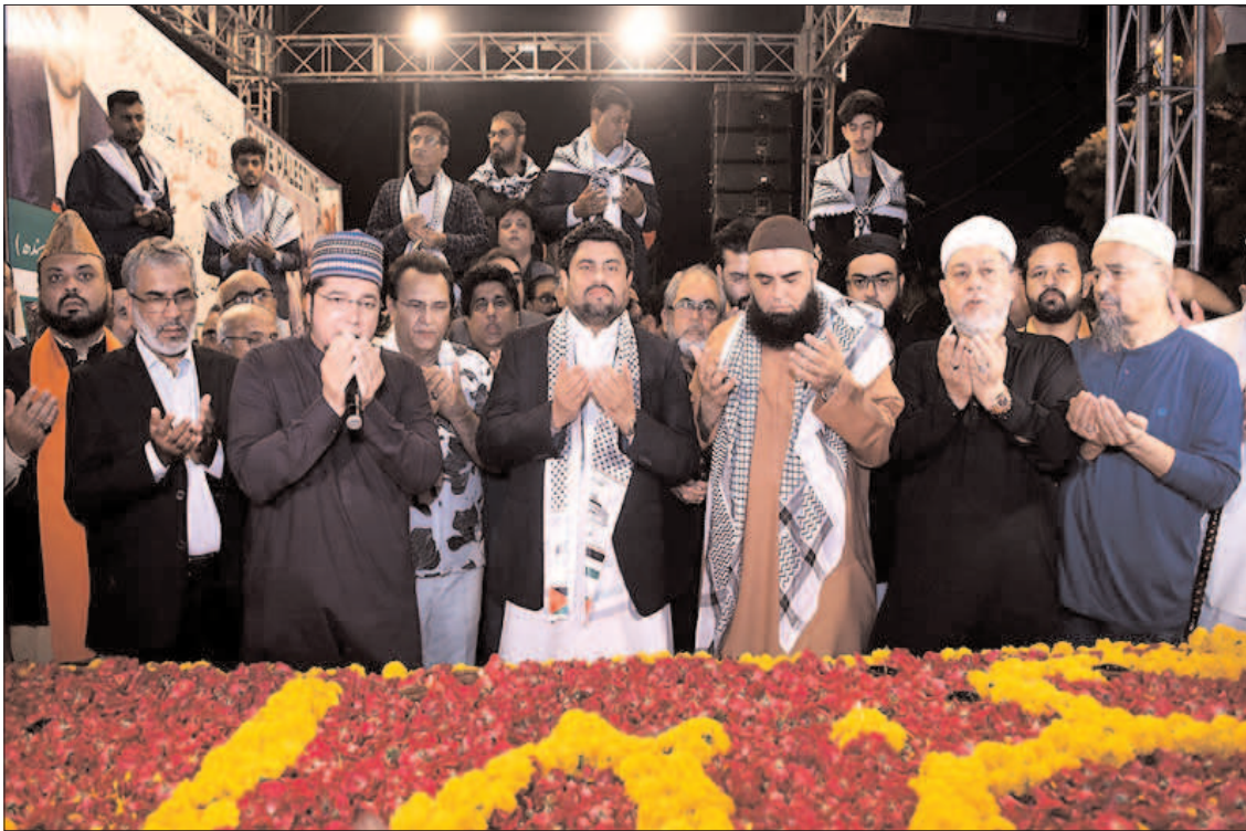
KARACHI: Sindh Governor Kamran Tessori and others offering dua in memory of Palestinians martyred in Israeli attacks at Governor House.