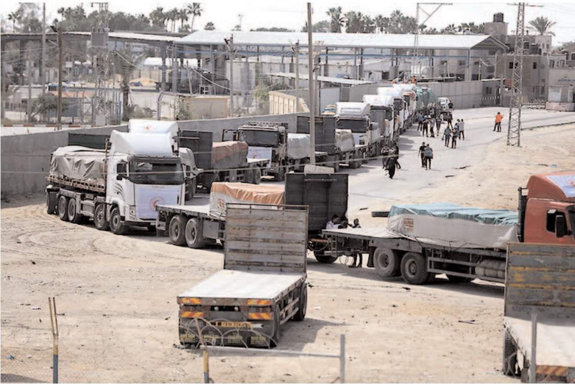
RAFAH: Truck aid convoy entering Gaza crossing Rafah border.

“The vision presented by Nawaz Sharif for the future is the roadmap for Pakistan. The entire nation is united now. Nawaz Sharif should be supported so that Pakistan could be taken out of the economic crisis,” he said.