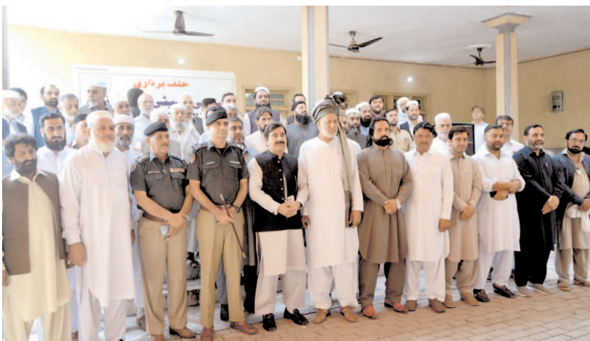
PESHAWAR: A group photo of Islahi Committee Mosa Zai after taking oath during a ceremony.

overcharging passengers. Authorities are now instructed to perform daily inspections at transport bases and bus terminals, scrutinizing fare collection from passengers. Drivers engaged in overcharging will face route permit suspension, and vehicle owners will be subjected to fines. Emphasizing the caretaker provincial government's commitment to extending the benefits of reduced fuel prices to the public, Zafarullah Khan Umarzai stressed that there should be no leniency in dealing with those who charge excessive fares; they must be met with strong measures.