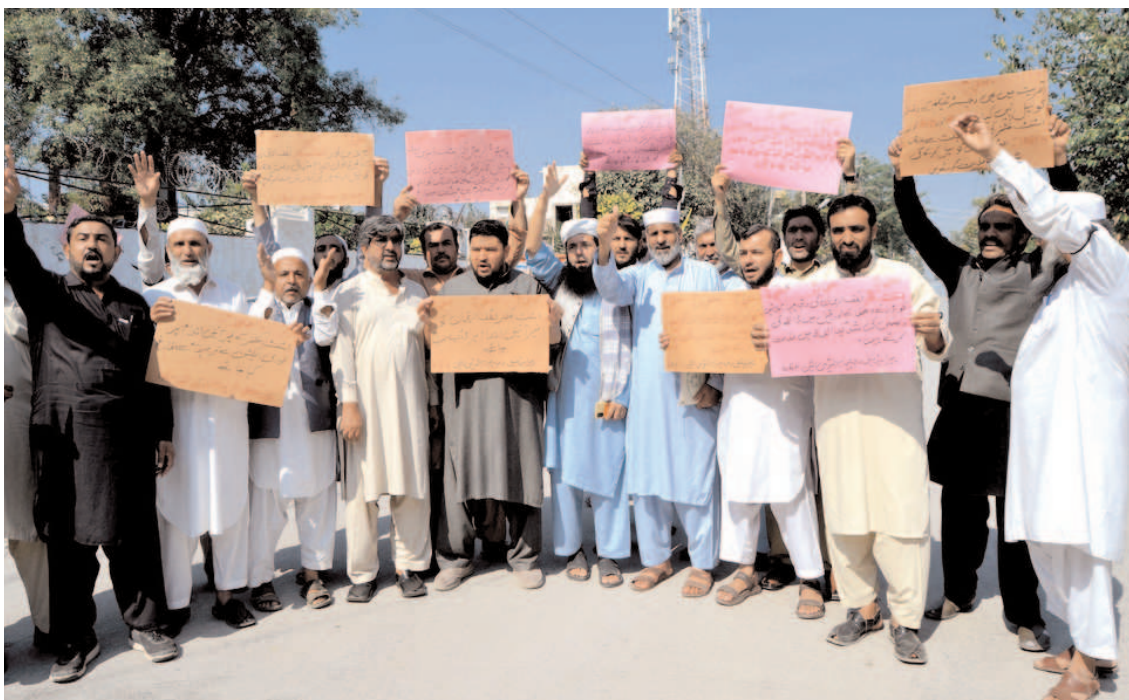
PESHAWAR: Employees of Lady Reading Hospital holds placards and chanting slogans during a protest in favour of their rights.