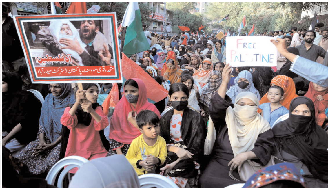
HYDERABAD: Women hold banners and placards during a rally against Israeli aggression in Palestine.

Islamist group that has ruled Gaza since 2007. "From today, we are increasing the strikes and minimising the danger," an Israeli military spokesman said late Saturday. "We will increase the attacks and therefore I call on Gaza City residents to continue moving south for their safety." Israel has repeatedly urged Gaza's 1.1 million residents of the north to move south ahead of any ground operation. As strikes pummeled the strip, the Hamas government also hit out at the lack of aid, despite the arrival of 37 trucks on Saturday and Sunday. It said there were now 1.4 million displaced people within the enclave. "The aid that arrived in Gaza is not enough for one day. We call on the international community to pressure the Israeli government to bring in thousands of trucks," Hamas said in a statement.