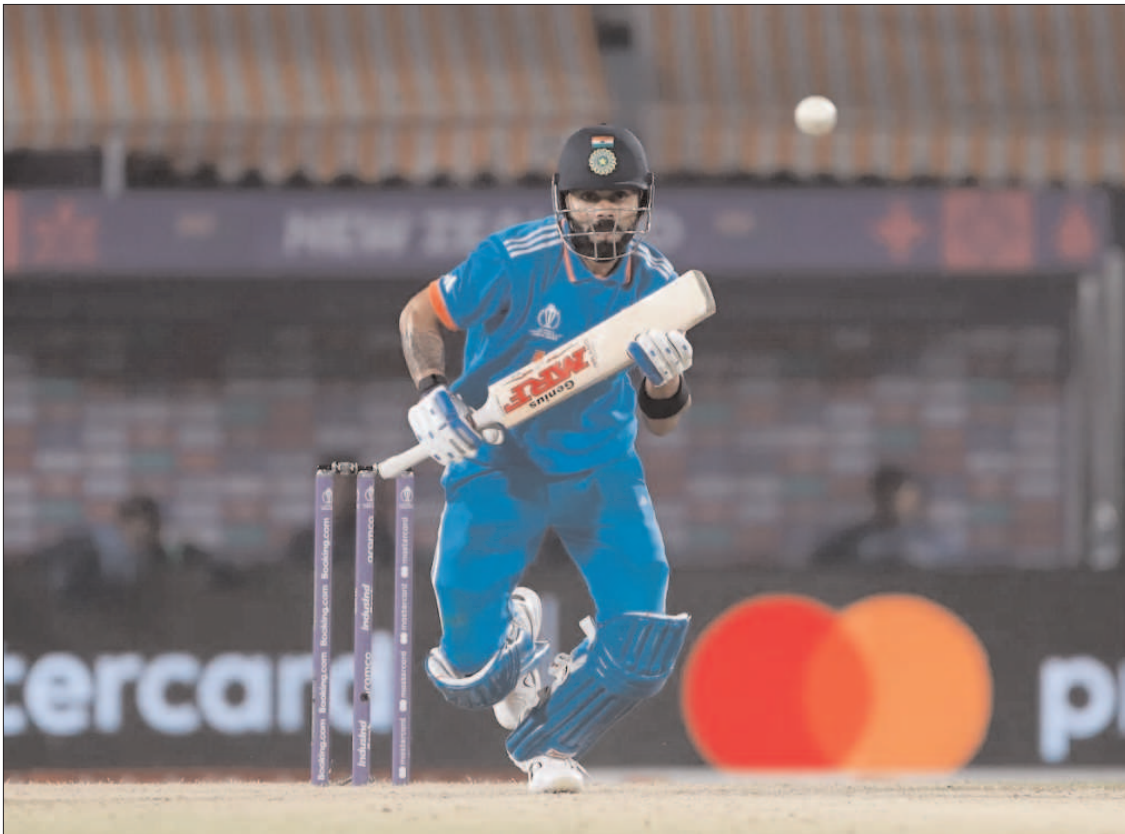
DHARAMSALA: Virat Kohli was in midst of another tense ODI chase.