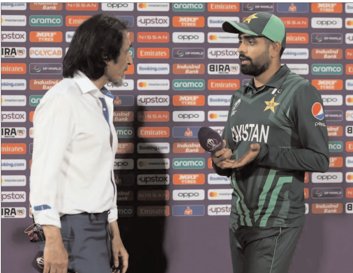
CHENNAI: Ramiz Raja has a word with Babar Azam after Pakistan's loss to Afghanistan.

NEW DELHI (Agencies): Indian cricket great Bishan Singh Bedi breathed his last at the age of 77 on Monday. Bishan Singh Bedi was a left-arm spinner who also captained the Indian team in 22 matches. Bedi was an active cricketer from 1967 to 1979, featuring for India in 67 Tests, taking 266 wickets at an average of 28.71 with 14 five-wicket hauls. Bedi also played for India in 10 ODIs, bagging a total of seven wickets. Widely considered as one of the finest spinners India have had, Bedi was among the architects of India's spin bowling revolution. He, along with Erapalli Prasanna, BS Chandrasekhar, and S. Venkataraghavan, played an important role in India's first-ever ODI victory. Bedi's figures of 12-8-6-1 held East Africa to 120 runs in 1975 World Cup. In domestic cricket, Bedi primarily played for the Delhi team. After retirement, he worked as a coach and mentor for several budding Indian cricketers. Away from the cricketing field, he also worked as a commentator and pundit in the Gentleman's Game.