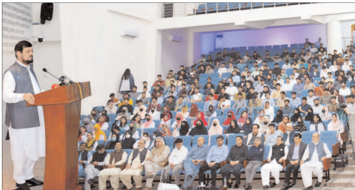
PESHAWAR: Governor Khyber Pakhtunkhwa Ghulam Ali addressing a laptop distribution ceremony at IM Sciences Hayatabad.