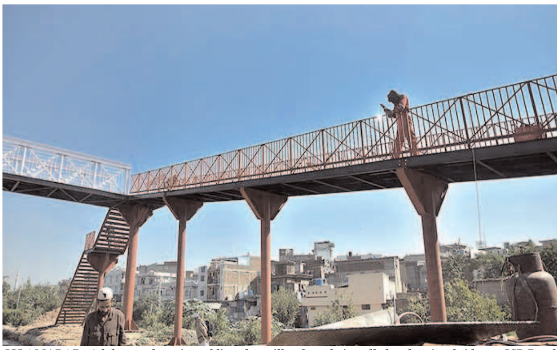
ISLAMABAD: A labourer busy in welding the grills of newly installed pedestrian bridge at IJP Road.

The authorities have assured that such initiatives will continue to be rigorously enforced to uphold the rights and interests of the commuters and residents in Islamabad.