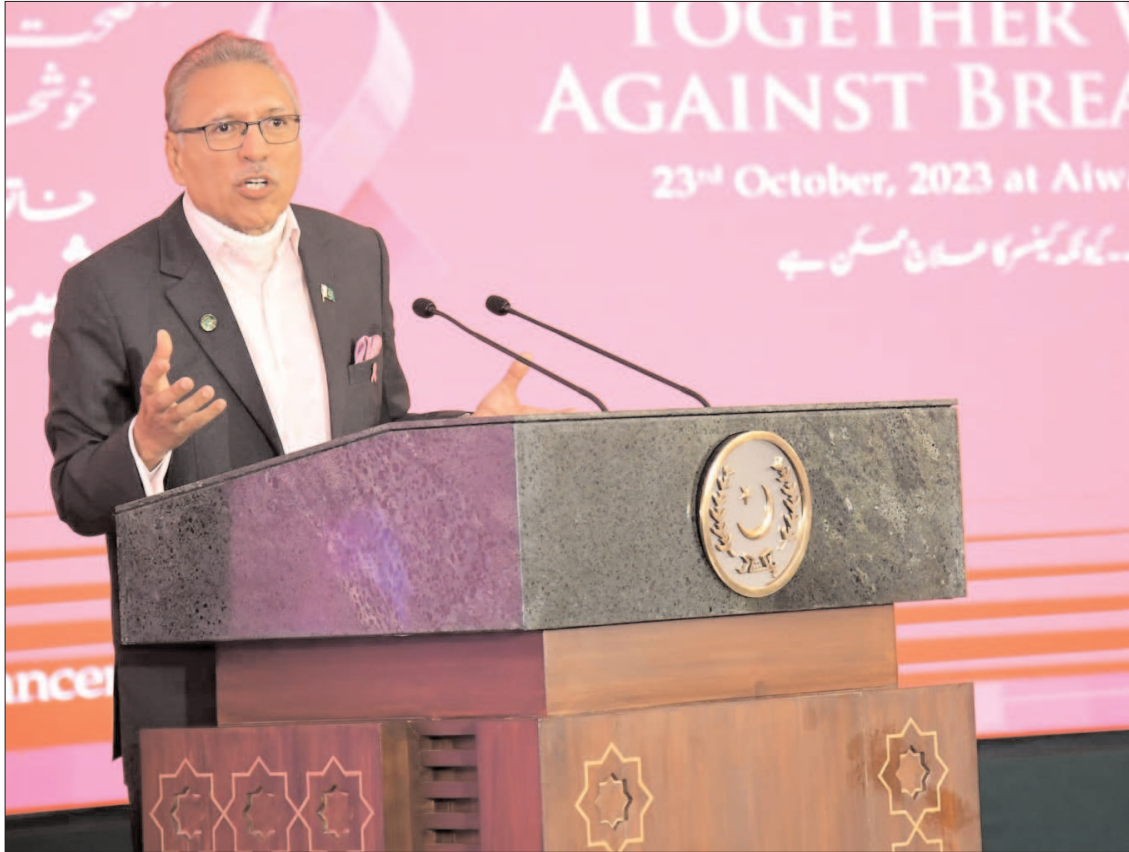
ISLAMABAD: President Dr. Arif Alvi addressing a ‘Breast Cancer Awareness’ program, at Aiwan-e-Sadr.

He mentioned that Pakistan was fully supportive of the principles of ASEAN and was collaborating in a number of areas, including conducting courses on finance and banking.