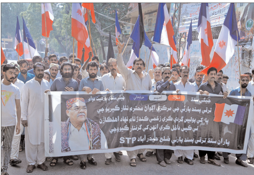
HYDERABAD Workers of Sindh Tarraqi Passand Party holding a protest in favour of their demands.

Real estate has a profound impact on the economic landscape of Pakistan. The Mayor underscored the correlation between the construction of commercial towers and the growth of various industries, which, in turn, contribute to the overall economic progress. He highlighted the potential of such projects to invigorate economic activities, drive investments, and generate