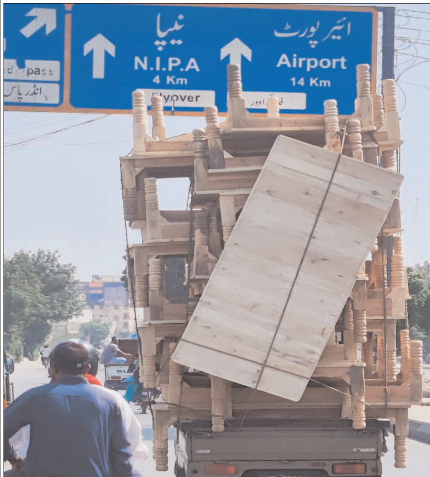
KARACHI: A view of overloaded vehicle on the way in provincial capital.