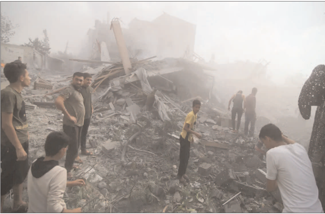
GAZA: Palestinians look for survivors in buildings destroyed in an Israeli air strike in Rafah.