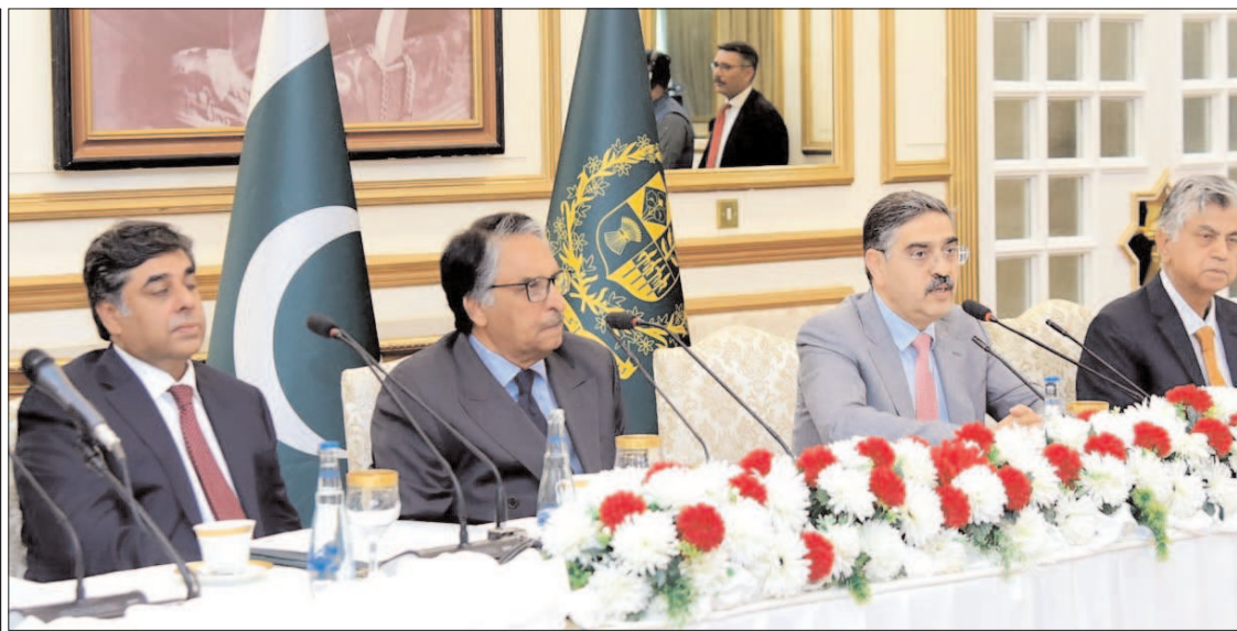
ISLAMABAD: Caretaker Prime Minister Anwaar-ul-Haq Kakar addressing a press conference.

However, in the last hearing on August 3, the then-chief justice Umar Ata Bandial said the apex court would stop the country's army from resorting to any unconstitutional moves while hearing the pleas challenging the trial of civilians in military courts. A six-member bench, led by the CJP and comprising Justice Ijaz Ul Ahsan, Justice Munib Akhtar, Justice Yahya Afridi, Justice Sayyed Mazahar Ali Akbar Naqvi, and Justice Ayesha Malik, heard the case. In the last hearing, the case was adjourned indefinitely after the Attorney General for Pakistan (AGP) Mansoor Usman Awan assured the then CJP that the military trials would not proceed without informing the apex court.