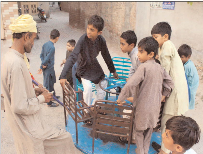
FAISALABAD: Children enjoying swings at Muhammadabad area.

The speakers said that 65 percent of the total population in the country was constituted by youth which were supposed to bring a real change but they had been misguided through mere slogans. They said that it was the JI that could provide the best opportunity to the youth force. They asked the participants to strengthen the JI and join hands with it for a bright future of the country and the nation.