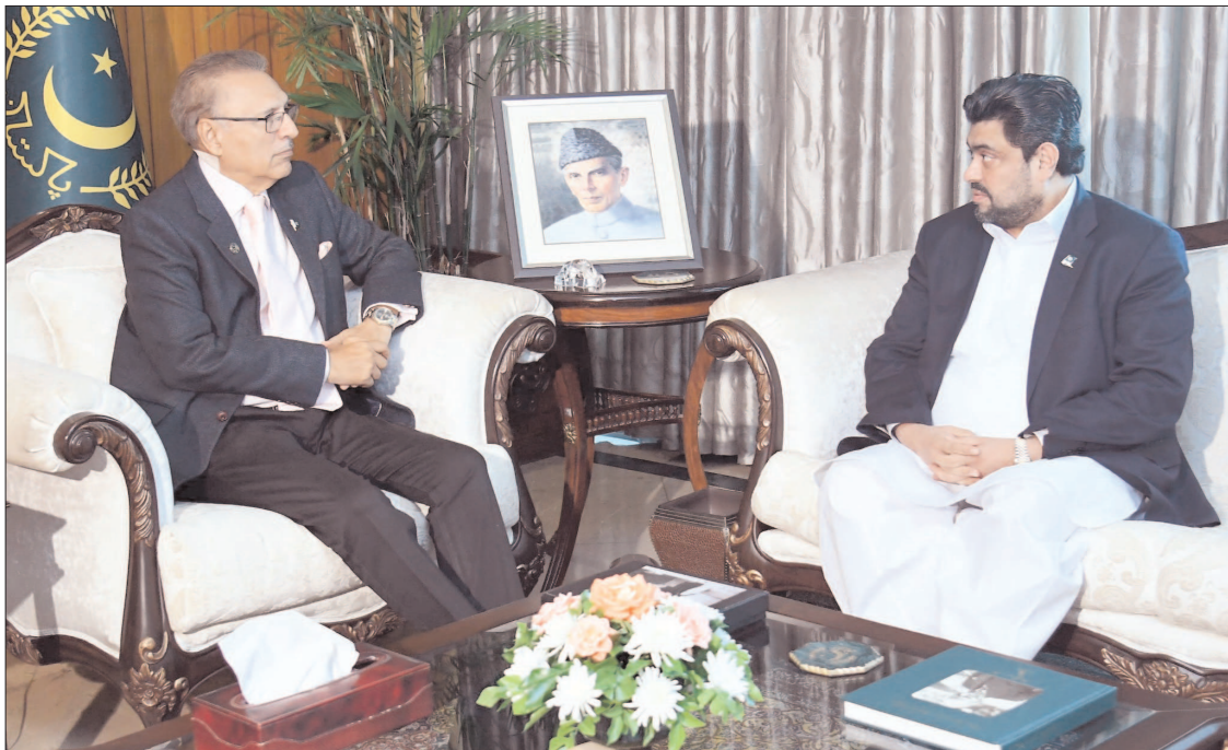
ISLAMABAD: Governor Sindh, Muhammad Kamran Khan Tessori, called on President Dr Arif Alvi, at Aiwan-e-Sadr.

The foreign secretary briefed the Islamabad-based diplomatic missions on the situation in IIOJK. He also highlighted the legal, security and human rights dimensions of the Kashmir dispute.