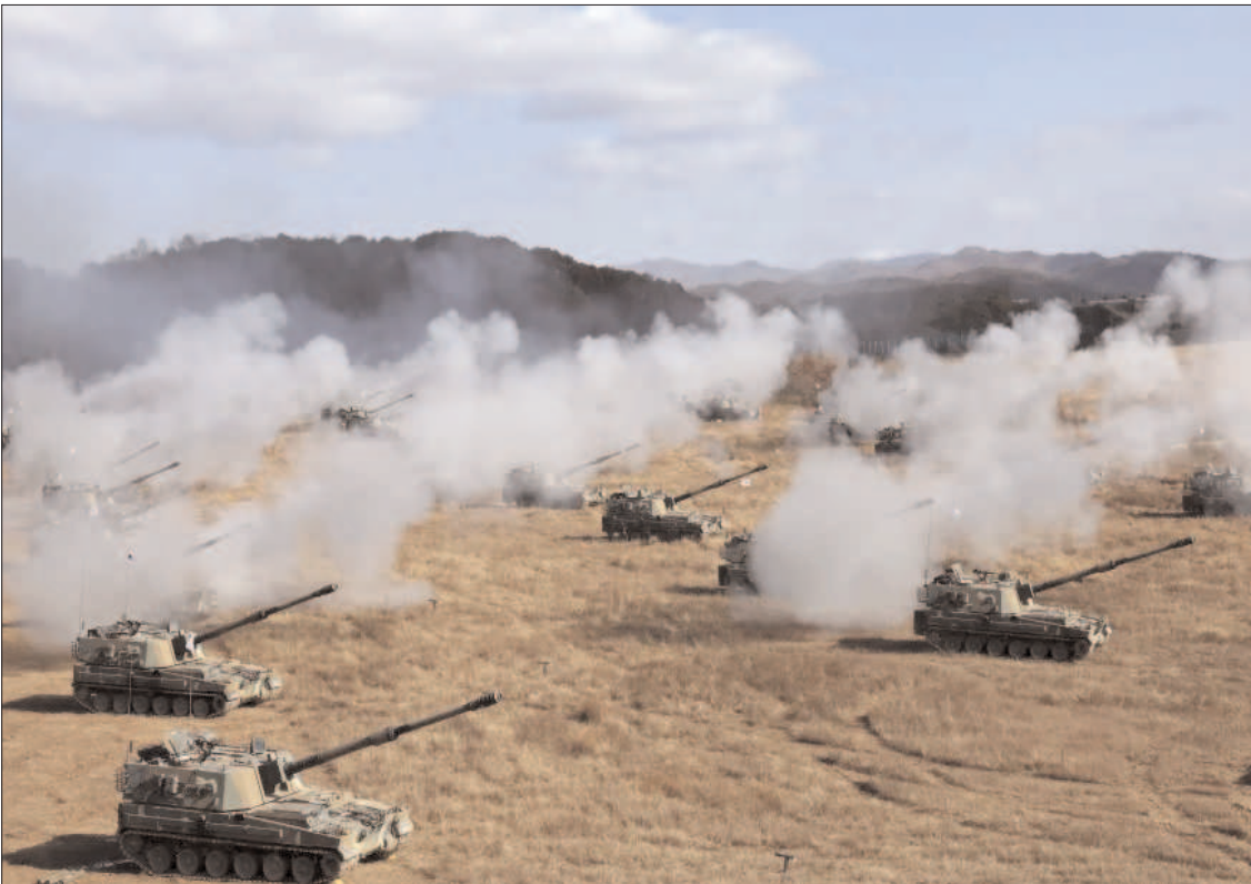
SEOUL: South Korean army K-9 self-propelled howitzers and K-55A1 self-propelled howitzers fire during the military drills at a training field in Cheorwon, South Korea.