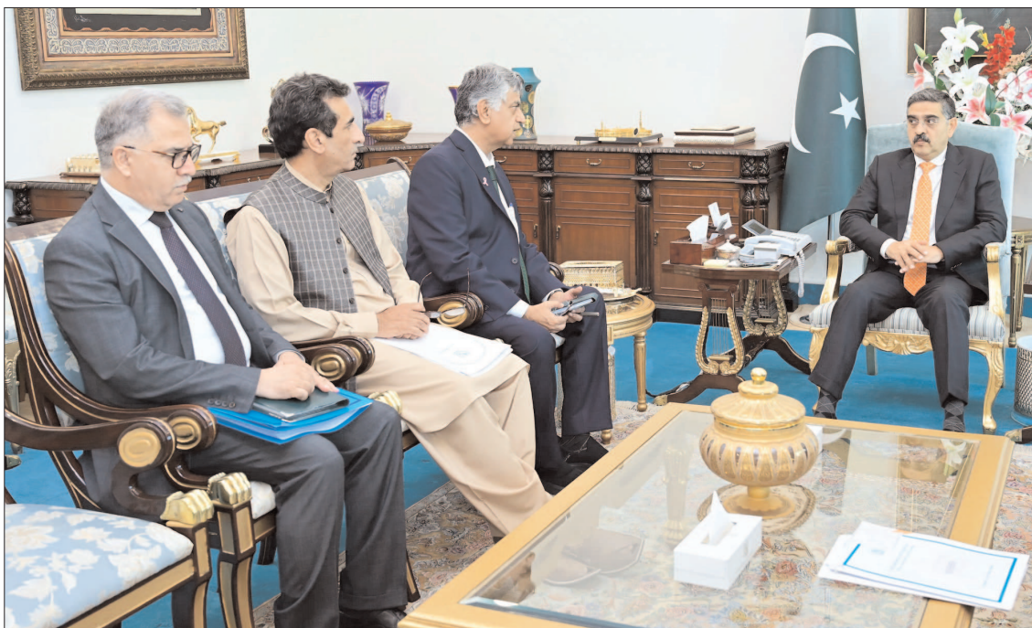
ISLAMABAD: Caretaker Federal Minister for Information and Broadcasting Murtaza Solangi called on Caretaker Prime Minister Anwaar-ul-Haq Kakar.