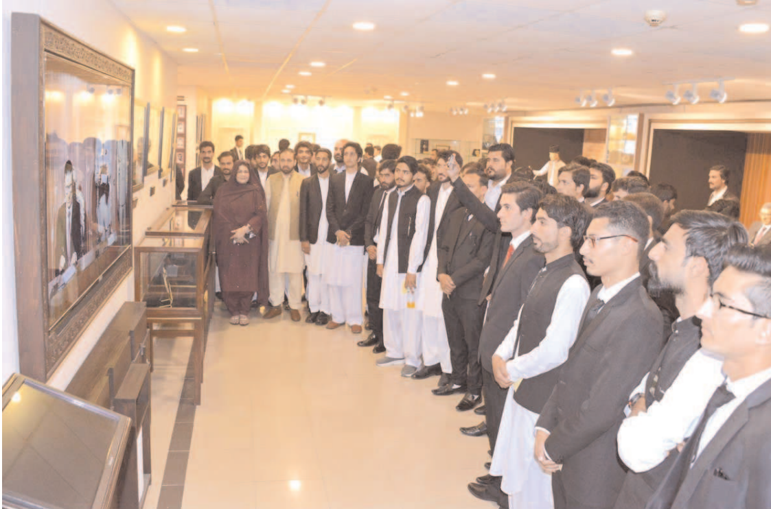
ISLAMABAD: Students and faculty members of the Shaheed Benazir Bhutto University (SBBU) Sheringal, Upper Dir visiting Senate Museum at Parliament House.