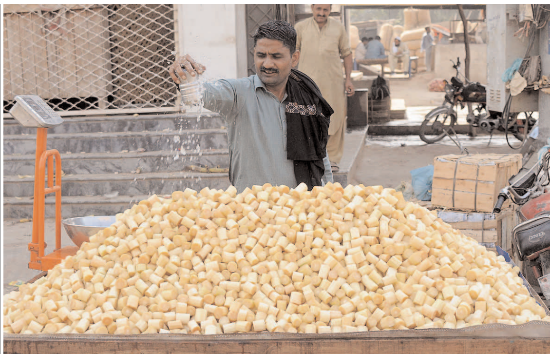
MULTAN: A vendor is busy sprinkling water on the pieces of sugarcane to keep them fresh at his handcart.

With pride, we note that HBFC has helped more than 480,000 families realize their dreams of homeownership, leading to enhanced financial security, elevated living standards, and increased social inclusion. This commitment to empowering individuals and families in Pakistan through affordable housing solutions remains at the heart of what we do.