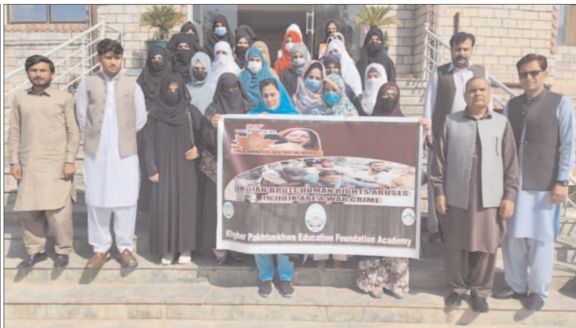
PESHAWAR: Participants holding placards to show solidarity with Kashmiri people on the occasion of 'Kashmir Black Day' during a protest.

When he was asked that his elder brother Prince Iftharuddin is in the Pakistan Muslim League-N and he was elected as a member of the National Assembly using the card of Pervaz Musharraf, then it will not create any controversy for him, which he denied.