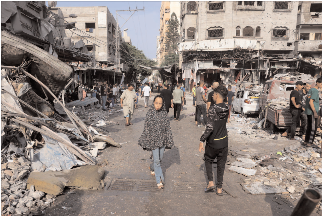
GAZA CITY: A young girl walks amid the destruction following Israeli attacks on al-Shatee camp.