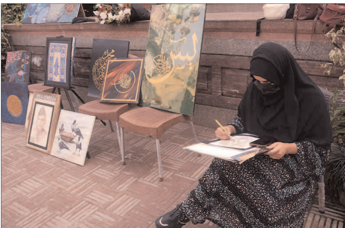
LAHORE: Student giving final touch to her painting during Painting and Calligraphy Exhibition organized by Formanite School System at Wazir Khan square inside Delhi gate.

H.R Department: College of Physicians & Surgeons Pakistan, 7th Central Street, D.H.A Phase II, Karachi. or E-mail: jobs@cpsp.edu.pk