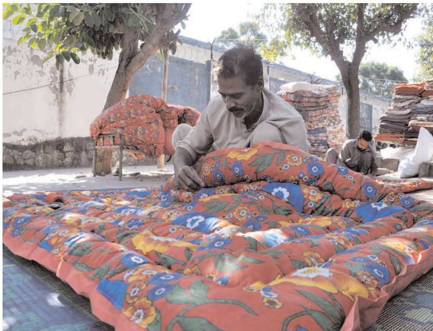
ISLAMABAD: Worker busy in stitching cozy quilts for upcoming winter season at their workplace.

At the end of the event, the minister also presented prizes to the best chefs, reinforcing the government's appreciation for their contribution to the culinary landscape and tourism industry.