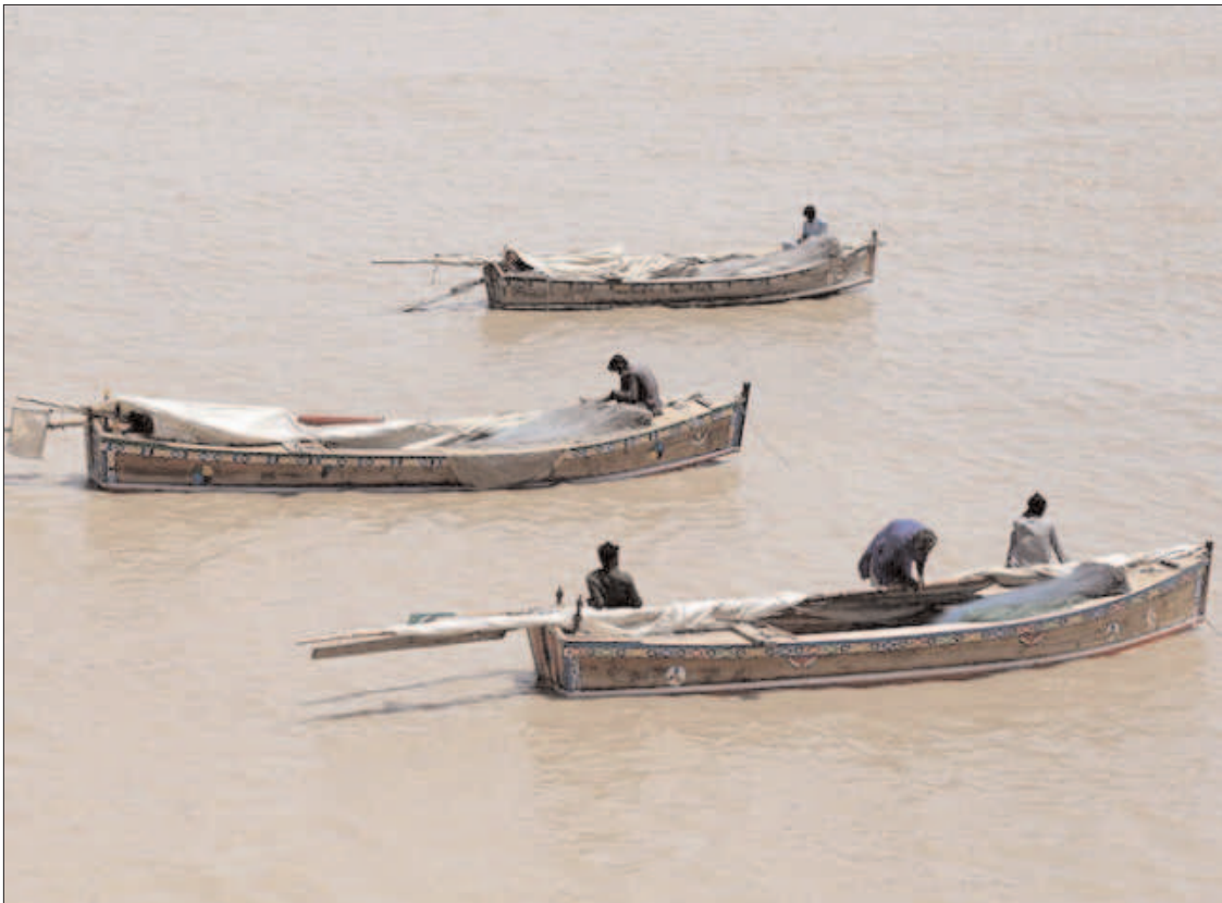
HYDERABAD: Fishermen preparing net for catching fishes at Indus river.