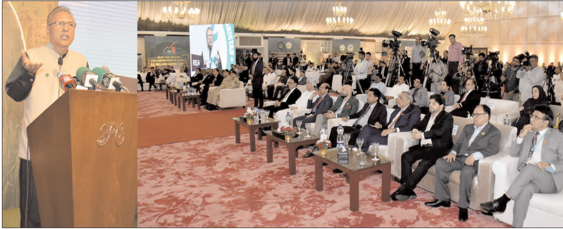
KARACHI: President Dr. Arif Alvi addressing the gathering at REAP's Export Trophy ceremony.