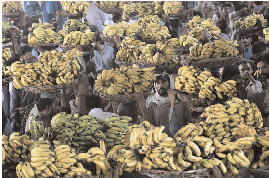
LAHORE: Labourers carrying baskets of bananas on their head during auctions as shopkeepers participating in bidding of fruit (Banana) at Fruit Market.

The chamber president requested trade bodies and associations to present proposals in written form to the chamber so as to resolve the issues in light of these recommendations through relevant authorities.