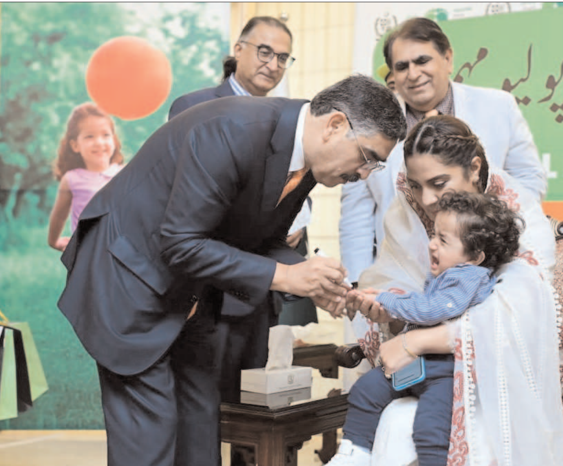
ISLAMABAD: Caretaker Prime Minister Anwaar-ul-Haq Kakar launching national polio eradication campaign by administering polio drops to a child.