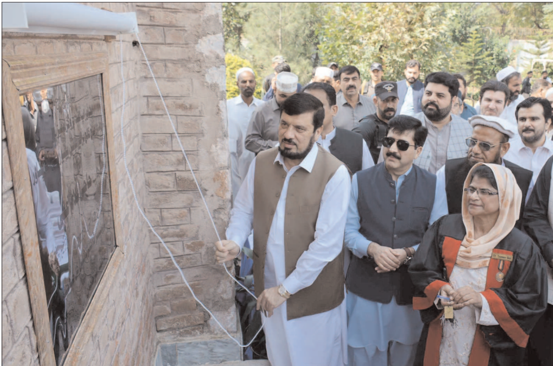
PESHAWAR: Governor Ghulam Ali inaugurated the recently completion of work under Uplift program in Jinnah College for Women Peshawar.