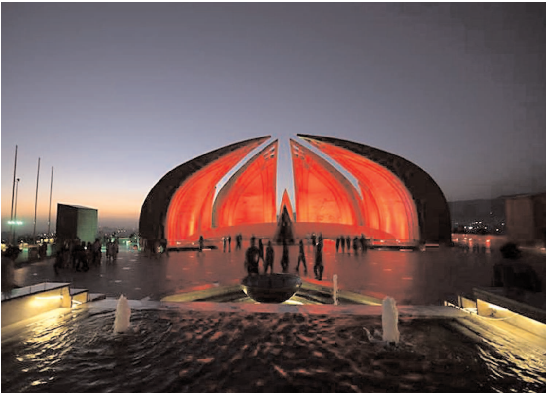
ISLAMABAD: People visited a national monument which was turned red to celebrate 74th National Day of China.

RAWALPINDI (APP): City Traffic Police (CTP) Rawalpindi issued 54,330 challans to violators last month while 2,340 vehicles and motorcycles were impounded in different police stations due to incomplete documents. According to a CTP spokesman, the motorcyclists were at the top of breaking the rules, some 24,680 motorcyclists were issued challans. In addition, 12,281 vehicles were issued challan tickets while action was taken against 17,369 other commercial vehicles. Chief Traffic Officer (CTO) Rawalpindi Taimoor Khan said that CTP trying its best to make Rawalpindi district road accident-free and making further improvements to ensure smooth traffic. Khan dispelled the impression that traffic wardens were given a target of issuing challans and he said that challans are issued only for the correction of citizens so that they can protect themselves and other road users from road accidents. The traffic education unit is engaged in providing awareness to the citizens on the highways about the traffic rules on a daily basis besides educating in schools and colleges.