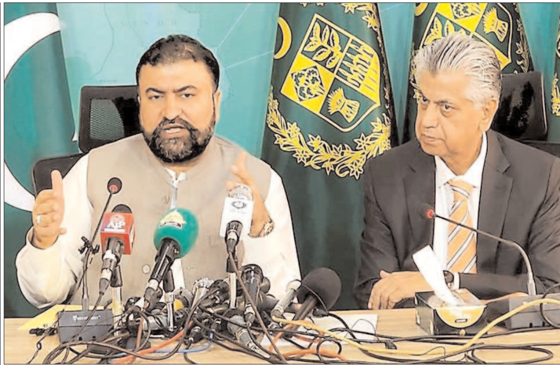
ISLAMABAD: Caretaker Interior Minister Sarfaraz Bugti along with Caretaker Federal Minister for Information and Broadcasting Murtaza Solangi addressing a press conference.

Stressing the need of removing the misperceptions of some people about polio drops, Azam Khan termed the role of religious scholars (Ulamas) as of vital importance, and suggested to develop a well-devised strategy to engage local Ulemas to educate the people so that the polio program could be made more effective and result-oriented.