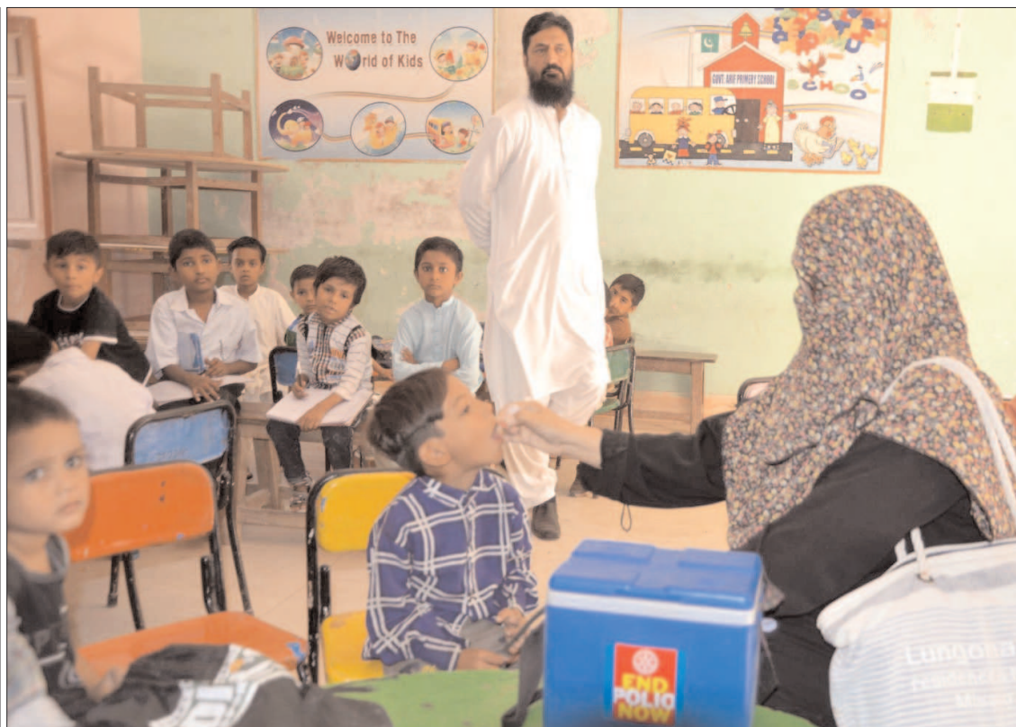
HYDERABAD: A health worker administering anti-polio vaccine to a child during Polio Free Pakistan campaign.

Which is admirable and admirable. The government should solve the problems and problems of the construction companies engaged in the construction work, who have made the project four moons with their efforts day and night.