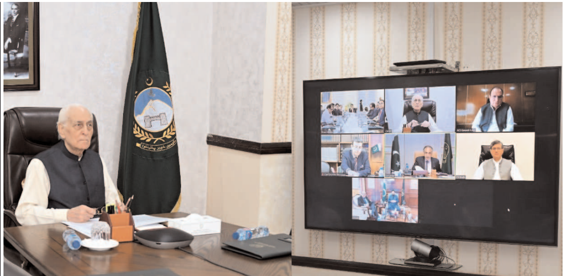
PESHAWAR: Caretaker Chief Minister Khyber Pakhtunkhwa Muhammad Azam Khan via video link attending a meeting of National Task Force on Polio Eradication held under chair of Caretaker Prime Minister Anwarul Haq Kakar.

This exposition is poised to meet the long-standing demand of manufacturers for a professionally managed B2B and B2C exhibition, facilitating interactions and transactions between domestic and international attendees and leading global agricultural and livestock technology companies.