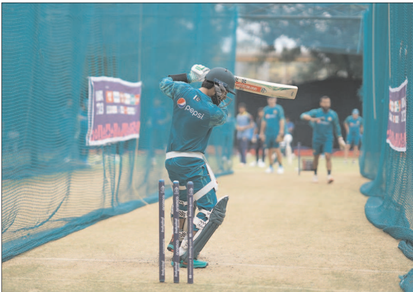
HYDERABAD: Skipper Babar Azam plays a shot during a practice session ahead of the Pakistan cricket team's second warm-up match against Australia.

The Tunisian, who is looking to qualify for the season-ending WTA Finals, plays Marta Kostyuk in the second round.