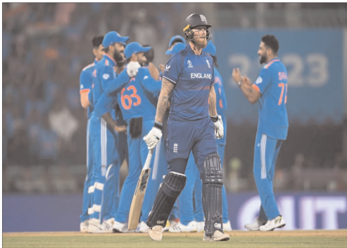
LUCKNOW: Ben Stokes ran out of patience against a searing Mohammed Shami.

Kolbe's ambitious 50-metre drop-goal -- one of four increasingly desperate Bok attempts -- fell well short as both sides looked for an opening to close down the game. The winger was then shown yellow for a deliberate knock-down of an Anton Lienert-Brown pass which meant the two teams would finish with 14 players.