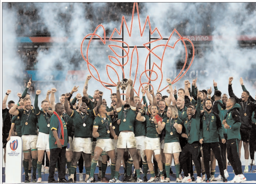
Record-breakers: Dominant South Africa are the first team ever to win the Rugby World Cup four times.