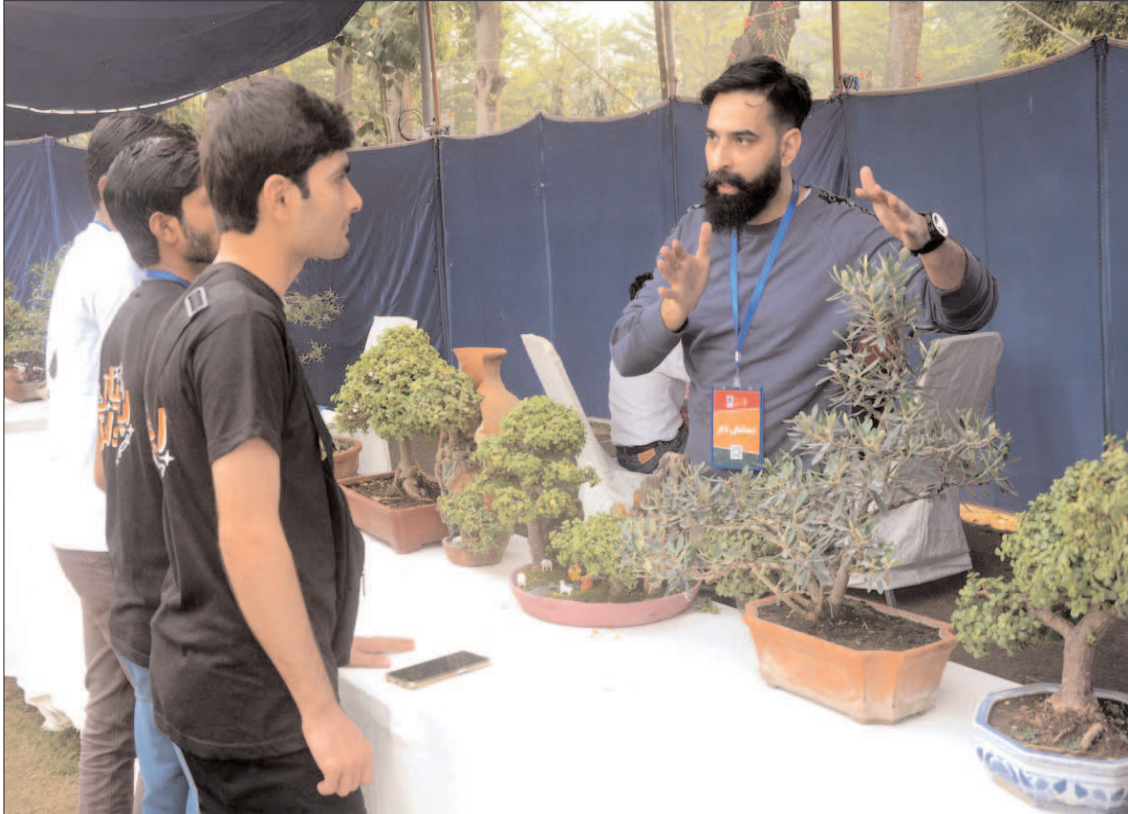
LAHORE: Students visit different stalls displayed during the Science Exhibition 2023 by Khwarizmi Science Society at Crescent School.

So this goes to all who think they have the talent to sing on the big stage. This year, Lok Mela 2023 will also bring an opportunity for talented singers to showcase their voices at the Open Mic programme that will be held daily at the Anarkali Facade during the festival. Lok Mela is not only featuring artists and artisans from all provinces of Pakistan, but this year, the long-lost elements of its mela, the Folk Theatre and Putli Tamasha, will be revived.