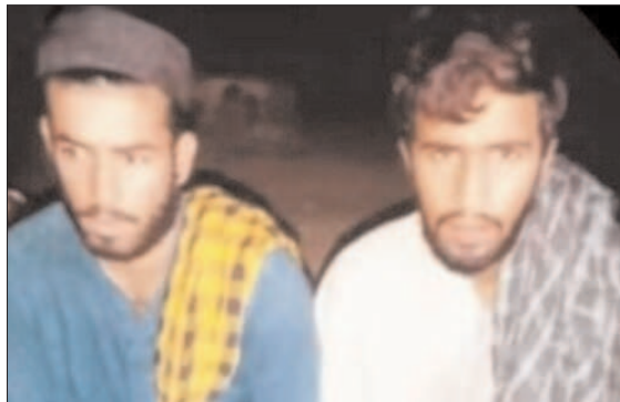
The footballers were whisked away when they were travelling from Dera Bugti to Sibbi.