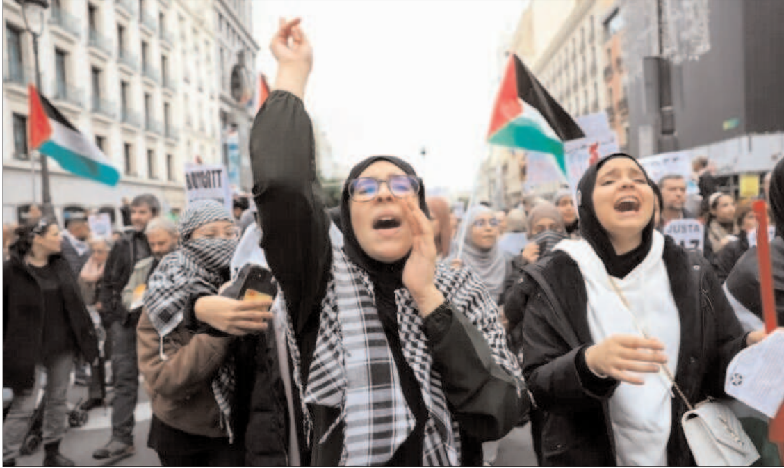
MADRID: Thousands took to the streets in Madrid in solidarity with Palestinians.

"Take them, we don't need them here," she said. "I want my family and all the hostages to come back home." The ground operations have heightened fears that Israel's other enemies -- the Iran-allied "axis of resistance" forces in Lebanon, Syria, Iraq and Yemen -- enter the conflict.