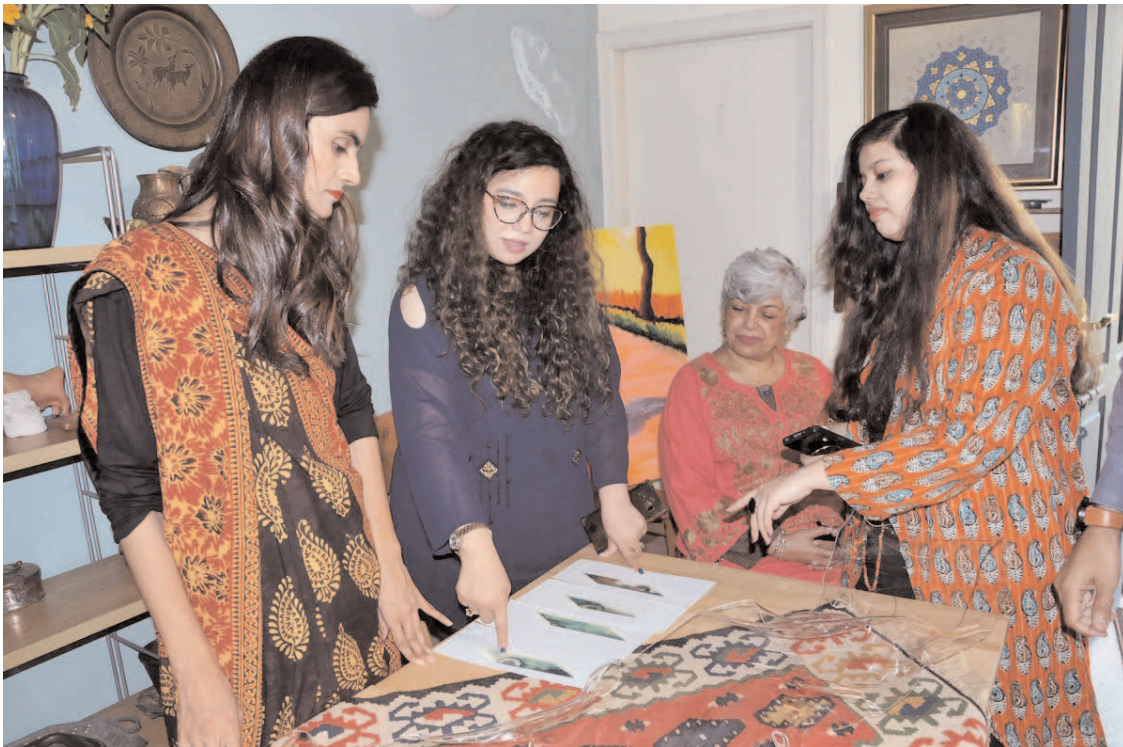
ISLAMABAD: Artists from diverse backgrounds were invited at the Off-Grid Residency where they can work without the usual distractions and pressures of daily life.

ISLAMABAD (APP): Indus River System Authority (IRSA) on Sunday released 102,200 cusecs water from various rim stations with inflow of 59,700 cusecs. According to the data released by IRSA, the water level in River Indus at Tarbela Dam was 1526.30 feet and was 128.30 feet higher than its dead level of 1,398 feet. The water inflow and outflow in the dam was recorded as 31,000 cusecs and 52,000 cusecs respectively. The water level in River Jhelum at Mangla Dam was 1205.00 feet, which was 155.00 feet higher than its dead level of 1,050 feet. The inflow and outflow of water was recorded 8,500 cusecs and 30,000 cusecs respectively. The release of water at Kalabagh, Taunsa, Guddu and Sukkur was recorded as 48,800, 44,000, 45,900 and 14,400 cusecs respectively.