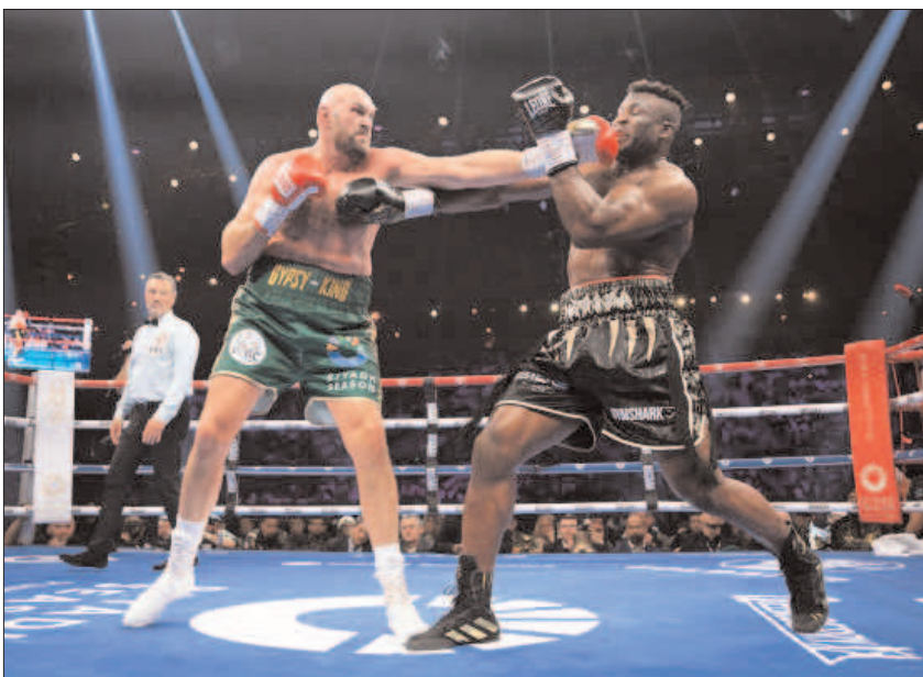
RIYADH: Tyson Fury punches Francis Ngannou during the Heavyweight fight between Tyson Fury and Francis Ngannou at Boulevard Hall.

England had put in their best performance in India so far - eight days after conceding 399 against South Africa, their most expensive bowling effort in 50-over cricket. Willey set the tone by beginning with a maiden. When Rohit struck two sixes and a four in his next over England did not panic.