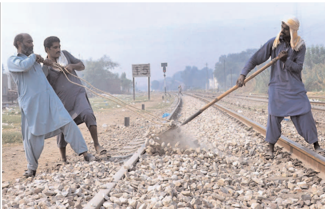
MULTAN: Railway workers busy laying stones around railway tracks during maintenance work near Timber Market.

from 132-KV Old Thermal grid station, Hajwairi Park feeder linked with 132-KV Tariq Abad grid station, Chenab Steel, Ghazi Abad, Ashraf Abad, Mughal Pura, Misaq-ul-Mall, Rehmat Abad and Johar Colony feeders attached with 132-KV Nishatabad grid station, Jhumra Road feeder connected with 132-KV SPS grid station, Edan Valley, Makkoana, Sultani Elasto, Jaranwala Road, Akbar, Lal Kothi, Nazir Shaheed and Kararwala feeders originating from 132-KV Scarp Colony grid station will observe shutdown from 8 a.m. to 2 p.m. on Tuesday (October 31).