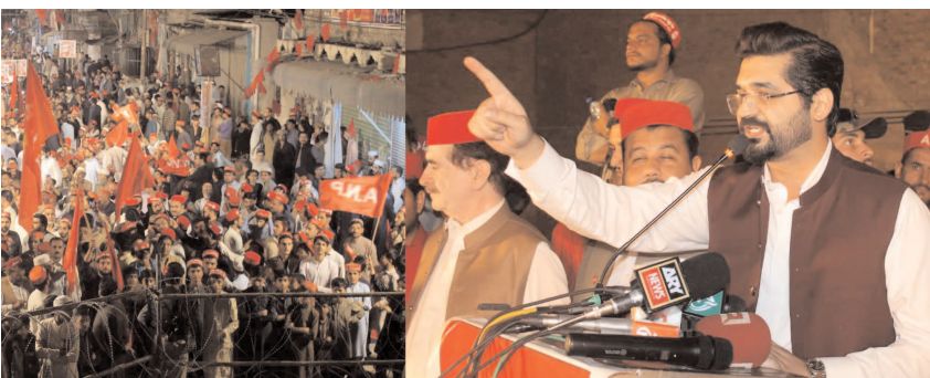
PESHAWAR: Awami National Party's leader Arsalan addressing worker convention.