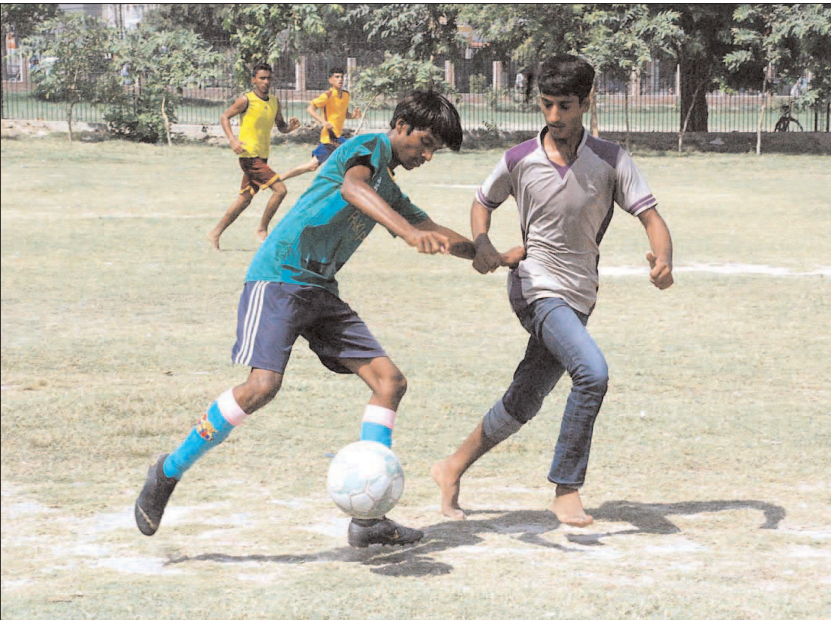
BAHAWALPUR: A view of football match played between Yazman and 45 DB Government teams during Inter-District Government Schools Sports Tournament.

head-to-head later on Thursday, as does world number one Aryna Sabalenka who faces Jasmine Paolini of Italy. Earlier, world number 10 Caroline Garcia progressed to the quarter-finals with a 6-3, 6-2 defeat of Ukraine's Anhelina Kalinina. Garcia will play second-ranked Iga Swiatek in the next round after the Pole swatted aside compatriot Magda Linette on Wednesday. The China Open is taking place for the first time since 2019 after Beijing did away with its long-standing zero-Covid policy. The men's draw culminated on Wednesday when Italy's Jannik Sinner downed world number three Daniil Medvedev to take the trophy.