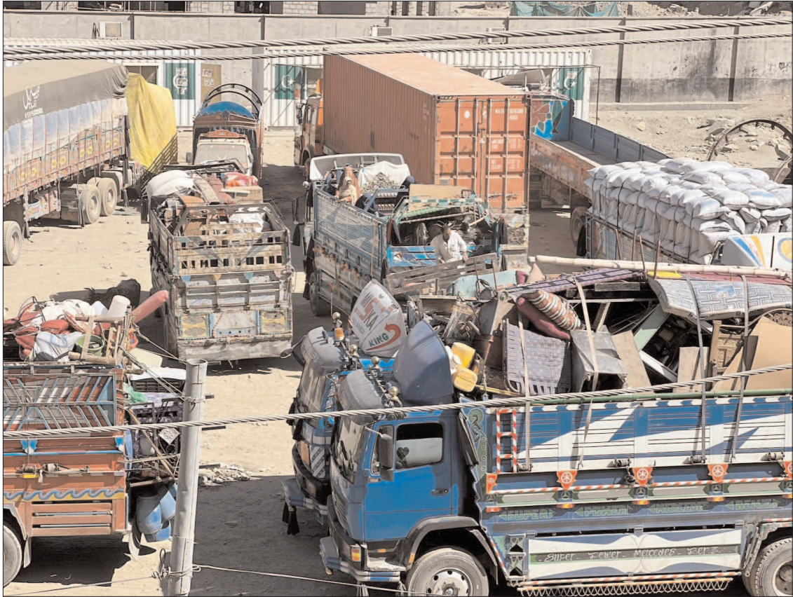
LANDI KOTAL: Trucks loaded with household of Afghans, voluntarily repatriated to Afghanistan via Torkham border.