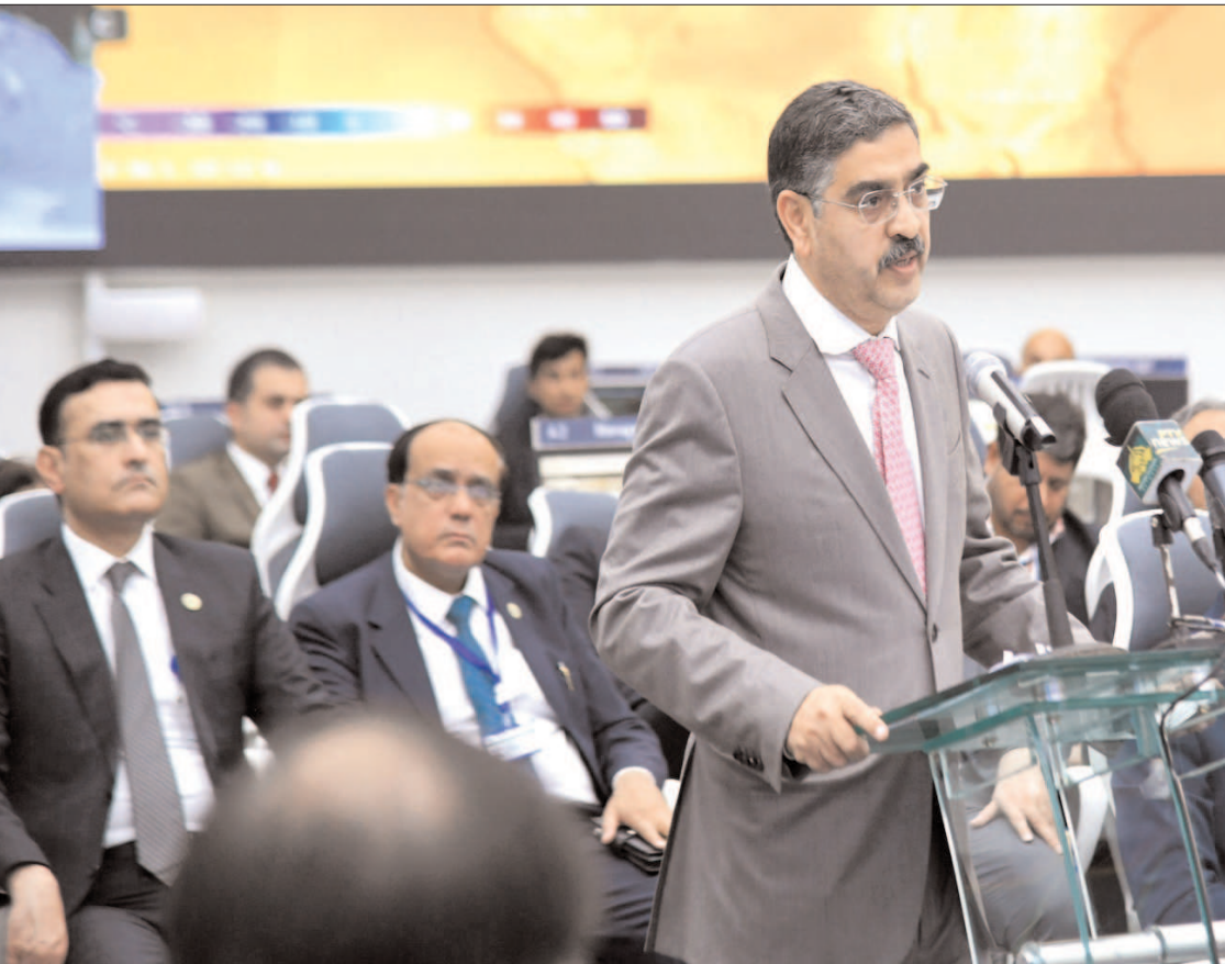
ISLAMABAD: Caretaker Prime Minister Anwaar-ul-Haq Kakar addressing at the inaugural ceremony of National Emergencies Operation Center established by NDMA.