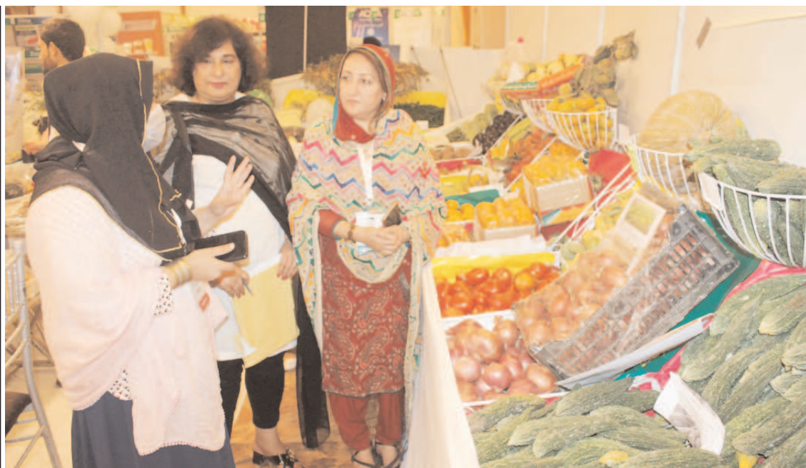
PESHAWAR: Women visiting stall at International Livestock Agri Fisheries Expo.

The amount insured by the DPC becomes immediately available to depositors in case a bank fails while the remaining amounts of the deposits are also recoverable as the troubled bank is resolved through a regulatory assisted process, the statement further clarified.