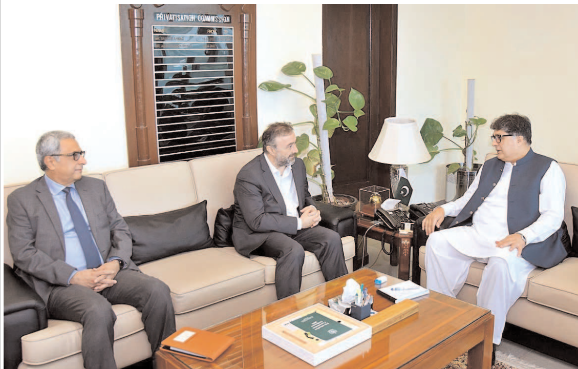
ISLAMABAD: Country Head of World Bank Waleed called on Federal Minister for Privatisation Fawad Hasan Fawad.

Moreover, they said the forest guards were equipped with wireless sets which were connected to the centralized control room of the Environment Wing, CDA, whenever any medical emergency or any untoward situation arises at any trail or hiking track, these forest guards directly communicate with the centralized control room system, where the control room further calls on rescue teams to attend medical emergencies. "Any type of water pipeline and provision of electricity in Margalla Hills National Park is prohibited to avoid any hazard to wildlife except notified villages," they added.