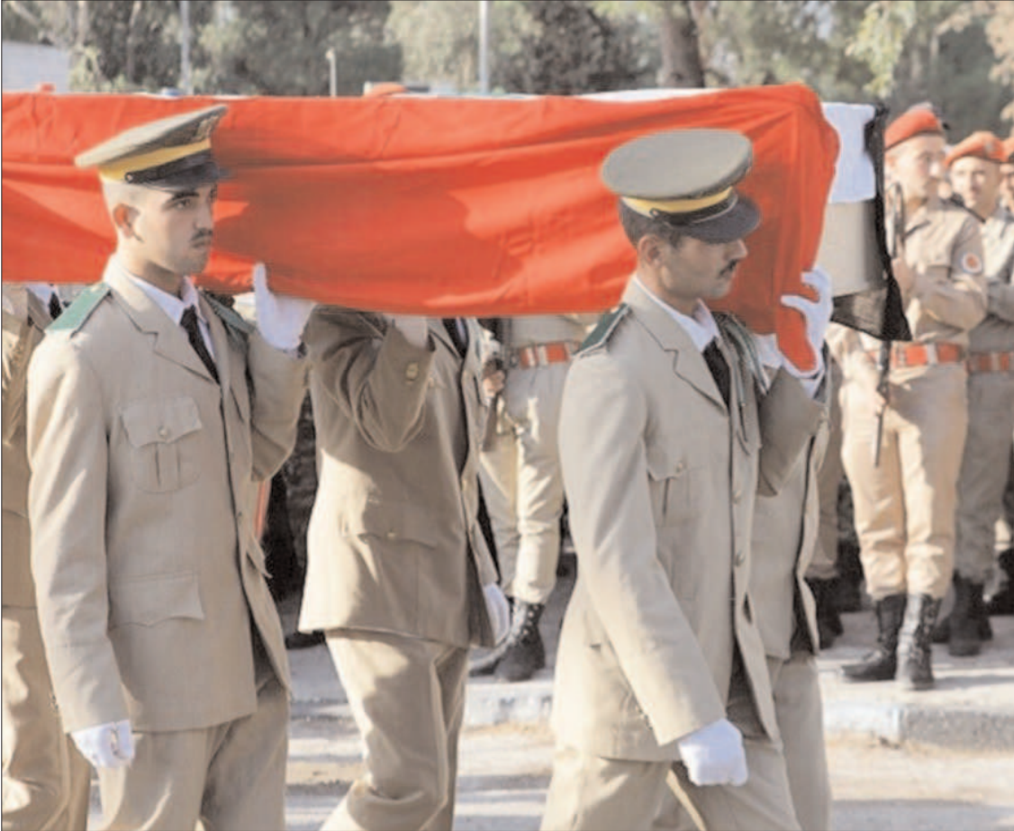
DAMASCUS: Soldiers carrying a casket during funeral of victims of a drone attack targeting a Syrian military academy, outside a hospital in Syria.

He lauded the efforts of Advisor Health and his entire team for successfully introducing the HRMIS, and said that the system will definitely improve the overall performance of the department.