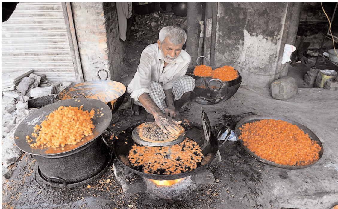
LARKANA: An elderly vendor preparing traditional sweet item at Waleed Mohallah.

The album is all set to release under the banner of Azel Records on October 30, 2023 and will be available on all streaming platforms.