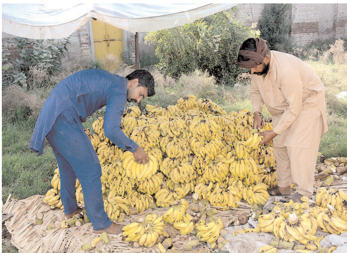
FAISALABAD: Vendors arranging and displaying bananas to attract customers at his road side setup.