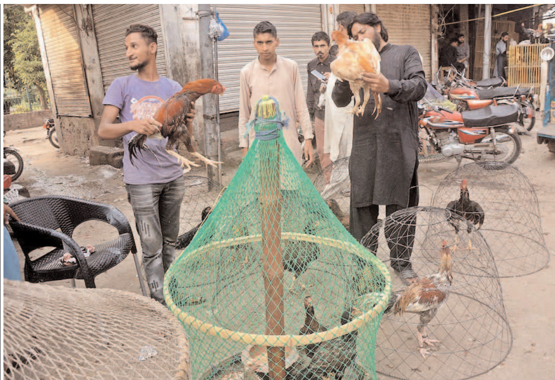
LAHORE: Customers buying birds from a roadside vendor at Bird Market.