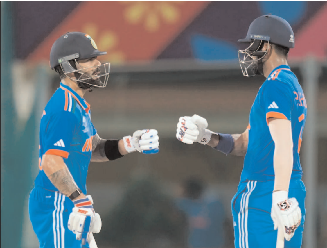
CHENNAI: Virat Kohli and KL Rahul brought up their fifty stand in the 16th over.

The Swede produced a cool finish when a free-kick into the box broke his way before taping home Kieran Trippier's inviting volleyed cross across goal.