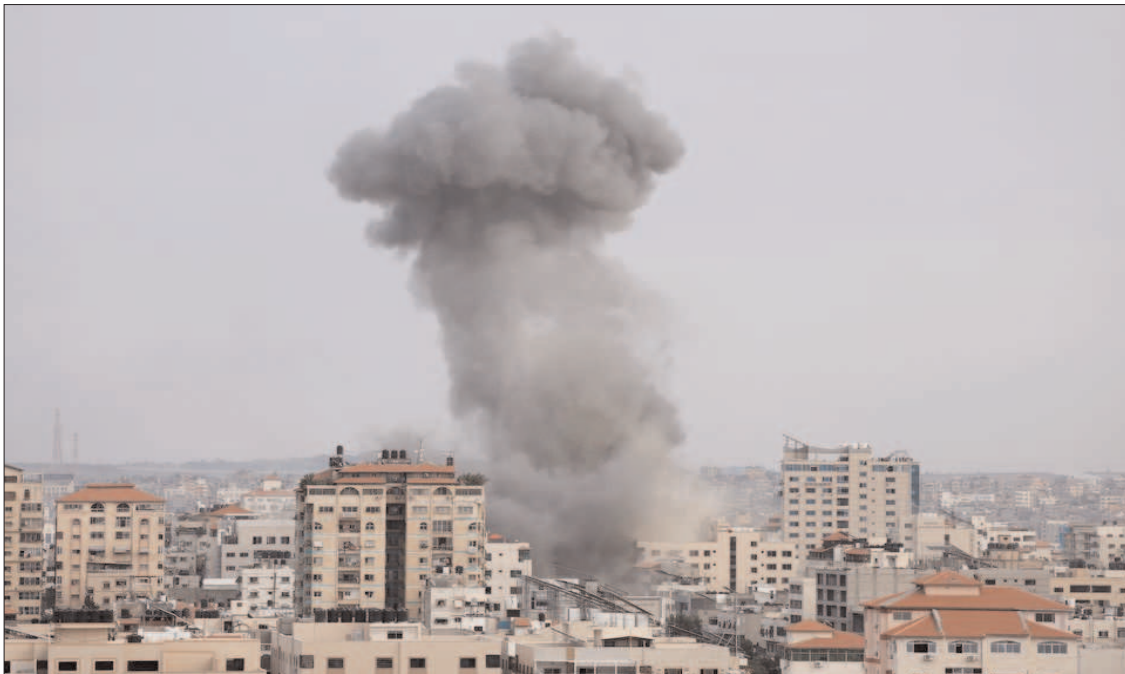
GAZA: Smoke rises following Israeli strikes in Gaza.

They were among the world's deadliest quakes in a year when tremors in Turkey and Syria killed an estimated 50,000 in February.