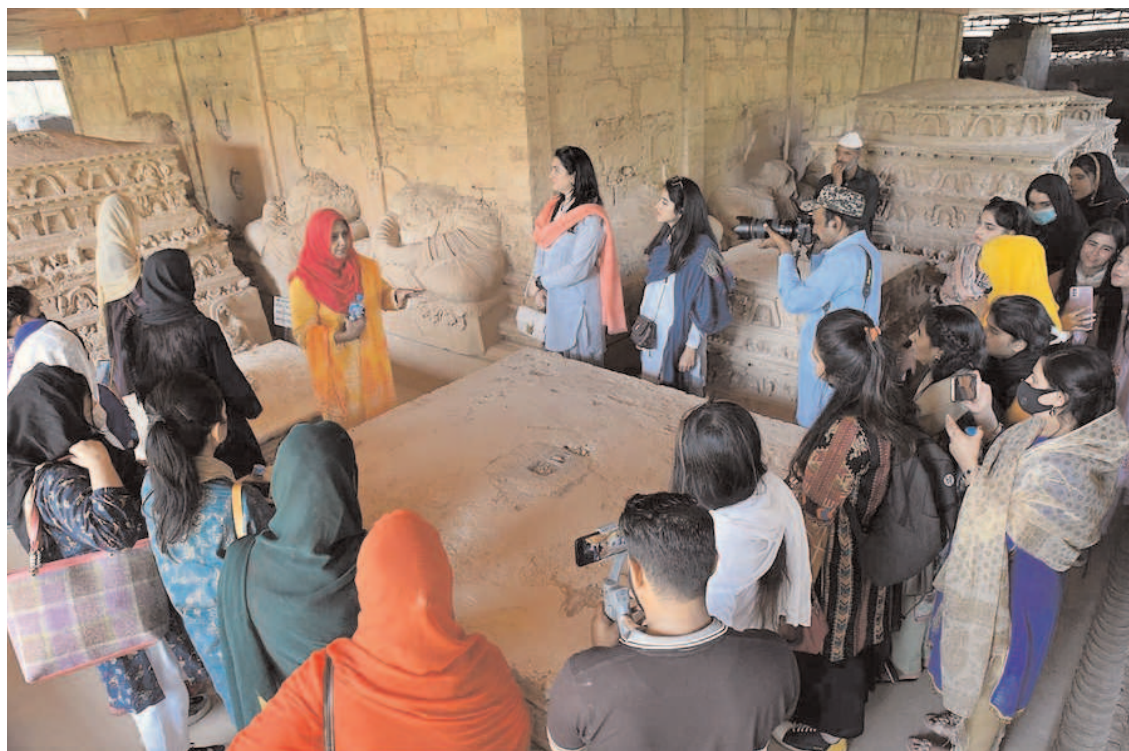
TAXILA: Students of SBBWU and affiliated colleges visiting Taxila Museum in collaboration with Directorate of Museum and Archaeology Khyber Pakhtunkhwa.

The event concluded with the distribution of certificates and shields among the participants.