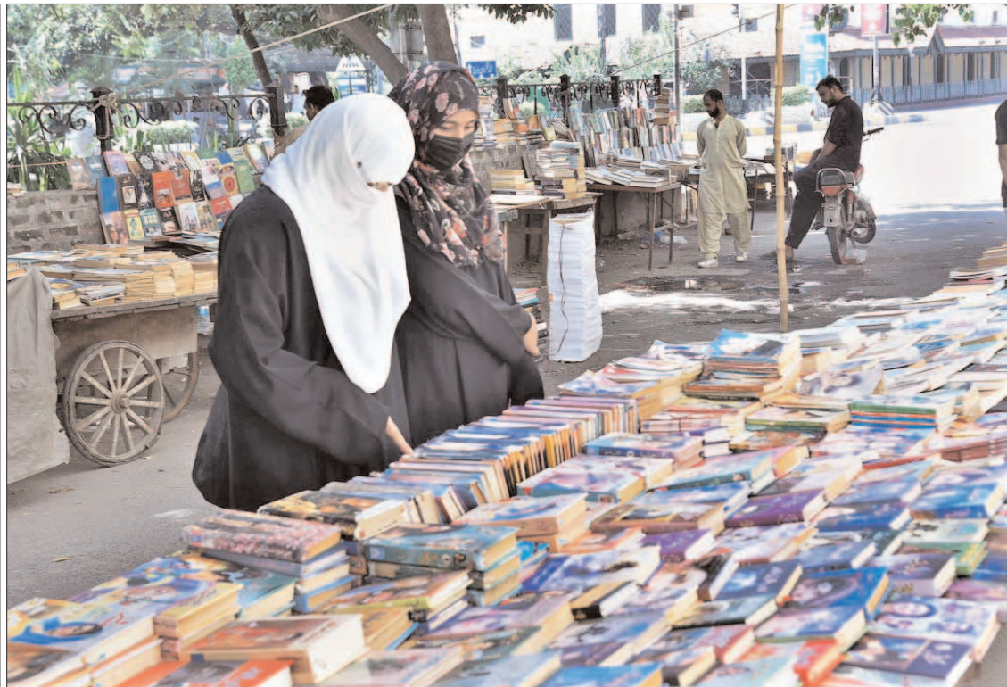
LAHORE: Customers are selecting old books from a roadside stall.

FIA has urgently sought this information from all these institutions.