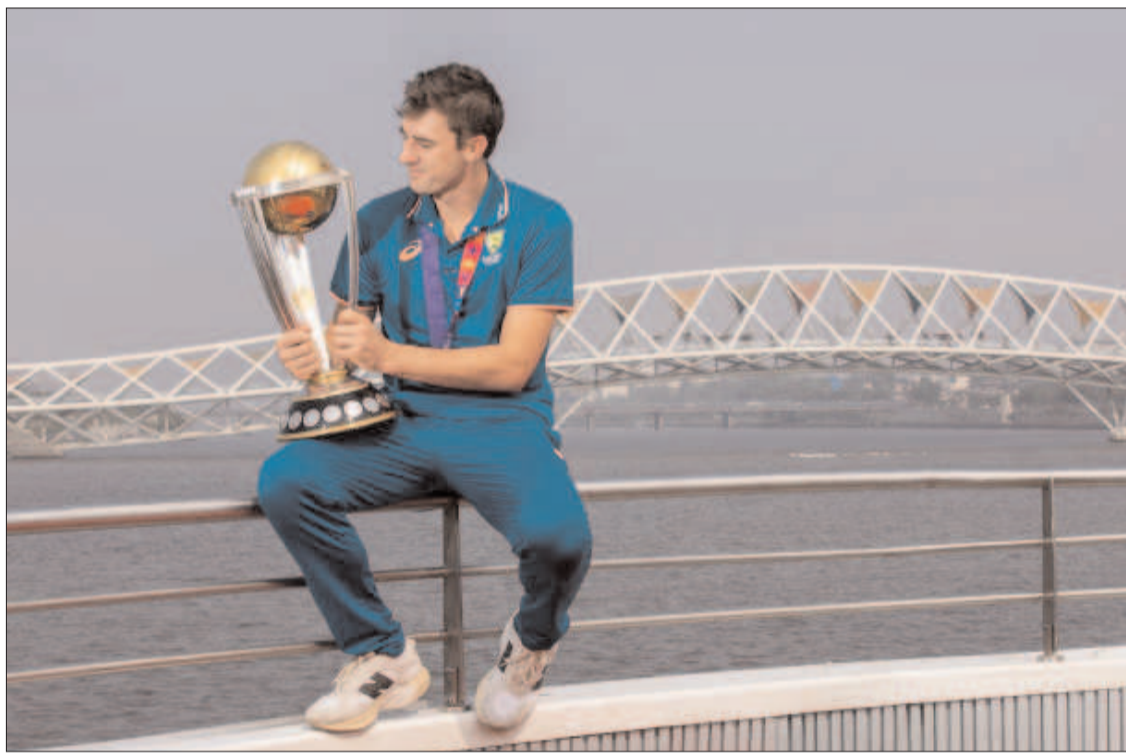
AHMEDABAD: Australia Captain Pat Cummins poses with the ICC Men's Cricket World Cup Trophy near the Atal Bridge on the Sabarmati Riverfront.

Coetzee emerged as a key force in the Proteas side following injuries to Anrich Nortje and Sisanda Magala with 20 wickets in eight matches as he became the leading wicket-taker for South Africa in a single edition of the World Cup.