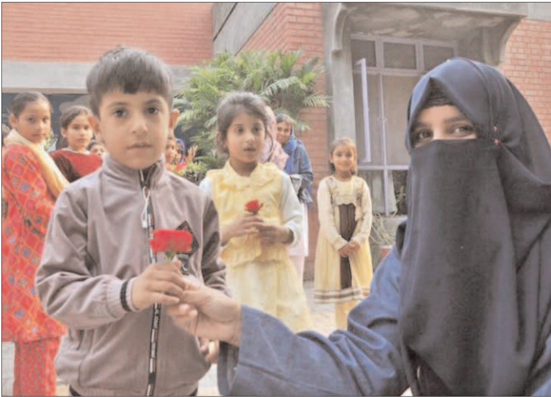
SARGODHA: Students presenting flowers to SOS Village children during an event organized by NCHD on the eve of World Children's Day at SOS Village.