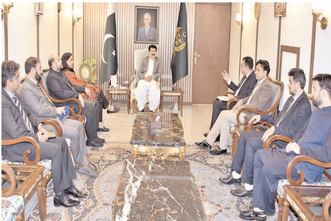
ISLAMABAD: Chairman Senate, Muhammad Sadiq Sanjrani in a meeting with the delegation of Pakistan Humanitarian Forum at Parliament House.

ISLAMABAD (APP): Islamabad Electric Supply Company (IESCO) on Monday issued a power suspension programme for Tuesday for various areas of its region due to necessary maintenance and routine development work. According to IESCO Spokesman, the power supply of different feeders and grid stations would remain suspended for the period from 09:00 AM to 02:00 PM, Islamabad Circle, Shikraparian, Filtration Plant, G-6/3, Babul-Salam, Marvi, Waheedabad, Sohadrn Road, Khanna Dak, Alipoor, F-8, G - 10 Center, I-8/2, I-10/2, G-13/4, F-11/4, Rahara, CM Pak Zong, Kari, Birut, Kaldana, Nimble, Patriata, Upper Topa, Anguri, Park Enclave, Scheme-II, Chhata Bakhtawar, Sohadrn Road, Anguri, UC Road, Coral, Comstick, Khanna East, Rahara, Ghorri Garden, Khanna-2, Azad Shaheed Feeders, Rawalpindi City Circle, Saidpur Road, Faizabad, B.B. Hospital, Curry Road, Khanna Road, Khanna II, Al Noor Colony, Muslim Town, Sector 4, APHS, Gangal, Zafarul Haq, Dhok Khaba, Gulshanabad, Jama Masjid, Industrial, Quaidabad, Gwalmandi, Abu Bakar, Amin Town, Kayani Road, Askari XI, Ameer Hamza Colony, Shams Colony, Noon, Ratta Feeders, Rawalpindi Cantt Circle, Mall Road, Jahangir Road, RIC, Rawalpindi.III, SPD.II.