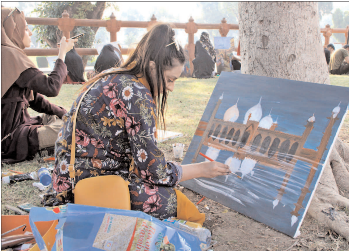
LAHORE: Artist giving final touches to the painting in Deewane Aam Painting Competition at Shahi Fort.