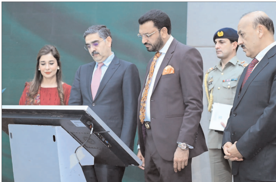
ISLAMABAD: Caretaker Prime Minister Anwar-ul-Haq Kakar launching ZARRA mobile app on the eve of Universal Children's Day.