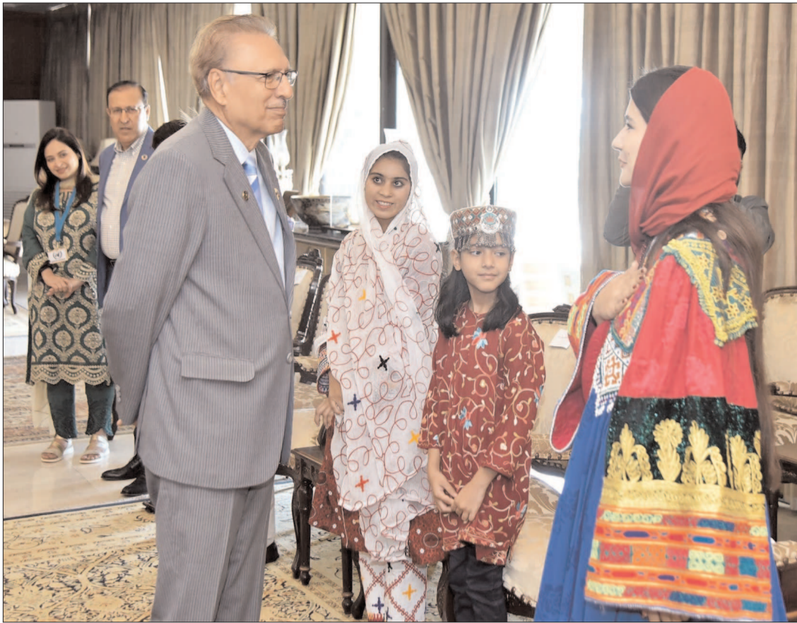
ISLAMABAD: President Dr. Arif Alvi meeting with a delegation of children wearing traditional attires representing four provinces, Gilgit Baltistan, Azad Jammu and Kashmir.