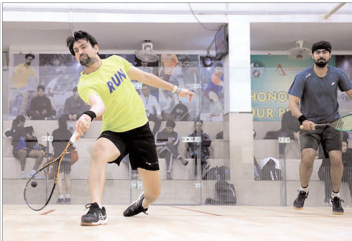
ISLAMABAD: Players in action as Pakistan Squash Federation in collaboration with PAF & Serena Hotels is organizing Chief of the Air Staff-Serena Hotels International Squash Championship for Men & Women at Mushaf Squash Complex.

"I also want to thank Rilee Rossouw for giving us some incredible memories. While he will not be in our dressing room this season, we will definitely remember him for his services to the franchise. Wherever he will go, he will always be remembered for his time at Multan Sultans, as once you become a Sultan, you always stay a Sultan."