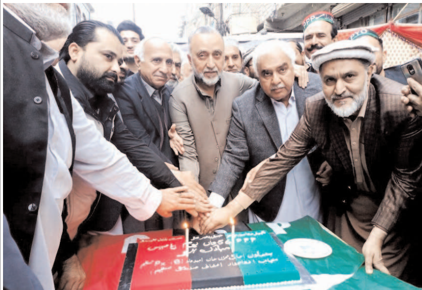
PESHAWAR: Provincial leaders of Pakistan Peoples Party cutting a cake to celebrate of 56th party foundation day.