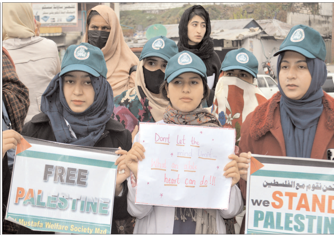
MUZAFFRABAD: Disable female holding placards during a protest rally against Israel's attack on Gaza.

The arrest of the two suspects is a major step towards curbing crime in Jhelum. The police are confident that they will be able to bring all criminals to justice.