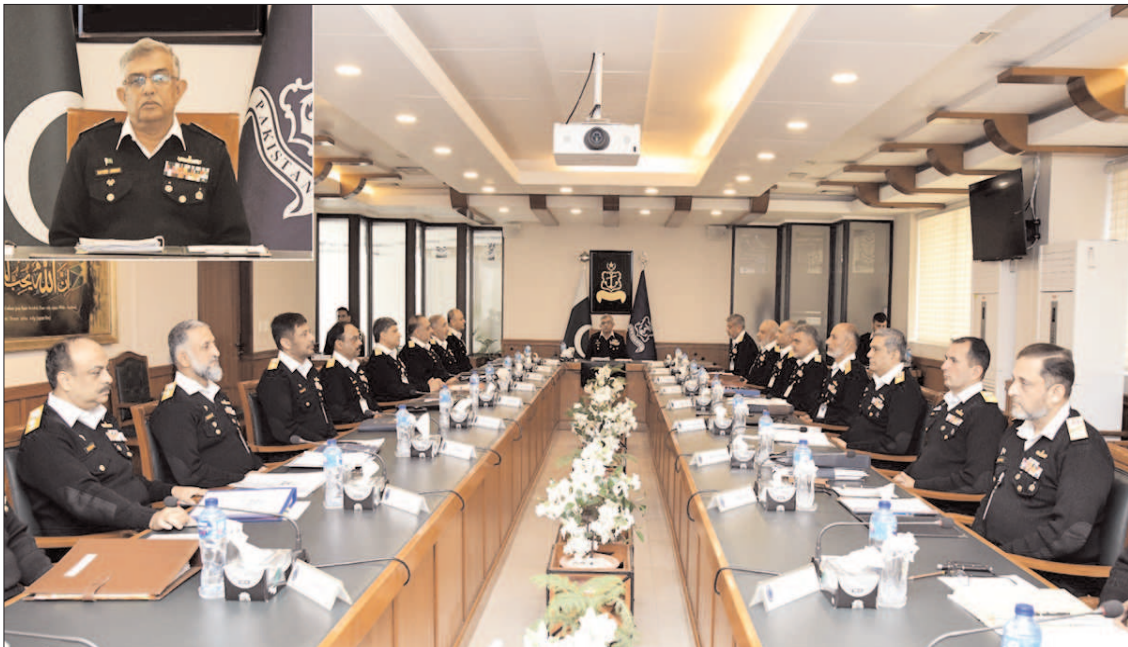
ISLAMABAD: Chief of the Naval Staff, Admiral Naveed Ashraf chairs the Command & Staff Conference held at Naval Headquarters.

118 new cases of dengue reported in Punjab