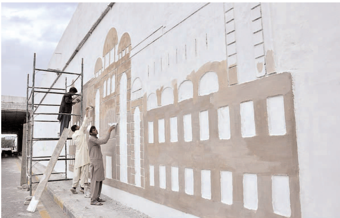
ISLAMABAD: Workers busy in making different designs on the wall of underpass for beautification at 6th Avenue.