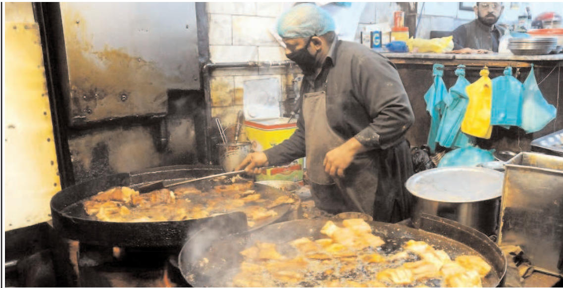
PESHAWAR: Shopkeeper busy in frying fish for customers at Qissa Khawani Bazaar.