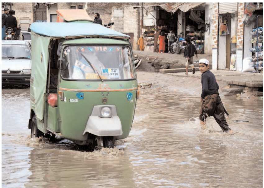
PESHAWAR: A view of rain in provincial capital.