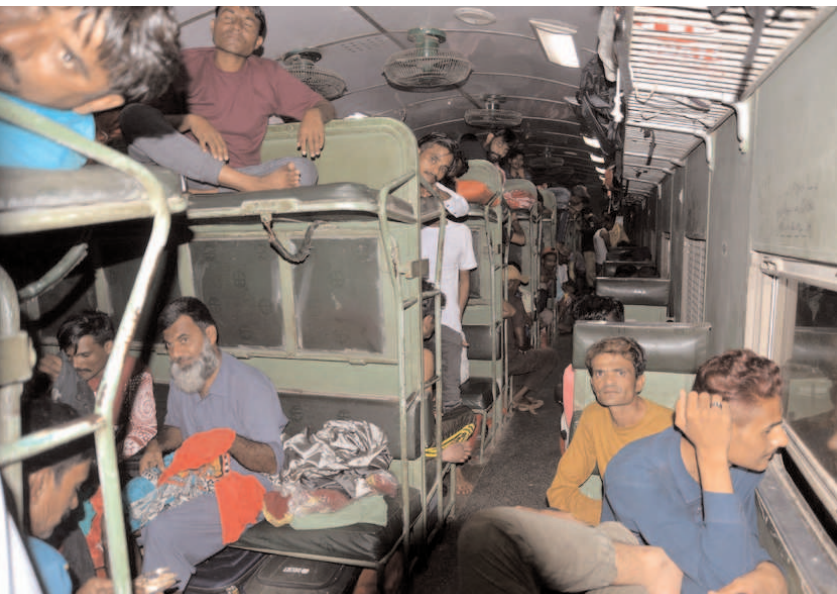
HYDERABAD: Eighty Indian fishermen going to Lahore after released from Karachi Prison.