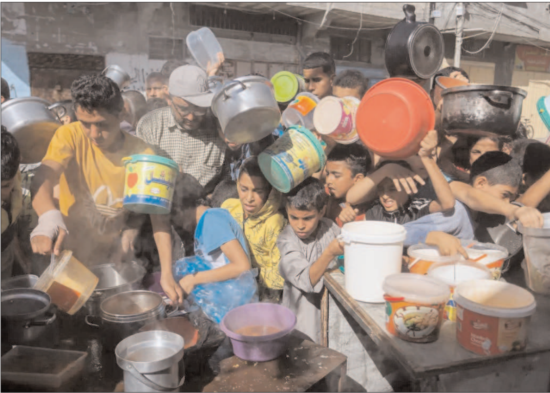
GAZA: Palestinians crowd together as they wait for food distribution in Rafah.

Citing Meng Aung Hlaing, the report said the MNDA had suffered a "large number of casualties". The MNDA is one of several groups within the alliance, which also includes the Ta'Ang National Liberation Army (TNLA) and Arakan Army (AA). The members of the alliance said they had mounted the offensive to eradicate "oppressive military dictatorship" as well as to put an end to the booming business of cyber-scramming. — Aljazeera