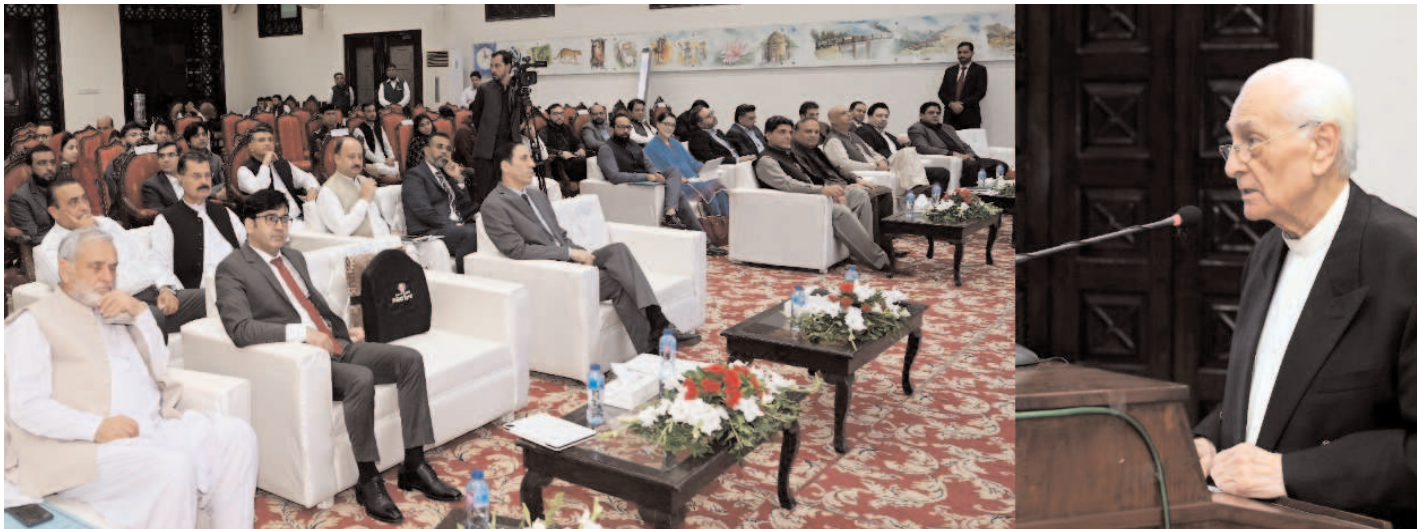
PESHAWAR: Caretaker Chief Minister Khyber Pakhtunkhwa Muhammad Azam Khan addressing launching ceremony of KP Digital Workshop.