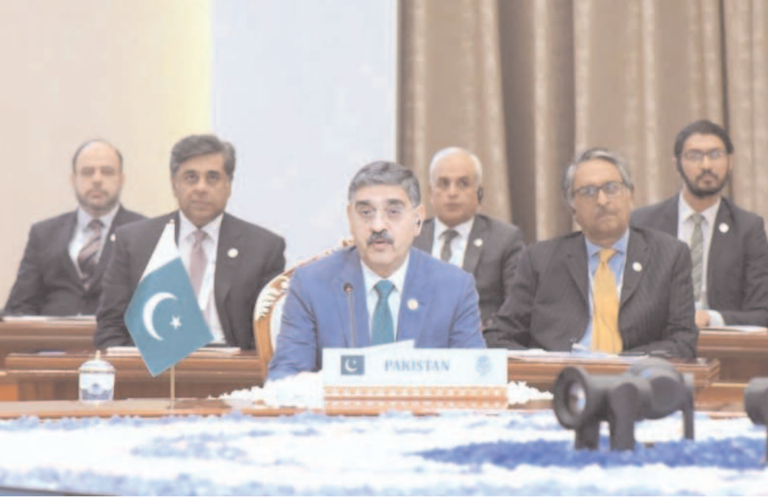
Caretaker Prime Minister Anwaar-ul-Haq Kakar addressing 16th ECO Summit in Tashkent.

He said as Pakistan would be holding the office of ECO secretary general next year, he expressed the hope that the member countries would extend their support to the country to help achieve the ECO objectives.