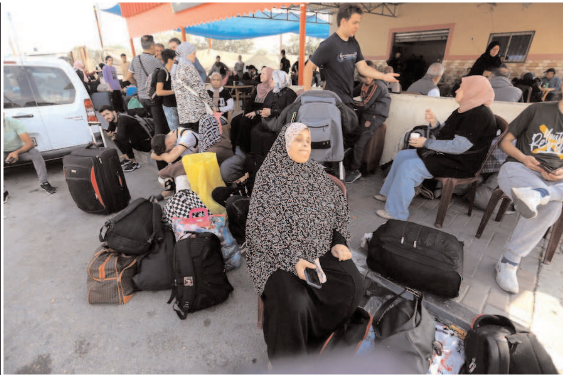
GAZA STRIP: Palestine refugees waiting at Rafah Boarder before entering Egypt.