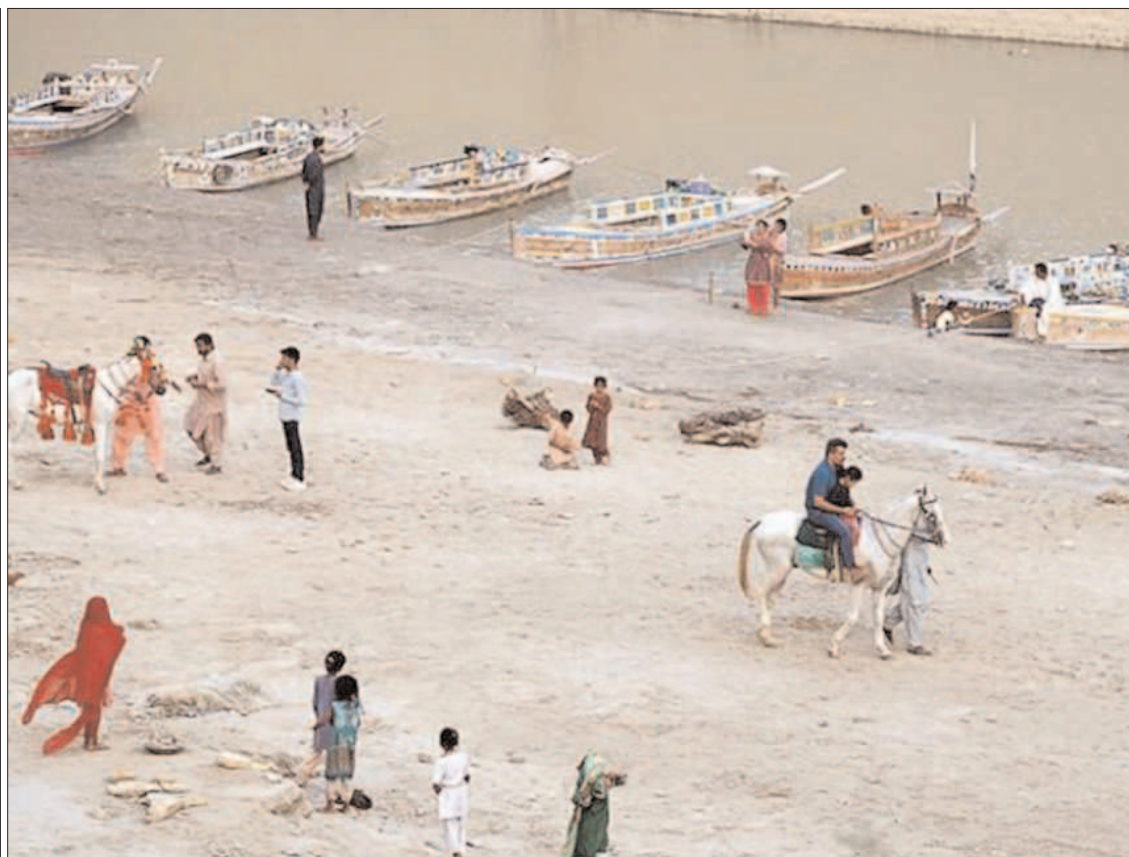
HYDERABAD: Families enjoying at bank of Indus River.

Case has been registered and investigation is underway.