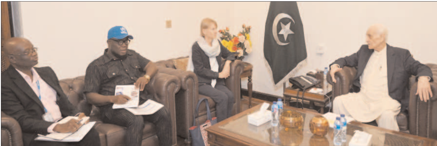
PESHAWAR: KP Caretaker Chief Minister Muhammad Azam Khan called on by a delegation of UNHCR.