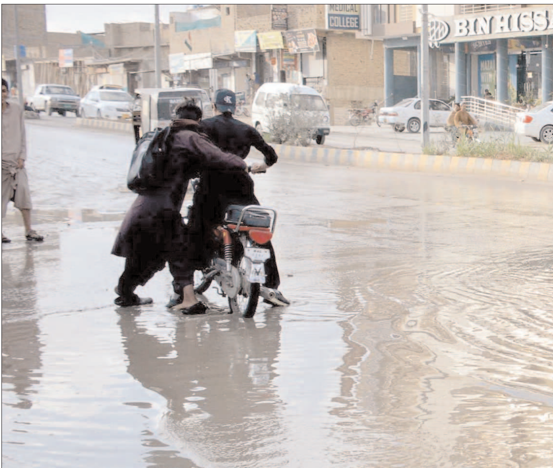
QUETTA: A view of accumulated rain water after recent rain.