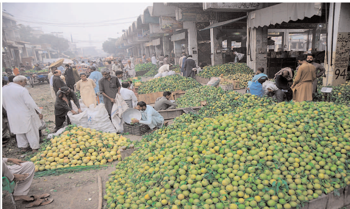
MULTAN: Vendors displaying seasonal fruit mosambi to attract the customers at fruit market.

ernment, non-profit organization set up in 2000 to protect and educate consumers. It aims to safeguard the interest of consumers while ensuring that their needs are given a higher priority.