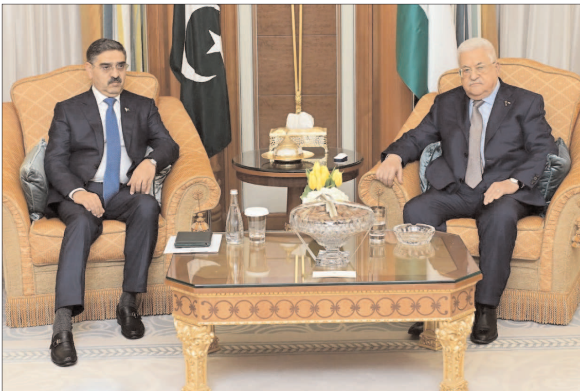
RIYADH: Caretaker Prime Minister Anwar-ul-Haq Kakar meeting with President of Palestine Mahmoud Abbas on the sidelines of 8th extraordinary summit of OIC.