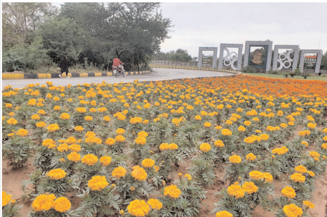
ISLAMABAD: A picturesque sight unfolds as flowers bloom along the Islamabad Expressway.

Separate cases have been registered against the accused while further investigations are under process.