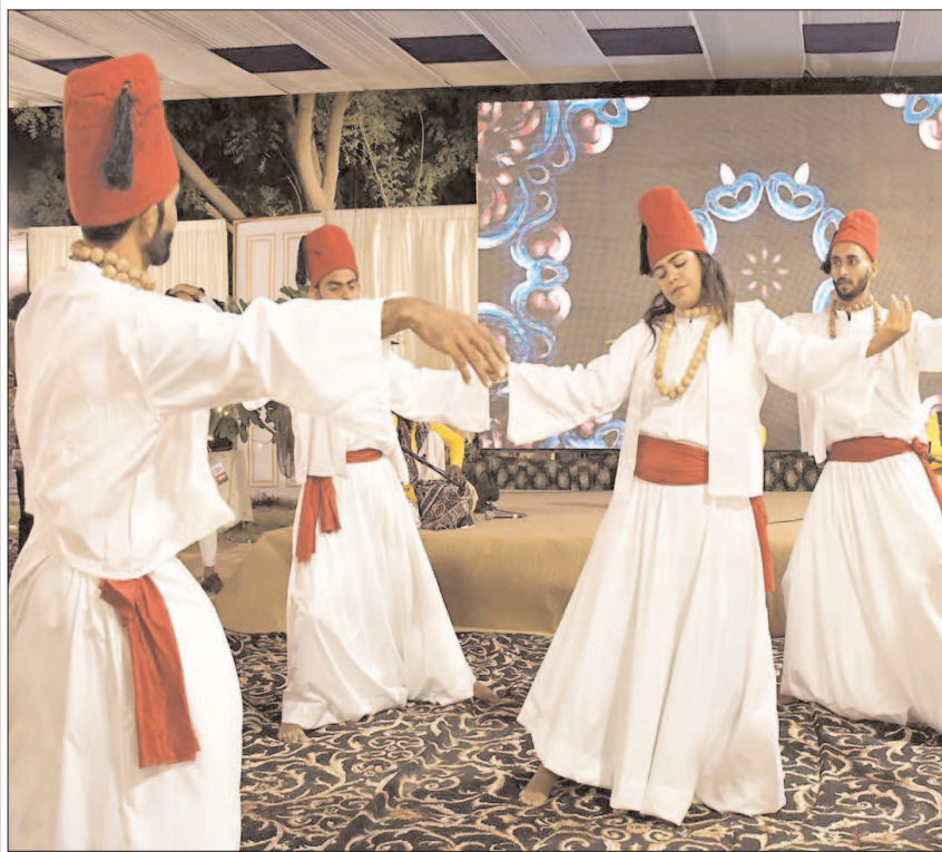
JAMSHORO: Artists performing on stage during 36th Annual Conference of Pakistan Society of Neurosurgeons at LUMH.

The students are depriving while the movement of unusual persons in the rooms of the students staying in the hostels to study from faraway areas has become normal. He further said that the admissions of the students should be restored after the immediate suspension of Dawood Medical University Vice Chancellor.