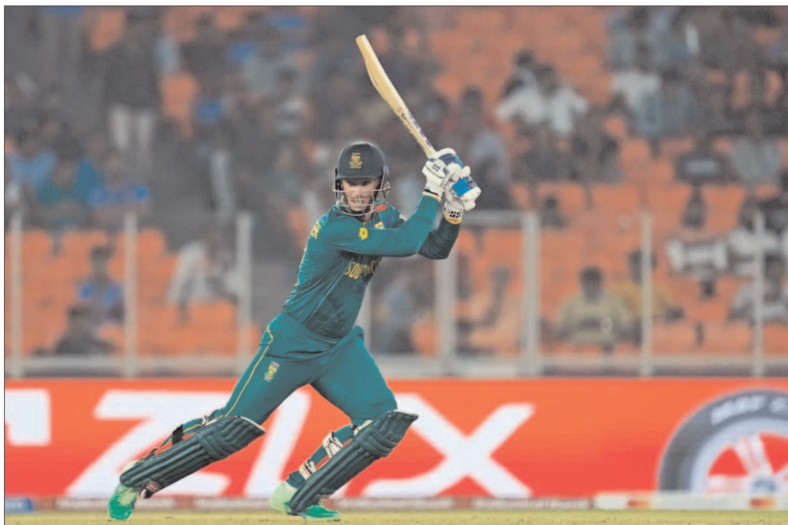
AHMEDABAD: Rassie van der Dussen was off to a fluent start.