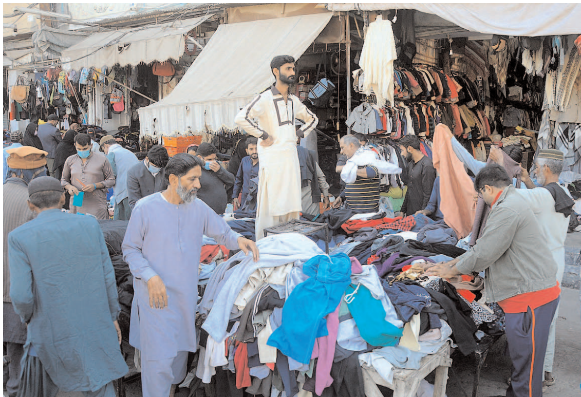
MULTAN: People selecting and purchasing secondhand warm clothes at Landa Bazaar.

London - FTSE 100: UP 0.7 percent at 7,455.67 (close)