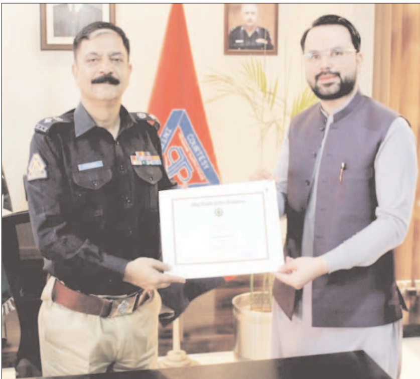
PESHAWAR: Chief Traffic Officer Qamar Hayat Khan awarding certificate of appreciation to Public Relation Officer Shahab Khan Umarzai for good performance.

The citizens of Peshawar appealed to Chief Minister Khyber Pakhtunkhwa Muhammad Azam Khan to set up a probe committee to investigate the long breakdown as a result of 30 minute rain in Peshawar.