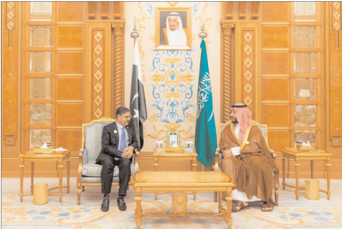
RIYADH: Caretaker PM Anwaar-ul-Haq Kakar met Crown Prince and Prime Minister of Saudi Arabia Prince Mohammed bin Salman in Riyadh.