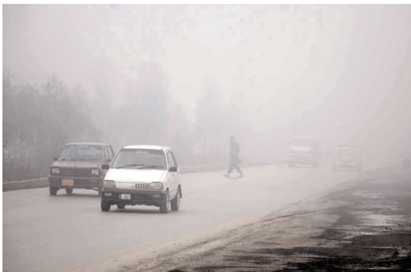
PESHAWAR: Vehicles drive on a road during fog after recent winter rain.

Traffic flow on Highway M1 is also affected due to heavy fog. However, the flow of traffic continues with the Motorway Police advisory, and the people's are asked to contact the Motorway Police to deal with any emergency.