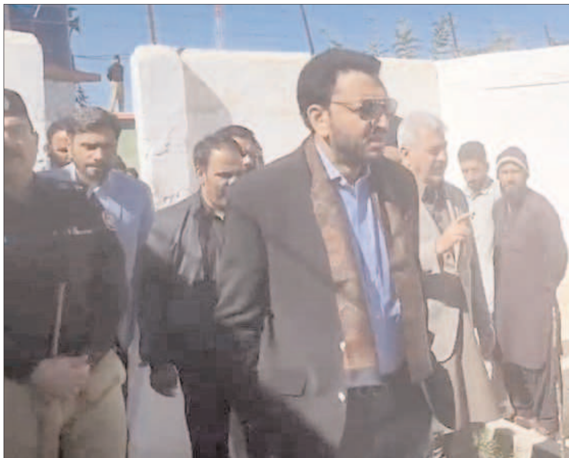
QUETTA: Caretaker Federal Minister for Human Rights Khalil George visiting District Jail.

Rana Khalid Mehmood said that police have returned booty of their owners. The police also conducted special operation against drugs paddlers and arrested 155 accused which is reflecting commitment of police to ensure protection of people.