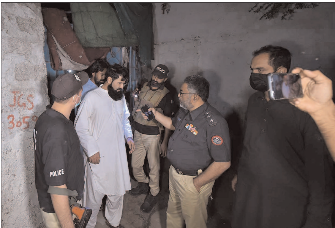
KARACHI: Police personal takes action against illegal Afghan migrants during operation at last late night in provincial capital.

Candidate will be responsible for assisting in coordination & conduction of ATLS, BLS, ACLS and PALS Courses. He / She must be a trained staff nurse or paramedics preferably Bachelor in Nursing from a reputable institution, with relevant experience. Computer and communication skills are pre-requisite. Please send your resumes along with recent photograph latest by November 27, 2023.