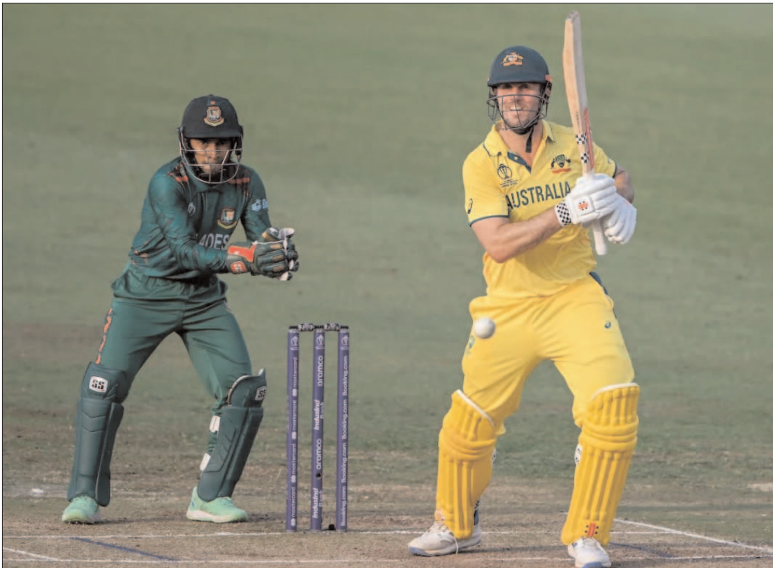
PUNE: Mitchell Marsh struck a few lusty blows down the ground.

K O L K A T A (Agencies): The Marylebone Cricket Club (MCC), custodians of the game's laws, said on Saturday that the umpires had made the correct call in declaring that Sri Lanka's Angelo Mathews had "timed out" in his side's World Cup clash against Bangladesh. Mathews became the first player in international cricket to be dismissed for a time ruling after he failed to make himself ready within the stipulated two minutes to face Bangladesh captain and bowler Shakib Al Hasan, whose appeal led to Mathews' exit. The chin strap of Mathews' helmet broke before he could take guard, and by the time a replacement helmet arrived from the Sri Lankan dressing room, the batter was judged to have overrun his time allowance. Mathews subsequently called Bangladesh "disgraceful" and said the umpires lacked common sense while dealing with the "equipment malfunction" in the Monday match in Delhi. The MCC said Mathews should have drawn the umpires' attention to his broken helmet instead of waiting for a new helmet to arrive. "It appears that Mathews did not consult with the umpires, which a player would be expected to do when seeking new equipment," the MCC said in a statement. "Had he explained to the umpires what had happened and asked for time to get it sorted out, they might have allowed him to change the helmet, perhaps calling time and thus removing any possibility of being timed out."