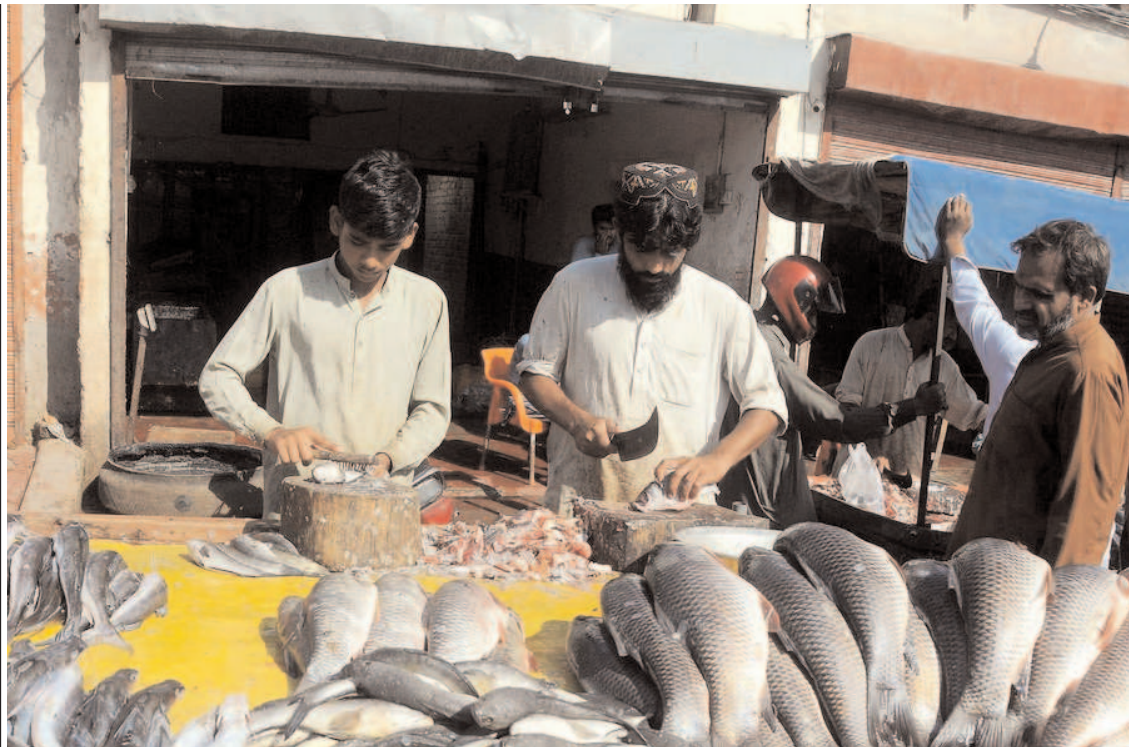
MULTAN: Vendors selling fish as its demand increased despite high prices of white meat for winter at fish market.

He said that PIA should be privatized and the private sector should be encouraged to launch new airlines that would strengthen Pakistan's direct air links with all major markets and contribute significantly to reviving the economy.