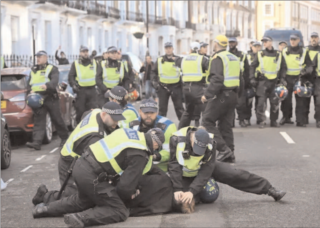
LONDON: Police officers detain a man in street close to ‘National March For Palestine.’

Home Secretary Suella Braverman recently called pro-Palestinian demonstrations “hate marches” and said the police “play favourites” and take a soft stance towards rallies in support of Gaza. “The Met have my full support to take action against anyone found spreading hate and breaking the law,” Khan’s post added. — Al Jazeera