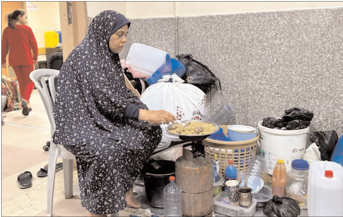
GAZA: An internally displaced woman cooking while camping at Al-Shifa Hospital, where thousands of displaced Palestinians have been sheltering.

In comments made later at a ceremony in Ankara, Erdogan took a more moderate tone on the crisis, saying he was not siding with a party in the dispute and assuming the role of the referee. Erdogan also said the dispute between the two top courts showed the need for a new constitution, reflecting his longstanding position that parliament should take up the matter next year. The latest crisis showed that Erdogan wants "more control over Turkey's judicial system," according to Gareth Jenkins, an Istanbul-based political analyst.