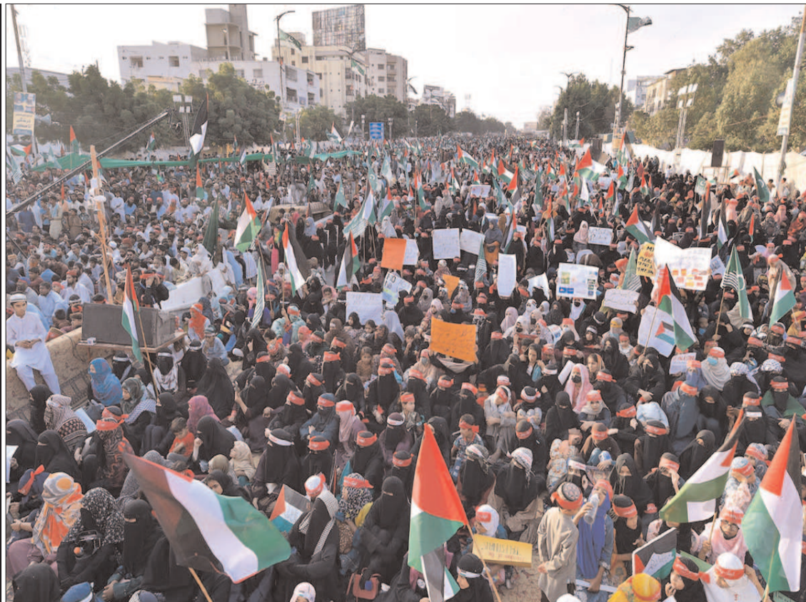
KARACHI: A large number of people participating in the solidarity conference for the people of Palestine organized by Pakistan Markazi Muslim League at Shahra e Quaid.

They said that PPP believed in inter-faith tolerance and harmony as well as brotherhood and unity. Equal rights had been given to minorities in the Constitution-1973 given by the former Prime Minister Shaheed Zulfikar Ali Bhutto. Shaheed Mohtarma Benazir Bhutto fought throughout her life for the protection and development of the rights of the minorities. Former President Asif Ali Zardari as the President of the country started celebrating National Day of Minorities on August 11 every year. He started celebrating 11th August every year as National Day of Minorities.