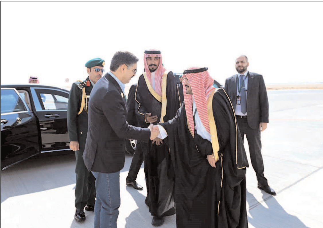
RIYADH: Caretaker Prime Minister, Anwaar-ul-Haq Kakar departs for Pakistan after completing his three day official visit of Kingdom of Saudi Arabia.

"The hospital is working with 30-40 percent of its capacity," Al-Kahlot said. Hamas fighters smashed through the militarised border with Israel on October 7, killing around 1,200 people, mostly civilians, and taking about 240 people hostage, according to the most recent Israeli figures. Israel's campaign in response to wipe out Hamas has killed more than 11,000 people, also mostly civilians and thousands of them children, according to the latest figures from the health ministry in Hamas-run Gaza. The ministry has not updated tolls for two days citing the collapse of hospital services. The families of Israeli hostages spoke of their agony at a rally in Tel Aviv Saturday. "I came here to shout for my kidnapped parents which are already 35 days not here with us, kidnapped in Gaza. We don't know their situation and we need them to be released immediately," said Yair Mozes, whose parents were both kidnapped from Nir Oz, a kibbutz in southern Israel.