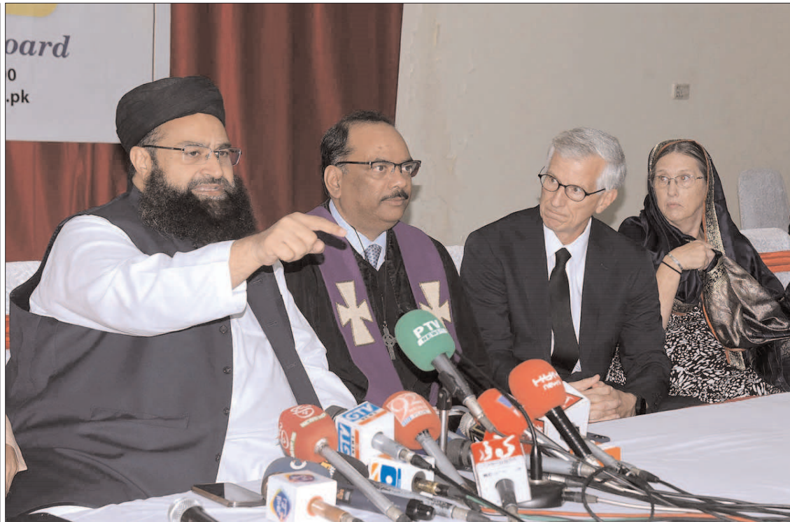
LAHORE: Maluana Tahir Mehmood Ashrafi Head of Pakistan Ulema Council talking to media at Nolakha Presbyterian Church.

He further said that he was going to Palestine tomorrow to help Palestinian brothers and sisters.