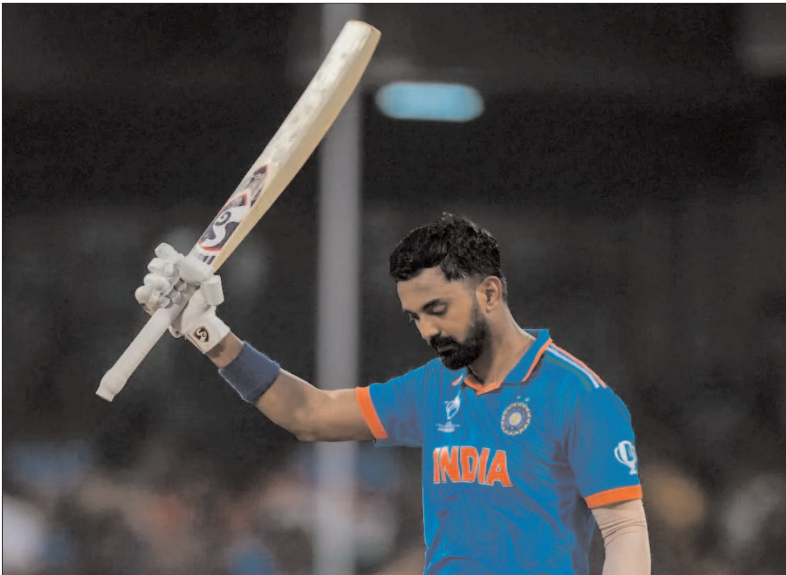
BENGALURU: KL Rahul's 62-ball hundred became the fastest by an Indian in a Men's ODI World Cup.

LEVI (AFP): Mikaela Shiffrin won the World Cup slalom at Levi on Sunday to chalk up her 89th career victory, despite skiing with a knee injury she suffered in training. Shiffrin took advantage of a mistake on the second run by Olympic slalom champion Petra Vlhova, who won the first race in Levi on Saturday and was ahead after Sunday's opening run. The American, who already holds the record for the most World Cup wins, finished 0.18sec ahead of Leona Popovic of Croatia with Germany's Lena Duerr third, 0.30sec behind Shiffrin. Shiffrin, who finished fourth in Saturday's race, suffered a bruised knee in a training crash last week but said it had not affected her race. "I didn't feel pain when I was skiing, it's just that I didn't train in the last 11 days," Shiffrin said after Sunday's victory.