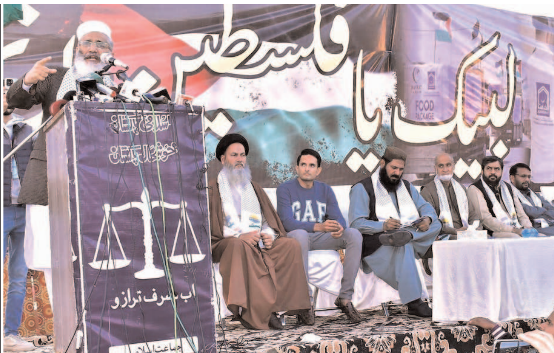
SIALKOT: Ameer Jamaat-e-Islami Pakistan Siraj-ul-Haq addressing Labaik ya Palestine Youth Convention at Murray College.

In Sargodha district, 400 cases of electricity theft were detected. Hence, a fine of Rs.42.5 million was imposed on the electricity thieves under 933,000 detection units.