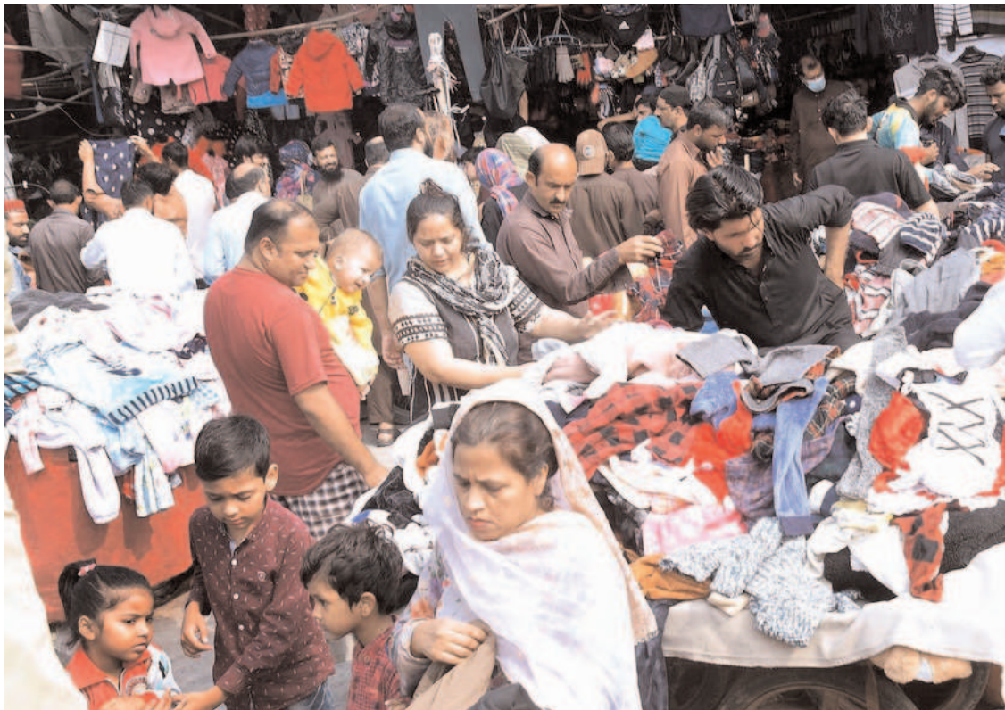
LAHORE: People buying old warm clothes at Empress Road.

Businesses that have implemented digital technologies such as cloud computing, big data, and AI have seen an average increase of 30 percent in their IT exports in the past year, compared to 20 percent for businesses that have not implemented these technologies, he added.