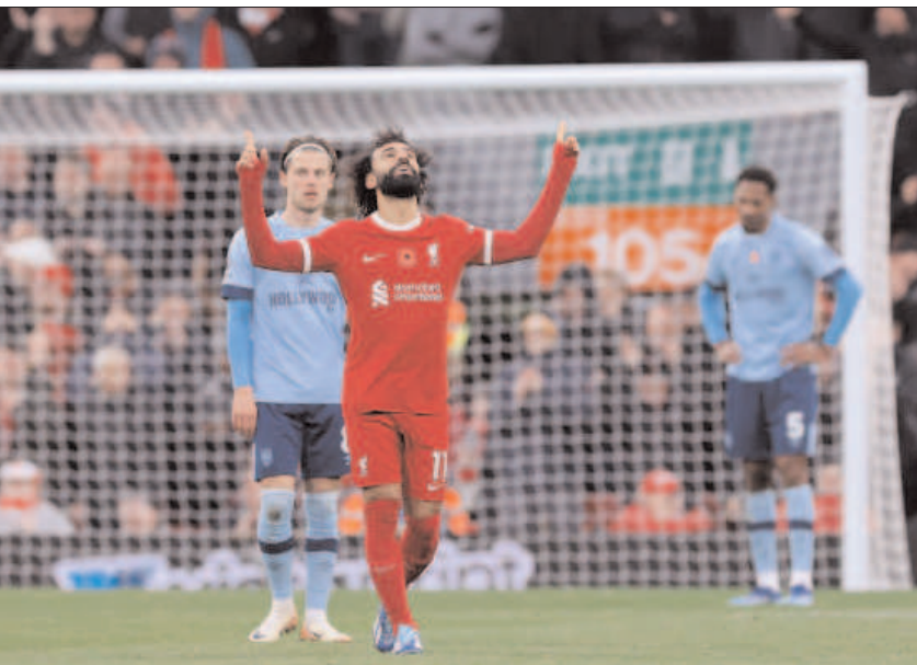
LIVERPOOL: Mohamed Salah of Liverpool celebrates after scoring the team's second goal during the Premier League match.

New Zealand, who sent them packing at the same stage four years ago, stand in their way. India look to have all the tools to make this another home World Cup to remember and have two more games to prove it.