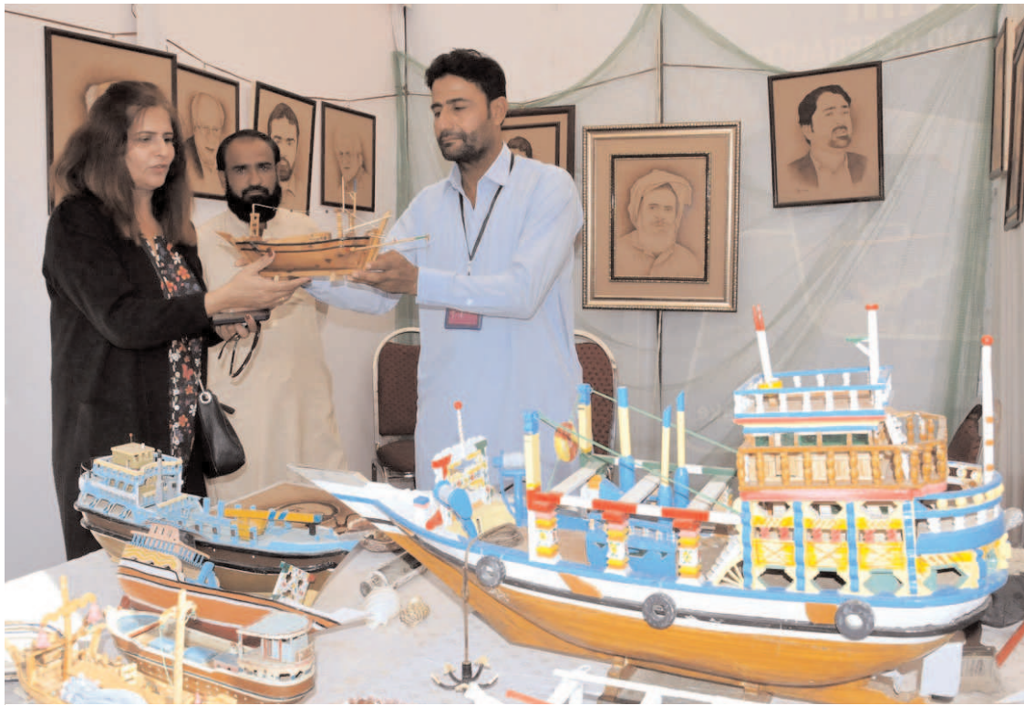
ISLAMABAD: Woman visiting stall during "Folk Festival Lok Mela" at Lok Virsa.

ISLAMABAD (APP): Road users in Islamabad are grappling with severe traffic congestion, particularly at the city's main entrance, Faizabad, during peak hours. The presence of Islamabad Traffic Police personnel, combined with operational police, has intensified the situation, leading to allegations of undue stops and stringent penalties for alleged traffic violations. The Safe City cameras at this entry point are touted as potential proof of the traffic chaos, although authorities have yet to address the mounting concerns. This surge in traffic policing practices follows a recent increase in fine amounts for traffic violations. Residents report instances of misbehavior by traffic police officers, with arguments and confrontations becoming commonplace. It is claimed that engaging in discussions or disagreements with the police can result in escalated fines and the imposition of additional penalty sections.