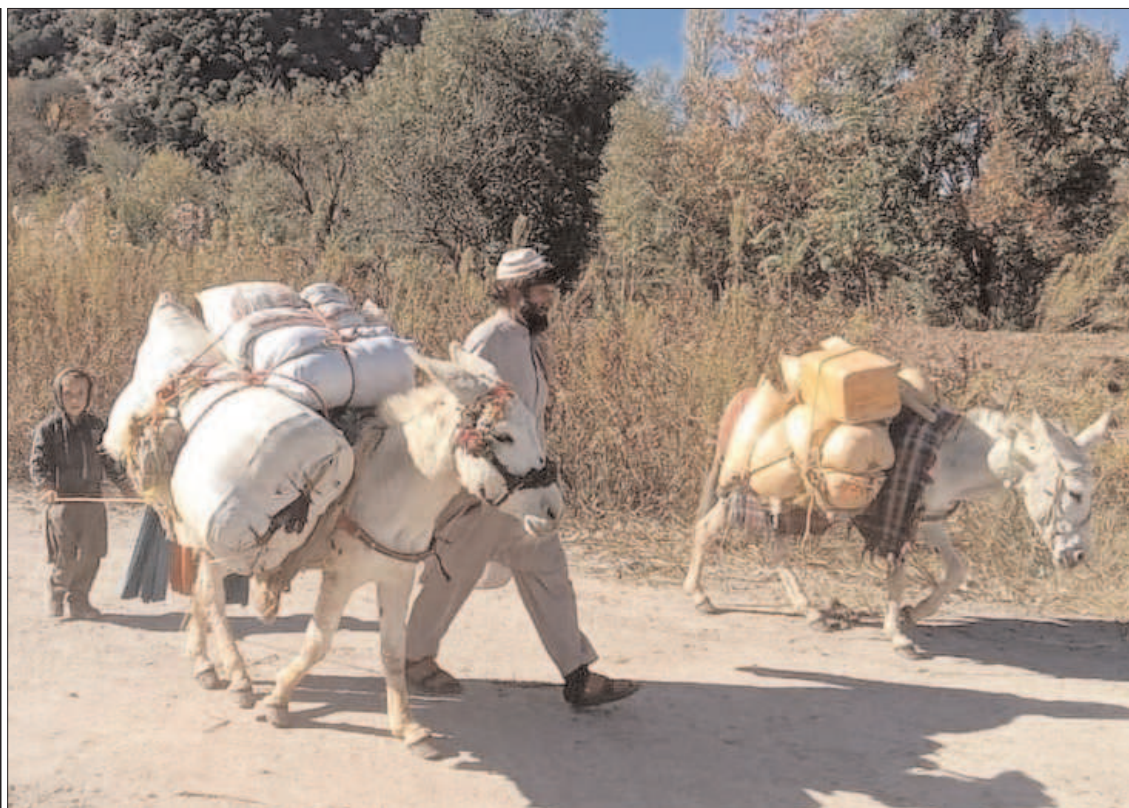
TIRAH VALLEY: Displaced persons loaded their household at donkeys' leaving home due to possible operation in the area.