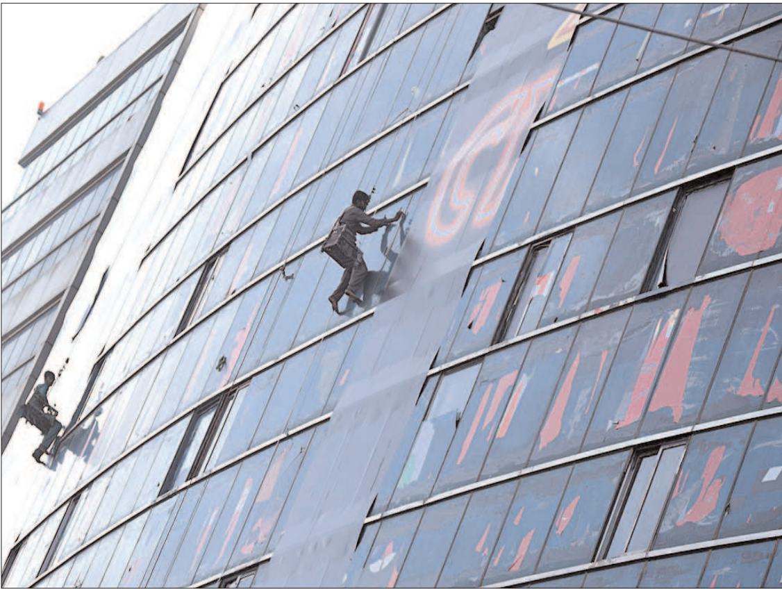
LAHORE: Labourers busy in construction work of Liberty Market.