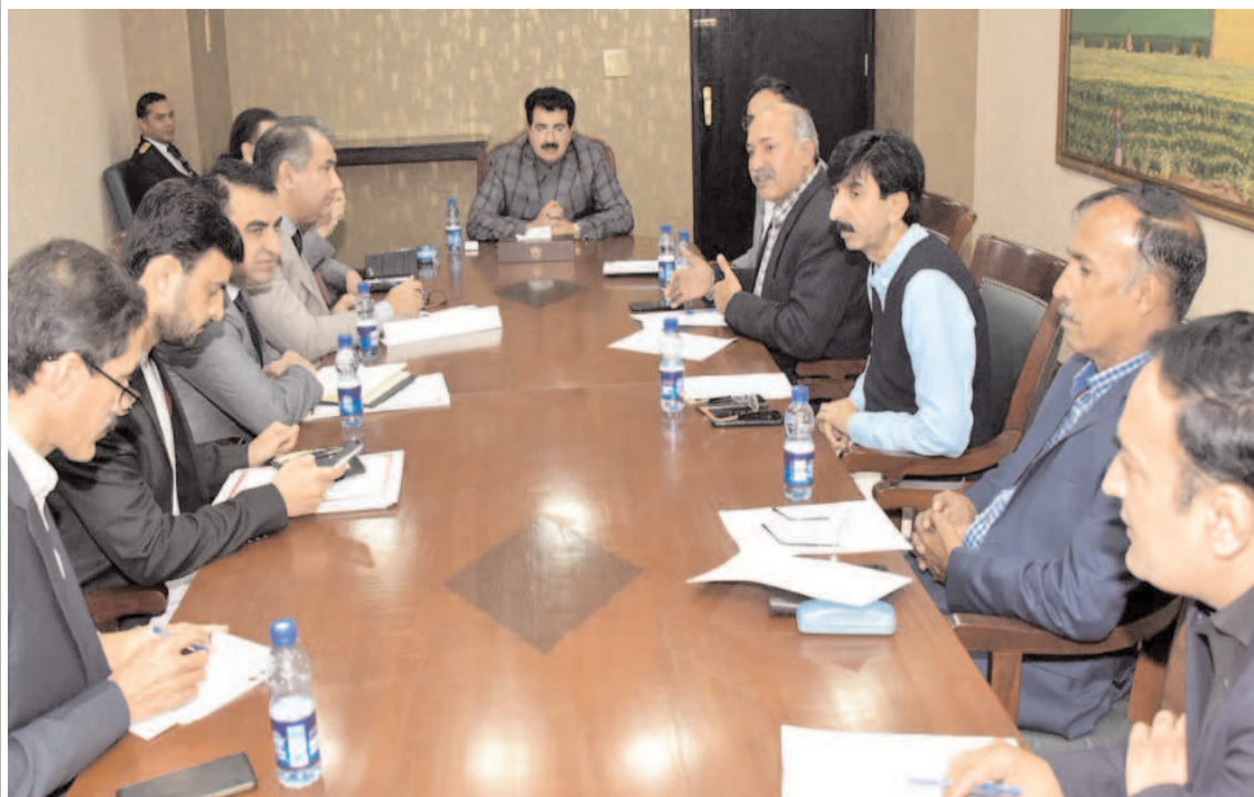
ISLAMABAD: Chairman Senate, Muhammad Sadiq Sanjrani in a meeting with the delegation of Parliamentary Reporters Association (PRA) at Parliament House.

The official said PR owned 167,690 acres of land across the country, of which 90,326 acres were in Punjab, 39,428 acres in Sindh, 28,228 acres in Balochistan, and 9,708 acres in Khyber Pakhtunkhwa.