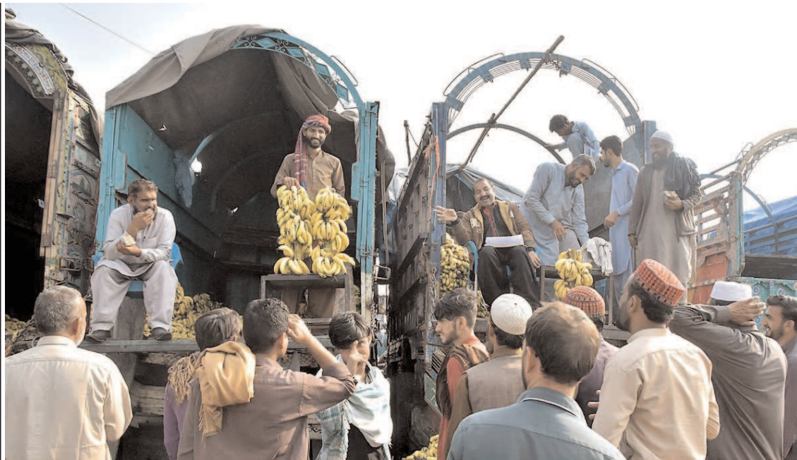
ISLAMABAD: Vendors busy in purchasing bunches of banana from a delivery truck at fruit & vegetable market.

He also extended full support and cooperation of Karachi Chamber to Kenyan High Commissioner for all its future endeavors towards further strengthening the trade and investment cooperation between the two countries.