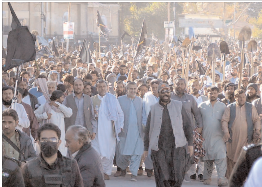
QUETTA: Activists of Zamindar Action Committee holding a protest rally in favour of their demands.

According to details, a reckless driven tractor trolley knocked down a motorcycle. Bike rider youth was killed on the spot in the accident and driver responsible fled the scene. The body was shifted to hospital for post-mortem. The police impounded the tractor trolley and after registering a case against the driver at large started raids for his arrest.