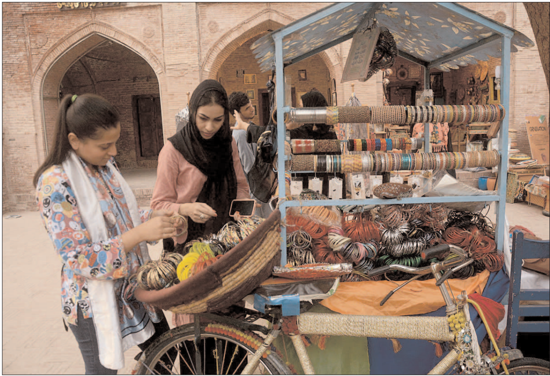
LAHORE: Female vendor displaying bangles to attract customers at her roadside setup.