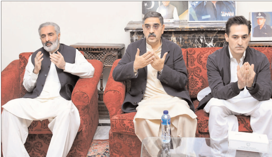
CHARSADDA: Caretaker Prime Minister Anwaar-ul-Haq Kakar offering fateha at the resident of late KP caretaker chief minister Muhammad Azam Khan.

"Without prejudice to the generality of the foregoing the trials of civilians and accused persons, being around 103 persons [...] shall be tried by criminal courts of competent jurisdiction established under the ordinary and/or special law of the land in relation to such offences of which they may stand accused," the short order read.