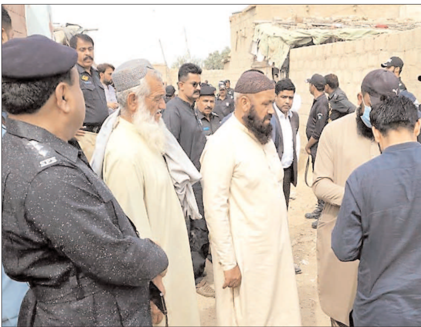
KOTRI: Police officials investigating illegal Afghan immigrants during raid.