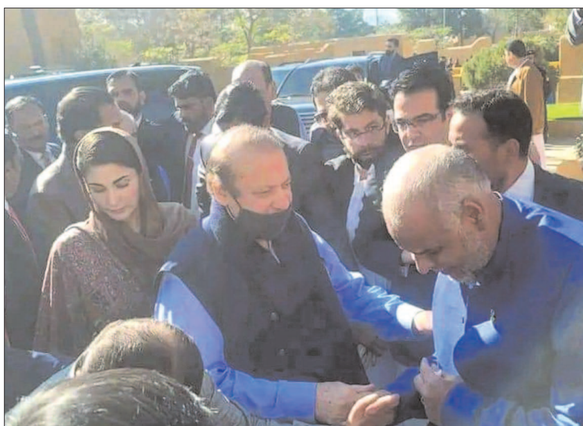
QUETTA: PML-N leaders welcome party chief Mian Nawaz Sharif upon arrival at local hotel.