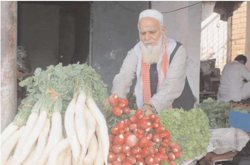
PESHAWAR: An aged vendor waiting for customers at his vegetable shop.