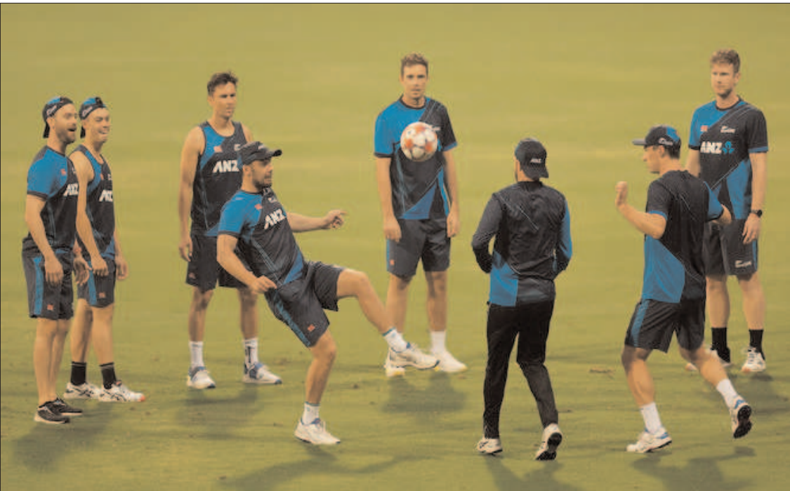
MUMBAI: New Zealand players during practice before semi final match with India at Wankhede Stadium.

LONDON (Agencies): Jude Bellingham has been ruled out of England's final Euro 2024 qualifiers against Malta and North Macedonia, the Football Association announced on Tuesday. Chelsea defender Levi Colwill has also been withdrawn from Gareth Southgate's squad, meaning five players are missing from the initial group announced for the match at Wembley on November 17 and the away fixture three days later. Midfielder Bellingham, 20, who has scored 13 goals so far in a stunning debut season for Real Madrid, and Colwill both have shoulder issues. "Jude Bellingham and Levi Colwill will play no part in England's forthcoming UEFA Euro 2024 qualifiers against Malta and North Macedonia," the FA said in a statement. "The pair arrived at St. George's Park for assessments on Monday but will now return to their clubs to continue their rehabilitation." Manchester United forward Marcus Rashford and Manchester City midfielder Kalvin Phillips will join the squad later this week "owing to personal matters," the FA said. On Monday, Cole Palmer, Ezri Konsa and Rico Lewis replaced the injured James Maddison, Callum Wilson and Lewis Dunk.