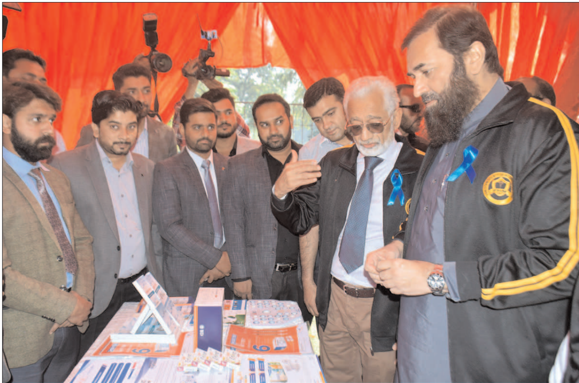
LAHORE: Governor Punjab Muhammad Baligh-ur-Rehman visiting the stalls of Pharmaceutical companies on the occasion of World Diabetes Day at Governor House.

The LESCO has so far charged a total of 47,833,285 detection units worth Rs 2,018,063,755 to all the power pilferers.