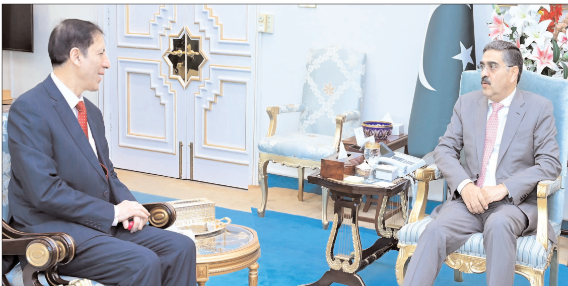
ISLAMABAD: Caretaker Chief Minister Khyber Pakhtunkhwa Justice (retd) Syed Arshad Hussain called on Caretaker Prime Minister Anwar-ul-Haq.