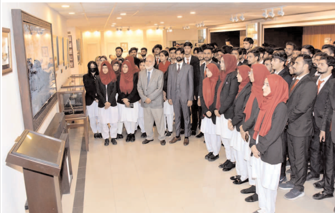
ISLAMABAD: A group of students and faculty members of National Law College, Rawalpindi visiting Senate Museum at Parliament House.

The ANF Khyber Pakhtunkhwa (KP) recovered 18.305 kg drugs in eight operations while arrested eight accused including a woman in drug smuggling and impounded three vehicles. The seized drugs comprised 3.500 kg Heroin, 13.645 kg Hashish, 500 grams Methamphetamine (Ice) and 660 grams Ecstasy Tablets (1000 x Tabs). The ANF Sindh recovered 10.860 kg drugs in three operations while arrested three accused persons including 1 foreigner (Japanese National) in drug smuggling. The seized drugs comprised 6.600 kg Hashish and 4.260 Methamphetamine (Ice). The ANF North recovered 231.103 kg drugs in eight operations while arrested 10 accused including a woman arrested in drug smuggling and impounded four vehicles. The seized drugs comprised 108 kg Opium, 1.687 kg Heroin, 119.600 kg Hashish, 1.816 kg Methamphetamine (Ice) and 1 x Pistol. All cases have been registered at respective ANF Police Stations under CNS Act 1997 (Amended 2022) and further investigations are under process.