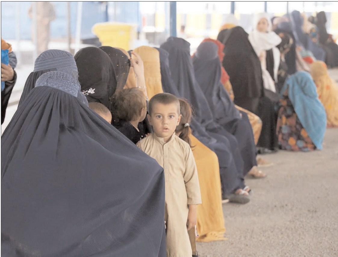
NEWSHERA: Afghan refugees waiting for registration at UNHCR's camp and repatriation centre.

FAISALABAD (INP): Pakistan - Wheat production can be increased by up to 9% and fertilizer use can be reduced by up to 50% by using a seed-cum-fertilizer band placement drill, according to Dr. Khalid Iqbal, Assistant Director of the Department of Agriculture Extension Faisalabad. According to media reports, he said currently, over 550,000 tons of DAP fertilizer are used in wheat production to increase the fertility of phosphorus-deficient agricultural lands. This is putting a strain on the government's foreign exchange reserves, as DAP fertilizer is expensive to import.