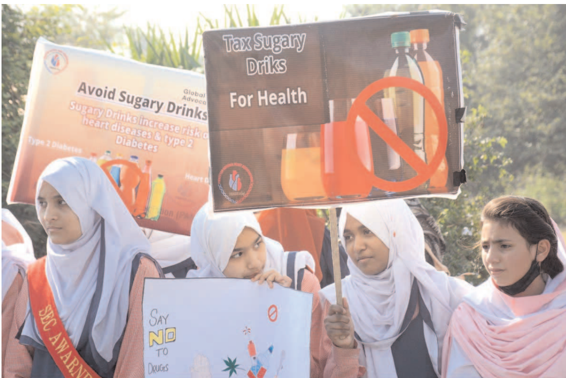
ISLAMABAD: Students holding placards during an awareness walk regarding Diabetes on the eve to mark World Diabetes Day organized by Pakistan National Heart Association at National Press Club Islamabad.