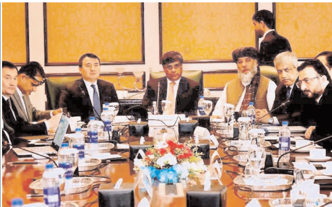
ISLAMABAD: Federal Minister for Commerce Dr. Gohar Ejaz co-chairing Trilateral Trade meeting along with Afghanistan Trade Minister Nooruddin Azizi and Uzbekistan Deputy Prime Minister on Trade and Investment Jamshid Khodjaev.

Earlier, the Traders Alliance Federation leaders and office bearers also spoke on the occasion and pointed out various issues of the business community and suggested a number of proposals for the amicable resolution.