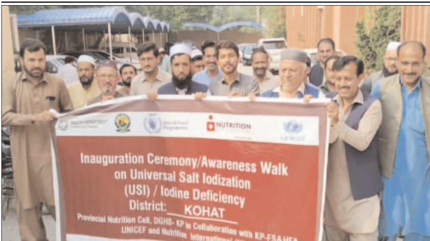
KOHAT: Benazir Nutrition Program and District Health staff holding banner during awareness walk on iodine.