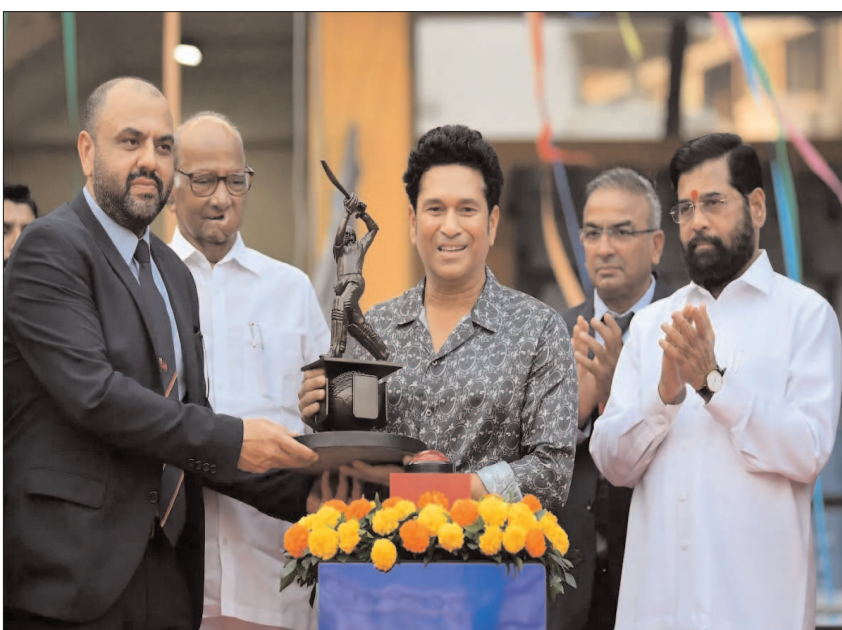
MUMBAI: Sachin Tendulkar was presented with a replica of his statue.

The Kingdom has hosted a raft of major sporting events since 2018, including football, Formula 1, golf and boxing, and will stage football's Club World Cup in December.