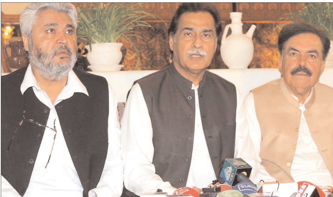
QUETTA: PML-N leader Ayaz Sadiq addressing a press conference.

SHEIKHUPURA (INP): As many as 22 persons fainted due to leakage of gas from a cylinder that fell from one of the bogies of a goods train heading from Sheikhupura to Lahore near Pind Ferozawala on Wednesday. Police officials said that those fainted had been shifted to Tehsil Headquarters Hospital, Ferozawala. However, their condition was stable, they informed. Giving further details, they said that Carbon Dioxide cylinders were loaded on two bogies of the train. But due to inadequate arrangements, they added, one of the cylinders fell down from the moving train. There, the officials added, children of the area opened a regulator of the cylinder which resulted in gas leakage.