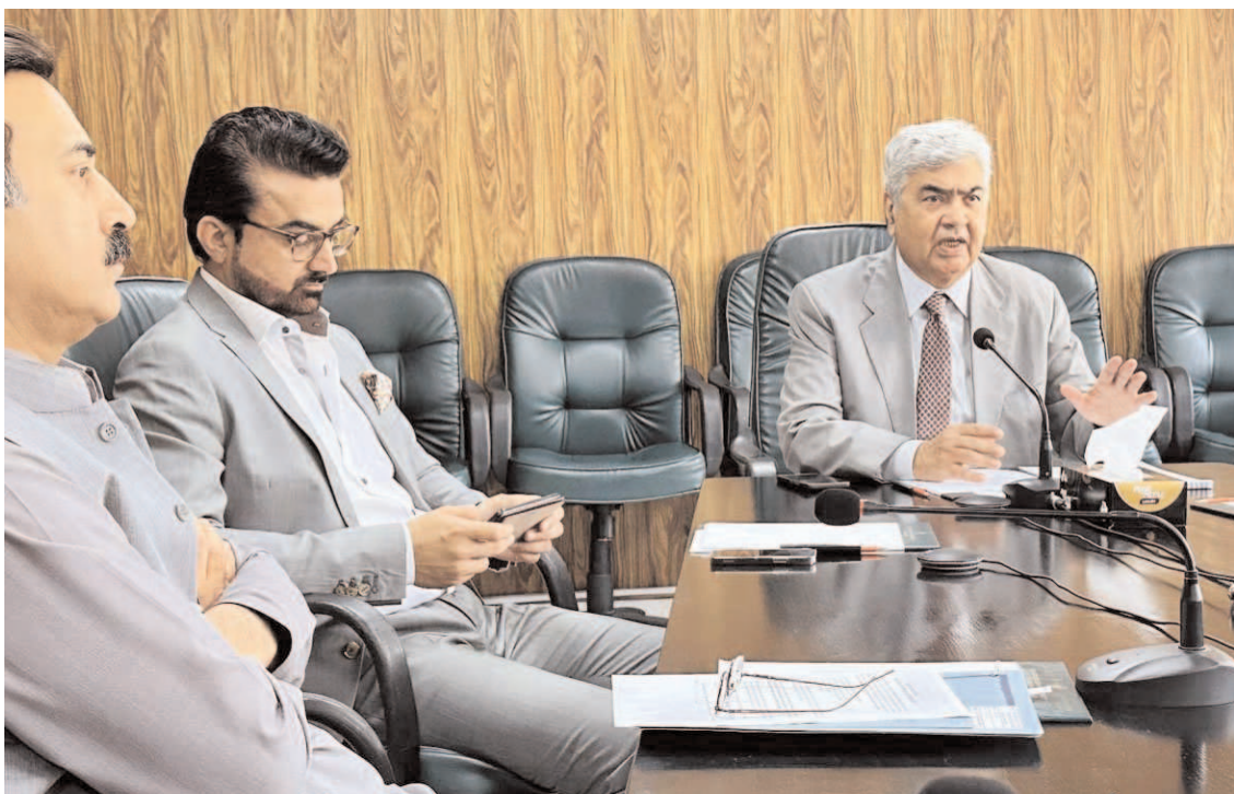
ISLAMABAD: Federal Minister for National Food Security & Research Dr. Kausar Abdullah Malik chairing a meeting of All Pakistan Solvent Extractors Association at Ministry of NFS&R.