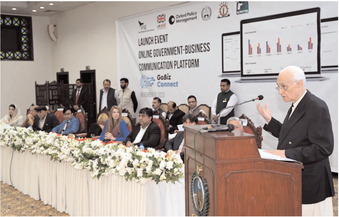
PESHAWAR: Caretaker Chief Minister Khyber Pakhtunkhwa Muhammad Azam Khan addressing launching ceremony of Government-Business Communication Platform (GoBiz Connect).

He said in all the Public Health Engineering Department, Kulachi has to pay Rs 40 million to the PESCO and if this amount was not paid, power supply to its other schemes will also be disconnected.