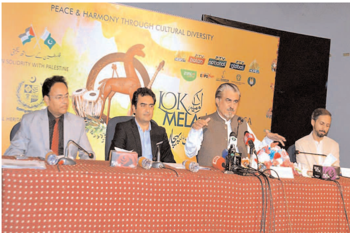
ISLAMABAD: Caretaker Federal Minister for National Heritage and Culture, Syed Jamal Shah addressing media Briefing regarding annual Folk festival "Lok Mela" to be held at Lok Virsa from November 3.

RAWALPINDI (APP): The special magistrates conducted raids on 4,533 shops during the last three days and arrested 38 shopkeepers found involved in price hikes, hoarding and profiteering of essential commodities, on the instructions of Additional Deputy Commissioner General Mujahid Abbasi. A fine of Rs 269,750 was imposed on the shopkeepers in different areas of the city for indulging in profiteering. The ADCG said that the district administration was making all-out efforts to provide maximum relief to the people. He said that the petrol prices had decreased significantly twice during the last month which reduced all the household items but some elements were involved in profiteering. Mujahid said that the district administration does not want to harass anyone by penalty or arrest but to ensure the implementation of fixed prices for essential items.