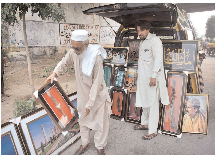
PESHAWAR: Vendor displaying and selling decoration frames to attract customers during his roadside setup at Northern bypass.

The lowest temperature recorded in the province was 02°C in Kalam.