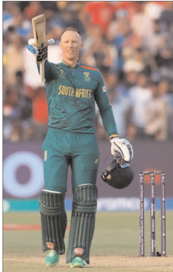
Rassie van der Dussen brought up his century in 101 balls.

New Zealand's task was made harder by a hamstring injury to seamer Matt Henry, who will have a