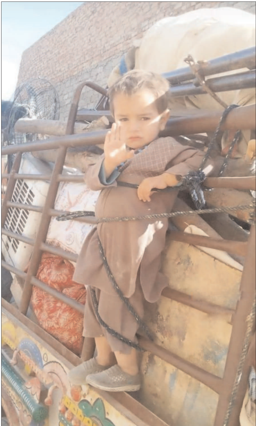
JAMRUD: An Afghan child along with their belongings on truck waving his hand to media persons on way to their country.