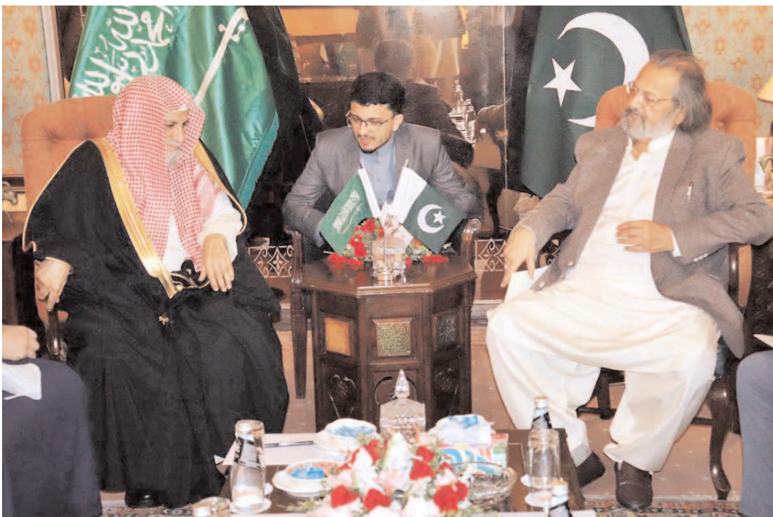
ISLAMABAD: Dr. Salih bin Abdullah al Humaid Imam e Khatib at Masjid al Haram met with the Caretaker Minister for Federal Education and Professional Training Mr. Madad Ali Sindhi.