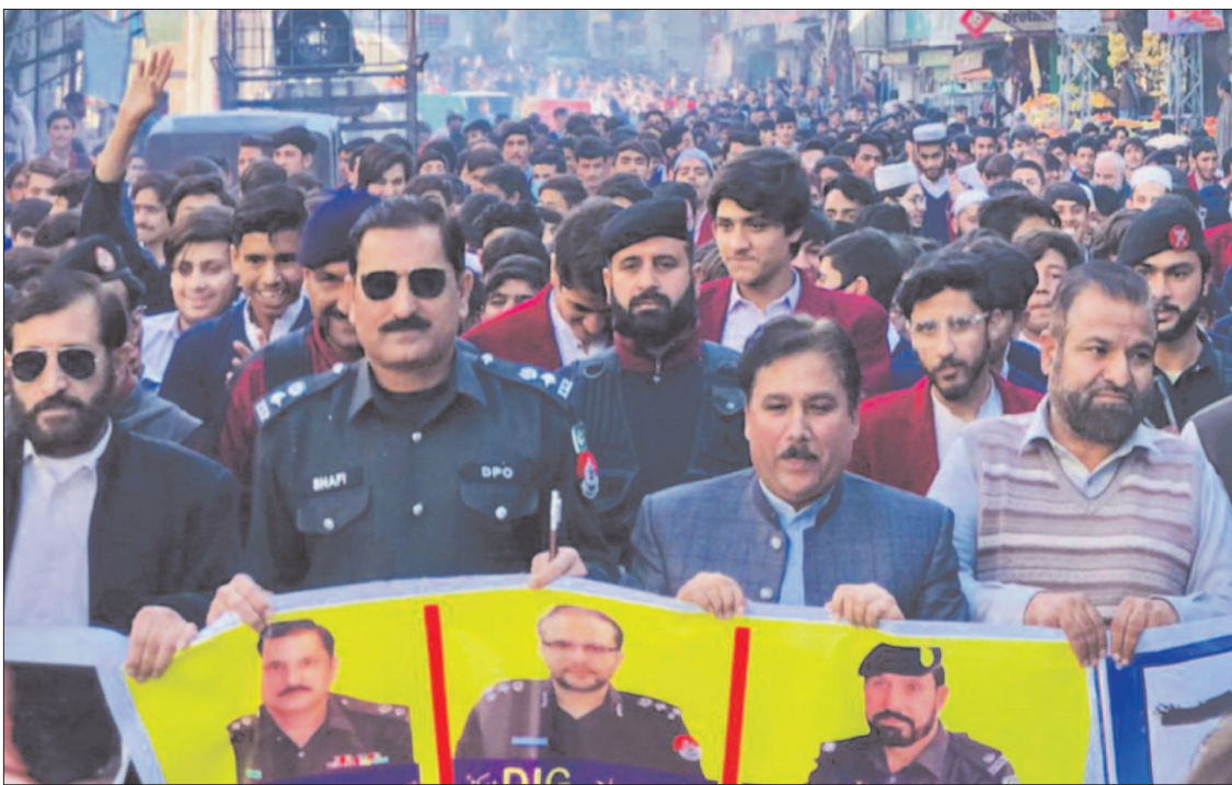
MINGORA: People holding a rally regarding awareness on narcotics in Swat.