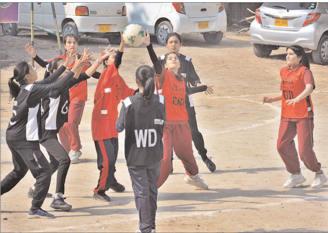
HYDERABAD: A view of netball match played between Pigged Memorial Girls Higher Secondary School and Government Girls High School Latifabad teams during PNF Netball Cup 2023 at Shah Latif Girls College.

This pioneering partnership between Cadbury Dairy Milk, PCB, and Khelo Cricket is a significant step towards fostering gender equality and nurturing talent in women's cricket. It is poised to make a lasting impact by empowering women cricketers to contribute to the growth of cricket in Pakistan and highlighting the country's potential for equitable opportunities in sports.