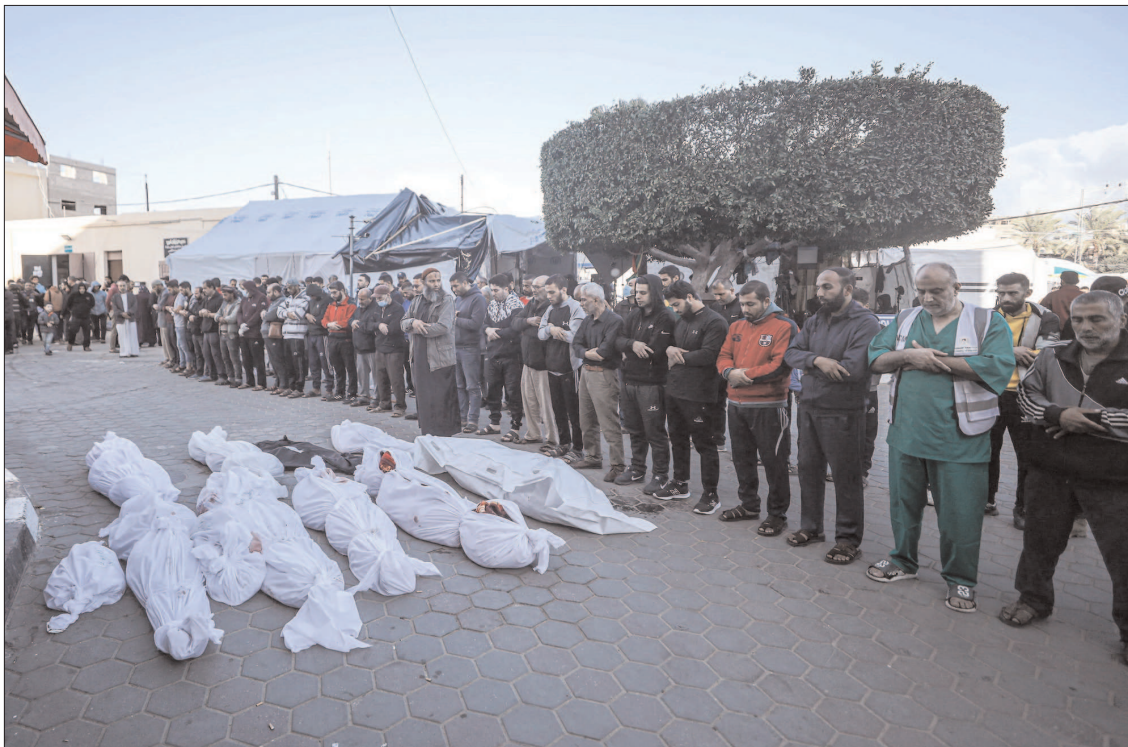
GAZA: Relatives of Palestinians who lost their lives in Israeli attacks offering funeral prayers after the bodies were taken from the morgue of Al-Aqsa Martyrs Hospital in Deir el-Balah.