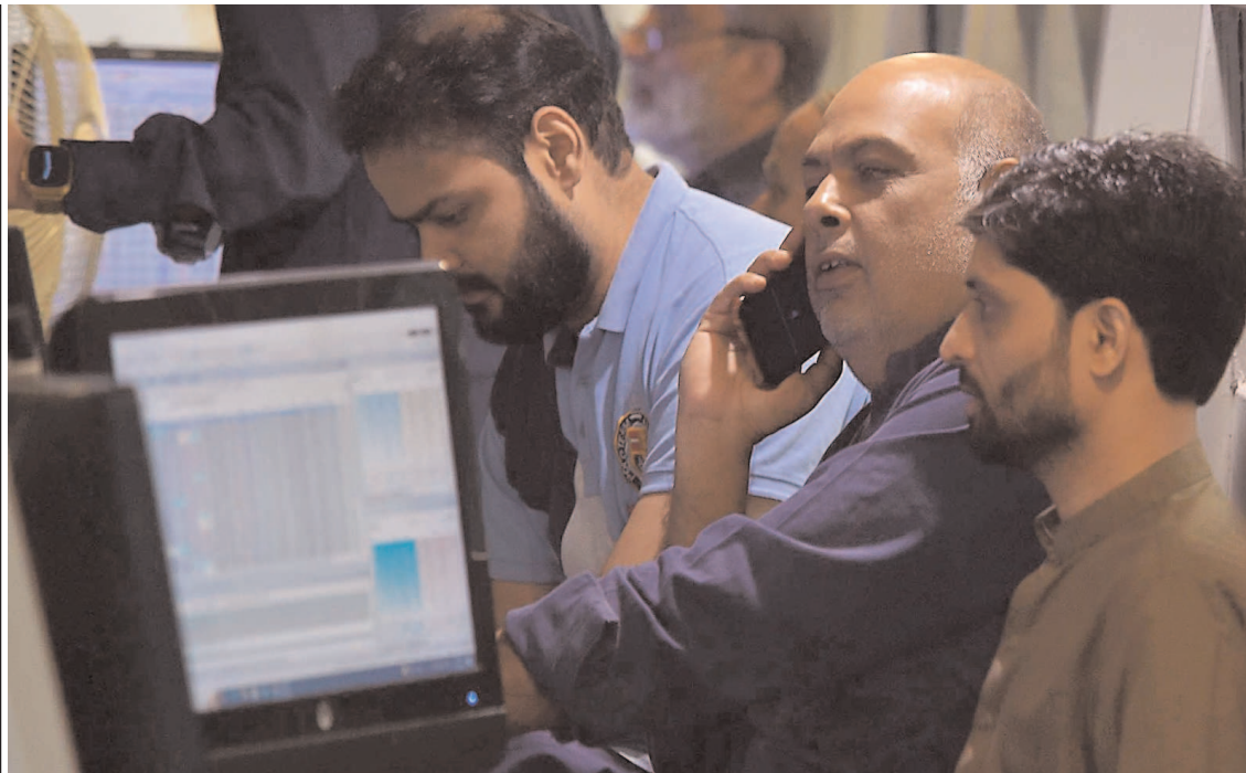
KARACHI: Pakistani stockbrokers monitor share prices during trading session at Pakistan Stock Exchange.

Over 680 new achievements were unveiled during the event, and the cumulative transaction volume reached USD 5.226 billion, demonstrating the significant economic impact and success of the fair, according to Gwadar Pro.