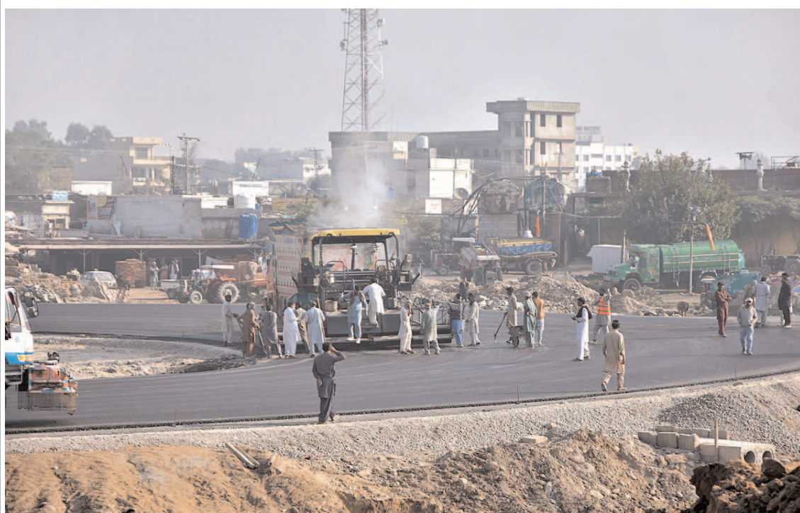
ISLAMABAD: Heavy machinery being used for extension work of Islamabad Expressway during development work in Federal Capital.

Regional Connectivity is an important aspect of the Pakistan Railway development framework. Presently, Pakistan Railway had planned to improve its functional links with regional countries, including India and Iran, he added. Furthermore, the official said the following new rail links would be established, including the Uzbekistan-Afghanistan-Pakistan (UAP) Railway Connectivity Project through Kohat-Kharlachi.