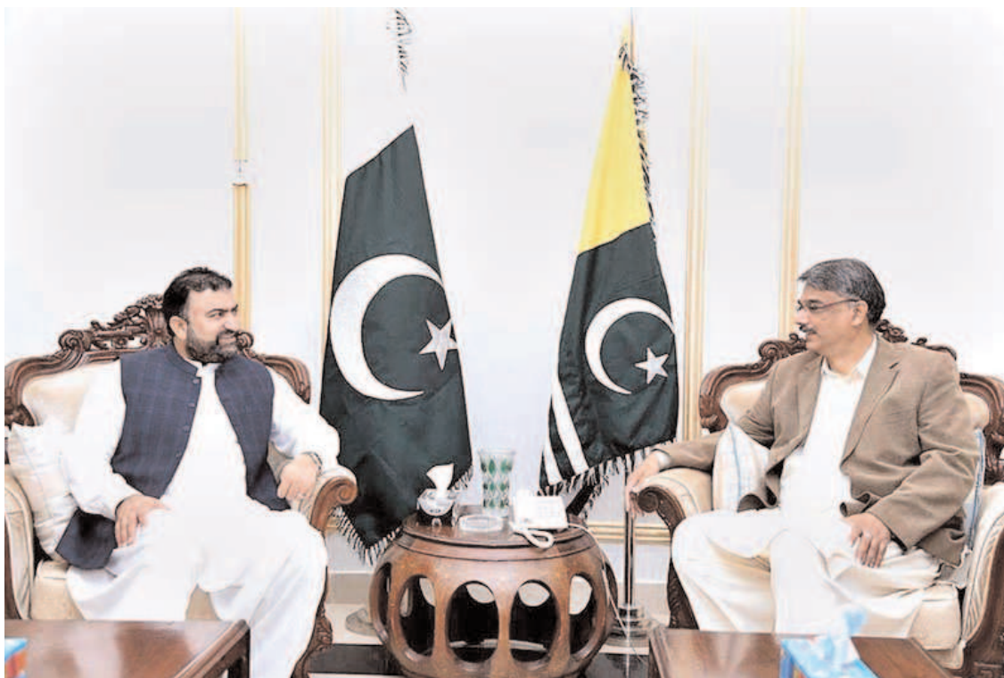
ISLAMABAD: Caretaker Federal Minister for Interior Sarfraz Ahmed Bugti in a meeting with the Prime Minister of Azad Jammu and Kashmir Chaudhry Anwar ul Haq.