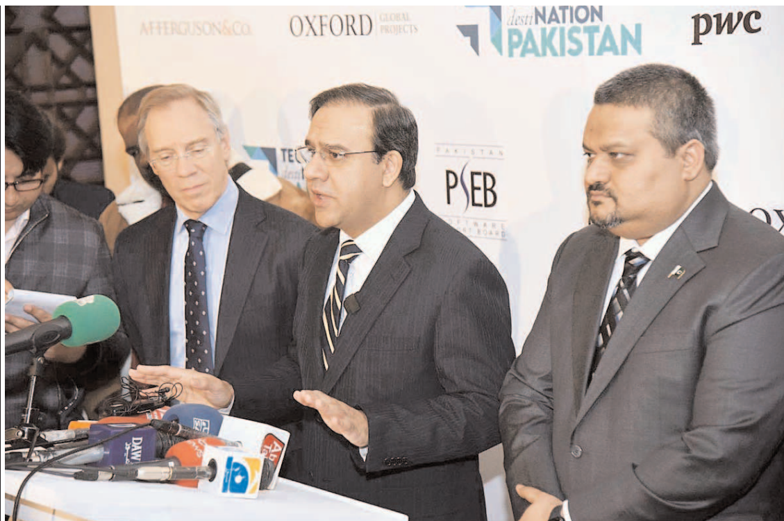
ISLAMABAD: Caretaker Federal Minister for IT and Telecommunication Dr. Umar Saif talking to media after launching ceremony of IT Export Strategy.

The cohosts of PSDE's 37th Annual Conference, organized by PIDE, include the World Bank Group, UNICEF, RASTA, the Bank of Punjab, Pakistan Poverty Alleviation Fund, Saudi Pak Agricultural and Industrial Investment Company, and BZU School of Economics.