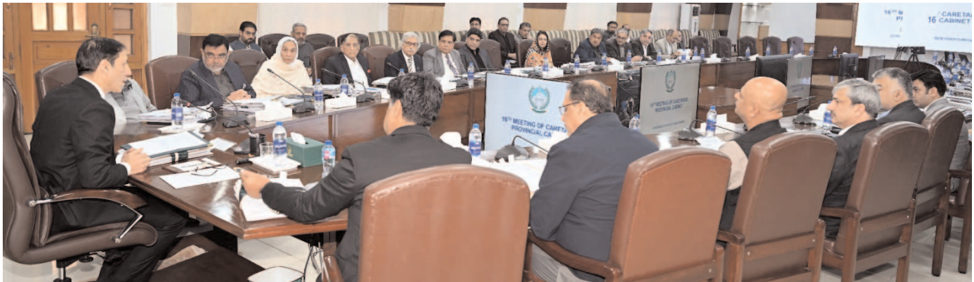
PESHAWAR: Caretaker Chief Minister Khyber Pakhtunkhwa Justice (R) Syed Arshad Hussain Shah chairing 16th meeting of Provincial Cabinet.