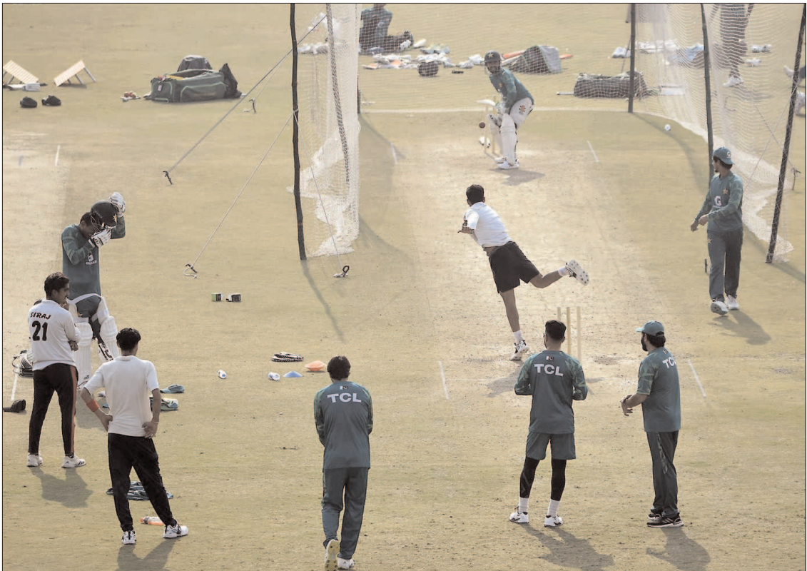
RAWALPINDI: Pakistan Cricket team squad attend a practice session, ahead of their Australia tour to play three-match Test series at the rawalpindi Cricket Stadium.

BENGALURU (Agencies): A record 518 million Indian viewers watched the recently concluded men's cricket World Cup matches on Walt Disney-owned television channels during the 48-day event, the entertainment firm said on Thursday. Disney had bought digital and streaming rights to show the International Cricket Council's tournaments in India from 2024 to 2027 by paying around $3 billion. Its Hotstar streaming app set a concurrent viewership record of 59 million during the final match of the World Cup, the company said in a statement. The numbers offer some relief for the Burbank-headquartered entertainment giant's India unit, which is exploring options of finding a joint venture partner or selling its business. It has offered free streaming of World Cup cricket on smartphones in India, part of a strategy to boost advertising revenue and offset the impact of a subscriber exodus.