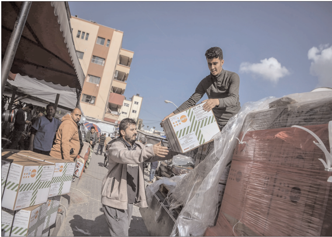
GAZA: A truck carrying medical supplies arrives at the Nasser Medical Complex in Khan Younis.