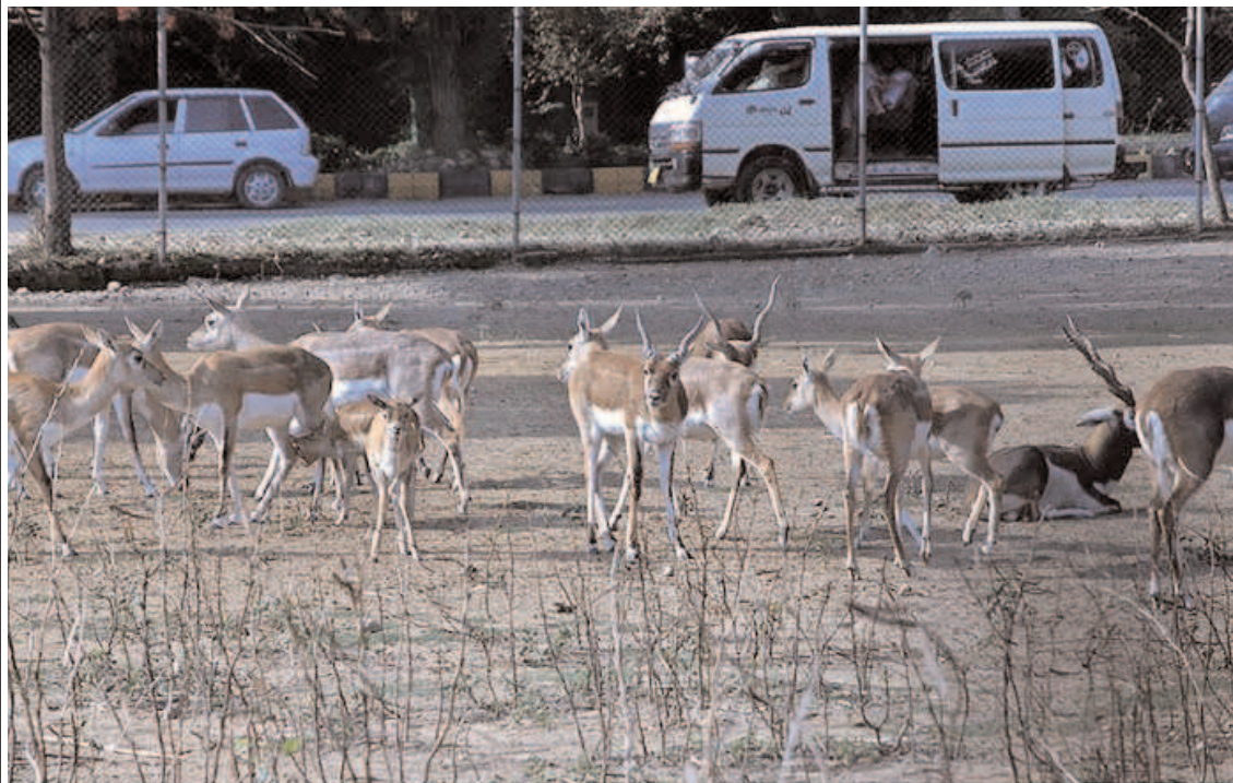
ISLAMABAD: A herd of deer at Zoo near Faisal Mosque in Federal Capital.

The official said PR owned 167,690 acres of land across the country, of which 90,326-acre was in Punjab, 39,428-acre in Sindh, 28,228-acre in Balochistan, and 9,708-acre in Khyber Pakhtunkhwa.