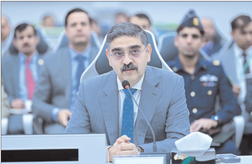
ISLAMABAD: Caretaker Prime Minister Anwaar-ul-Haq Kakar giving his remarks during his visit of NEOC.