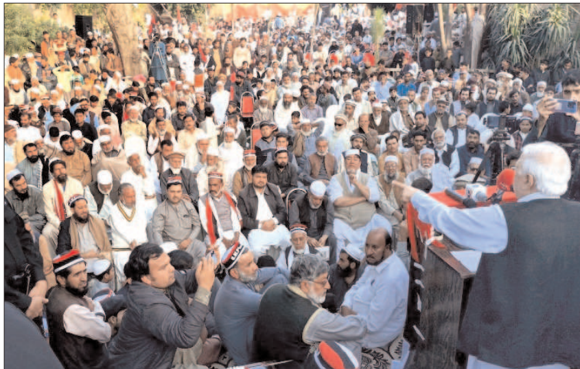
CHARSADDA: Chairman of Qaumi Watan Party Aftab Ahmad Khan Sherpao addressing party workers in Shabqadar.

He reiterated the resolve that no effort would be spared to work for the well-being and prosperity of the Pakhtuns. "We will not rest until the Pakhtuns get their due rights," he vowed. Aftab Sherpao said the QWP was striving to get the rights of the Khyber Pakhtunkhwa enshrined in the constitution. Commenting on the prevailing political situation, he said that election was the only way to steer the country out of the crises.