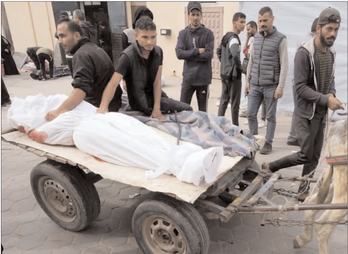
GAZA: Palestinians bring the body of a relative killed in the Israeli bombardment to a morgue in Deir el-Balah.