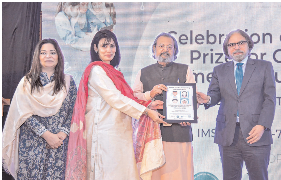
ISLAMABAD: Education Minister Madad Ali Sindhi attended the celebration of UNESCO prize for Girls' and Women's Education 2023 received by Pakistan Alliance for girls education.

Islamabad Capital Police is taking proactive measures to enhance the city's traffic system and provide improved travel facilities for its residents.