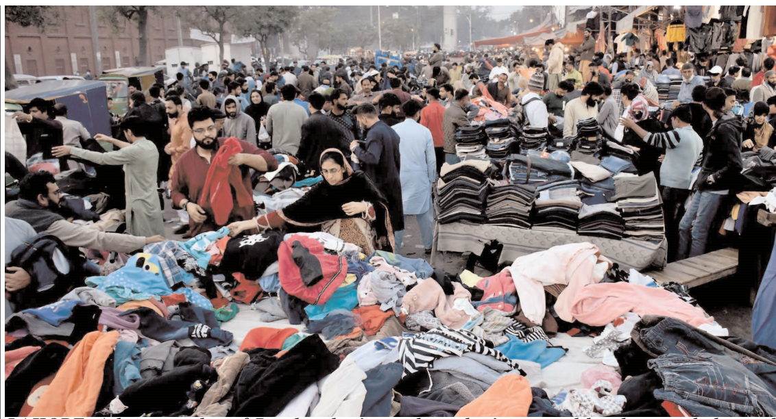
LAHORE: A large number of People selecting and purchasing second hand warm clothes and different winter stuff from the vendors at Landa Bazar.