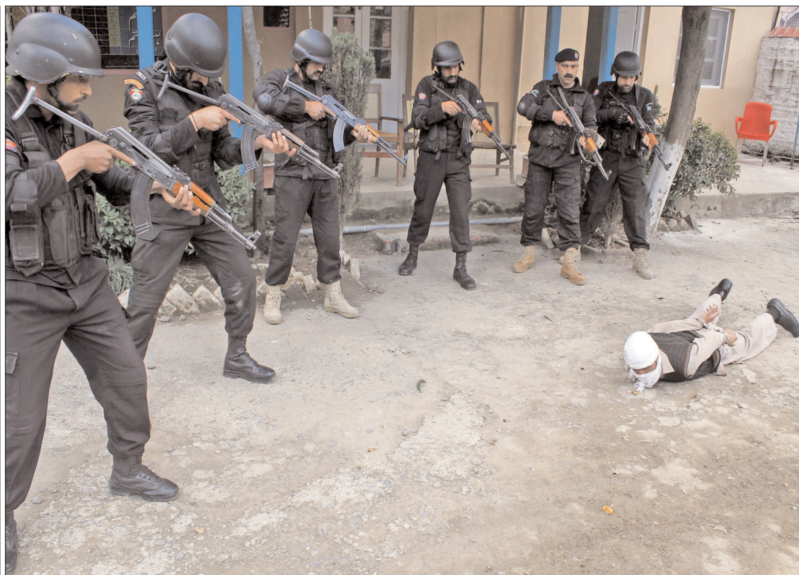
ABBOTTABAD: Elite force personnel standing alert during mock exercise in a school.

The FIA Composite Circle on an intelligence tip-off raided a godown in Ghona Faisalabad. During operation, over 10,000 litres of smuggled fuel worth Rs2.2 million was seized and an accused Muhammad Asif was arrested.