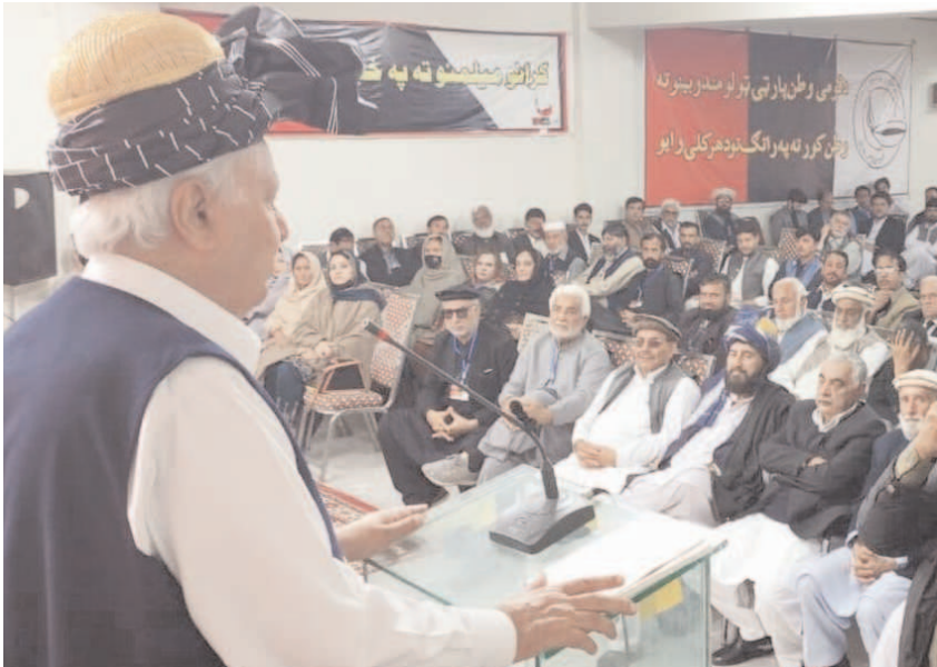
PESHAWAR: Chairman Qaumi Watan Party Aftab Ahmad Khan Sherpao addressing during meeting of federal and provincial councils of QWP.