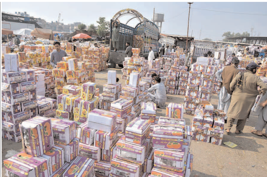
ISLAMABAD: Vendors waiting for customers to sell fruit boxes at fruit and vegetable market.