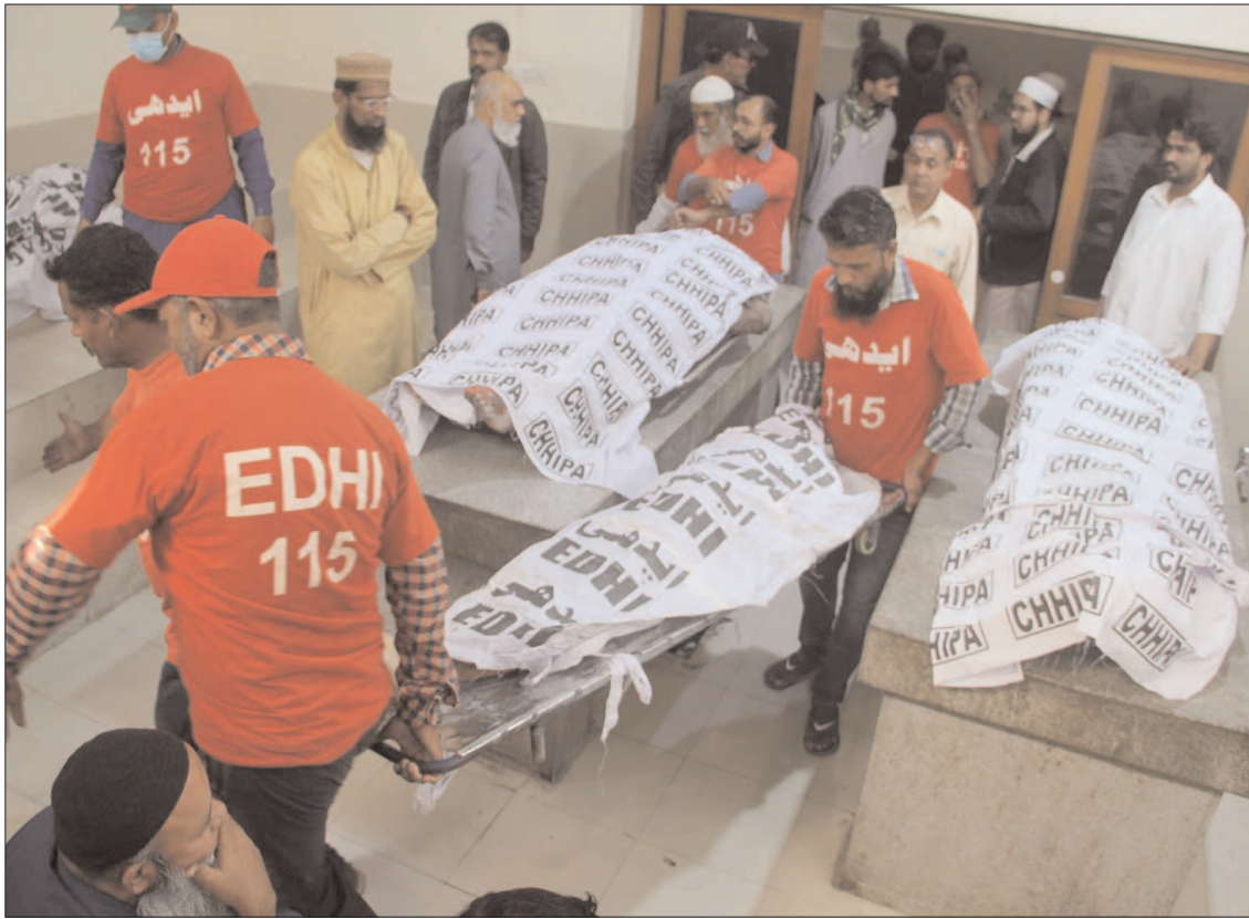
KARACHI: Rescue workers shifting bodies to hospital after fire erupted at shopping mall.

The Election Commission of Pakistan (ECP), Caretaker Prime Minister Anwar-ul-Haq Kakar, and others are named as respondents in the petition. The lawyer contended that the legal tenure of the Caretaker Prime Minister's tenure expired on November 15. The petitioner also noted that neither the Election Commission nor any constitutional court has granted an extension to Anwar-ul-Haq Kakar's tenure after November 15.