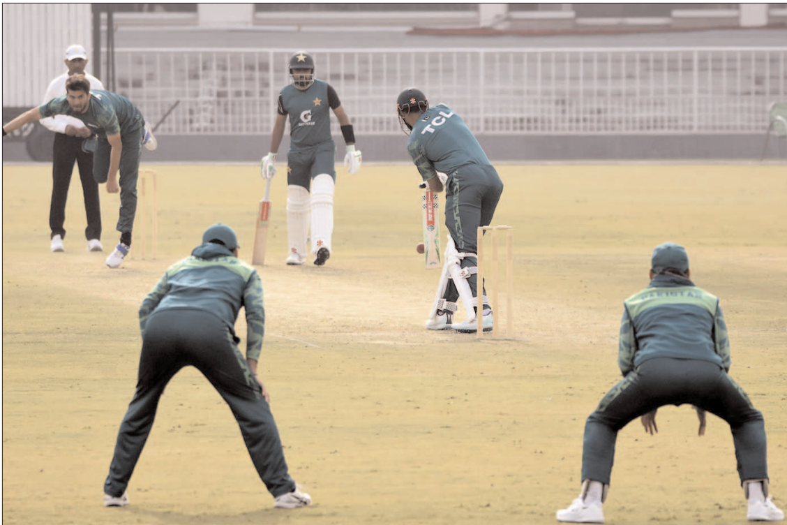
RAWALPINDI: Pakistan Cricket team members take part in practice match, ahead of their Australia tour to play three test match series at the Pindi Stadium.

KARACHI (Monitoring Desk): Former Pakistan Test cricketer Rashid Latif commented on Imad Wasim's shocking decision to hang his boots from international cricket. Imad Wasim's decision to retire from international cricket did not go well with Rashid Latif, who stated that the all-rounder should reverse his decision. The former wicketkeeper said the all-rounder is Pakistan's best spin bowler and a handy batter and also that the country will suffer in next year's ICC T20 World Cup 2024. "Imad Wasim should reconsider his retirement decision. He is Pakistan's best spinner and can be very helpful in batting as well. If the team's most effective player isn't in the World Cup, it's not just Imad's loss, it's Pakistan's loss," Rashid wrote. Rashid Latif emphasized that players who wish to participate in leagues should be released from their central contract, while still remaining available for