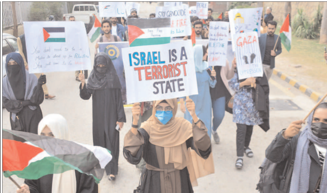
RAWALPINDI: Students of different medical colleges holding placards during protest rally to show solidarity with the oppressed Muslims of Palestine.

He recalled that he had visited the sacred land of Pakistan three times, commenting that facilities and arrangements for pilgrims improved every time. He said that Sikh yatrees were contented with the opening of the Kartarpur Corridor, adding, "We are grateful to the Pakistan government, particularly the ETPB, for making arrangements for protection of Gurdwaras in Pakistan."