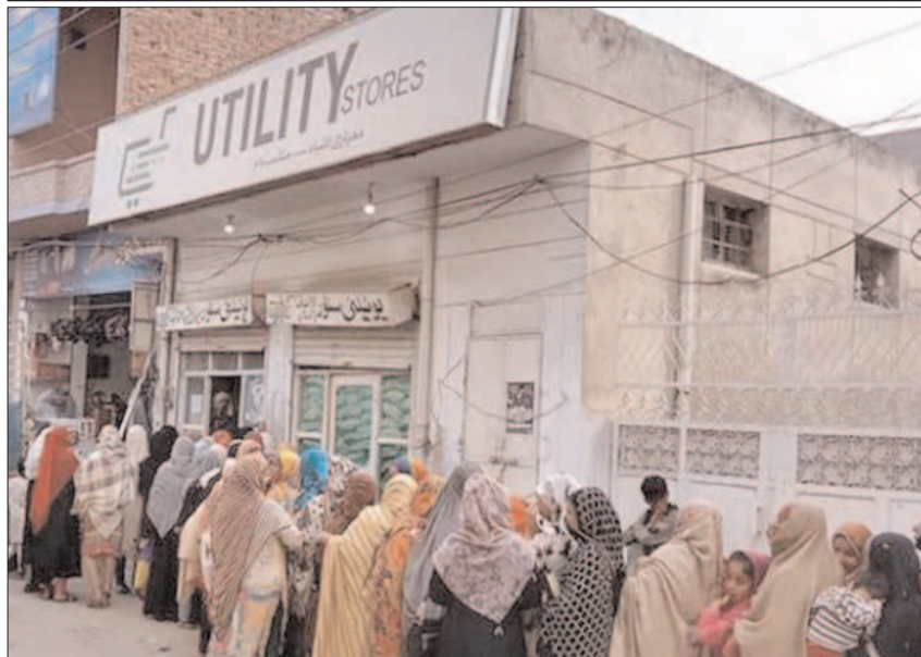
CHINIOT: A lengthy line of women patiently waits for their turn to buy flour and ghee at subsidized rates from the Government at Kachery Road Utility Store.

Taking to X, PTI's Omar Ayub Khan claimed that the police resorted to firing on the PTI workers who arrived to participate in party's convention. "The Election Commission of Pakistan should tell if it is busy in holding rigged elections?" he wrote.