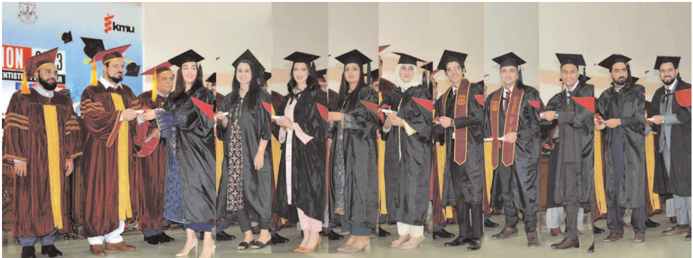
PESHAWAR: Governor Khyber Pakhtunkhwa Haji Ghulam Ali giving Degrees to students during annual convocation of Khyber College of Dentistry 2023.