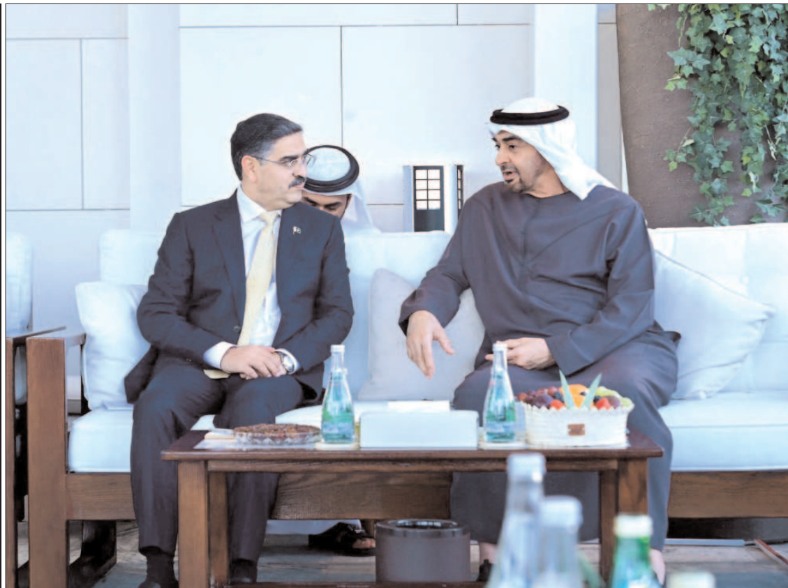
ABU DHABI: The Caretaker Prime Minister Anwaar-ul-Haq Kakar meets the President of the United Arab Emirates His Highness Sheikh Mohamed bin Zayed Al Nahyan.

Polio teams will go door-to-door and administer oral polio vaccine drops to children under the age of five, private news channels reported.