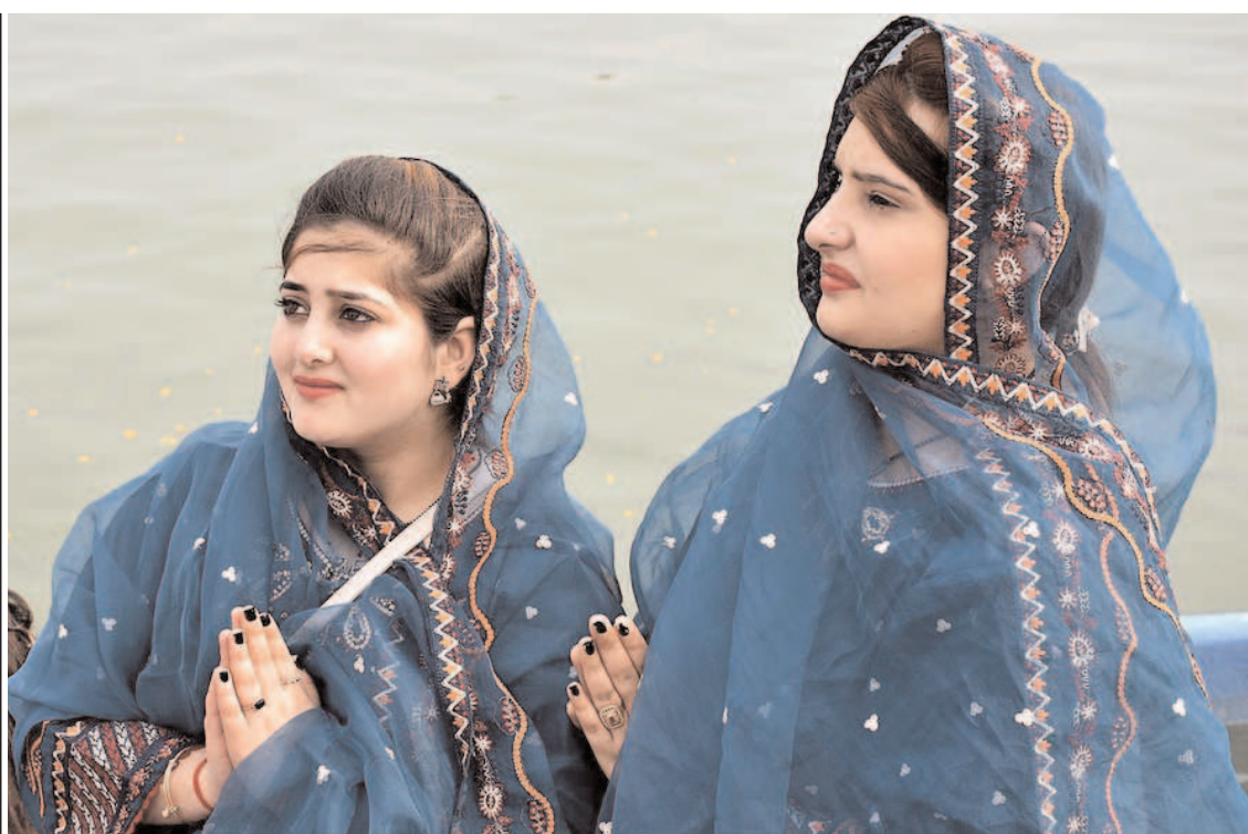
NANKANA SAHIB: Sikh women yatrees performing her religious rituals on occasion of 554th birth anniversary of Guru Nanak Dev.