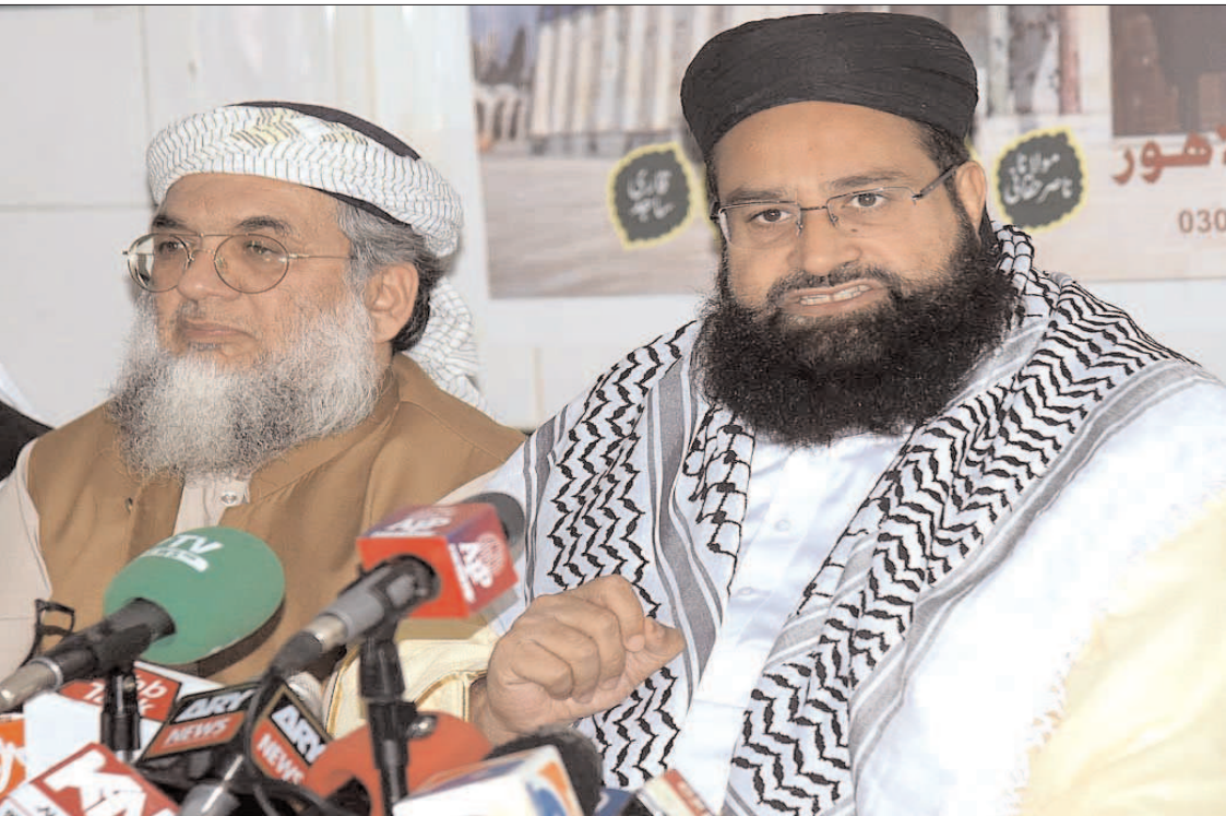
LAHORE: Special Assistant to Prime Minister on Interfaith Harmony Maulana Tahir Ashrafi addressing to media during Palestine Solidarity Seminar at Jamia Manzoorul Islamia Cantt.