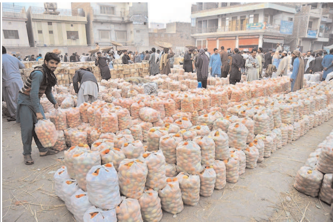
MULTAN: Vendor displaying tomatoes bags for bidding at vegetable market.

The price of gold in the international market increased by $29 to $2,062 from $2,033, the Association reported.