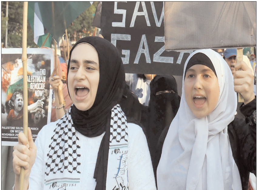
KARACHI: Members of civil society holding placards and Palestinian flags during a protest march to show solidarity with Palestinian people.

Guterres briefed the Security Council on the implementation of a resolution it adopted earlier this month that called for humanitarian pauses in fighting to allow aid access and the release of all hostages held by Hamas. — Arab News