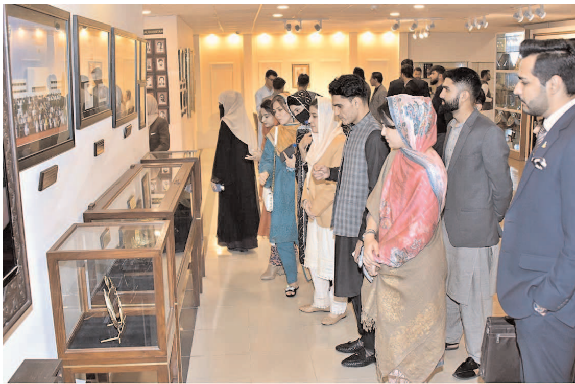
ISLAMABAD: A group of students from various universities of Pakistan under model council of common interests (CCI) project of the Hanns Seidel Foundation (HSF) visiting Senate Museum at Parliament House.