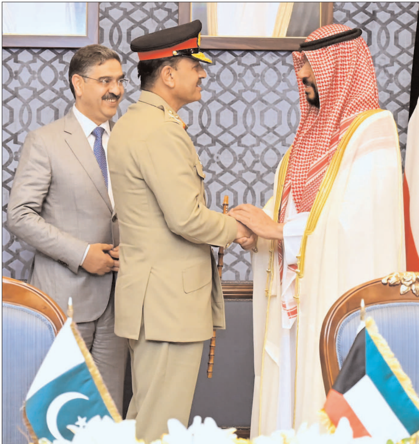
KUWAIT CITY: First Deputy Prime Minister and Minister of Interior of Kuwait Sheikh Talal Al-Khaled Al-Ahmad Al-Sabah shaking hands with Chief of Army Staff General Syed Aism Munir, while Caretaker Prime Minister Anwaar-ul-Haq Kakar also present.