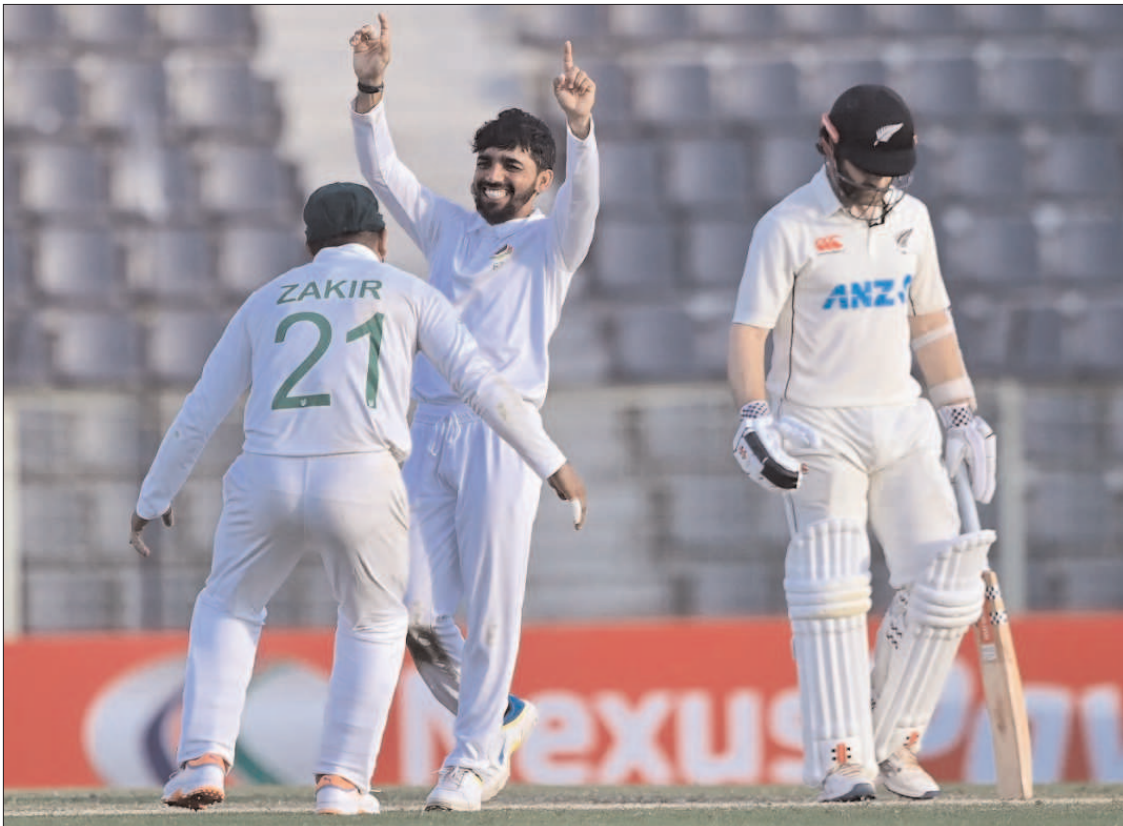
SYLHET: Mominul Haque broke through the 78-run between Kane Williamson and Glenn Phillips.

BARCELONA (Agencies): Barcelona came back from a goal behind to beat Porto and seal a spot in the Champions League last 16. Brazilian winger Pepe hammered home a rebound to give the Portuguese visitors the lead after half an hour. However, Porto's advantage lasted just two minutes as Joao Cancelo equalised with a stunning curling strike after cutting inside from the left. Porto goalkeeper Inaki Pena made several fine saves before Joao Felix tucked home a 56th-minute winner. Barcelona are guaranteed to qualify from Group H with Porto and Shakhtar Donetsk - who are both three points behind - playing each other in their final game. Although they have not yet won the group, they will only need to avoid defeat against point-less Royal Antwerp to finish top.