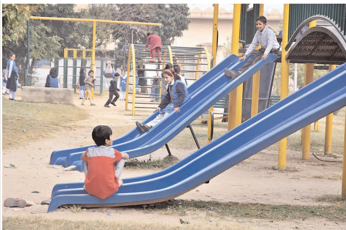
ISLAMABAD: Students enjoying swings at a local park near G-6 area in the Federal Capital.

Parents and teachers are encouraged to collaborate in preventing youth from falling victim to drugs. The police teams have appealed to the public to immediately inform the police about any drug-related activities in their vicinity. The cooperation of the public is deemed crucial for the successful eradication of this menace.