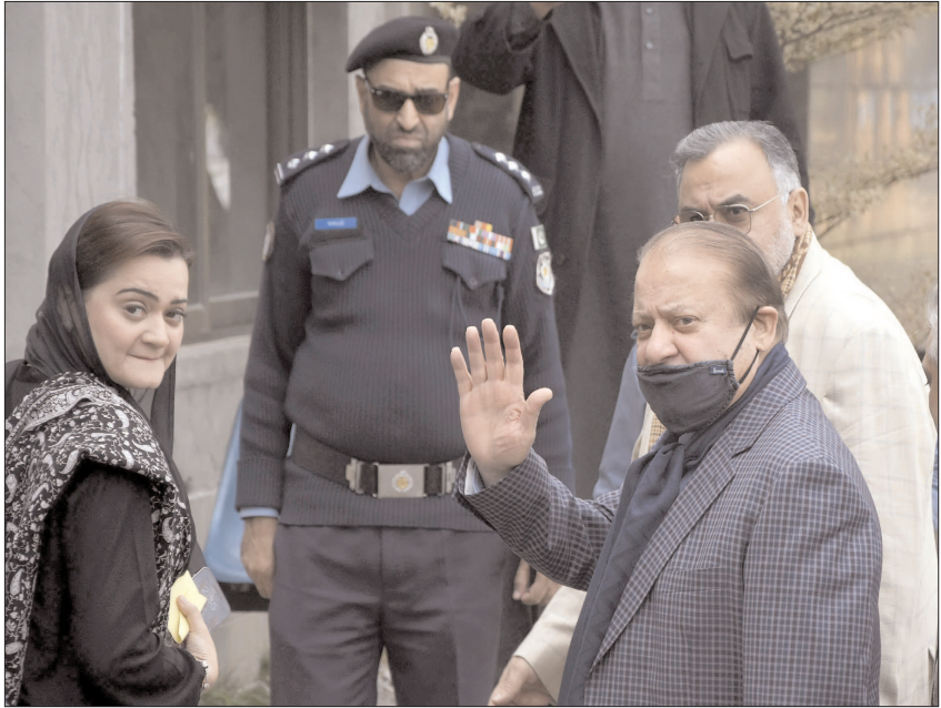
ISLAMABAD: PML-N leader Mian Nawaz Sharif waving hand during arrival at High Court for hearing.