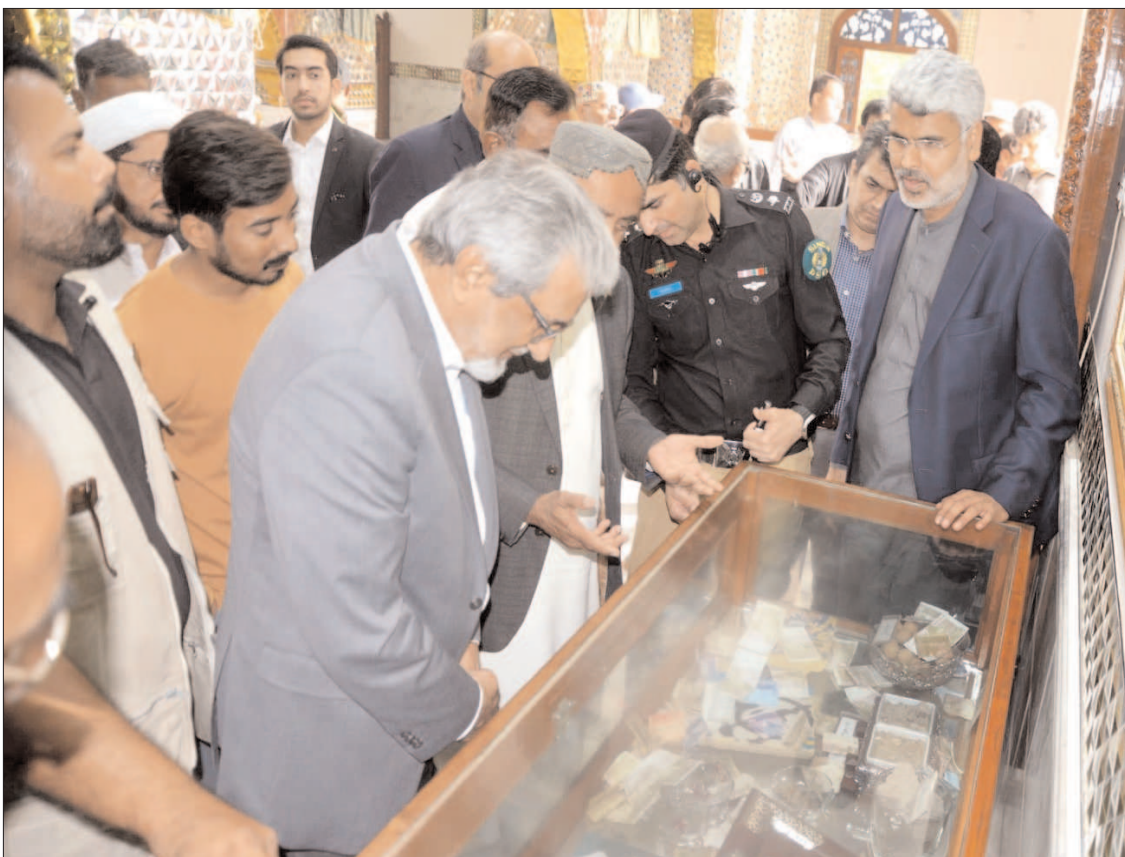
HYDERABAD: Caretaker Chief Minister Sindh Justice (R) Maqbool Baqir visits Qadam Gah Moula Ali.