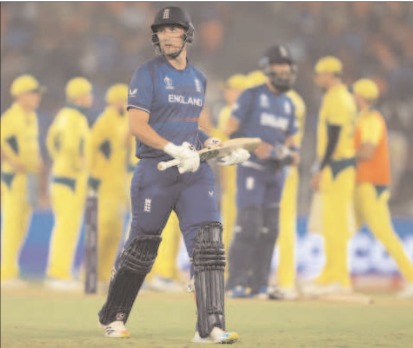
AHMEDABAD: Liam Livingstone of England makes their way off after being dismissed during the ICC Men's Cricket World Cup India 2023.

mixed affair, with four successive wins followed by four defeats. But regardless of their final position in the table, they have unearthed a star in 23-year-old Ravindra, who became the first New Zealand batter to score three centuries in a World Cup and the first batter ever to do so in their debut tournament. He is a classical left-hander who possesses a valuable skillset, matching his style and class with the ability to score quickly in a manner that looks effortless, exemplified by reaching his century from just 88 balls. The calmness of Williamson, making his return from a fractured thumb that he suffered in New Zealand's win over Bangladesh, made him Ravindra's perfect companion and the pair treated the enthusiastic Bengaluru crowd to an array of eye-catching drives, lofted sixes and deft touches to the boundary. Defeat felt cruel on the pair, but as a side they can be buoyed by the positivity of Williamson's return, batting with such fluency it was as if he had strode to the middle straight from a net session. Their batting line-up is significantly stronger with him in it, but is screaming for assistance from the bowlers. Seamer Henry has been officially ruled out by a hamstring injury and replaced by Kyle Jamieson, which gives New Zealand another pace option, and they will be hoping that Ferguson can recover quickly from his wrist injury in time for a key encounter against Sri Lanka on 9 November.