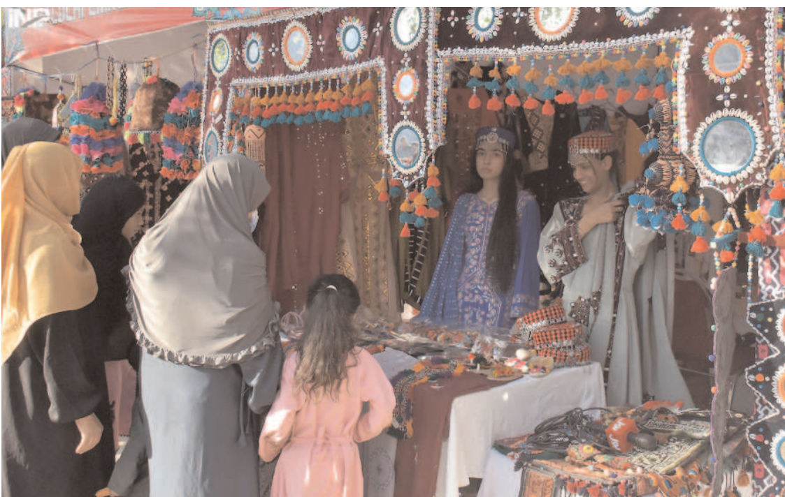
ISLAMABAD: A girl takes an interest in the handmade item in balochistan pavilion during the 10-day annual Lok Mela at Lok Virsa.