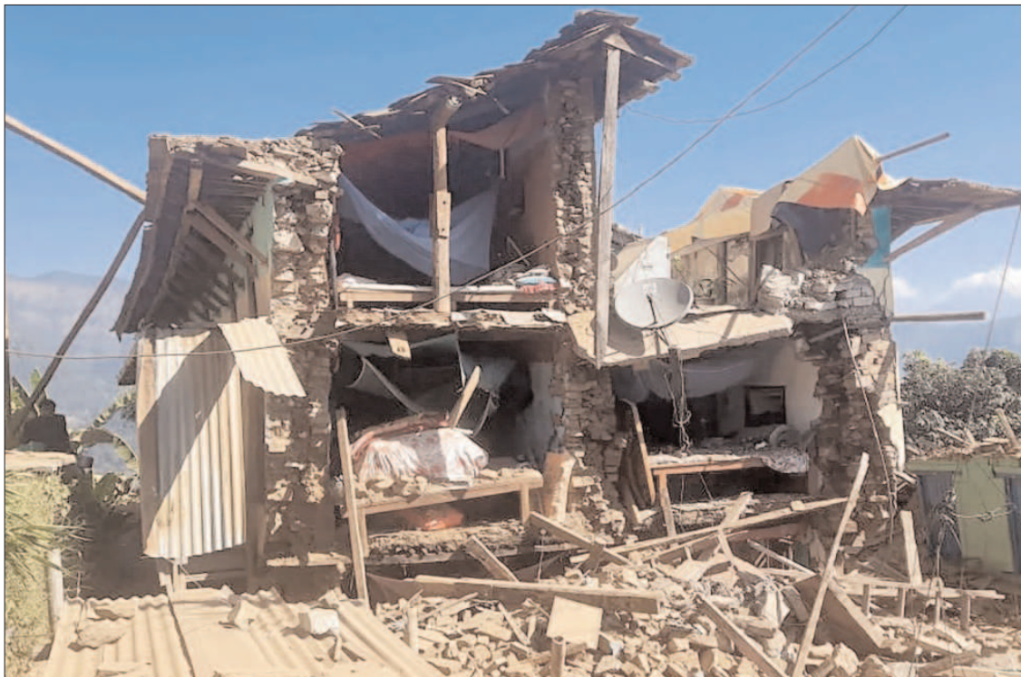
KHATMANDU: Damaged houses lie in ruins in the aftermath of an earthquake at Pipaldanda village in Jajarkot district, Nepal.