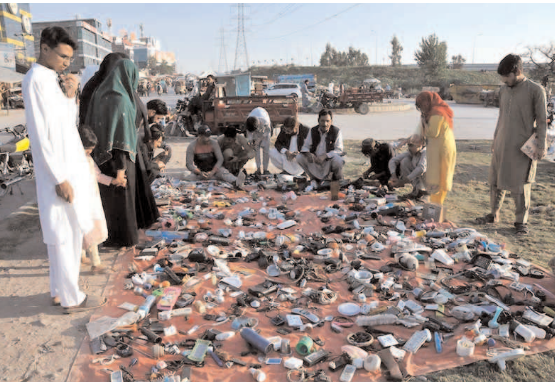
ISLAMABAD: People purchasing used items from a roadside vendor at Khanna Pull.

"We might hypothesize that an early and effective treatment of psoriasis would restore the dysfunction and eventually prevent the future risk of myocardial infarction and heart failure associated with it," Piaserico added.