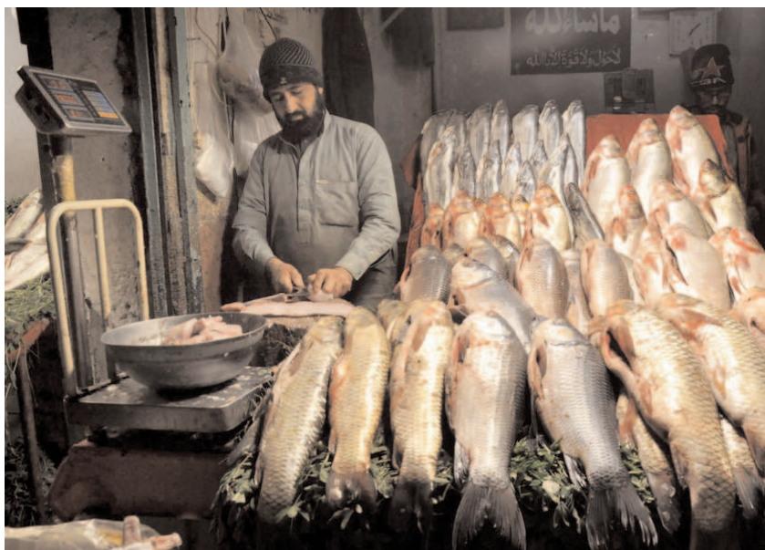
PESHAWAR: A shopkeeper selling fish in market Ganta Ghar Bazaar.