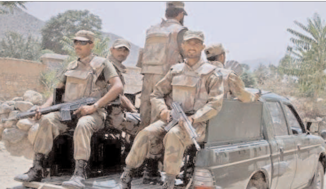
MIANWALI: Security personnel travelling in a military vehicle after terrorist attack on PAF's Training Air Base.

The Pakistani envoy also countered Canada's call for the release of Israeli hostages, but not the thousands of Palestinians arbitrarily arrested and kept in Israeli prisons, saying, "Talk about that, too." The briefing session opened with a moment of silence for all those who have lost their lives since the start of the conflict on October 7 and those being held against their will in the region. "What we've seen unfold over the last 26 days in Israel and in the Occupied Territories is nothing short of what I think I would call a blight on our collective conscience," said Griffiths, the UN Humanitarian Coordinator. "All of us, we are all somehow involved in this."