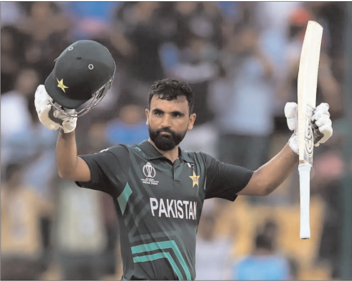
BENGALURU: Fakhar Zaman celebrates after scoring a century (100 runs) during the 2023 ICC Men's Cricket World Cup one-day international match.

AHMEDABAD (Agencies): England's World Cup defence is over after old rivals Australia added the final nail with a 33-run victory in Ahmedabad. England were already all-but out but a fifth miserable defeat in succession and sixth in total ended any hope of a freak turnaround. They did well to bowl out Australia for 286 and showed some fight with the bat but were still dismissed for 253. Jonny Bairstow was caught down the leg side off the first ball of the chase and Joe Root followed for 13, leaving Ben Stokes to play a lone hand as he threatened another special knock. But, just as he began to move through the gears, Australia's greatest tormentor in recent years was tamely caught off leg-spinner Adam Zampa for 64 from 90 balls. Chris Woakes threatened the unlikely late on but his 32 only delayed the inevitable as England were dismissed in the penultimate over. Defeat leaves England bottom of the table with two matches still to play - first against the Netherlands on Wednesday before their tournament concludes against Pakistan on Saturday. Their attention now turns to attempting to avoid the embarrassment of failing to qualify for the 2025 Champions Trophy by finishing outside of the top eight in India. Meanwhile Australia are on the brink of securing their semi-final place and move on buoyed having ended the reign of their