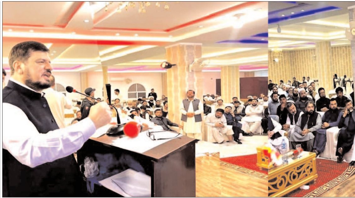
PESHAWAR: Governor Khyber Pakhtunkhwa Haji Ghulam Ali addressing a function organized by Sarhad Chamber of Commerce and Industry.

He said this situation would surely result in political unrest in the Muslim countries, particularly the Arab nations. He said it demands that the people of the Muslim world should think about making their own block on the pattern of the European Union (EU). He said a strong political and military alliance of all Muslim countries is a must to safeguard their interests, saving their people from aggressions and genocide and getting resolved the issues like Kashmir and Palestine. He said that the social media in the Muslim countries could play a huge role in this regard to promote unity in the Ummah.