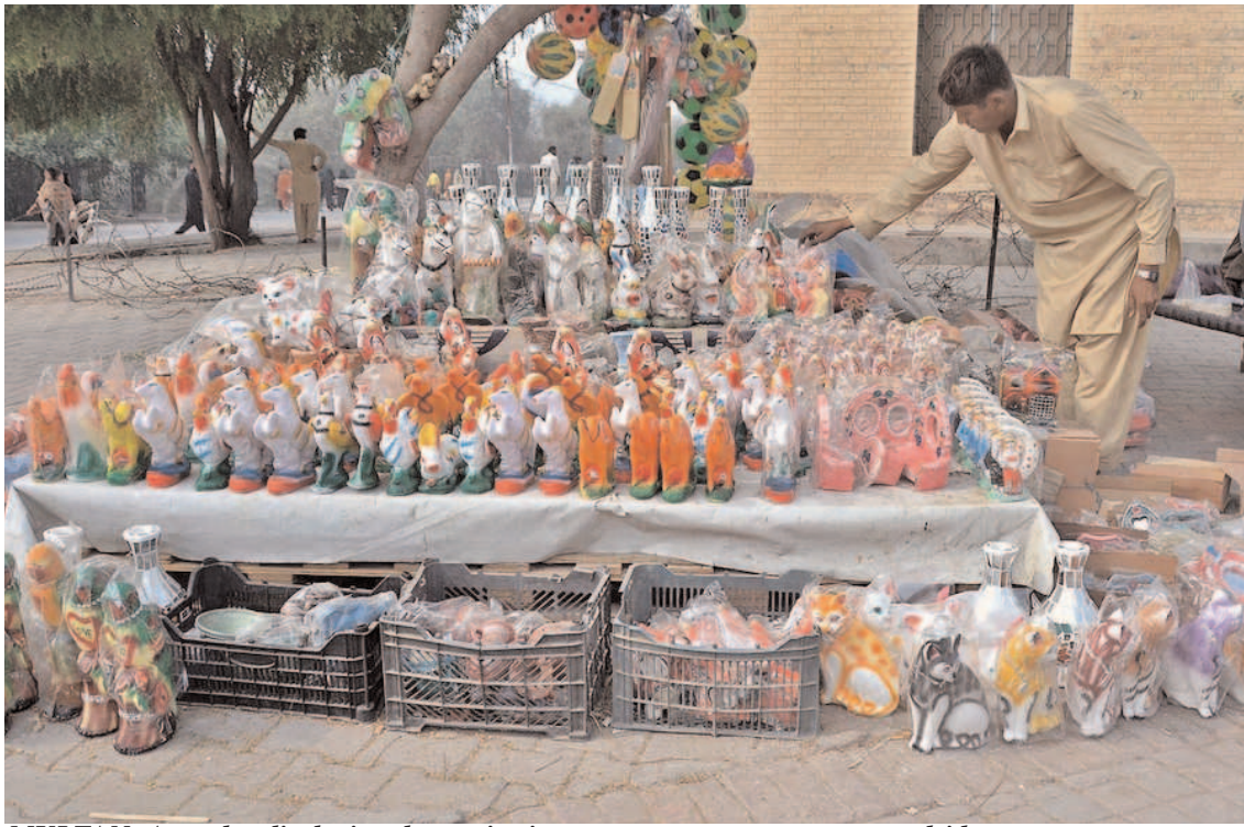
MULTAN: A vendor displaying decorative items to attract customers at roadside setup.

fair is expanded by 50,000 square meters and the number of exhibition booths also increased. More than 28,000 exhibitors participated in the event, with 650 enterprises coming from 43 foreign countries and regions. Famous Pakistani textile brands including Gohar Textile Mills Pvt Ltd. and M.K. Sons (Pvt.) Ltd., and so on are here to fortify ties with business partners and tap into the Chinese market. Launched in 1957 and held twice yearly, the fair is considered a major gauge of China's foreign trade.