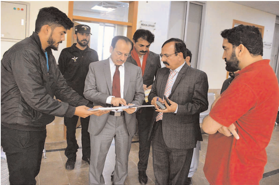
ISLAMABAD: Caretaker Federal Health Minister Dr. Nadeem Jan visiting Community Health Centre G/13.

ISLAMABAD (APP): Allama Iqbal Open University (AIOU) is conducting final examinations of 2.5 and 3.5 years MBA programs offered in the spring 2023 semester from November 18. These examinations will take place throughout the country till December 7, 2023, said a press release yesterday. The date sheet is available on the university website (www.aiou.edu.pk). Roll number slips have been uploaded to students' CMS portal. Additionally, the deadline for fresh students to enroll in the Associate Degree in Arts (BA General), Associate Degree in Commerce (BCom), Associate Degree in Education, BS (ODL) programs, 1.5, 2.5, 4-year B.Ed programs, BBA, and Post Graduate Diploma programs is tomorrow (Tuesday, November 7).