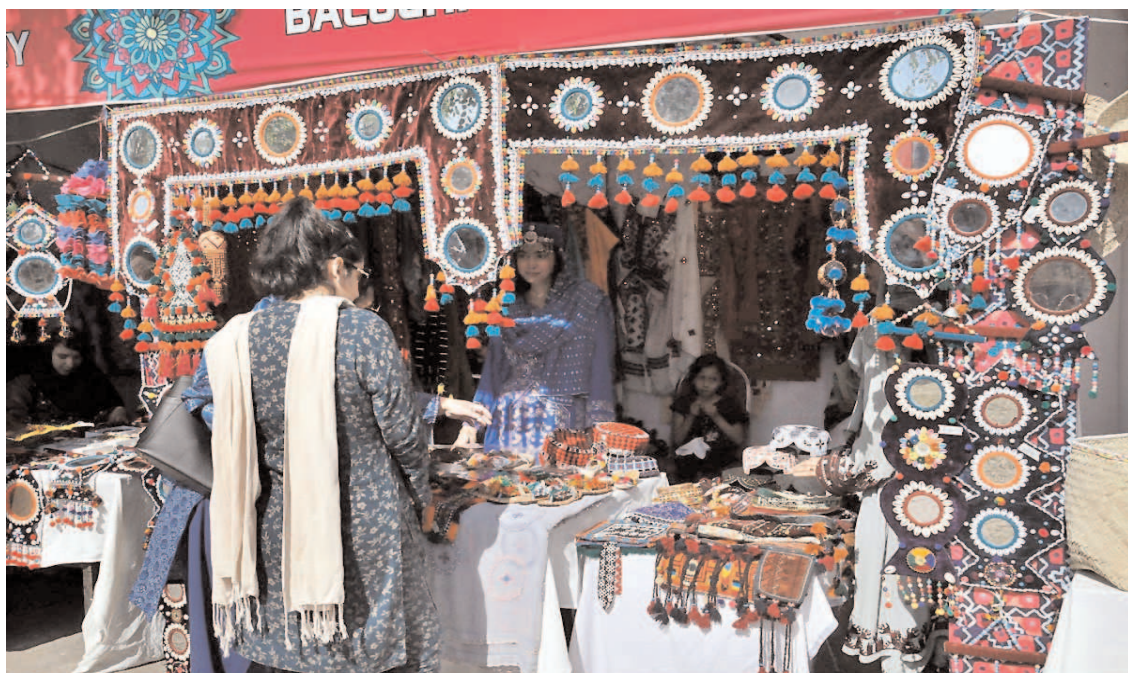
ISLAMABAD: People purchasing traditional items from stalls setup during Ten-Days 'Folk Festival Lok Mela' at Lok Virsa.

Although the government has initiated multiple measures to promote better hygiene at educational institutions, still there are challenges like inadequate attention to hygiene concepts in the curricula, an un-conducive environment and a communication gap between teachers and parents. Therefore, the authorities must adopt a holistic approach by involving all stakeholders to promote hygiene, revise the curriculum and raise awareness among teachers, parents and students.