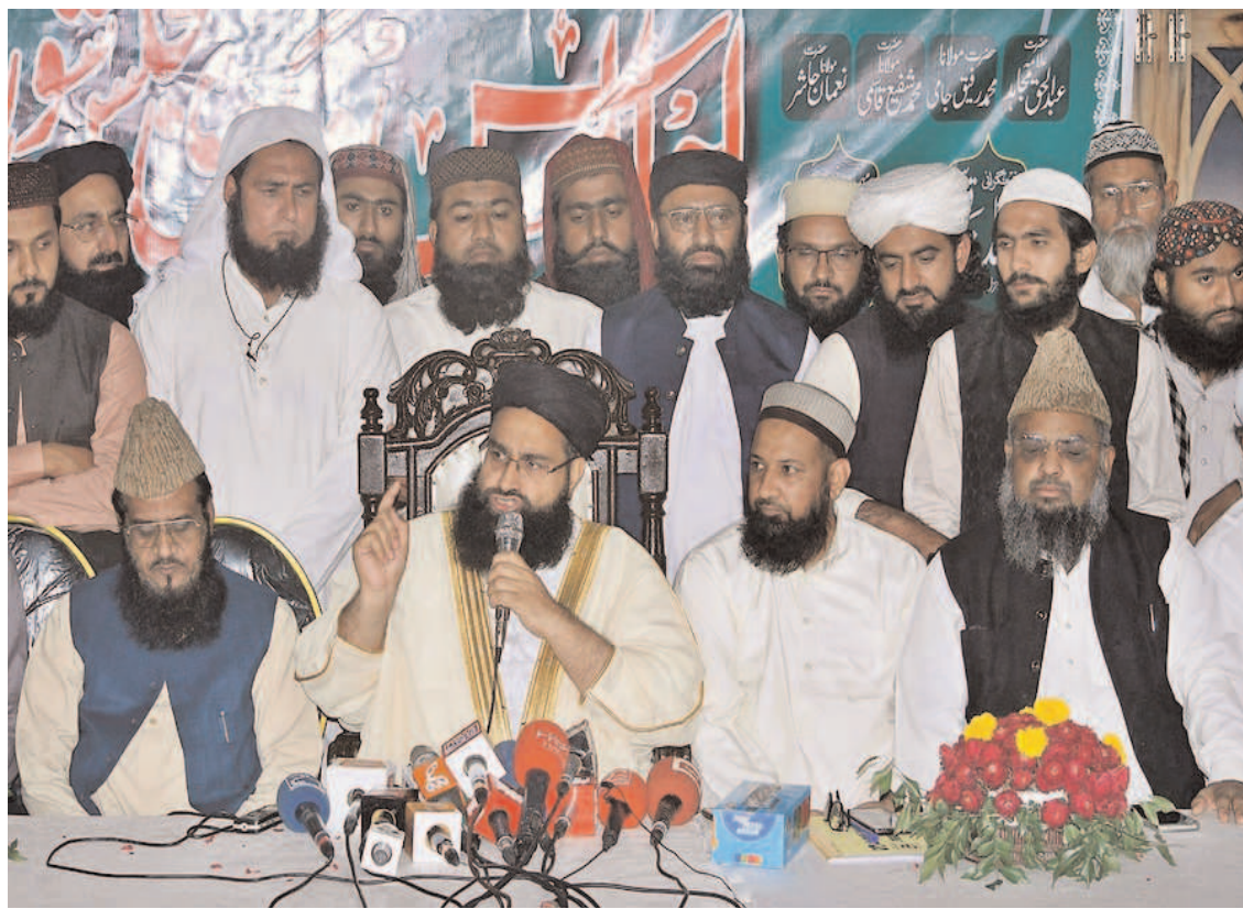
MULTAN: Chairman Pakistan Ulema Council Maulana Tahir Ashrafi addressing Solidarity Palestine Conference at Masjid Shohda Al Khair.

He also demanded that the chief justice of Pakistan improve the system of justice. Ashrafi also suggested filing a review petition with the Supreme Court regarding military courts.