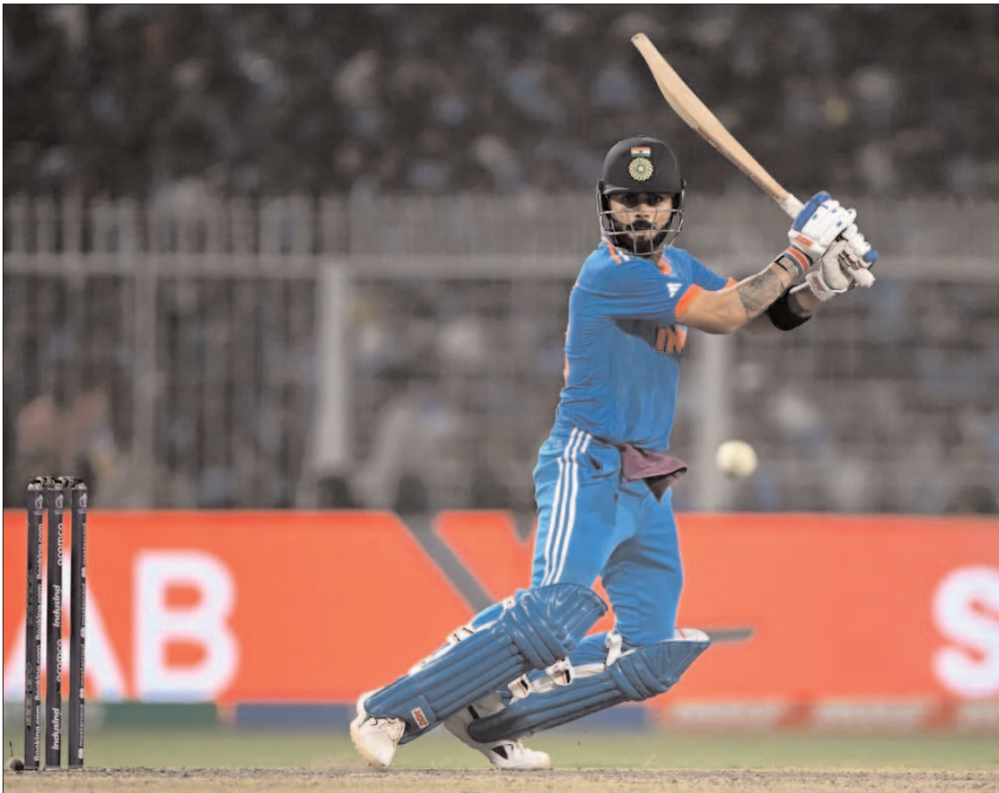
KOLKATA: Virat Kohli continued his excellent form.