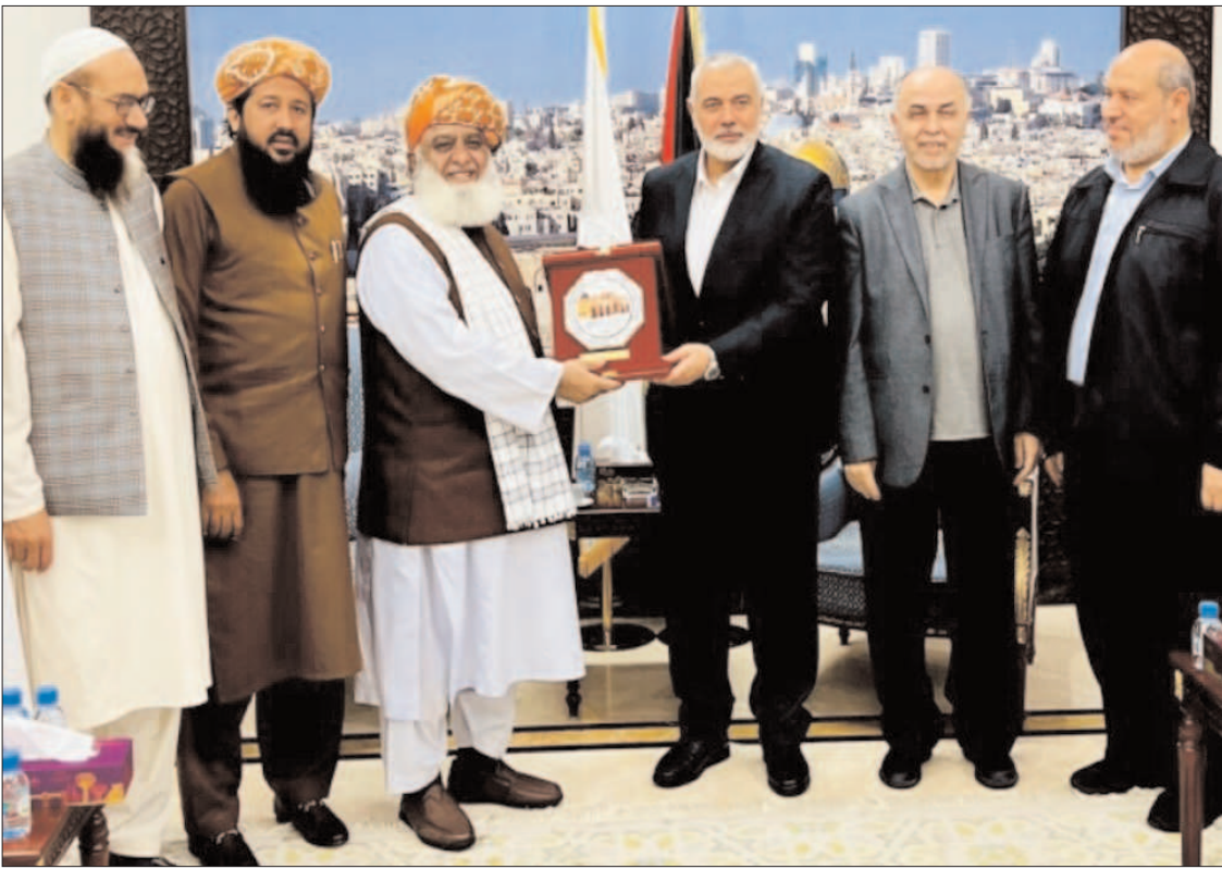
DOHA: JUI-F chief Maulana Fazlur Rehman meets Hamas leaders in Qatar.

MOSCOW (Reuters): Russia's new strategic nuclear submarine, the Imperator Alexander III, has successfully tested a Bulava intercontinental ballistic missile, the Russian defence ministry said on Sunday. The missile, which the Federation of American Scientists says is designed to carry up to six nuclear warheads, was launched from an underwater position in the White Sea off Russia's northern coast and hit a target thousands of kilometres away on the Kamchatka peninsula in the Russian Far East, the defence ministry said. "Firing a ballistic missile is the final element of state tests, after which a decision will be made to accept the cruiser into the Navy," a ministry statement said. The Imperator Alexander III is the seventh of the Russian Project 955 Borei (Arctic Wind) class nuclear submarines and the fourth of the modernised Borei-A variant, according to Russian sources. They are known in NATO as the Dolgoruky class of submarines, after the first boat - the Yuri Dolgoruky - became the first new generation of nuclear submarine launched by Russia since the Cold War. The Borei class submarine is armed with 16 Bulava missiles. The 12-metre (40-foot) missile has a range of about 8,000 km (5,000 miles). Since rising to power in 1999, President Vladimir Putin has increased military spending and sought to rebuild Russia's nuclear and conventional forces after the chaos that accompanied the 1991 fall of the Soviet Union.