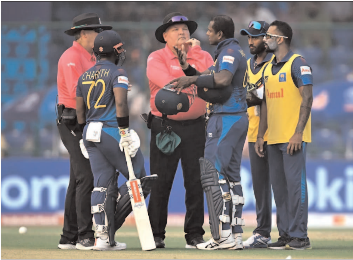
NEW DELHI: Angelo Mathews (3R) speaks with the umpires after he was timed out during the 2023 ICC Men's Cricket World Cup one-day int'l (ODI) match between Bangladesh and Sri Lanka.

LONDON (AFP): Marcus Rashford has pleaded for an end to "malicious" gossip about his future at Manchester United after he missed the weekend win at Fulham due to an injury. The England forward was forced to apologise to United boss Erik ten Hag after attending a nightclub party following the embarrassing 3-0 derby defeat to Manchester City on October 29. Ten Hag said Rashford's behaviour was unacceptable but added that the underperforming 26-year-old was "very motivated to put things right". Rashford was missing at Craven Cottage due to injury after taking a "heavy knock" in training.