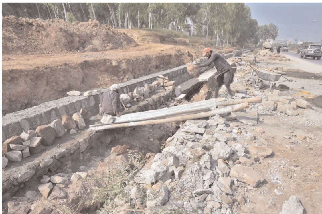
ISLAMABAD: Workers busy in construction work near Tramri Chowk in the Federal Capital.

The rationale of celebrating a World Science Day for Peace and Development has its roots in the importance of the role of science and scientists for sustainable societies and in the need to inform and involve citizens in science. In this sense, a World Science Day for Peace and Development offers an opportunity to show the general public the relevance of science in their lives and to engage them in discussions. Such a venture also brings a unique perspective to the global search for peace and development.