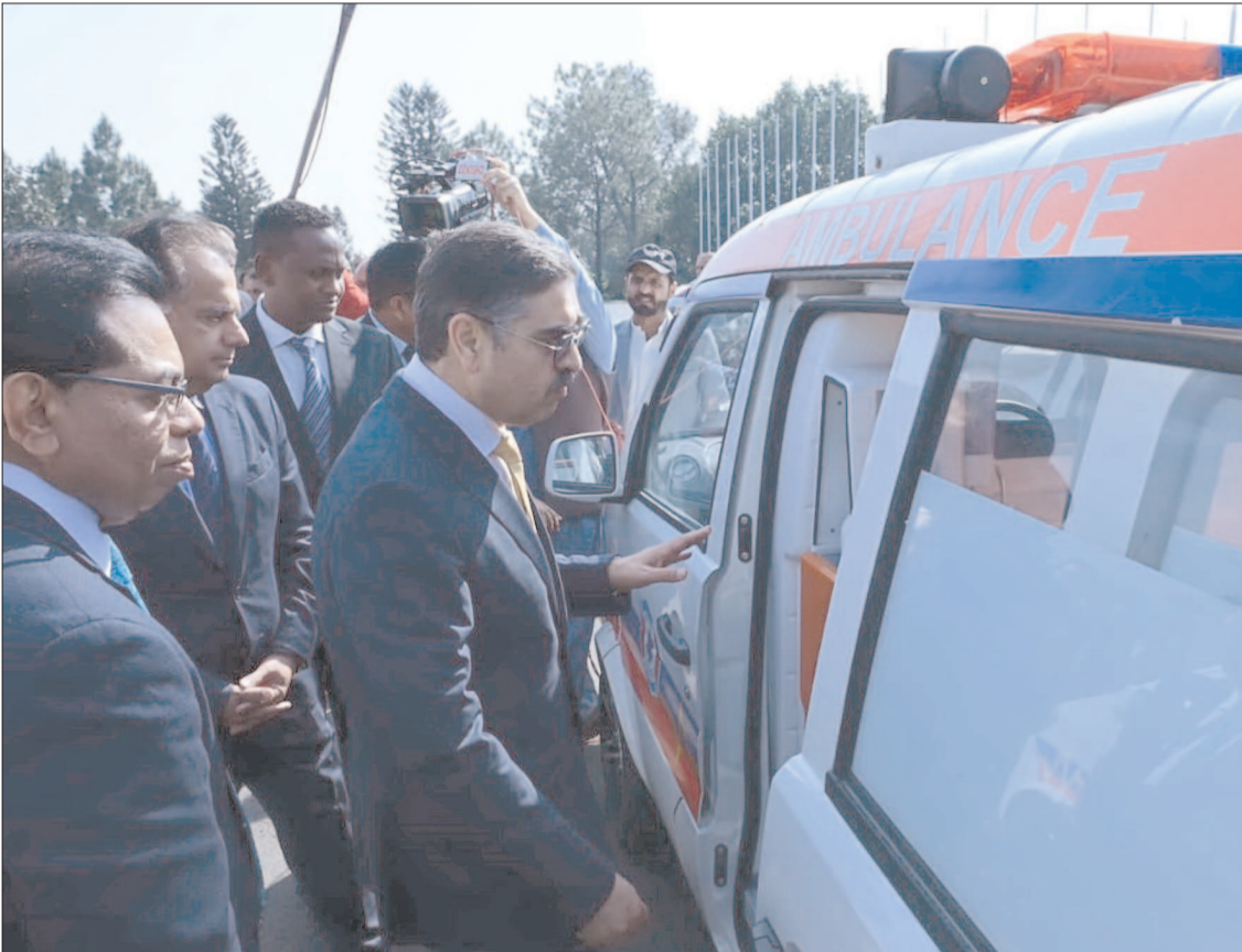
ISLAMABAD: Caretaker Prime Minister Anwar-ul-Haq Kakar examining the health facilities provided by WHO to the Government of Pakistan.