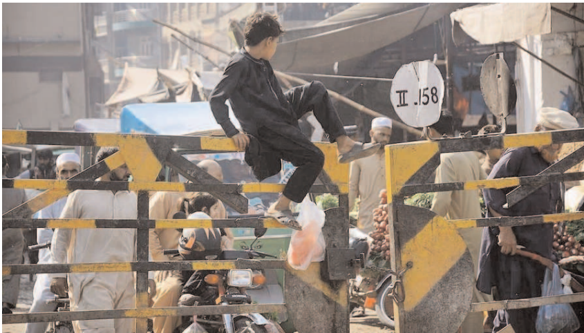
PESHAWAR: A boy wrongly crossing closed railway track gate needs attention of concerned authorities at Sabzi Mandi.

PESHAWAR (APP): PESCO on Monday notified that due to maintenance work power supply will remain suspended from Peshawar Cantt Grid Station on 7th and 9th November from 8 a.m. to 2 p.m. Consequently, it said consumers of Tehkal, Islamia College, KTH, Commercial, Jahangirabad, University Town, NCB, Airport, PAF Base, Saddar Road, Mall Road, MES 1,2, Old MCS, Babo Ghari, Marble Industry, CAA, Palosi 1, Behri Colony, Tehkal Payan, Bank of Khyber, Scarp 1 feeders will face inconvenience. This power supply will also remain suspended from Pesco Colony Grid Station on 7th and 9th November from 8 a.m. to 2 p.m. resultantly consumers of ICF, Darmangai, Warsak Road, Shagai, KSM feeders will face inconvenience. The power supply will remain suspended from Shahi Bagh Grid Station on 7th and 11th November from 8 a.m. to 2 p.m. resultantly consumers of Shahgai Naguman, KSM, Industrial Naguman, Bak-hsho Pull, Ghari Hamza, Old Naguman, Shah Alam, Latif Abad, Dalazak, Sarbuland Pura, Samarbagh, New Takht Abad and Khazana feeders.