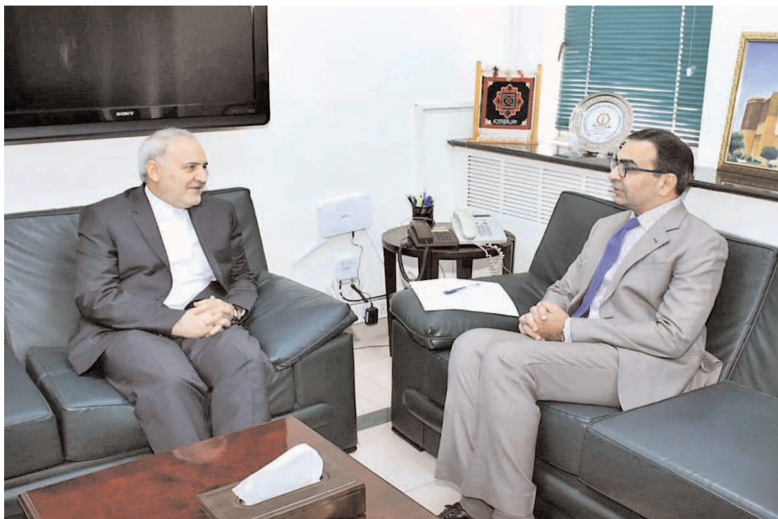
ISLAMABAD: Ambassador of the Islamic Republic of Iran to Pakistan H.E. Dr. Reza Amiri Moghaddam called on Caretaker Federal Minister for Power and Petroleum Muhammad Ali.

ISLAMABAD (APP): Pakistan Meteorological Department (PMD) has forecast rain-wind/thunderstorm with snowfall over mountains in upper parts of the country from November 08-09 which would decrease day temperatures from two to three celsius grade. A shallow westerly wave, affecting western parts of the country, is likely to grip upper parts on November 08 (evening/night) and persist in northern areas till November 10 after noon. Under the influence of this weather system, light to moderate rain-wind/thunderstorm is also expected in Quetta, Kharan, Hamai, Chaman, Ziarat, Qilla Abdullah, Qillah Saif Ullah, Loralai, Pishin, Zhob, Musa Khel, Sibbi, Mastung, Kalat, Noshki and Chaghi on November 06 (evening/night) and November 07. Light rain-thunderstorm is expected in Dera Ismail Khan, Dera Ghazi Khan, Layyah, Bhakkar, Sargodha, Mianwali, Khushab, Islamabad and Pothohar region on November 07 (evening/night). Light to moderate rain-wind/thunderstorm with hailstorm is also expected at isolated places of Chitral, Dir, Swat, Shangla, Buner, Kohistan, Mansehra, Abbottabad, Haripur, Swabi, Mardan, Nowshera, Peshawar, Kohat, Kurram, Bannu, Lakki Marwat, Waziristan, Bhakkar, Mianwali.