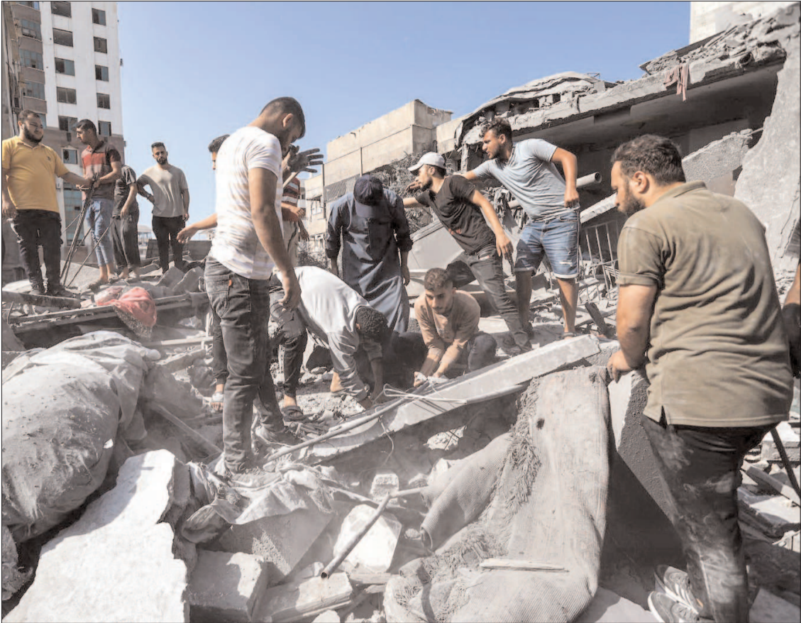
GAZA: Palestinians searching valuable items in their destroyed homes after Israeli airstrikes.