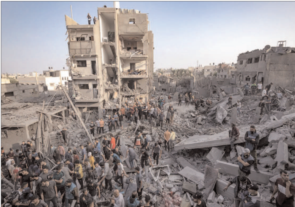
GAZA STRIP: Palestinians looking for survivors of the Israeli bombardment in the al-Maghazi refugee camp.