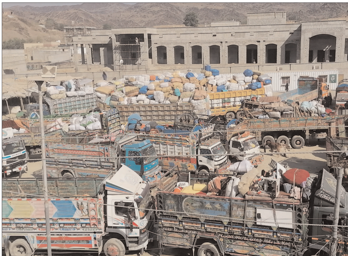
LANDI KOTAL: Trucks loaded with households of repatriated Afghan families parked in parking lot to cross border to Afghanistan.