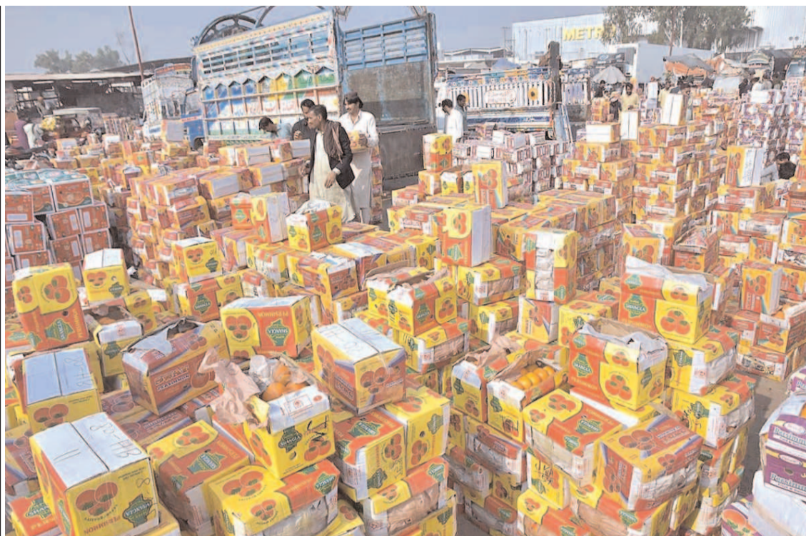
ISLAMABAD: Vendors busy bidding of persimmon fruit boxes on whole sale rate at fruit and vegetable market.

He said that Pakistan considers Romania an important country not only in the context of the EU but also in view of Romania's historical role as a supporter of multilateralism.