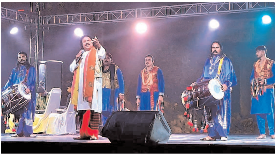
LAHORE: Artist are performing during Lahore Lahore hai Festival on stage during Musical program organized Wall City at Royal Fort on Monday late night.

Meanwhile, the representatives of various software houses and IT companies also expressed their views and informed the students about the market's trends and requirements of their respective companies and organizations. They also highlighted the importance of entrepreneurship in the country.