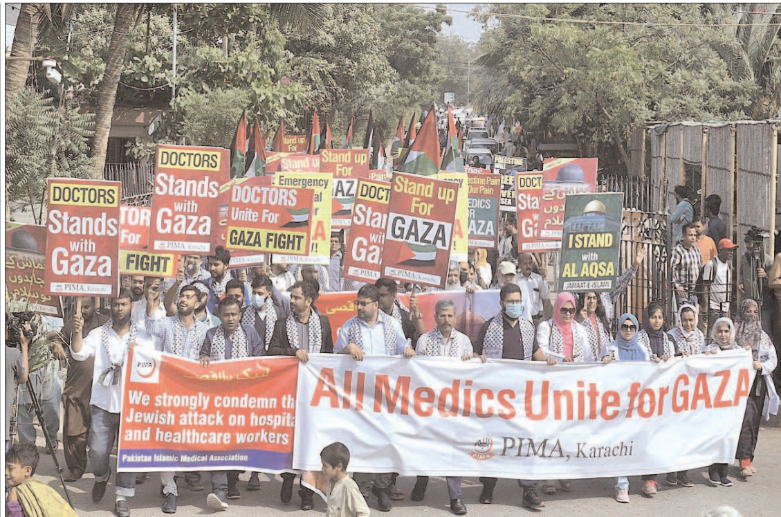
KARACHI: Doctors and paramedics hold placards during a pro-Palestinian rally organized by Pakistan Islamic Medical Association PIMA at Jinnah hospital.

The step taken by the Vice Chancellor for solarization of the whole campus (840 Kilowatts of electricity generation) from university own finances has impacted the financial resources utilization for payment of electricity bills of the campus