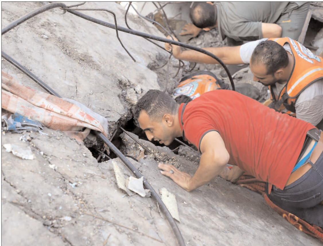
GAZA STRIP: People searching their loved ones under the damaged building after Israeli airstrikes in Khan Younus.

She said Pakistan took pride as one of the staunchest supporters of women rights and women leadership." At the OIC, Pakistan had spearheaded various initiatives for women's rights and convened ministerial conference on women in Islam as the chair of the 48th CFM in New York, she added.