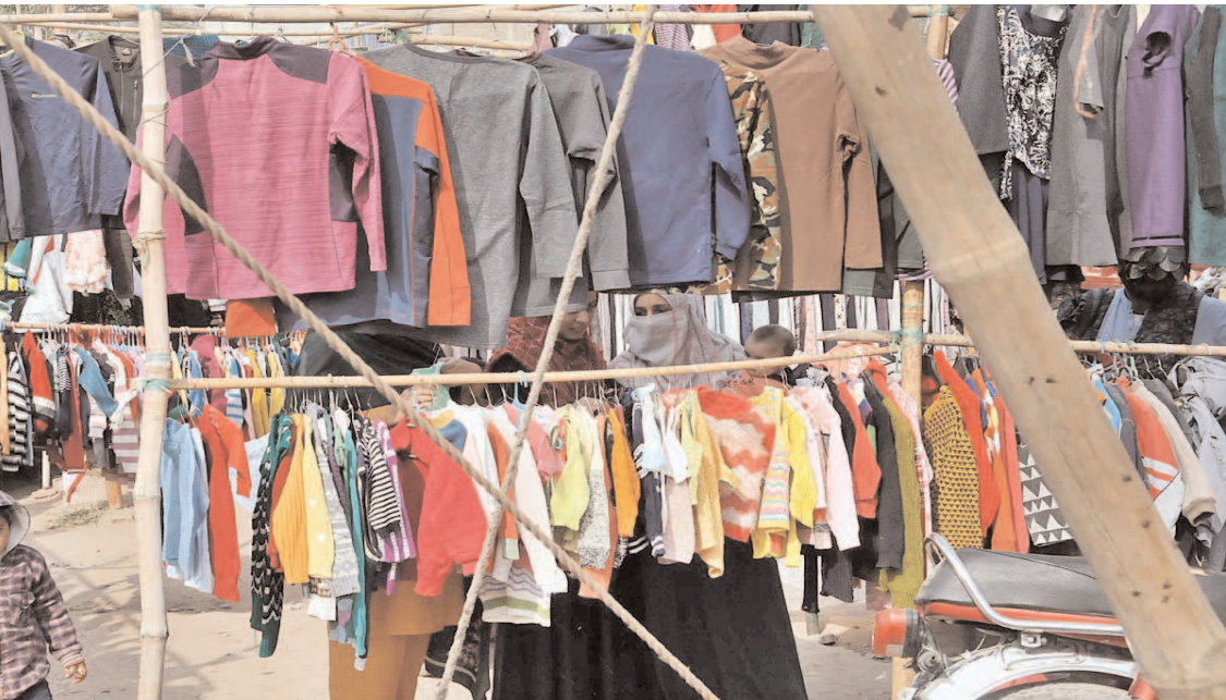
ISLAMABAD: Women busy in selecting and purchasing second hand warm clothes from vendor at Shakraiyal.