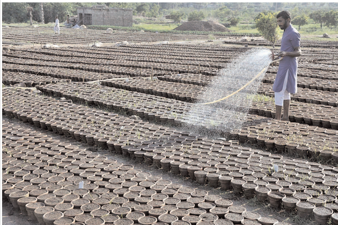
ISLAMABAD: A worker showering water on plants to keep them fresh at a local plant nursery.

With 75 modules for students in grades 6 to 12, participants took part in a diverse range of fun learning activities during the preliminary round. The overall ten categories covering different domains were designed to include students with different interests and skills, the official said. The World Space Week celebrations offers a learning opportunity, especially for space enthusiasts who want to pursue a career in space technology. About the categories and modules, the official informed that World Space Week 2023 organized 75 modules in 10 major categories for students in Grades 6 to 12, including Space Recitations, Space Quiz, Space Creative Writing, Space Applications, Space Technology Demonstration, Space Models and Collectibles, Space Fine Arts, Space Performing Arts, Space Life, and Space Entrepreneurship.