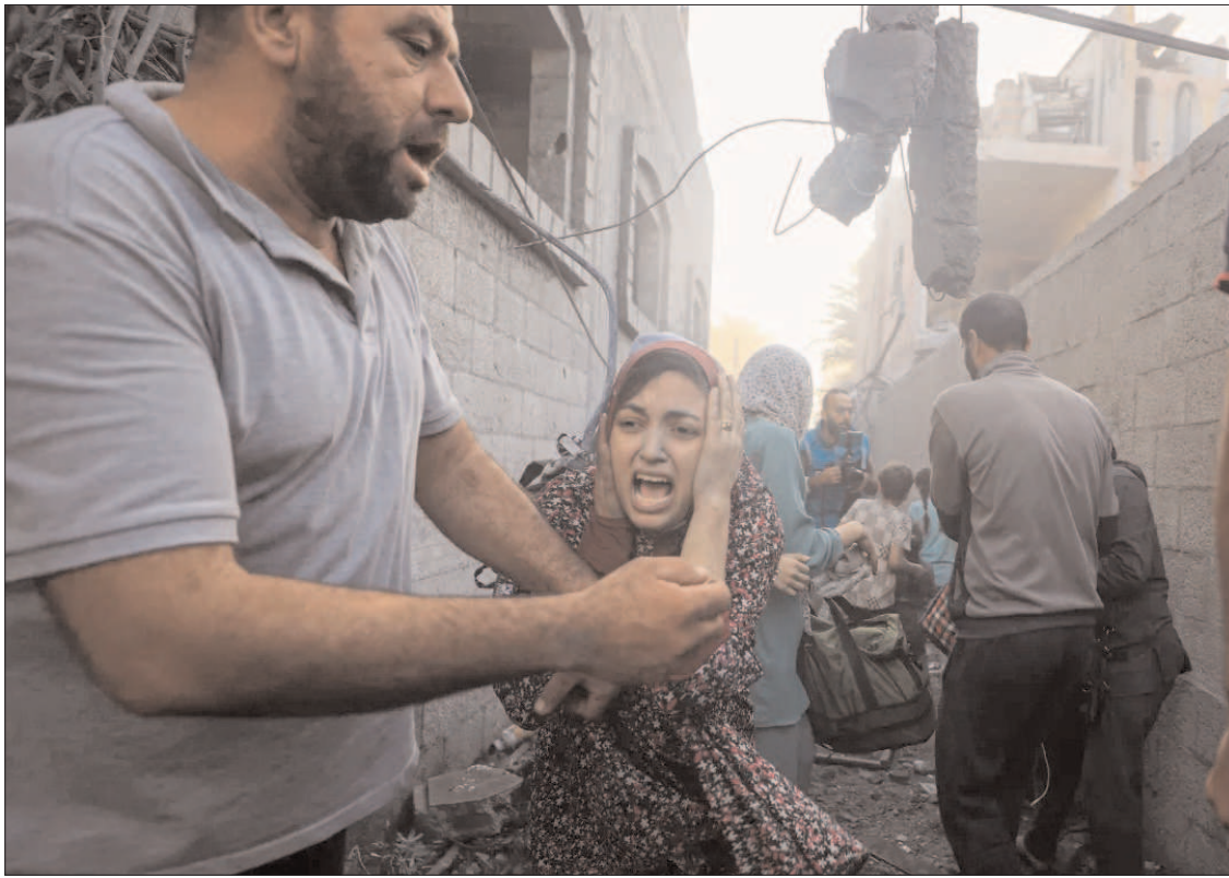
GAZA STRIP: People flee following Israeli air strikes on a neighbourhood in the al-Maghazi refugee camp.