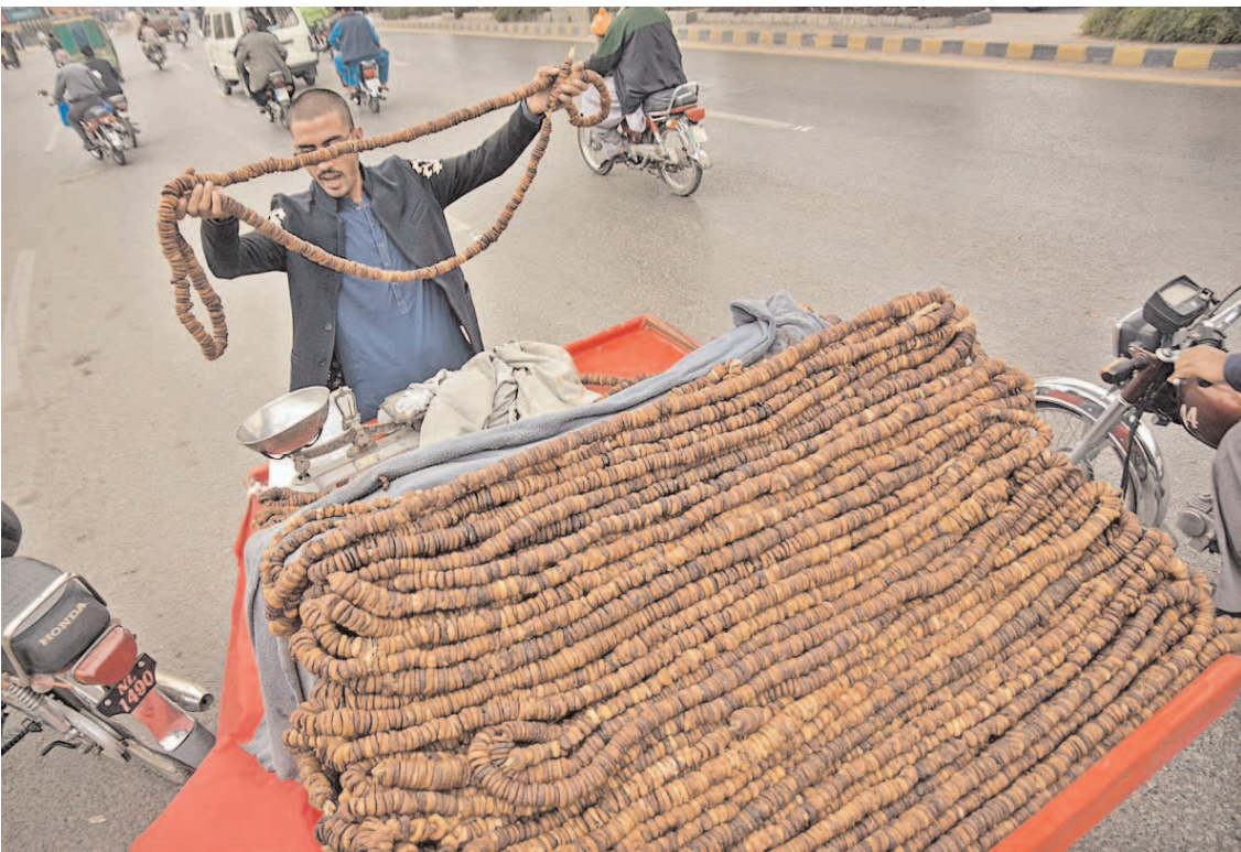
RAWALPINDI: A vendor displaying fig (anjeer) on his handcart to attract the customers at Murree Road.