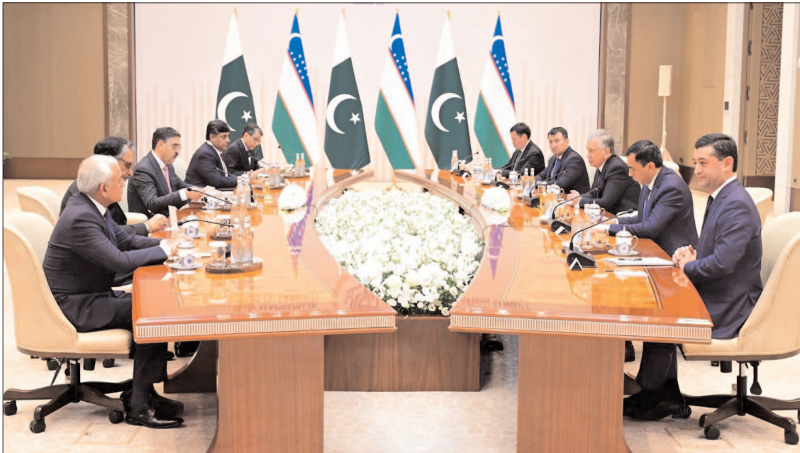
TASHKENT: Caretaker Prime Minister Anwaar-ul-Haq Kakar meeting with President of Uzbekistan, Shavkat Mirziyoyev on the sidelines of 16th ECO Summit.