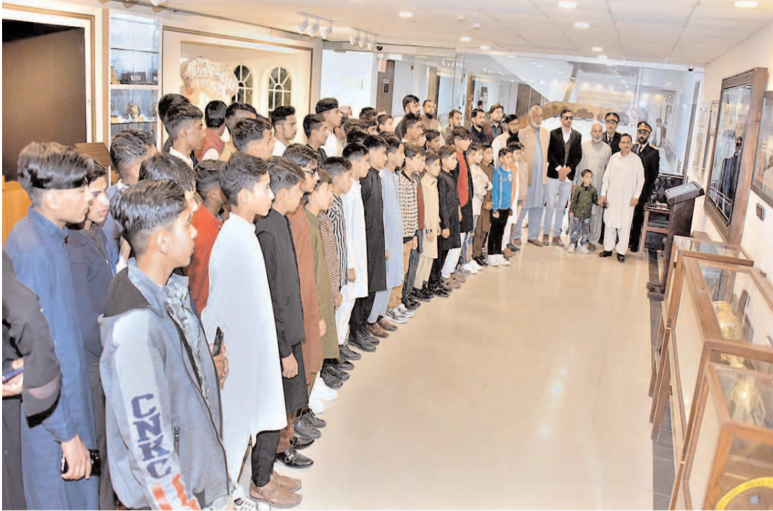
ISLAMABAD: A group of students and faculty members of Government boys school Bhunat Islam Nagar, Bagh Azad Kashmir visiting senate museum at Parliament House.