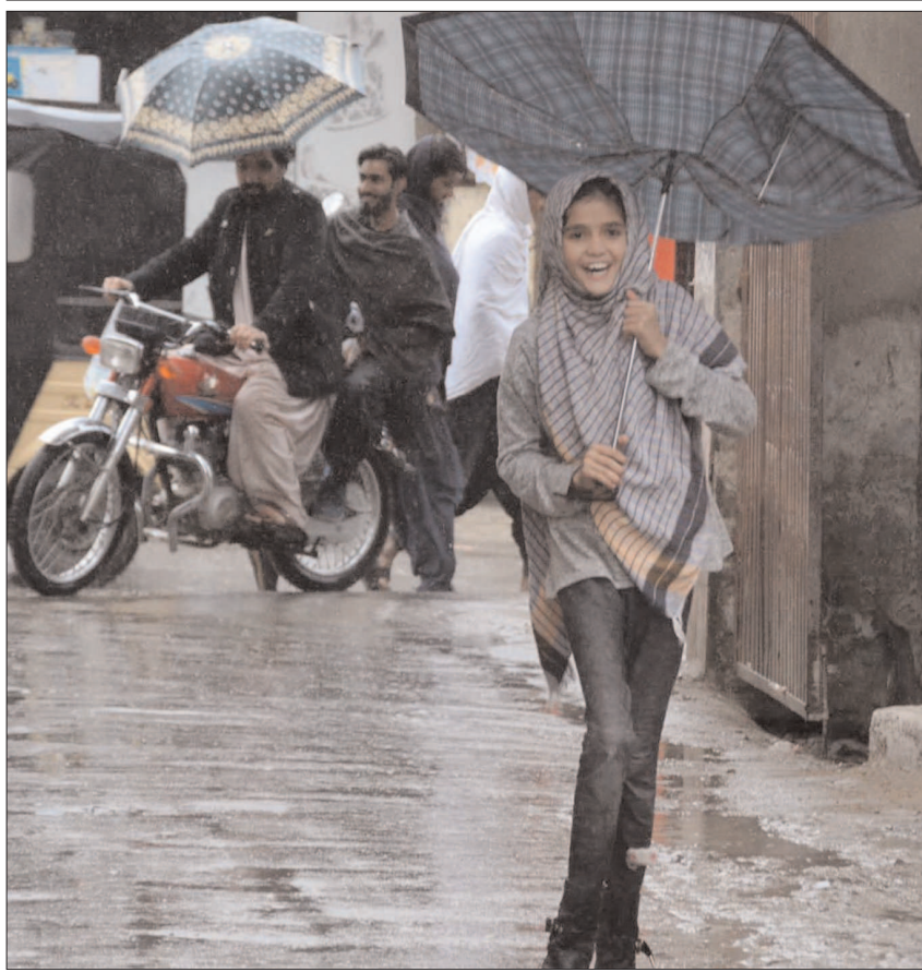
QUETTA: A view of rain in the provincial capital.

Afghanistan," he added. He went on that they would be taken to the Holding Center, Landi Kotal where from they would be deported via Torkham crossing after necessary documentation. According to available sources for the last One month (01 October to 07 November) 0.189259 million illegal Afghan families went back to their country, Afghanistan through the Torkham border.