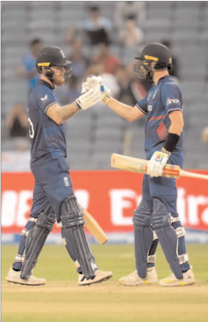
PUNE: Ben Stokes and Chris Woakes put on 129 runs for the seventh wicket, England vs Netherlands Mens ODI World Cup.