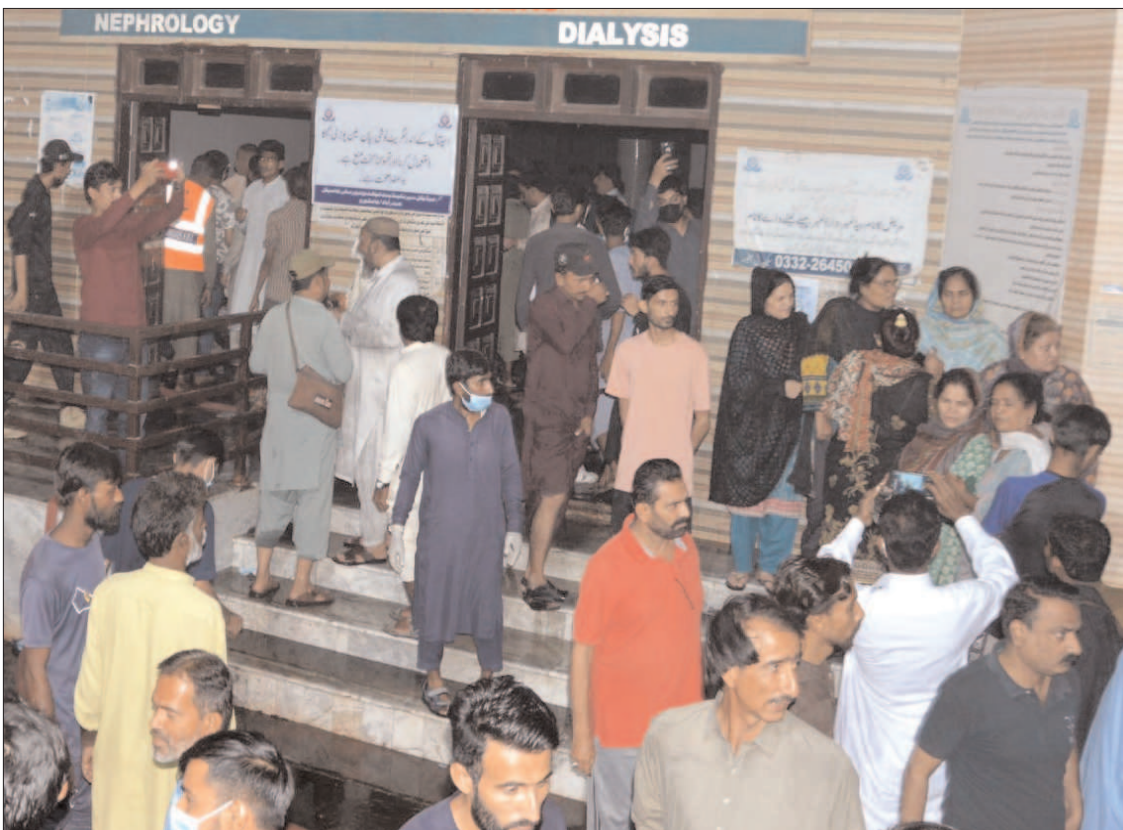
HYDERABAD: Patients and relatives standing outside hospital after fire caught in store room of kidney ward at Civil Hospital.

MURIDKE (INP): As many as six people were critically injured in separate road mishaps in different localities, rescue sources said on Wednesday. The first accident took place in Mannoo Abad of Muridke where a reckless driven truck knocked down two motorcycles seriously injuring both bike riders. Four people were critically injured when an over speeding car hit a motorcycle at Narowal road.