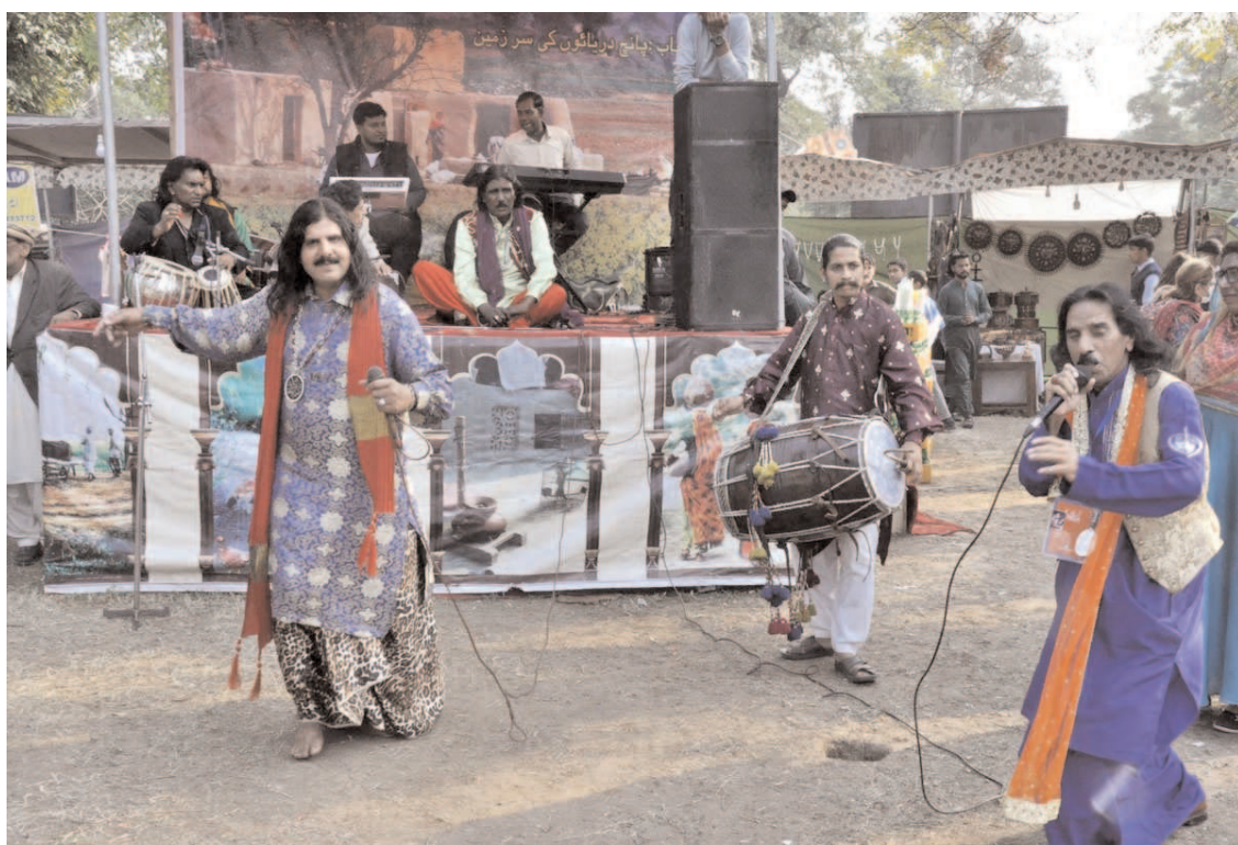
ISLAMABAD: Artists performing traditional dance during "Folk Festival Lok Mela" at Lok Virsa.

"Raat Ke Rahi" (1960), "Saheli", "Gulfam", "Qaidi", "Anchal", "Baji", "Shikwa", "Ik Tera Sahara" and "Naela" (1965) were some big films in which he played vital roles. Critics applauded his lead role performance back in Pakistan's film "Saheli" (1960) in which he starred alongside Nayyar Sultana and Shamim Ara.