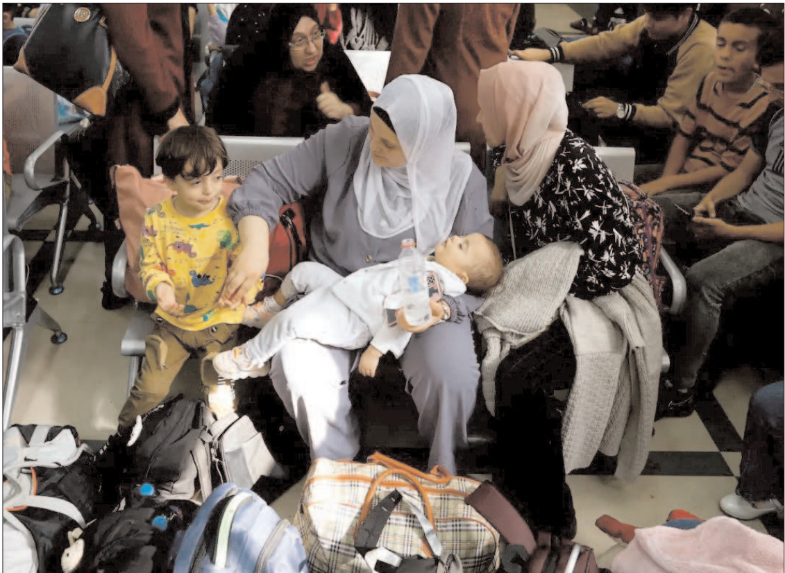
GAZA: Palestinians with foreign passports waiting for permission to leave Gaza at the Rafah border crossing with Egypt.