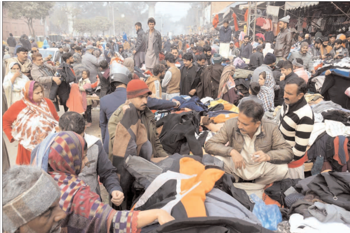
LAHORE: People selecting and purchasing used warm clothes at Empress Road as demand increase during winter season in the Provincial Capital.

The establishment of specialized investigation units greatly assisted in effectively investigating serious crimes. Courts made rulings on 35 murder cases in 2023, sentencing offenders to death in 20 cases and life imprisonment in 15 cases. This number of judgments in such serious cases was unprecedented before. Around 24,326 cases were registered in police stations across Islamabad in 2023, with the investigation department completing investigations on 20,148 cases, while 4,178 cases are still under proceedings. Transparency in case investigations, maintaining merit, ensuring justice for criminals, and delivering justice to citizens are the primary goals of all these measures.