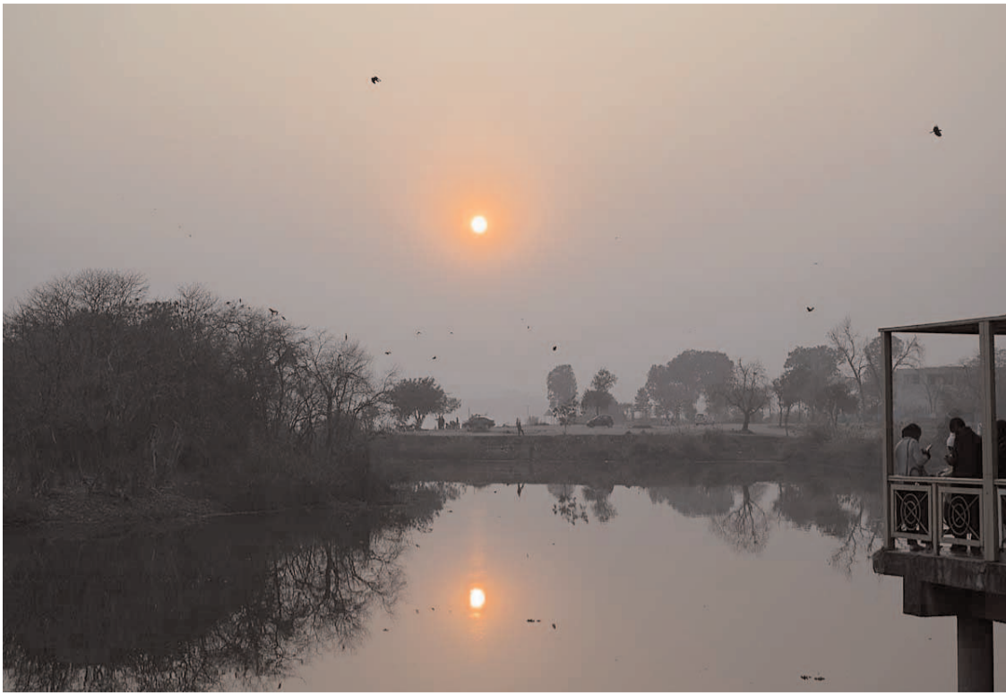
ISLAMABAD: A beautiful view of the last sunset of the year 2023.

ISLAMABAD (APP): Islamabad Capital Police (Traffic Unit) achieved remarkable milestones during the year 2023 which were particularly aimed to facilitate the public and ensure a safe road environment in the city. These achievements include the establishment of a new Traffic Headquarter at Faizabad, women driving centre, an increase in penalties for traffic law violations, implementation of an internationally recognized driving license in two languages, integration of the E-Challan system with criminal record as well as notification to concerned individuals before the expiration of new driving licenses. During the year 2023, the Islamabad Capital Police Traffic Unit took action against 8,86,698 vehicles and motorcycles for traffic violations while legal actions were also taken against 1,151 individuals for severe traffic violations.