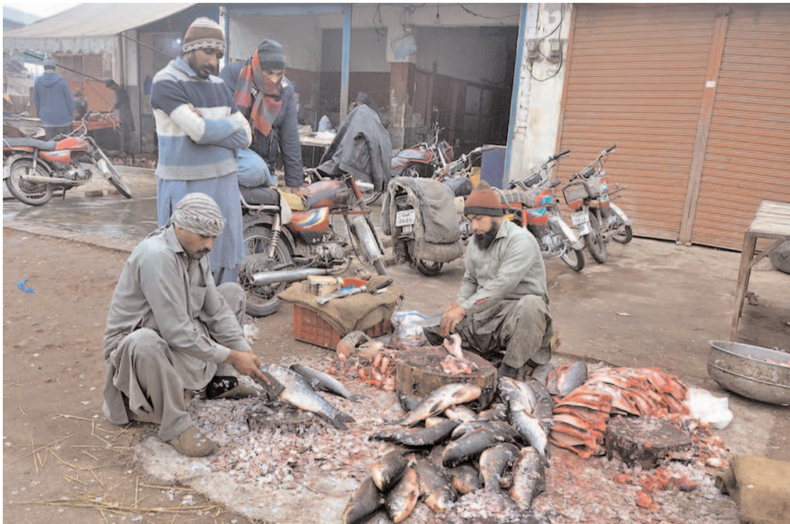
MULTAN: A fish seller cleaning fish to attract customers at their setup in wholesale fish market.

The PFC chief hoped that government would take necessary measures to coordinate with relevant authorities and stakeholders to implement this prioritization effectively. He was of the view that government attention to this matter will undoubtedly contribute to the economic prosperity and well-being of the people.