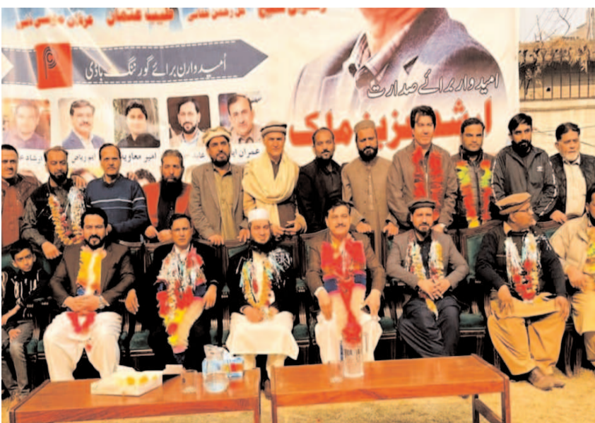
PESHAWAR: Mayor Haji Zubair Ali with newly elected cabinet of Peshawar Press Club.

In case of default, the Court further directed to recover it under this Act as land revenue under the West Pakistan Land Revenue Act 1967 and pay the same to the complainant.