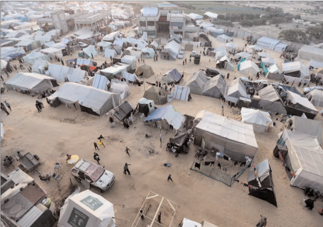
GAZA: Displaced Palestinians, who fled their homes due to Israeli strikes, shelter in a tent camp, amid the ongoing conflict between Israel and the Palestinian Islamist group Hamas, on the eve of the new year of 2024, in Rafah.