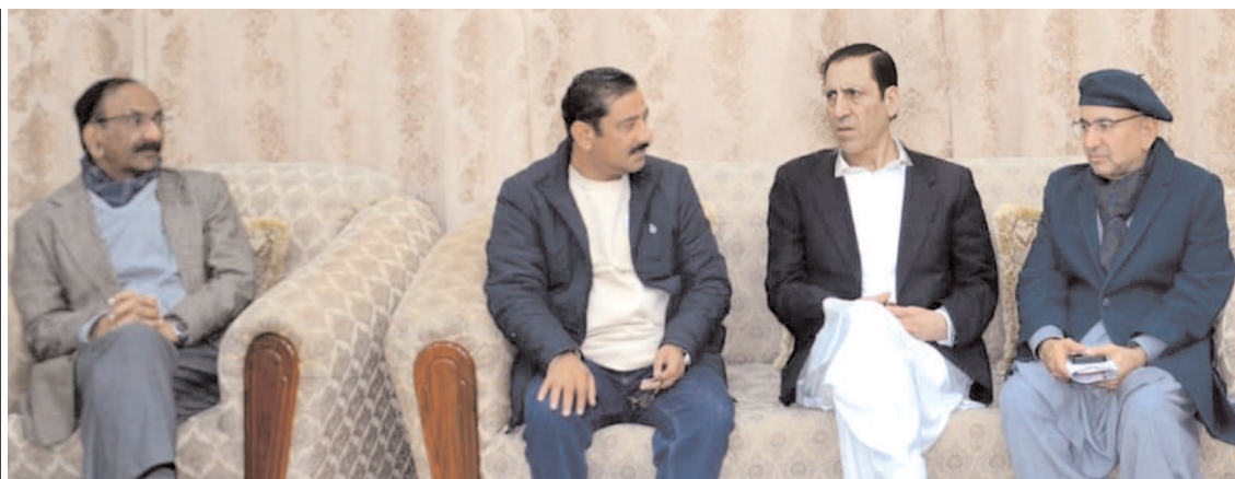
ABBOTTABAD: A delegation of Abbottabad Press Club and Union of Journalists meeting with Caretaker Chief Minister Khyber Pakhtunkhwa Justice (R) Syed Arshad Hussain Shah.

The sun was seen for a while and the whole day passed with fog/smog.