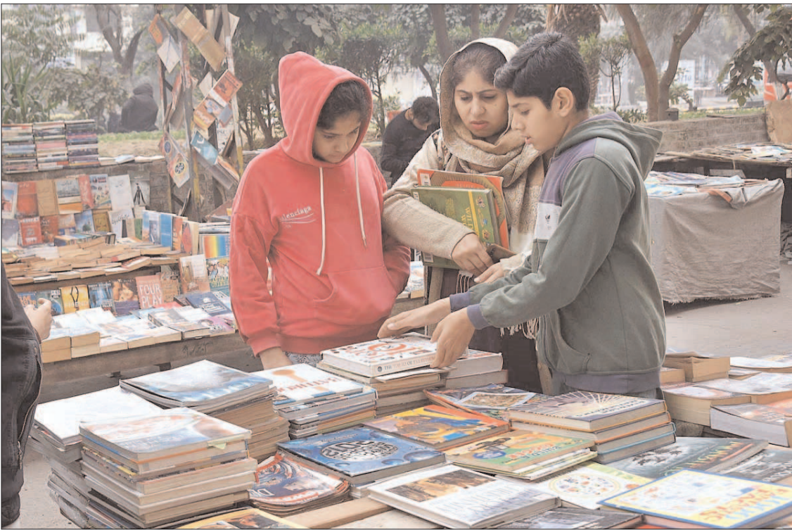
LAHORE: People busy in selecting and purchasing old books in the Provincial Capital.

On this occasion, he showed the historical records and documents regarding Karachi and said that in what era the land registry system was introduced, this city has everything, when the first birth certificate in Karachi was issued. The details of this are also available, we have also taken out the register of death certificates and the statues inside the Frere Garden were also installed in someone's house.