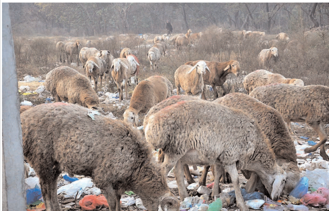
ISLAMABAD: A shepherd guarding herd of sheep at greenbelt along Islamabad Expressway at Khanna Pul.

A consultant had also been hired for the parking plaza in Murree who would be visiting the site soon, he added. Traffic Police Murree had acquired the frequency of FM 88.6, the DC Murree said adding, a special website would also be activated soon for the convenience and awareness of the tourists.